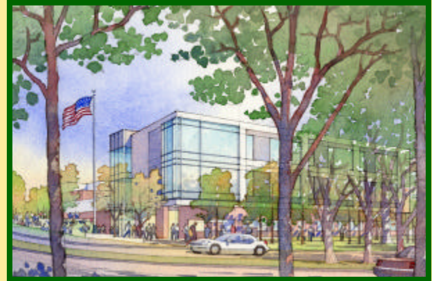
Yorktown High School—Artist Rendering