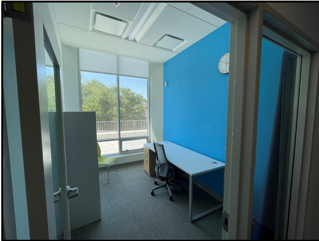
View of Individual Office in Front Office