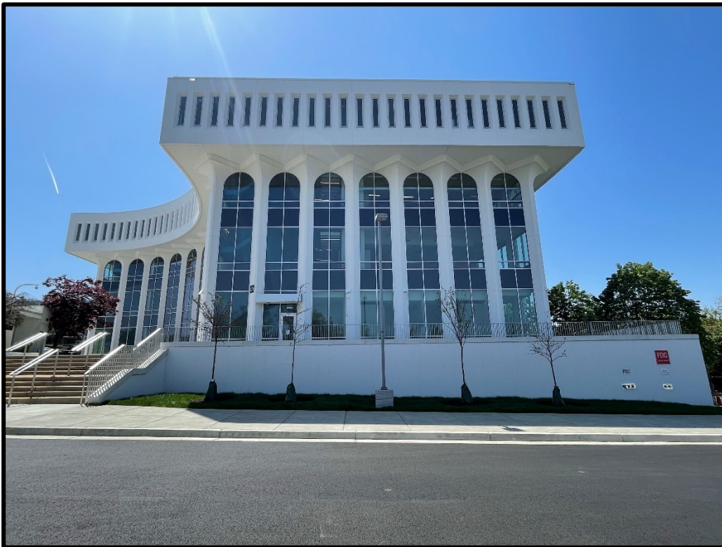
View of Exterior on East Side of Building