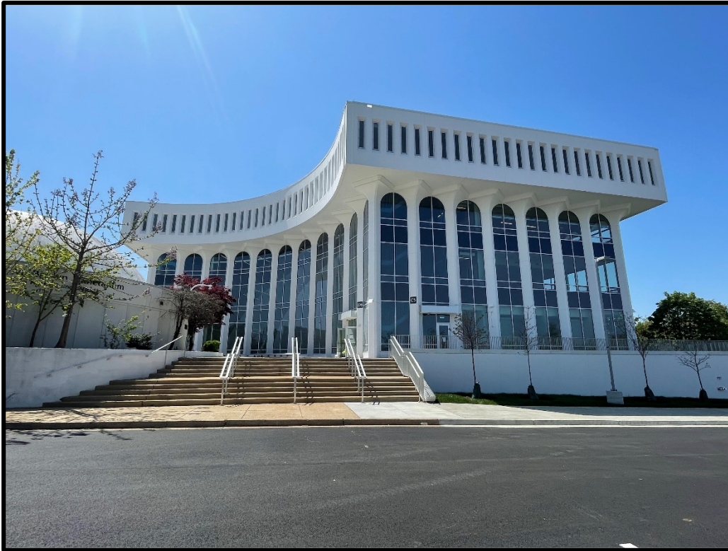
View of the Front of the Building