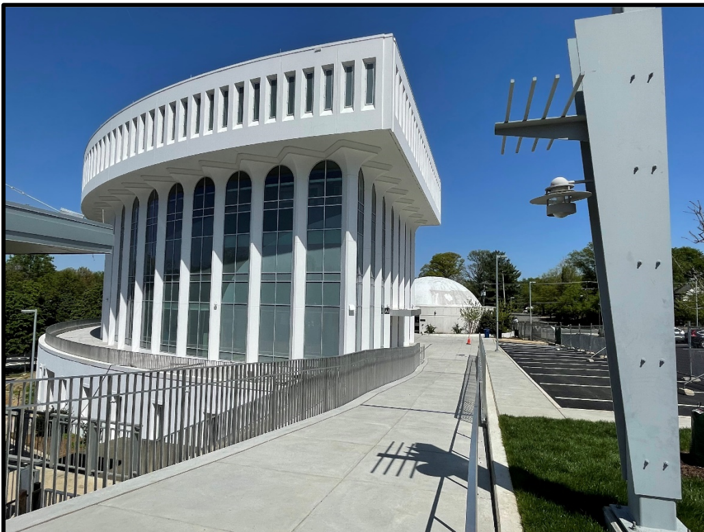
View of Ramp from W&L to Main Entrance