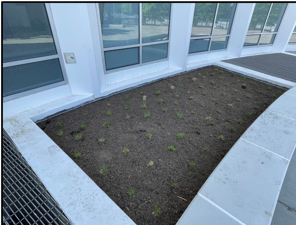
View of New Plants in Plaza Planter Box