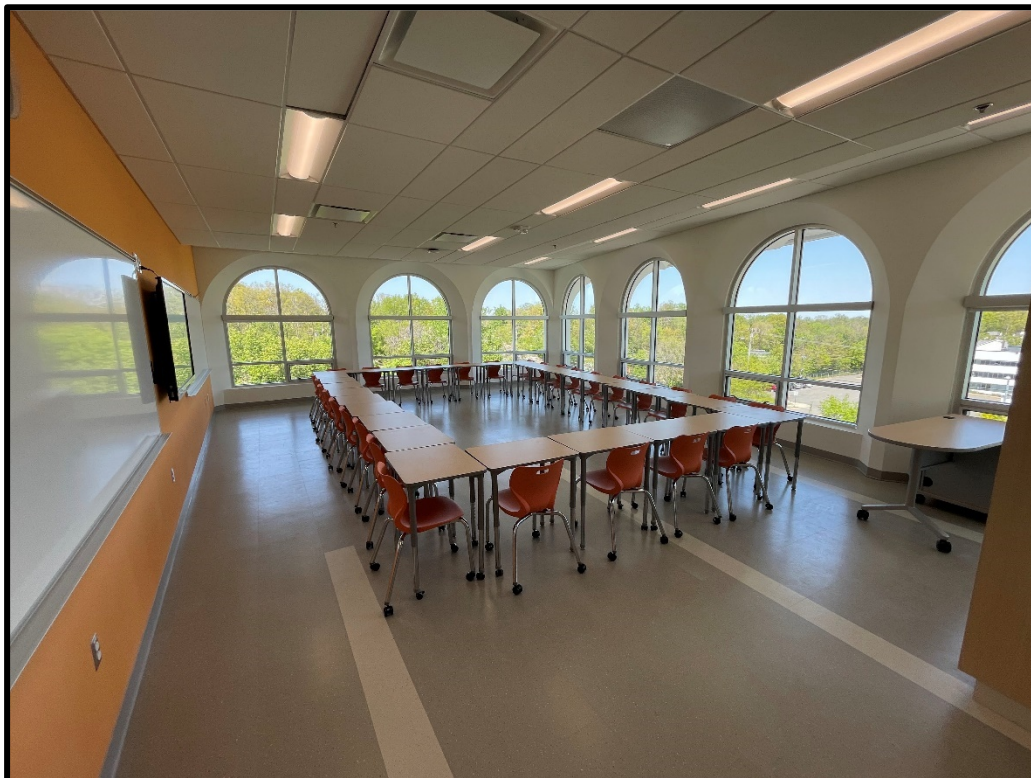
View of Work Ongoing on Level 3