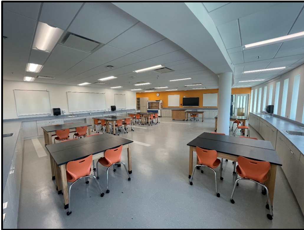
View of Work Ongoing on Level 4