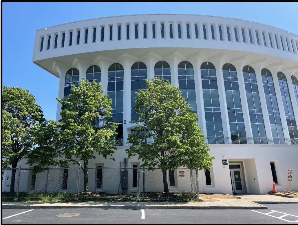
View of the Building from Entry to the Parking Lot