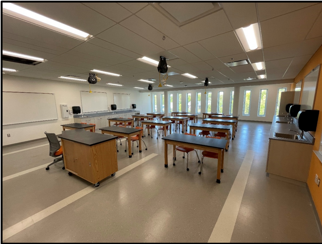
Science Classroom Setup