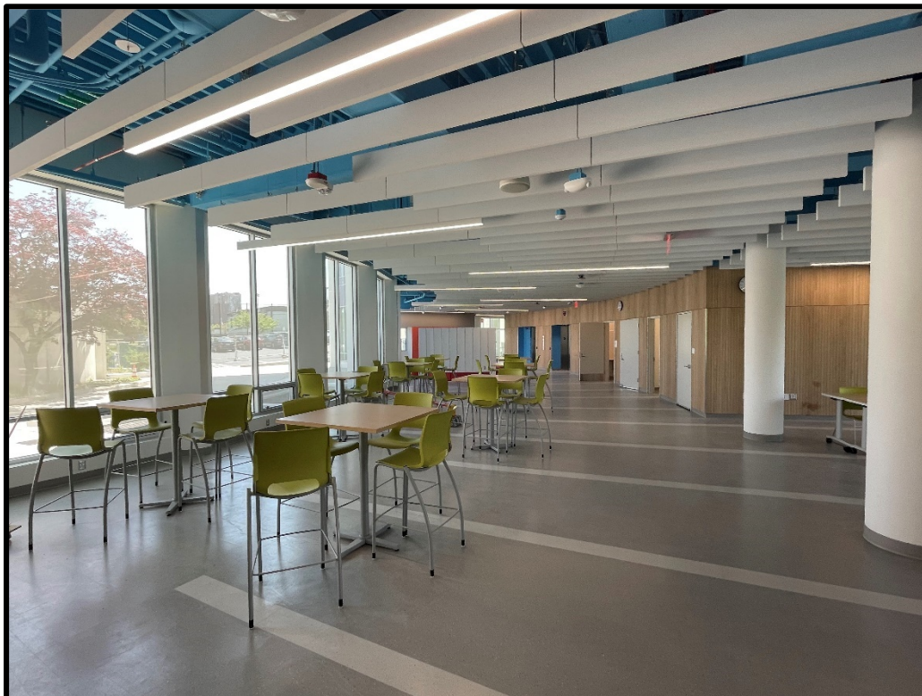
View of Work Ongoing on Level 1