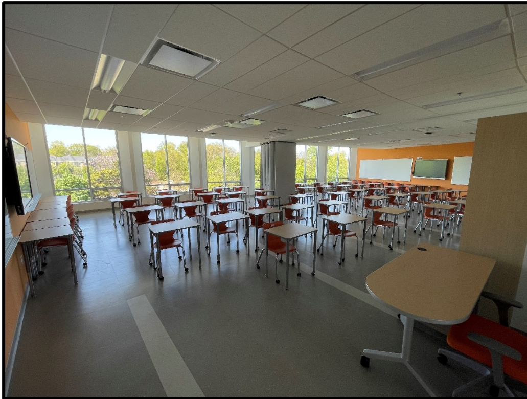
View of Work Ongoing on Level 2