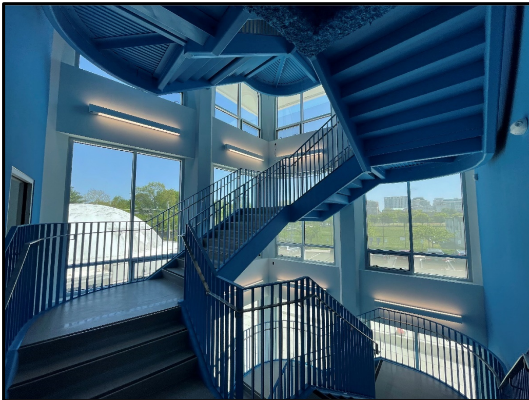
View of Stair A