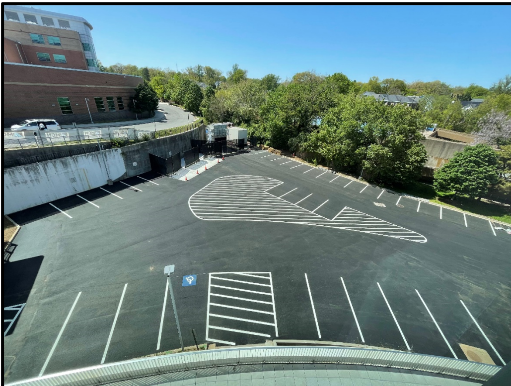
View of Work at Rear Parking Lot