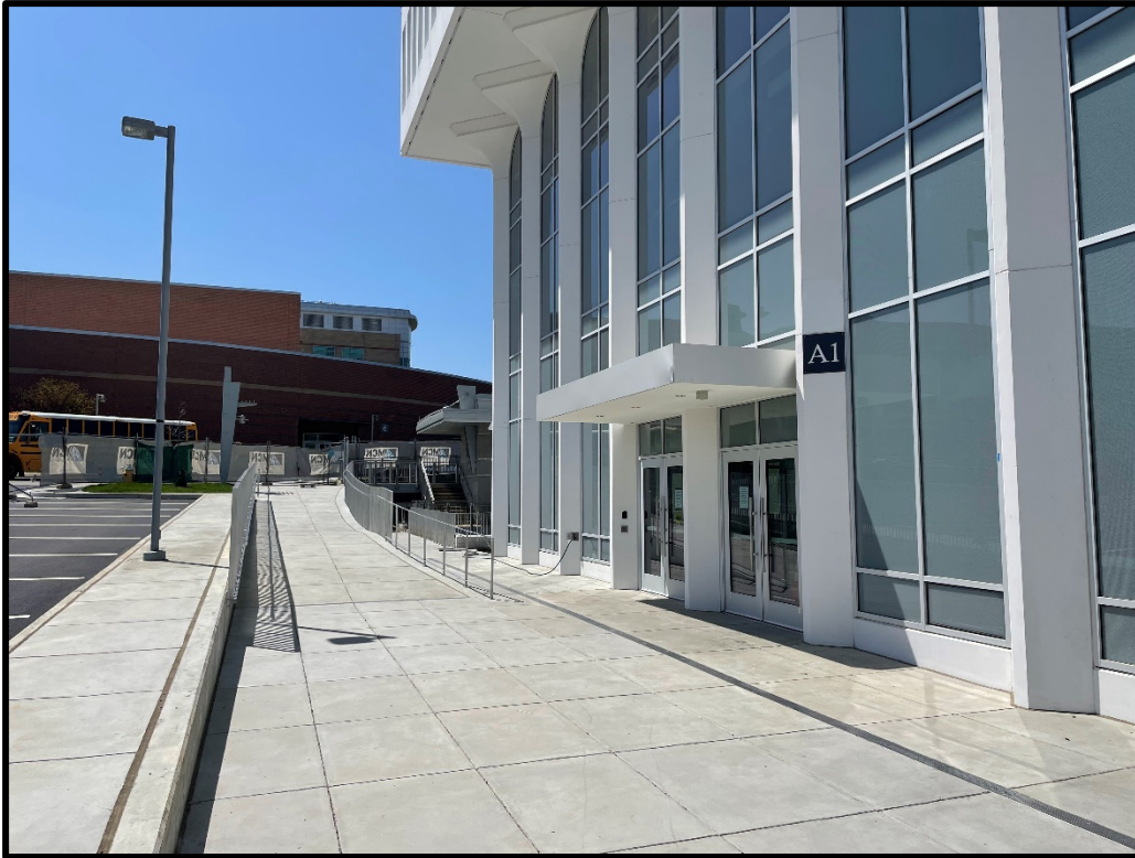
View of Main Entrance Looking Towards W&L