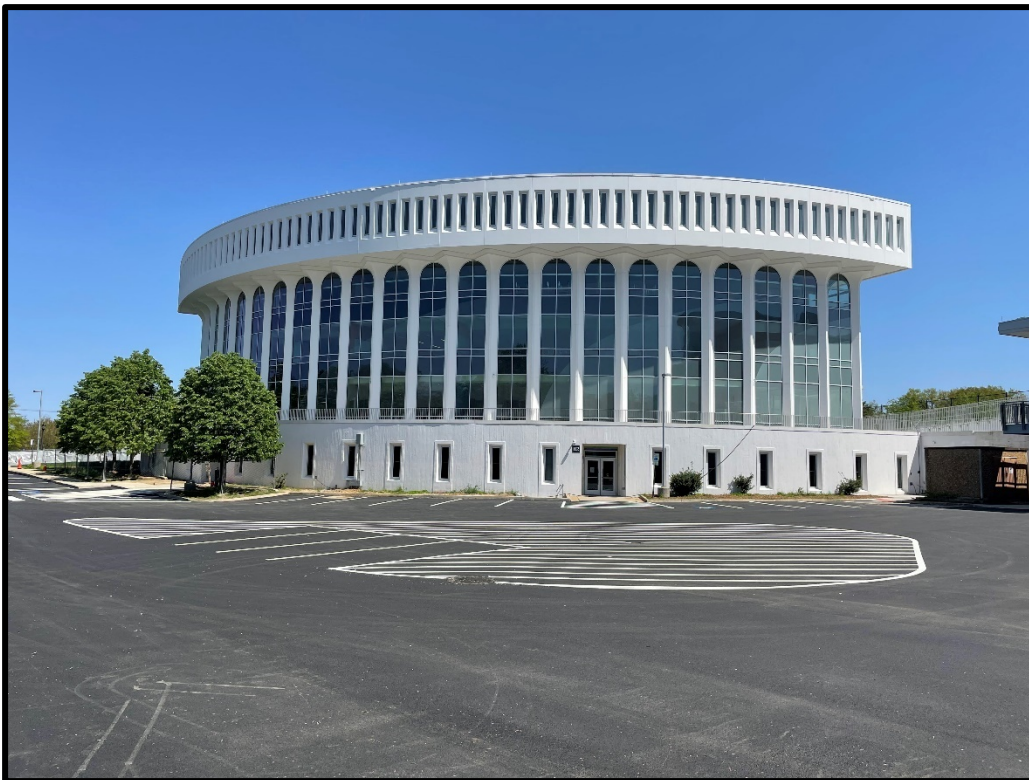
View of the Rear of the Building