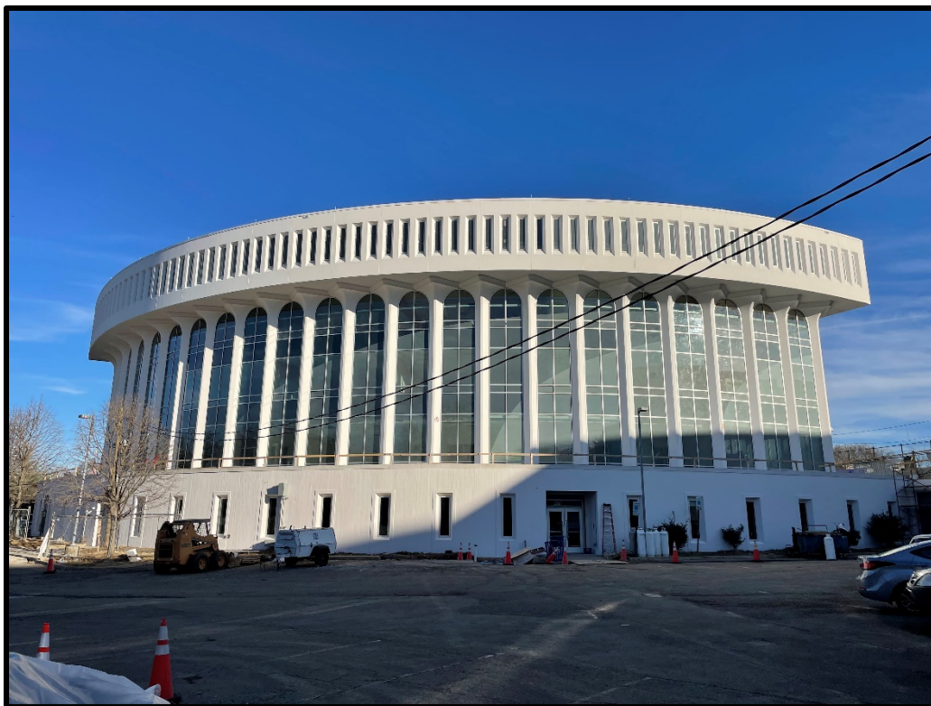
View of the Rear of the Building