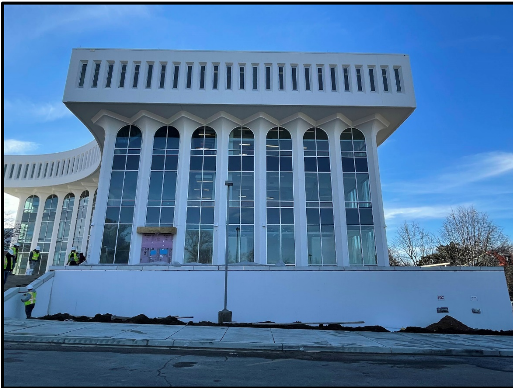
View of Exterior on East Side of Building