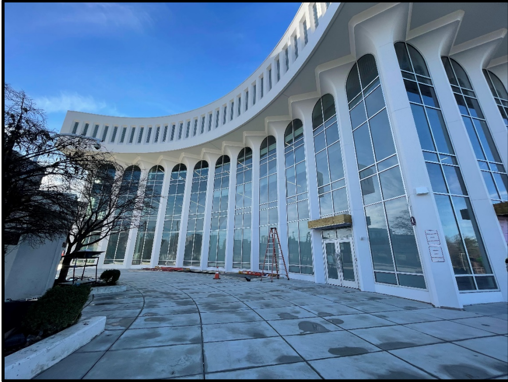
View of the Front of the Building