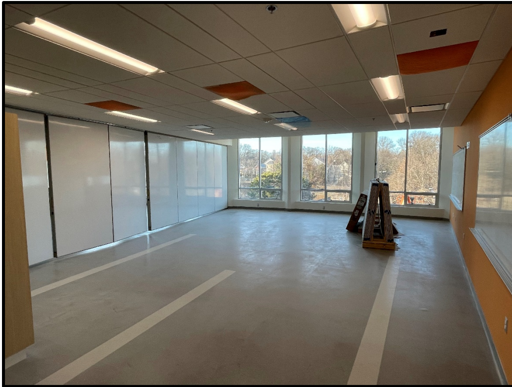
View of Work Ongoing on Level 2