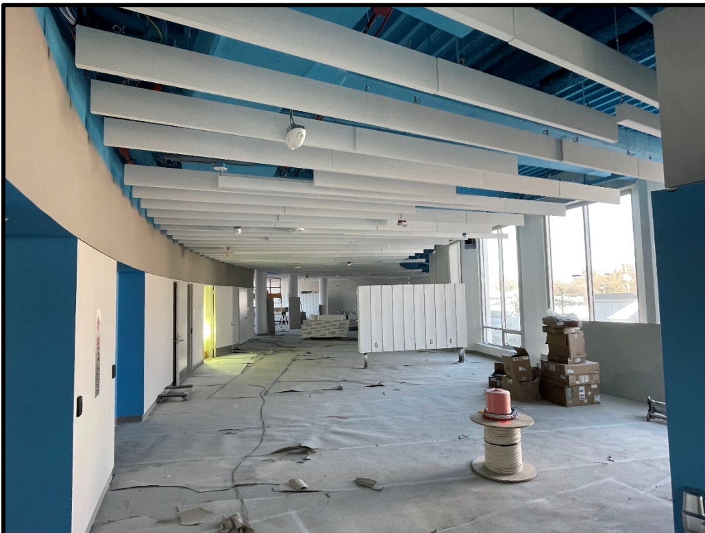
View of Work Ongoing on Level 1