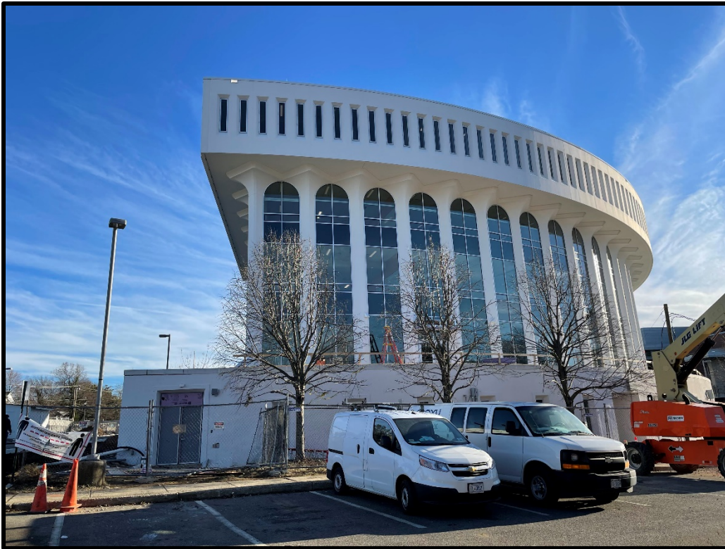
View of the Building from Entry to the Parking Lot