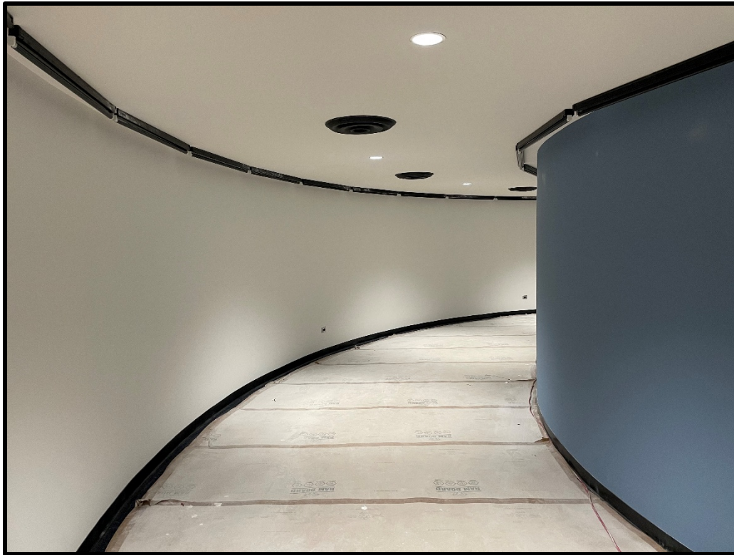
View of Work in Progress at Planetarium Corridor