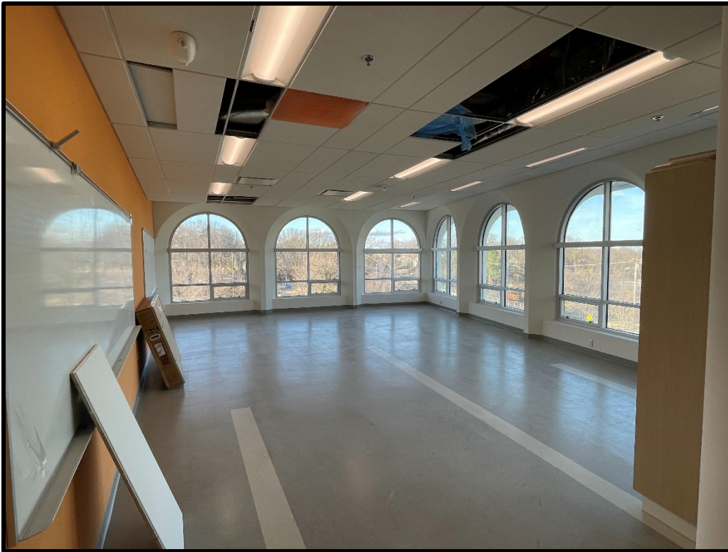
View of Work in Progress at Corner Room on Third