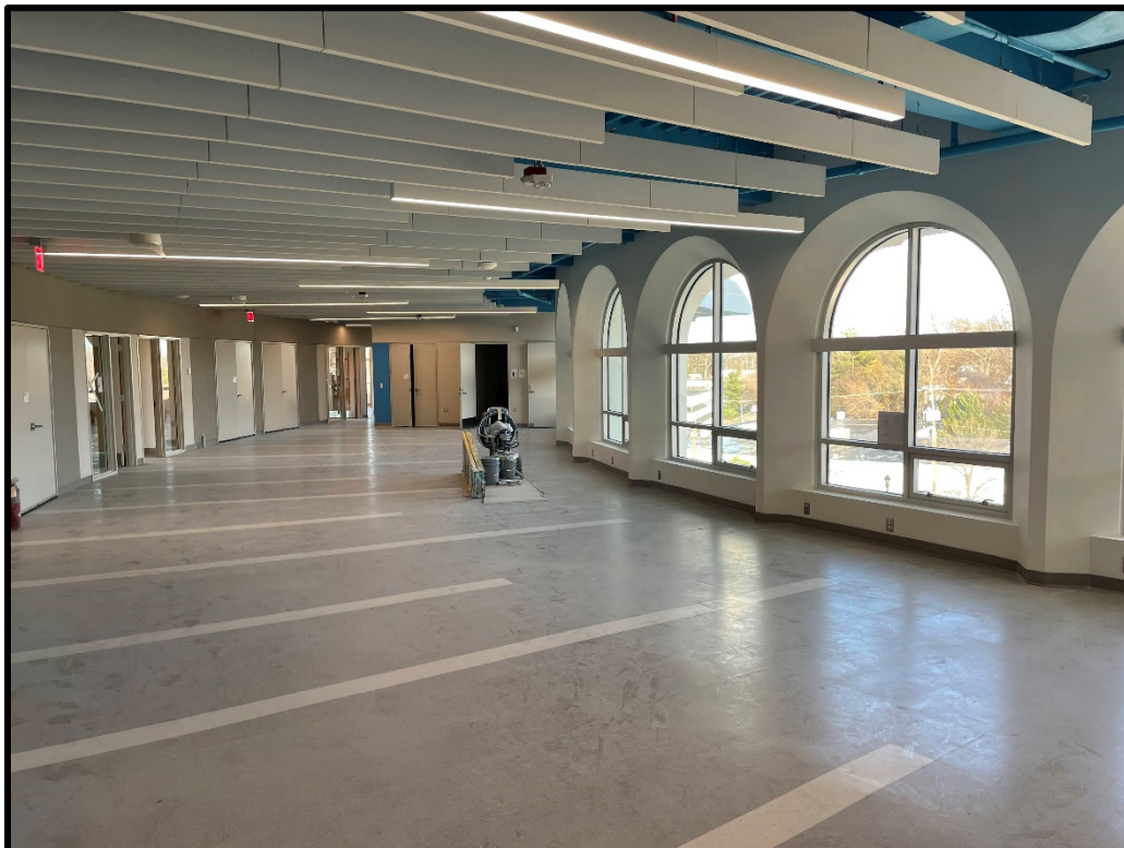
View of Work Ongoing on Level 3