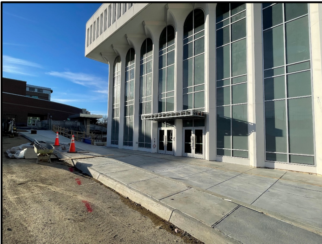
View of Work Ongoing on Main Ramp