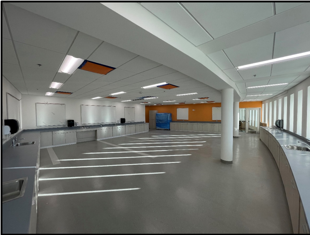
View of Work Ongoing on Level 4