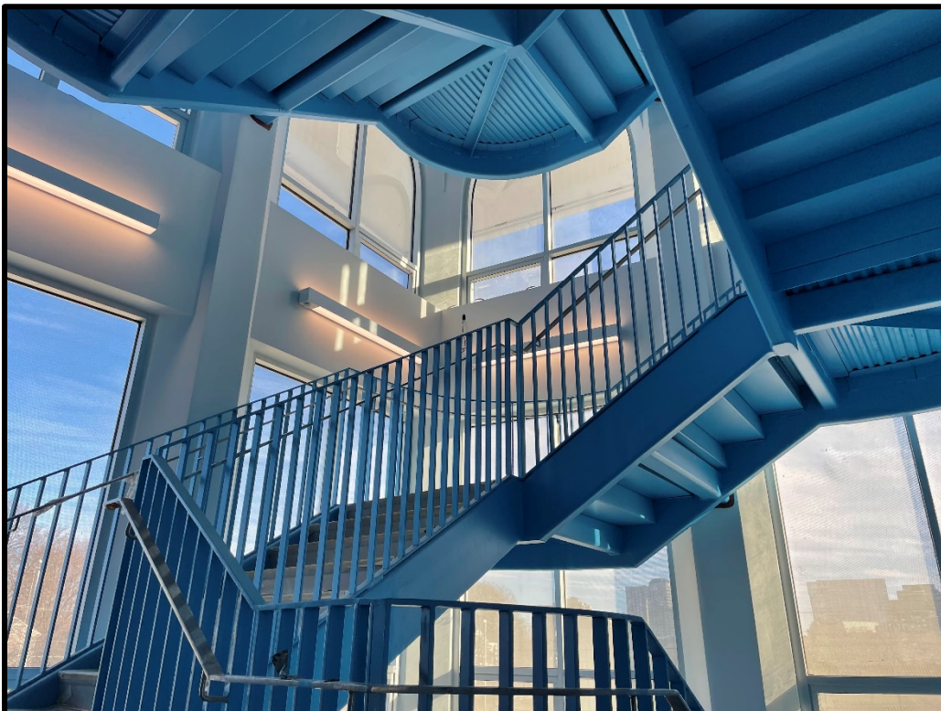
View of Stair A