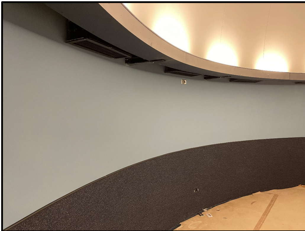
View of Work in Progress at Planetarium Inner Bowl