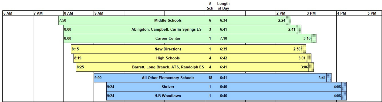
APS Bell Schedule