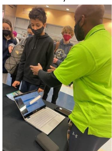
Student Distribution at Washington-Liberty HS (2/8/22), Marketing Team Photo