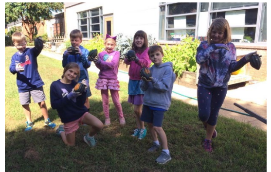
Figure 4 - Tuckahoe Elementary Students

These outdoor native habitats and learning environments were frequently used when students returned to in-person learning starting in March 2021 as outdoor activities were encouraged during the pandemic.