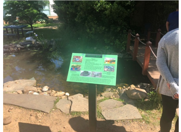
Figure 2 - Campbell Elementary Wetlands Lab Signage

Campbell Elementary School takes advantage of a unique opportunity to expand its hands-on, inquiry-based approach to education by converting a wet and swampy area of their schoolyard into a Wetlands Learning Lab 2 . Overflow from a wetlands spring goes into a dry stream leading to a rain garden and then into a 60x20 foot vegetated bioswale. The bioswale collects ground water from the natural seeps that occur throughout the area. All the students and staff at Campbell are engaged in the wetlands learning lab.