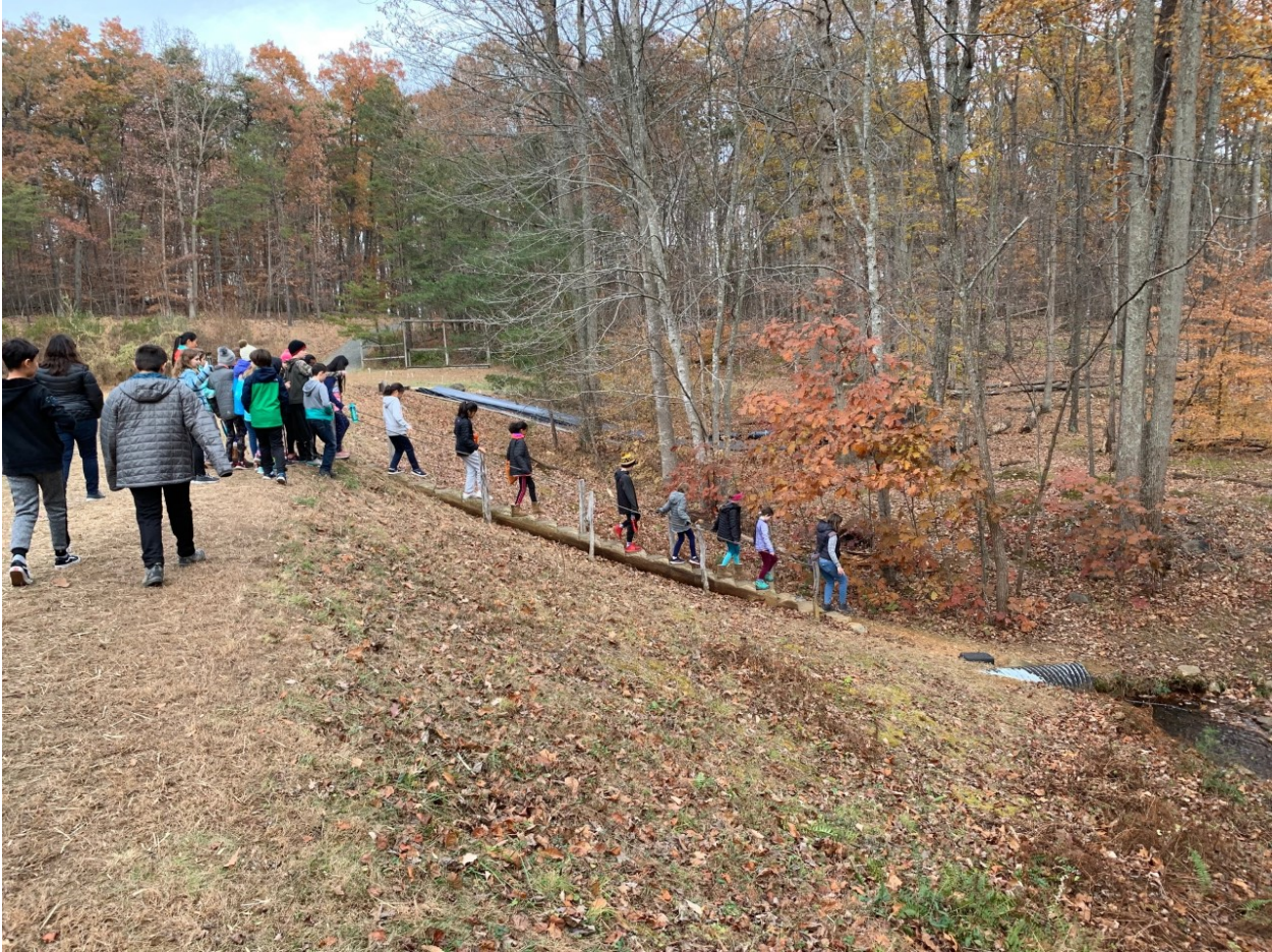
Figure 3 -Students Visit the Outdoor Lab and Check Out the Snake Pit