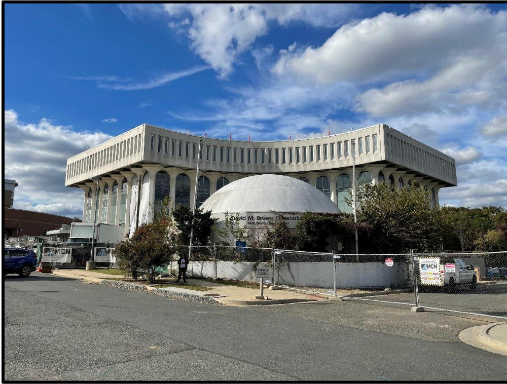
View of the Front of the Building