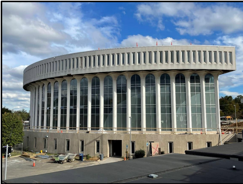
View of the Rear of the Building