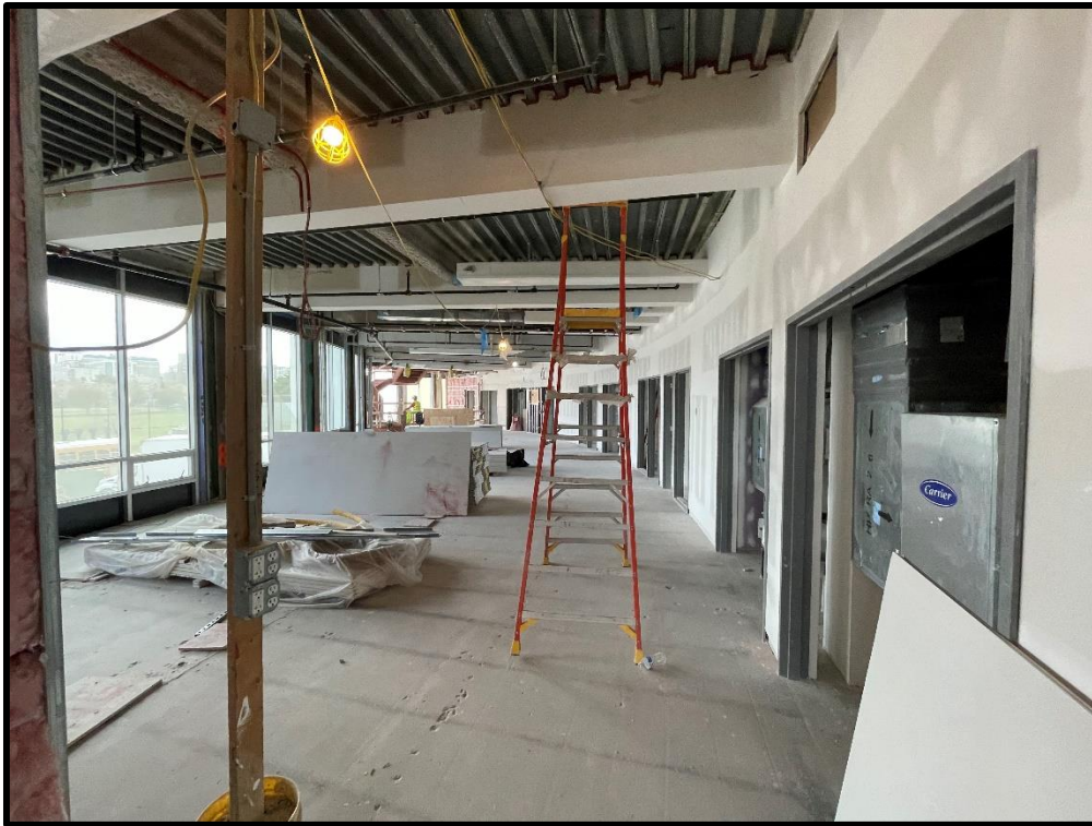
View of Work Ongoing on Level 2