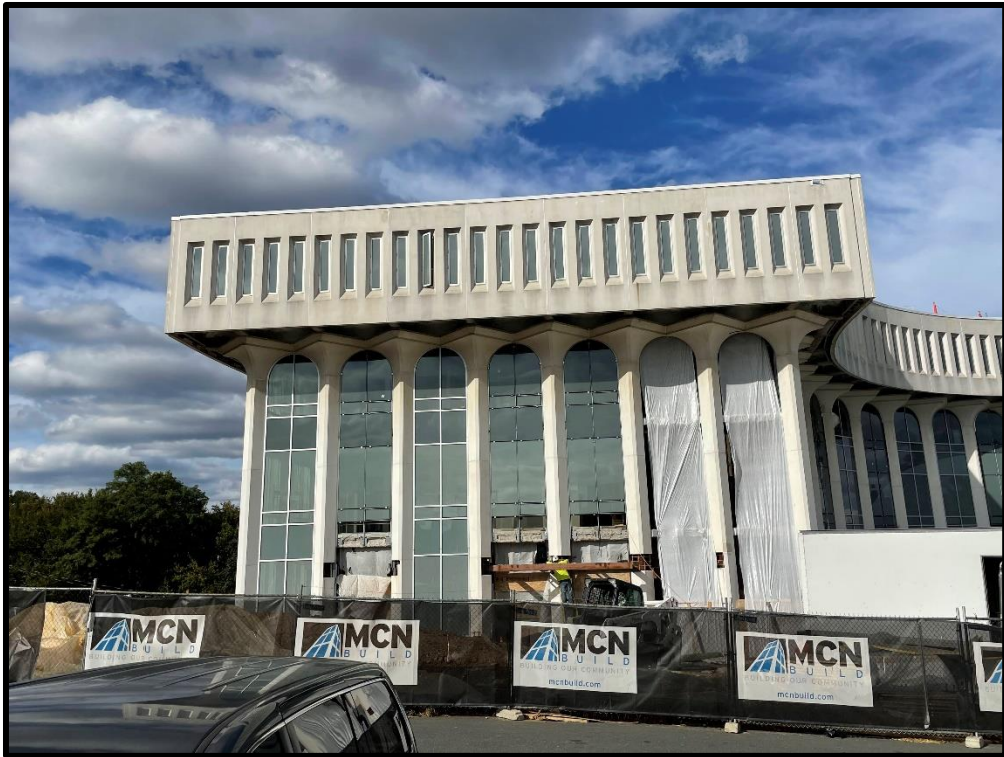
View of the Building from Washington Liberty High School