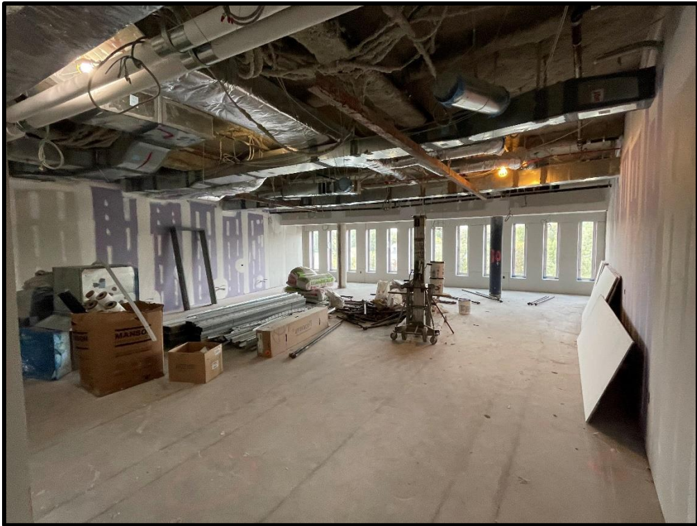
View of Work Ongoing on Level 4