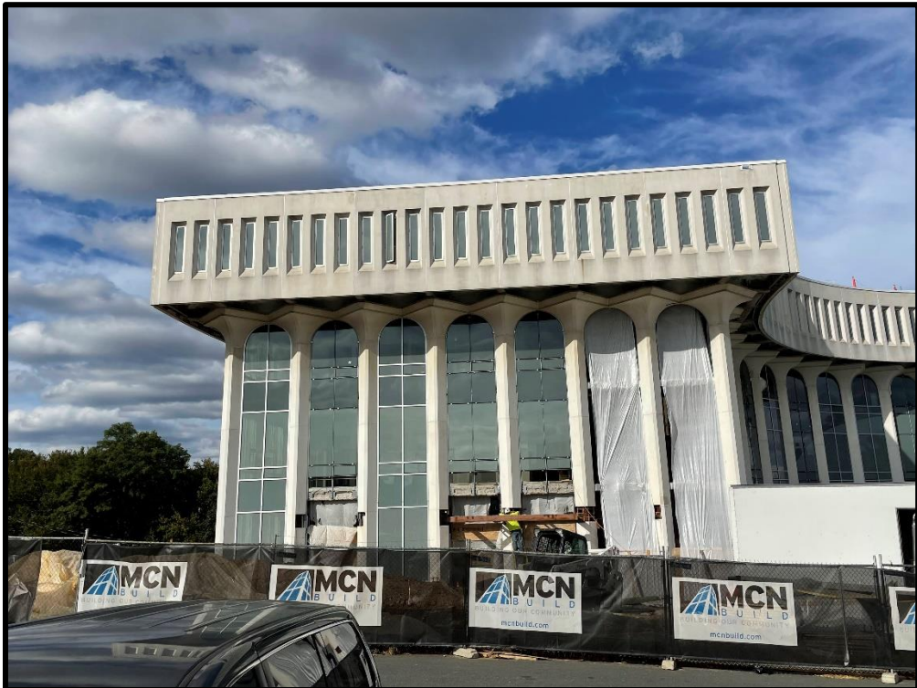
View of Exterior on East Side of Building