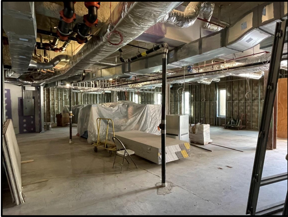
View of Work Ongoing on the Ground Floor