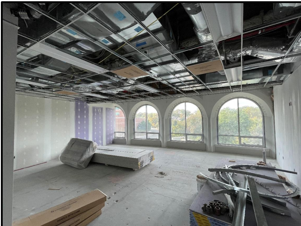
View of Work Ongoing on Level 3