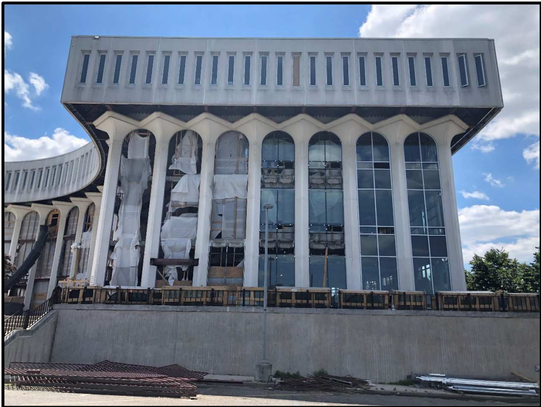
View of Exterior on East Side of Building