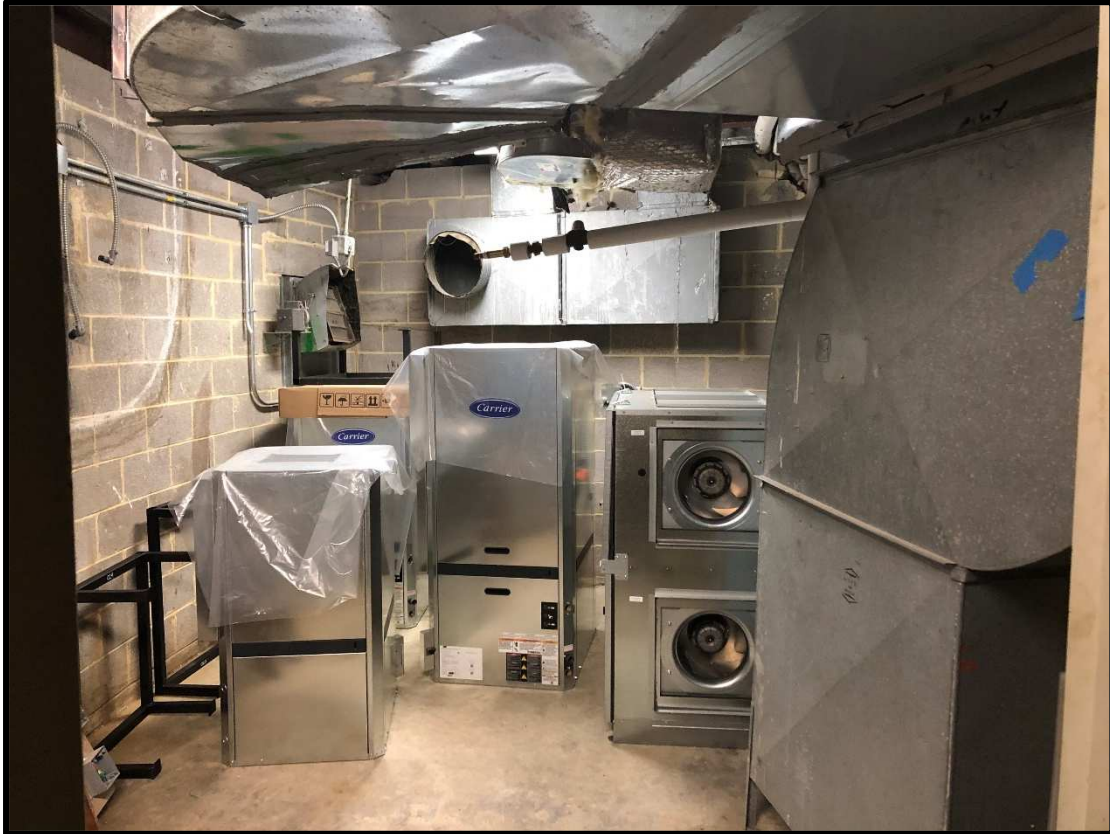
View of Working Ongoing in Planetarium