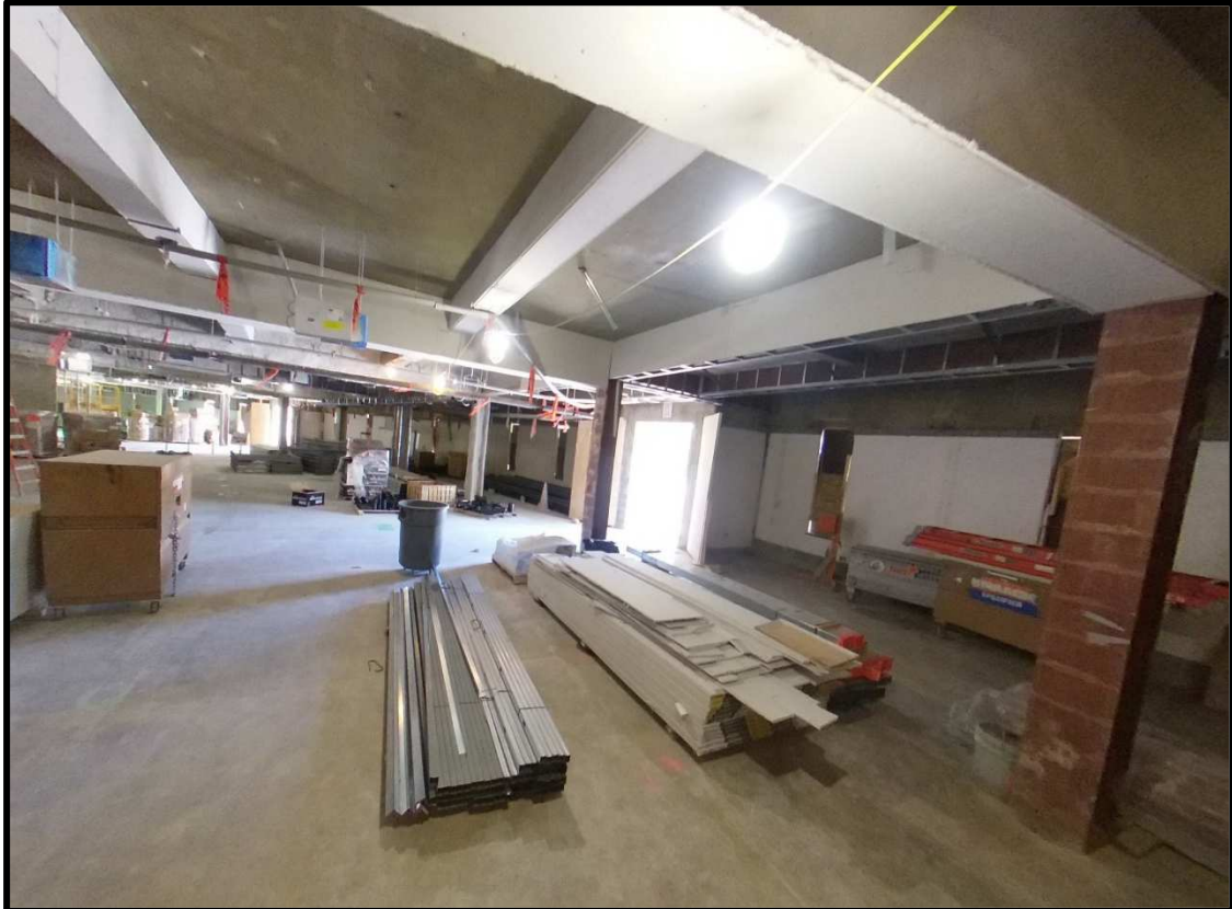
View of Work Ongoing on the Ground Floor