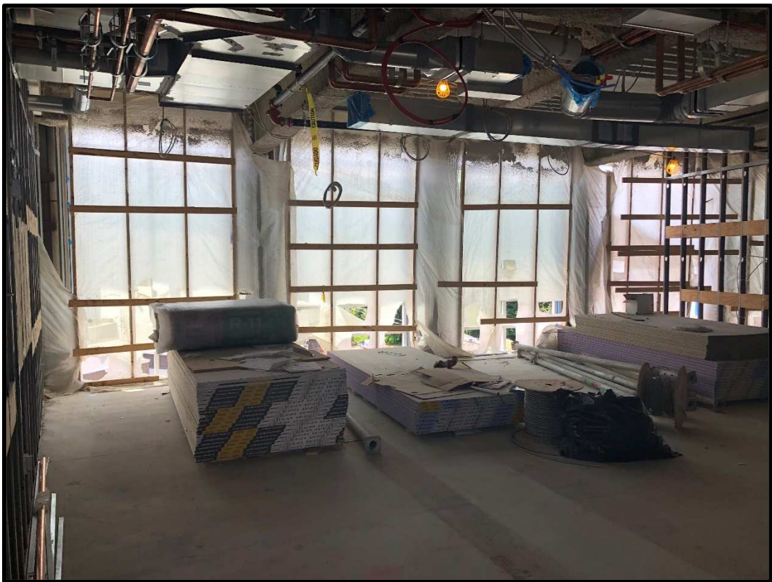
View of Work Ongoing on Level 2