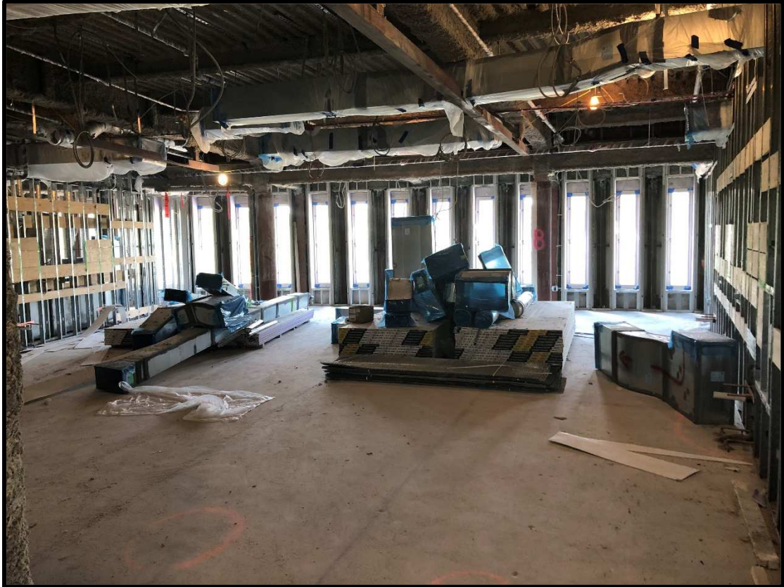
View of Work Ongoing on Level 4