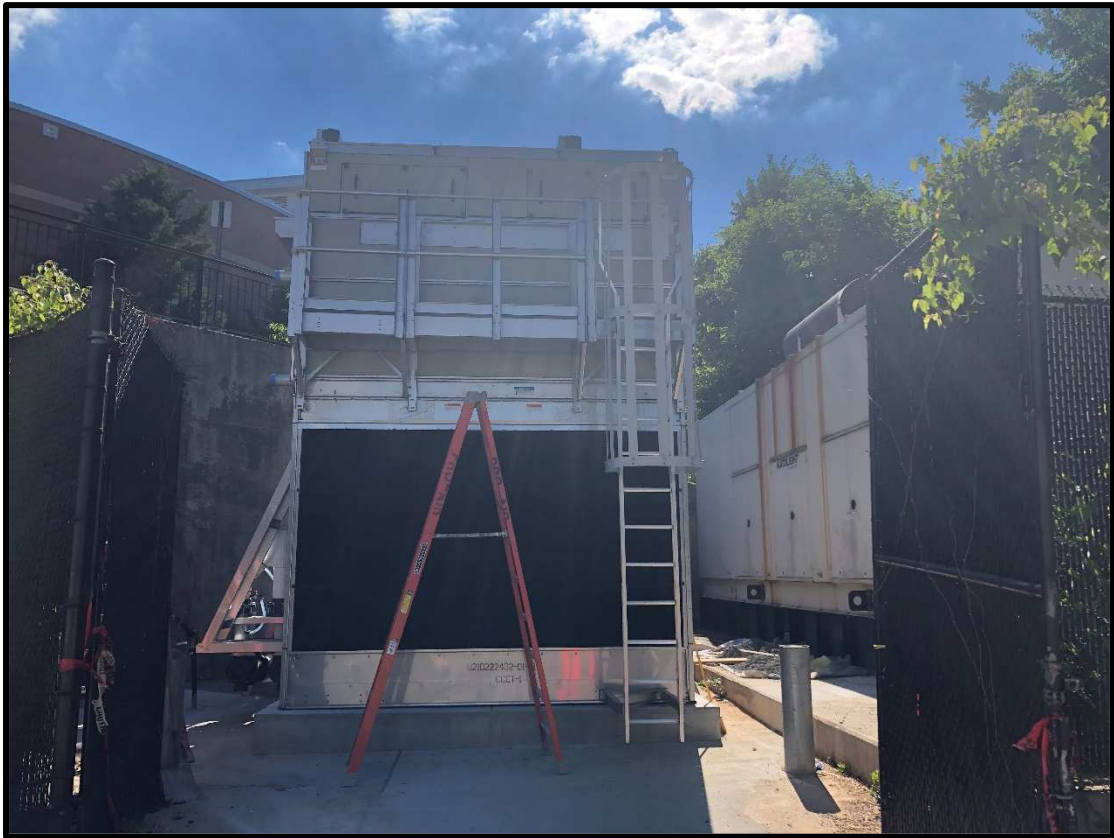
View of New Energy Recovery Unit Installation