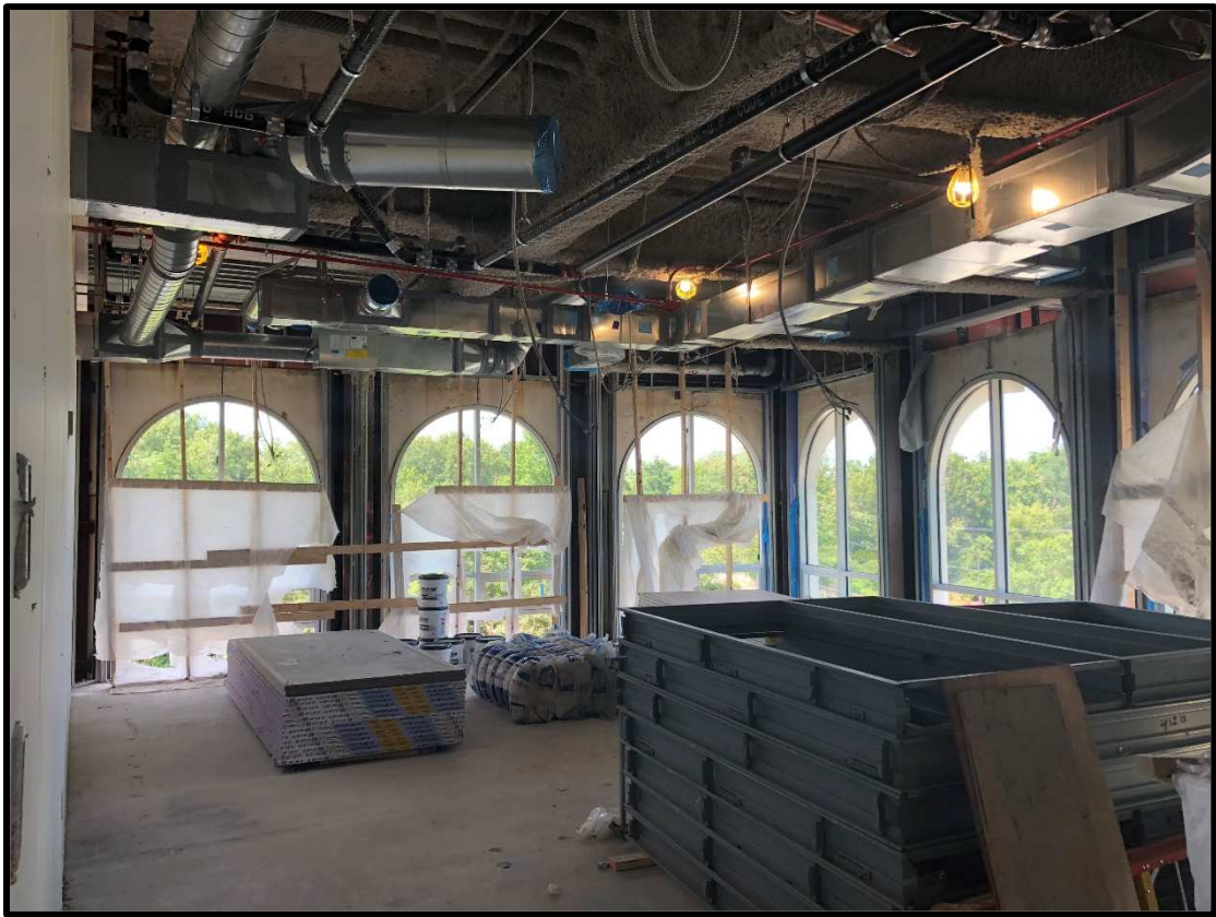
View of Work Ongoing on Level 3