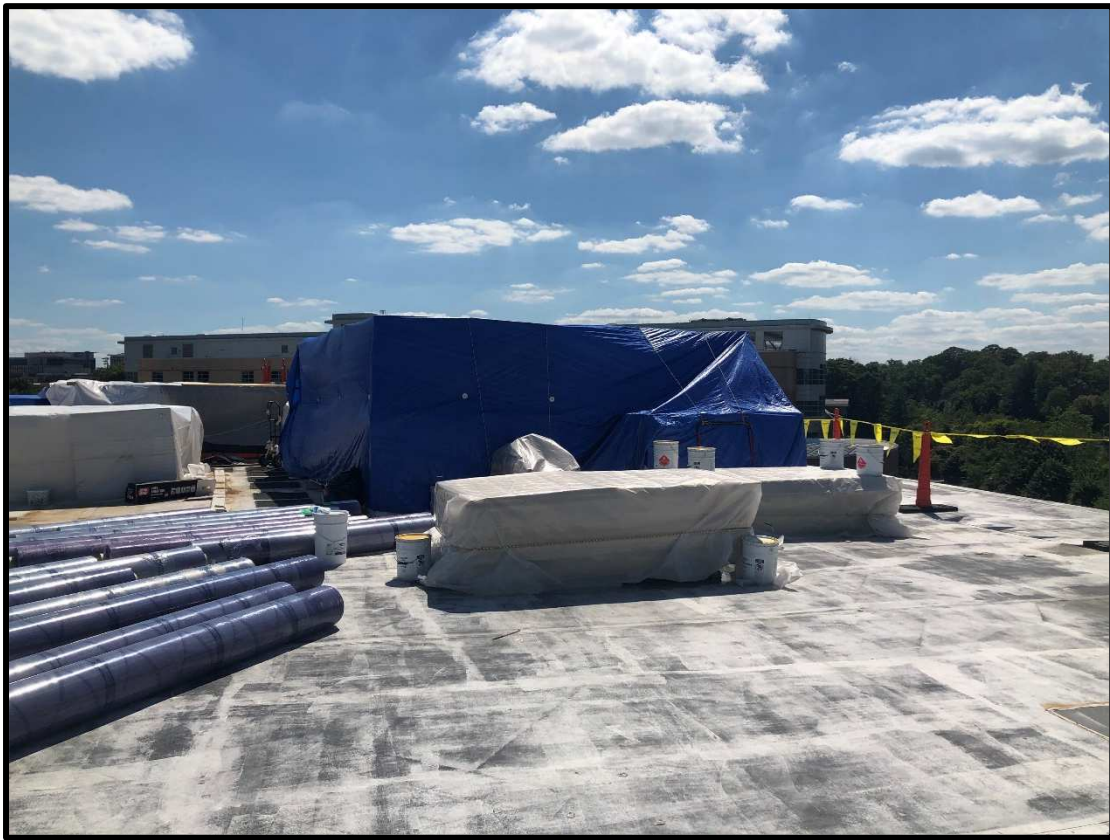
View of Working Ongoing on Roof