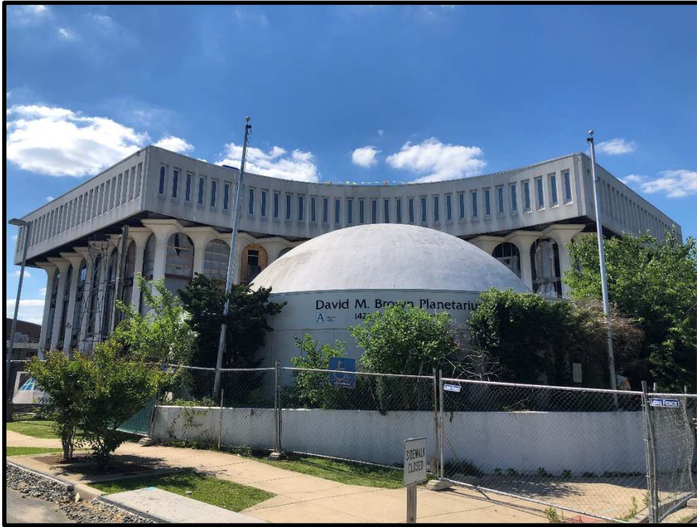
View of the Front of the Building