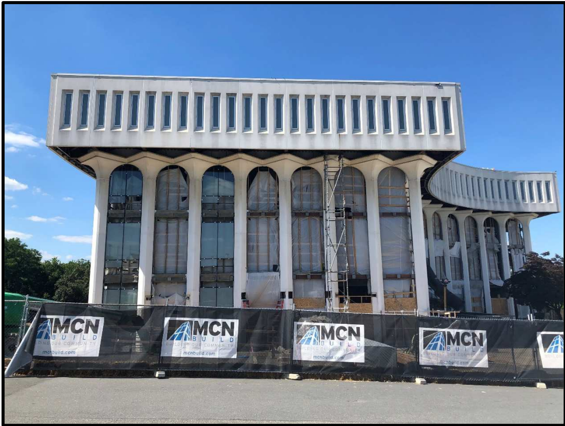
View of the Building from Washington Liberty High School