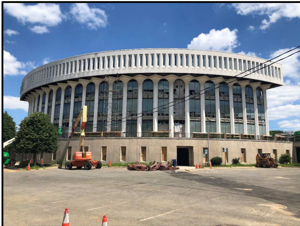
View of the Rear of the Building