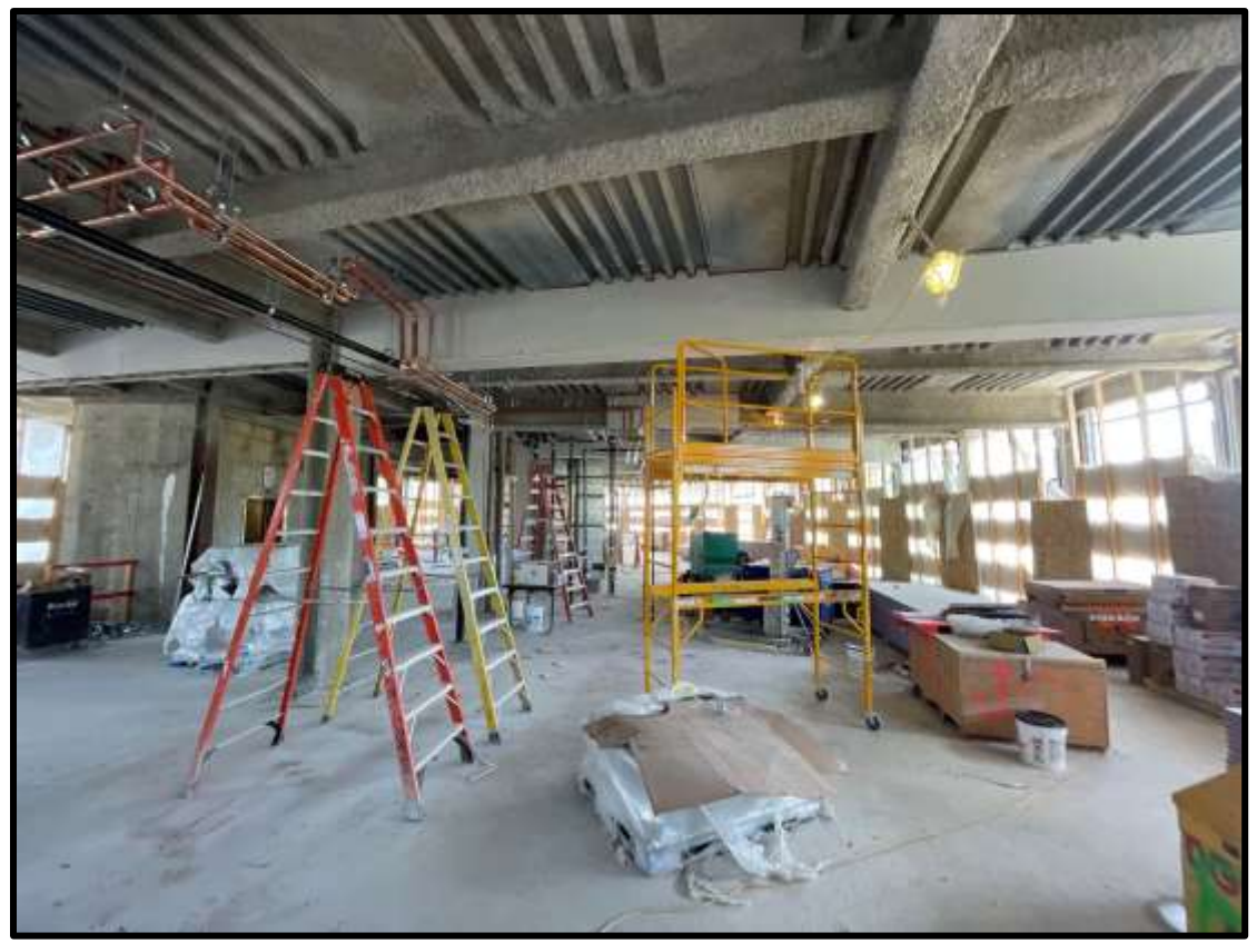
View of Work Ongoing on Level 1