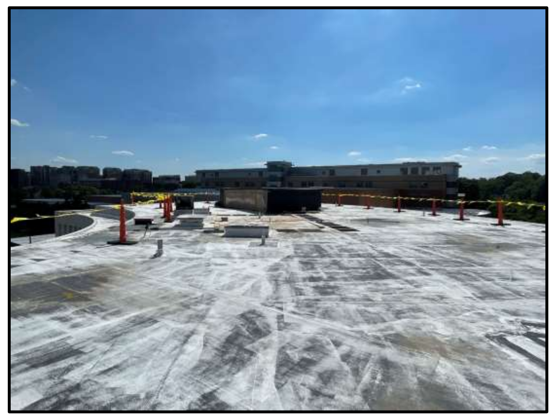
View of Working Ongoing on Roof