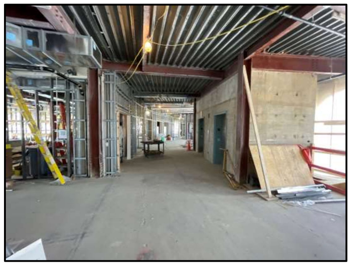
View of Work Ongoing on Level 3