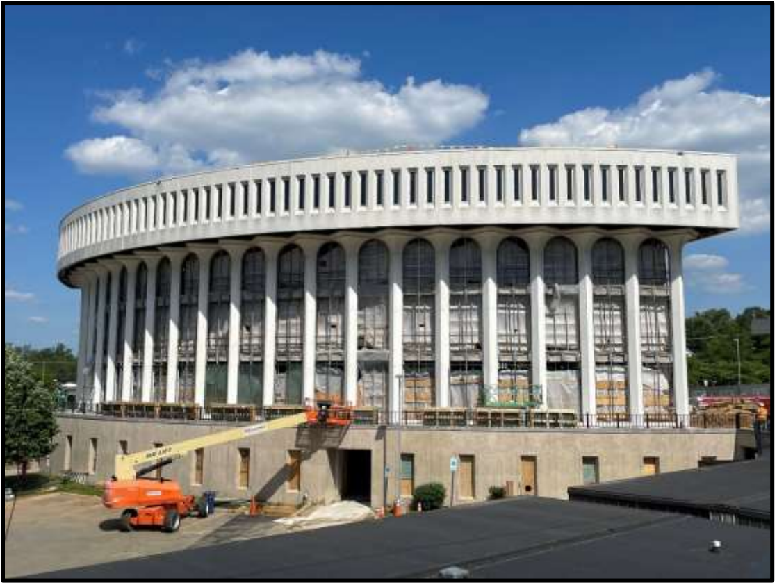
View of Rear of Building from Washington Liberty High School