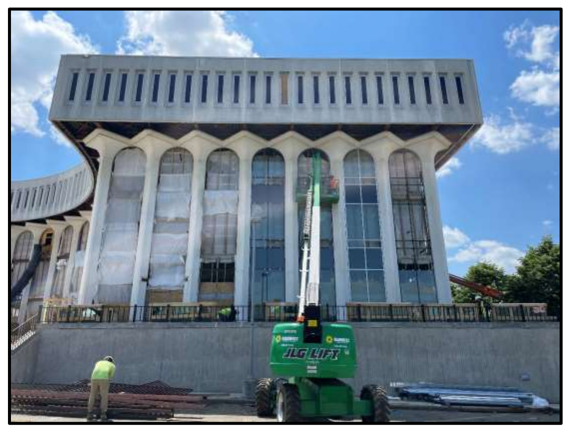
View of Exterior on East Side of Building