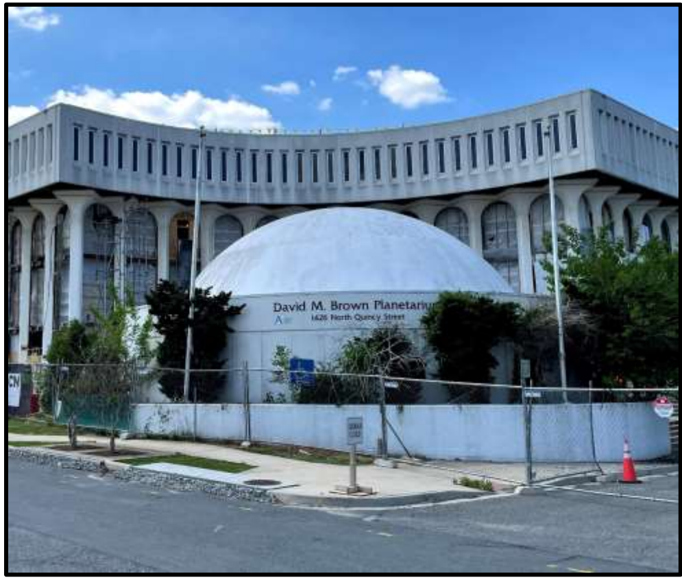
View of the Front of the Building