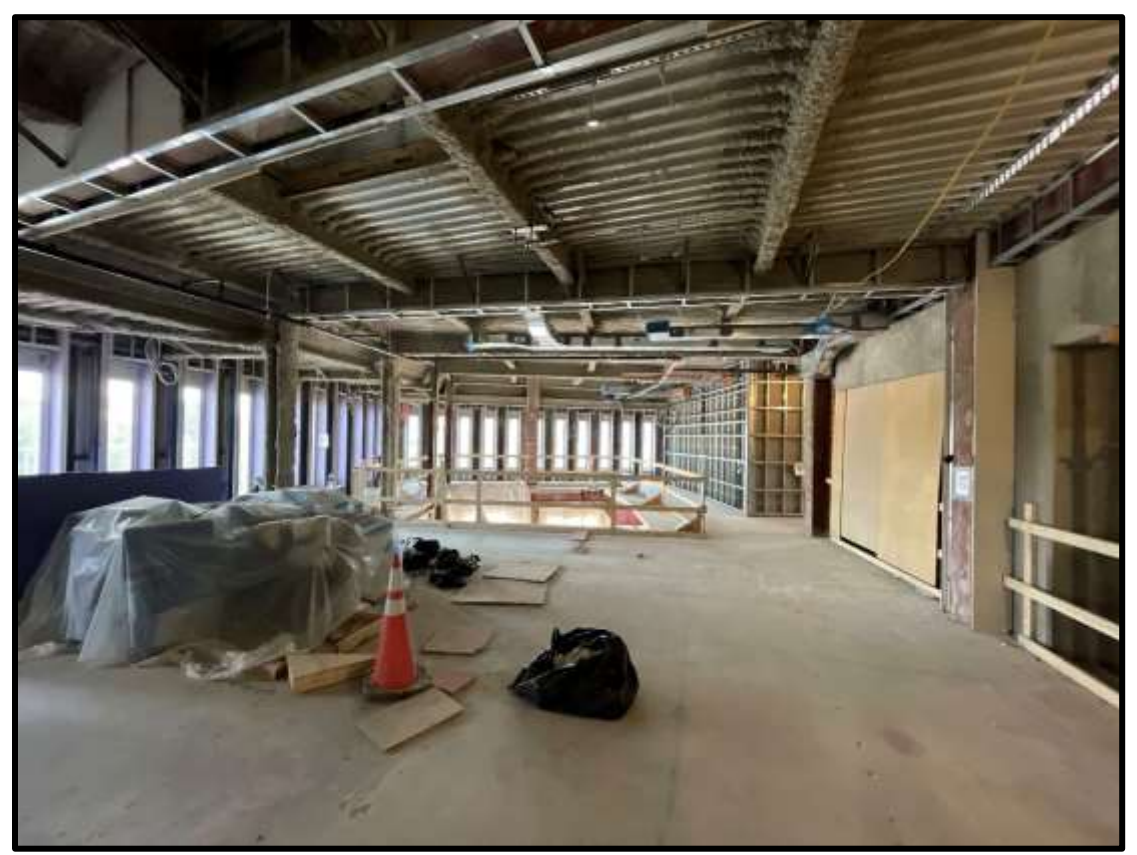
View of Work Ongoing on Level 4