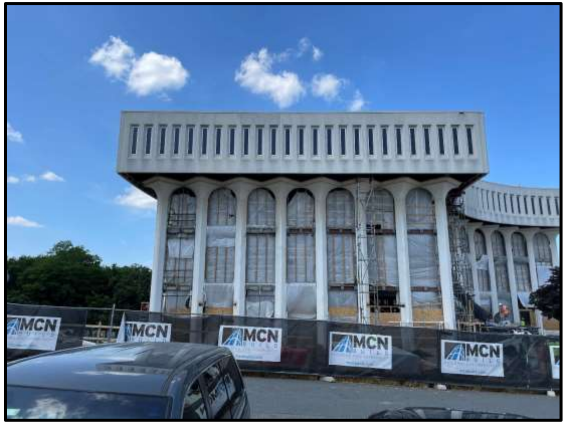
View of the Building from Washington Liberty High School