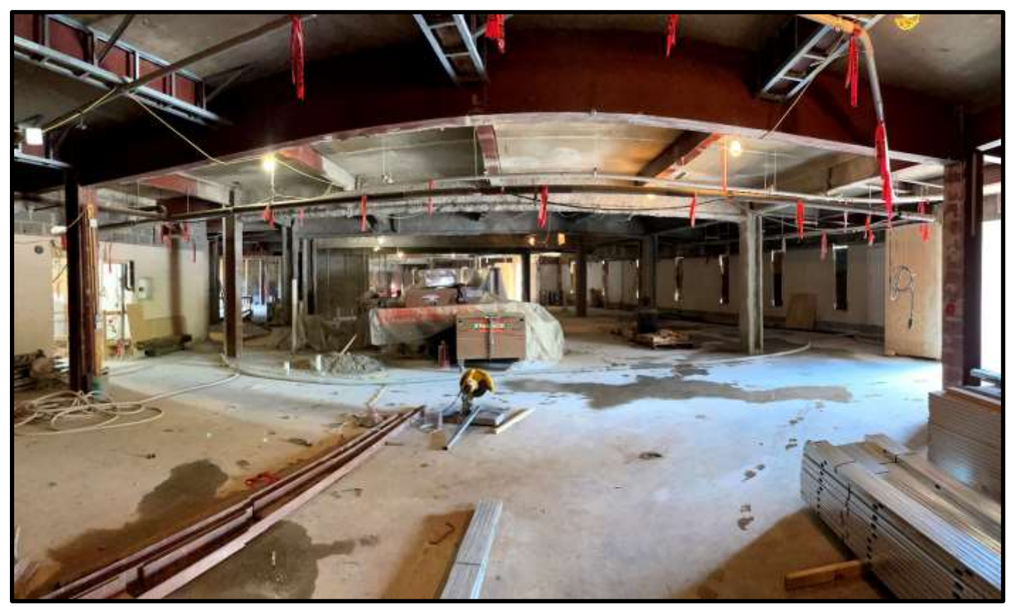
View of Work Ongoing on the Ground Floor