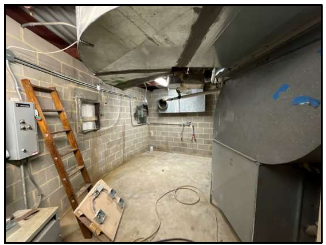
View of Working Ongoing in Planetarium