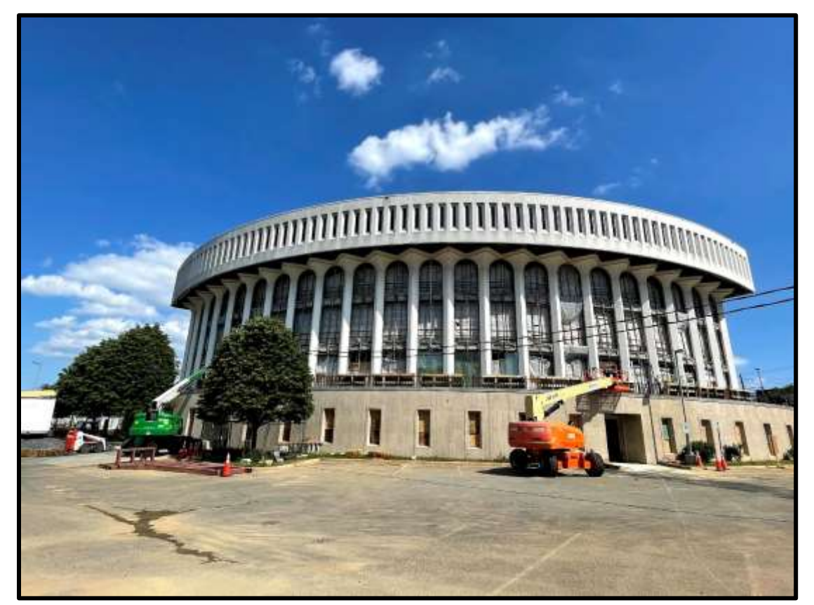
View of the Rear of the Building