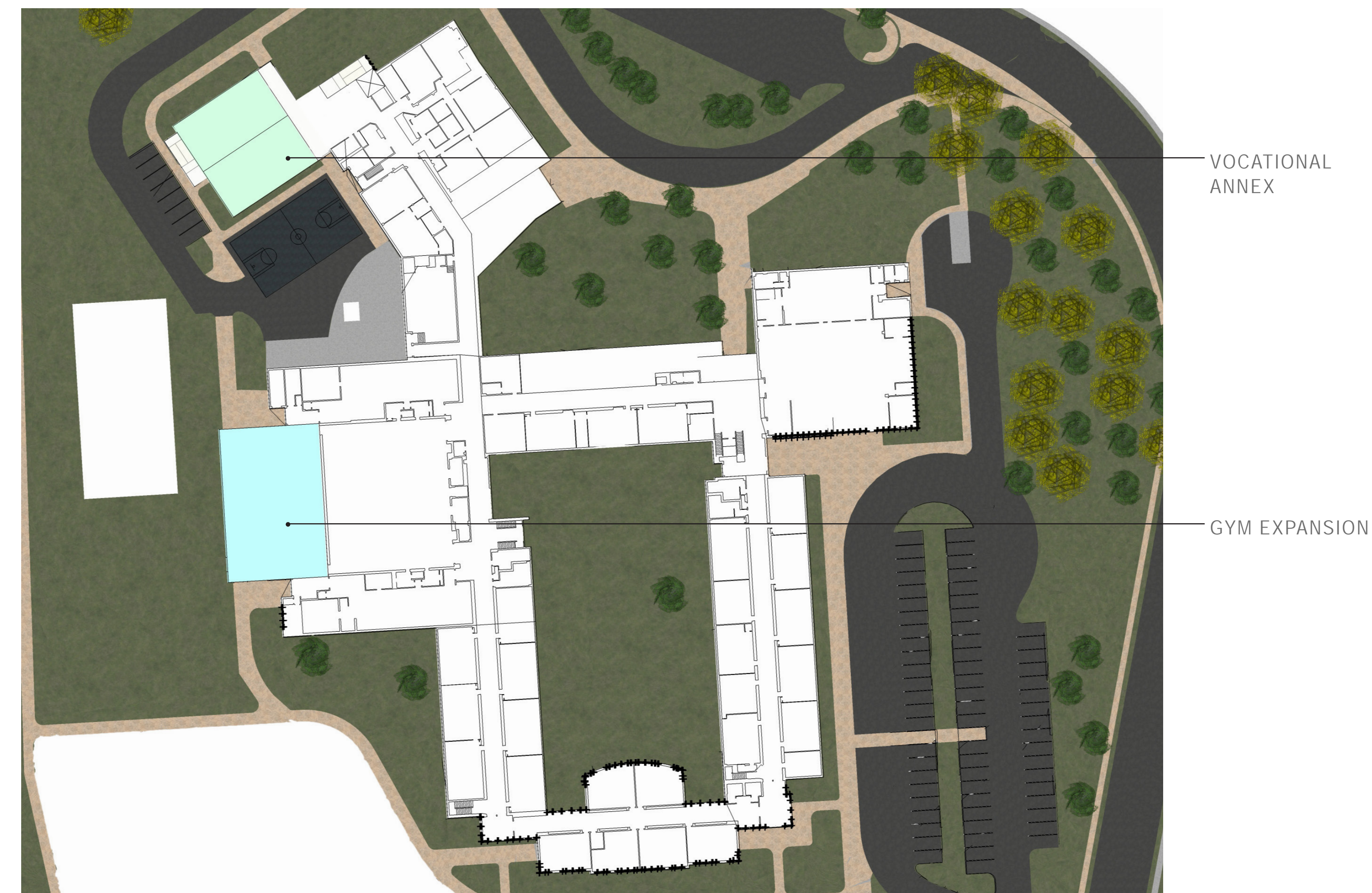
1" = 50' FLOOR ONE