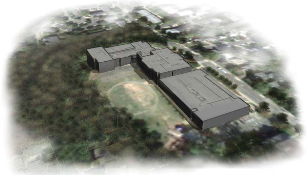
VIEW FROM SOUTHWEST