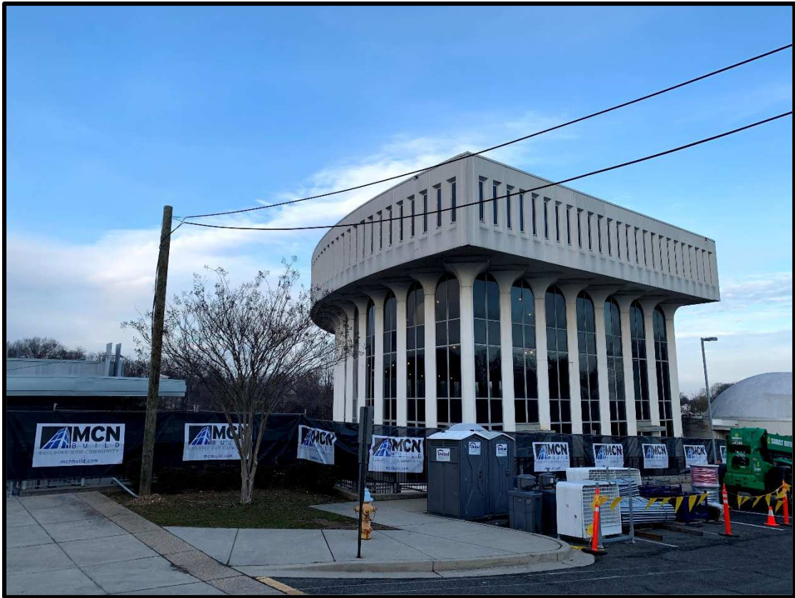
View of the building from Washington Liberty High School