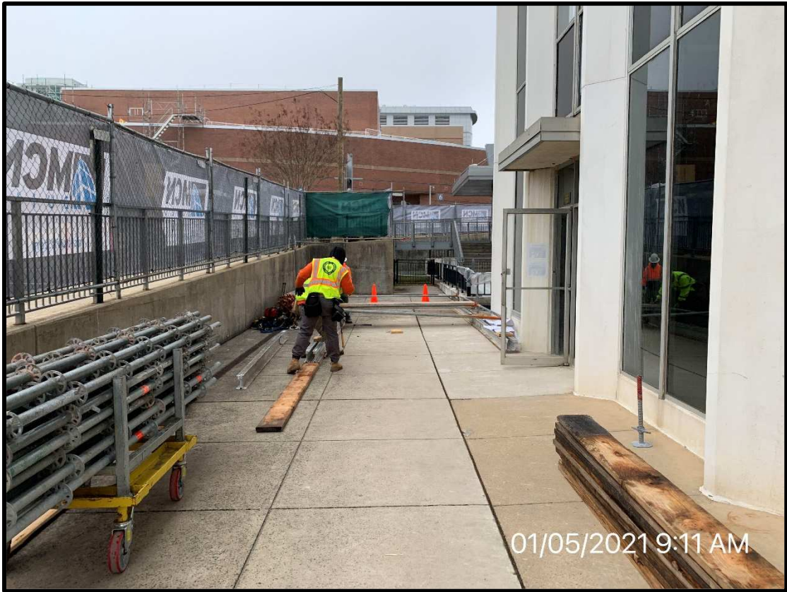
View of South side of building with scaffold erection beginning