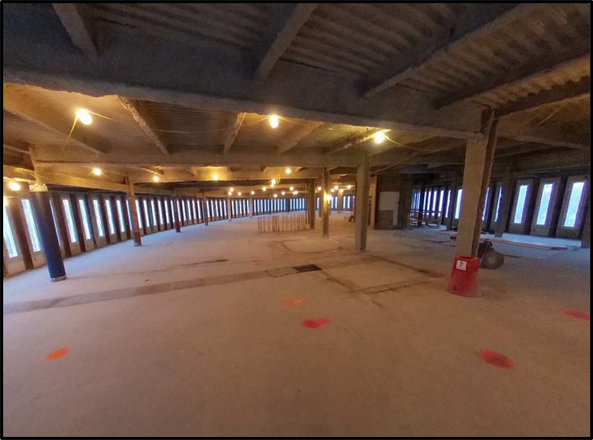
View of work on level 4 of building