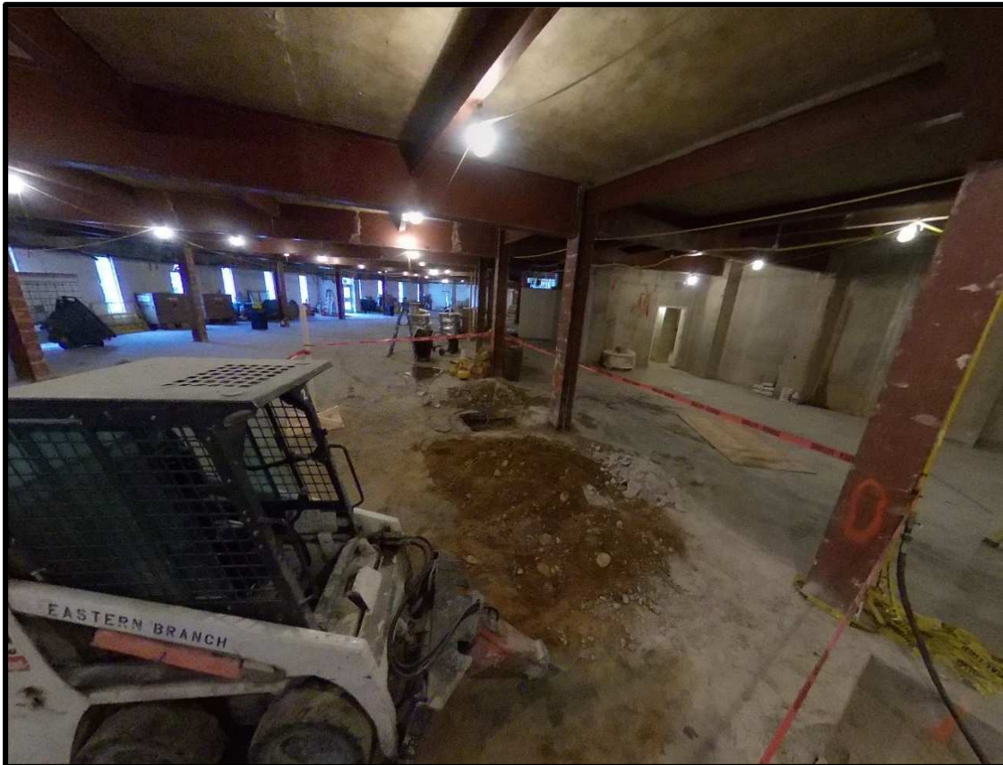
View of demolition on ground floor of building