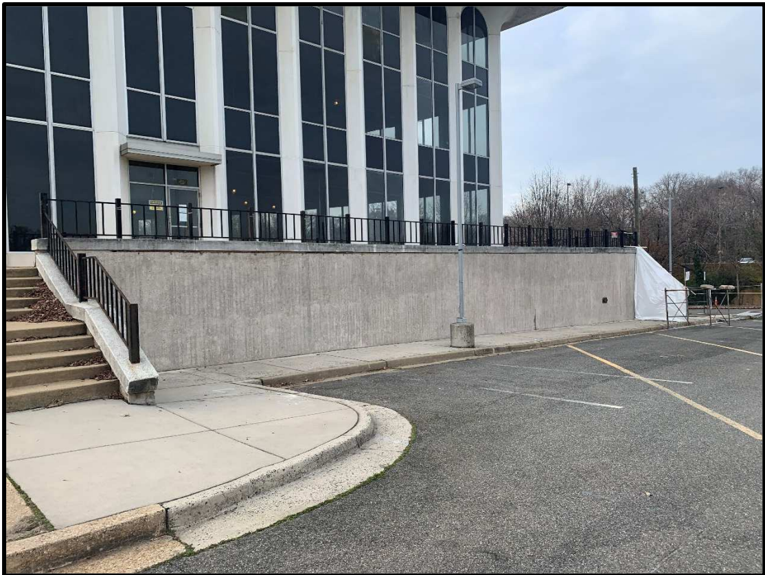
View of exterior abatement removal progress on East side of building