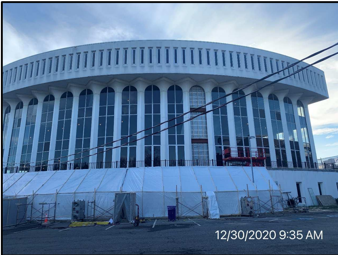
View of the rear of the building