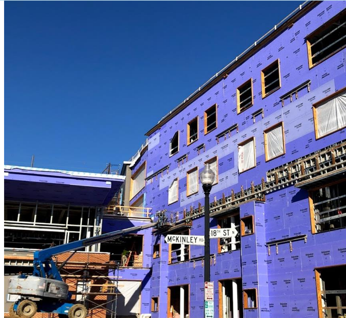
View from McKinley Road / 18 th Street