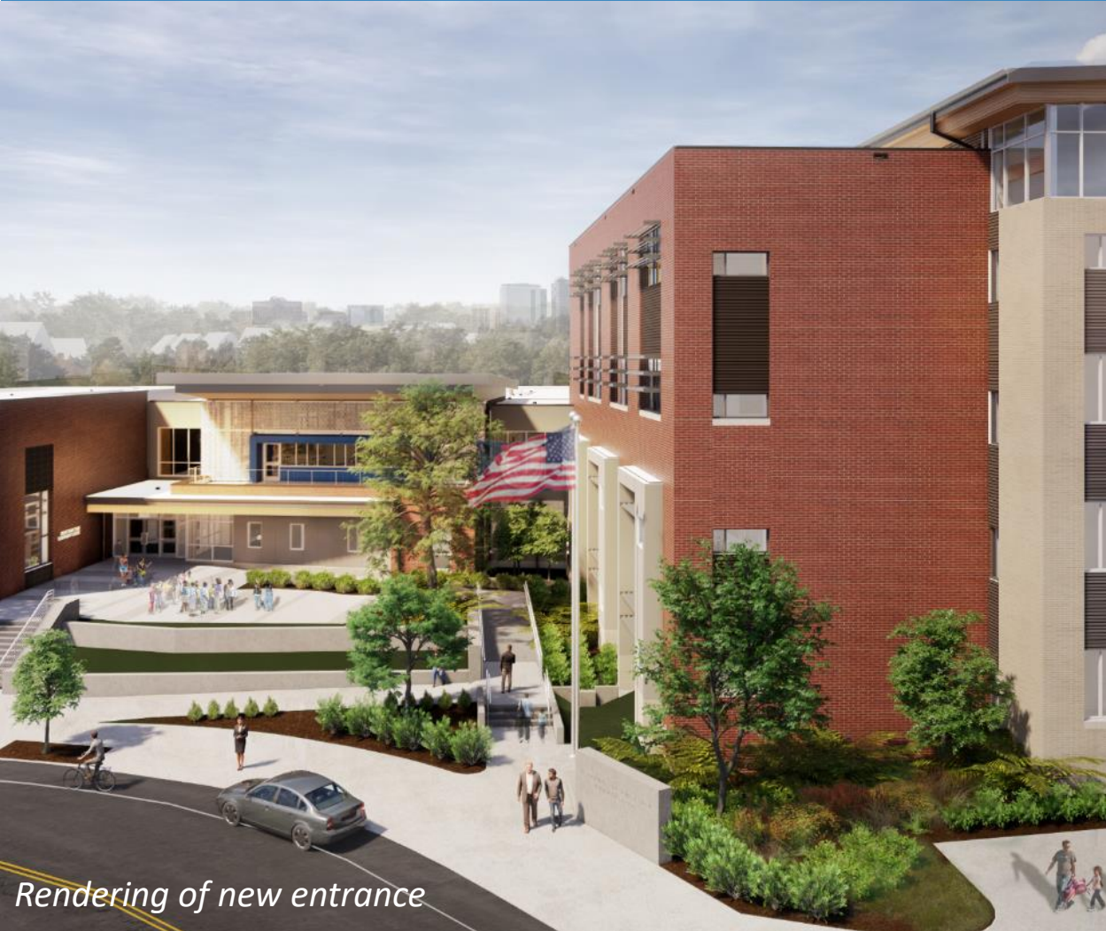
Rendering of new entrance