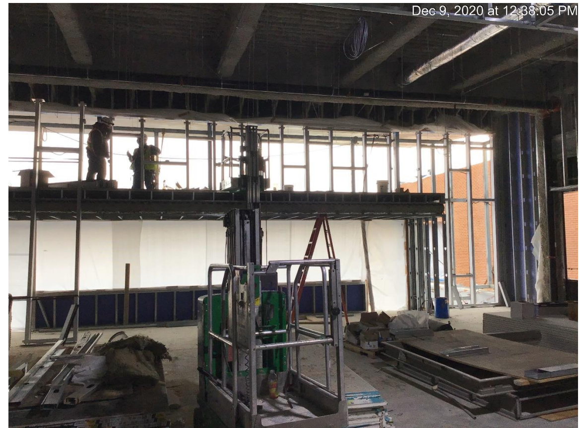
View of the Cafeteria storefront