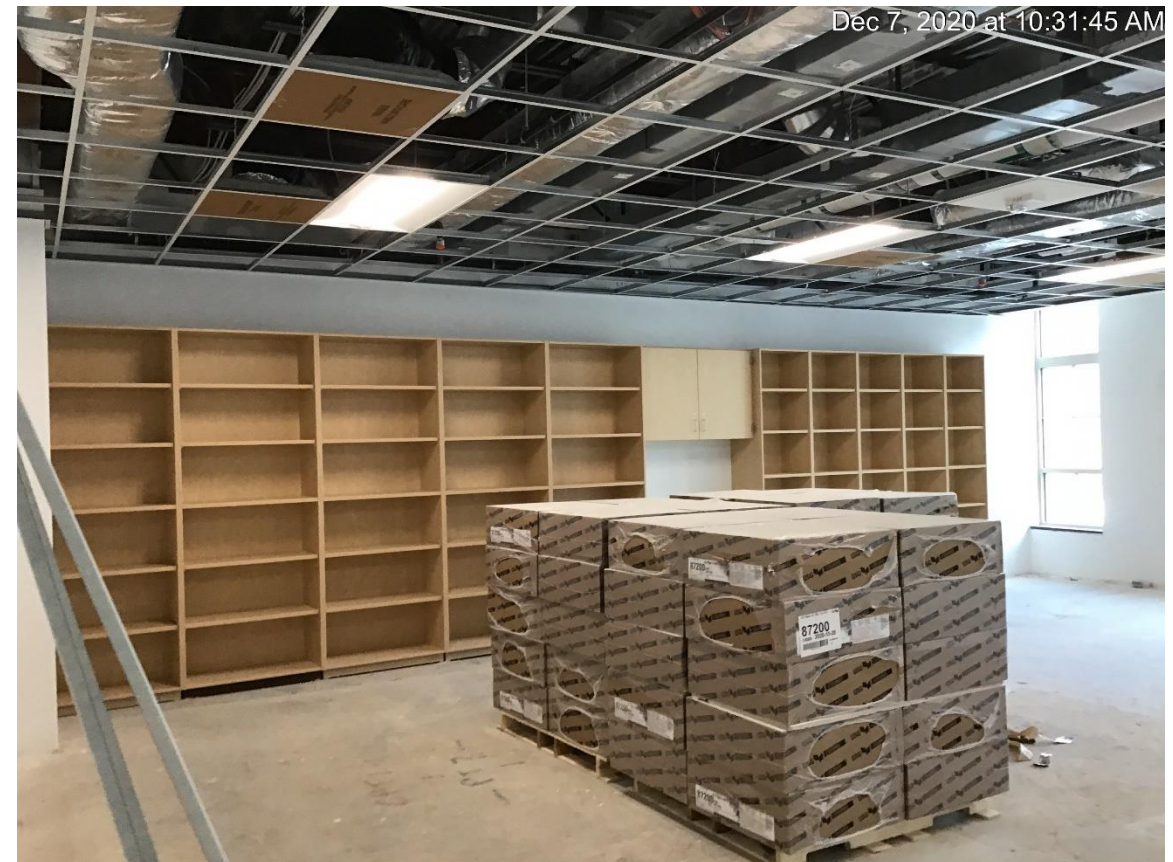
Musical instrument storage in music rooms