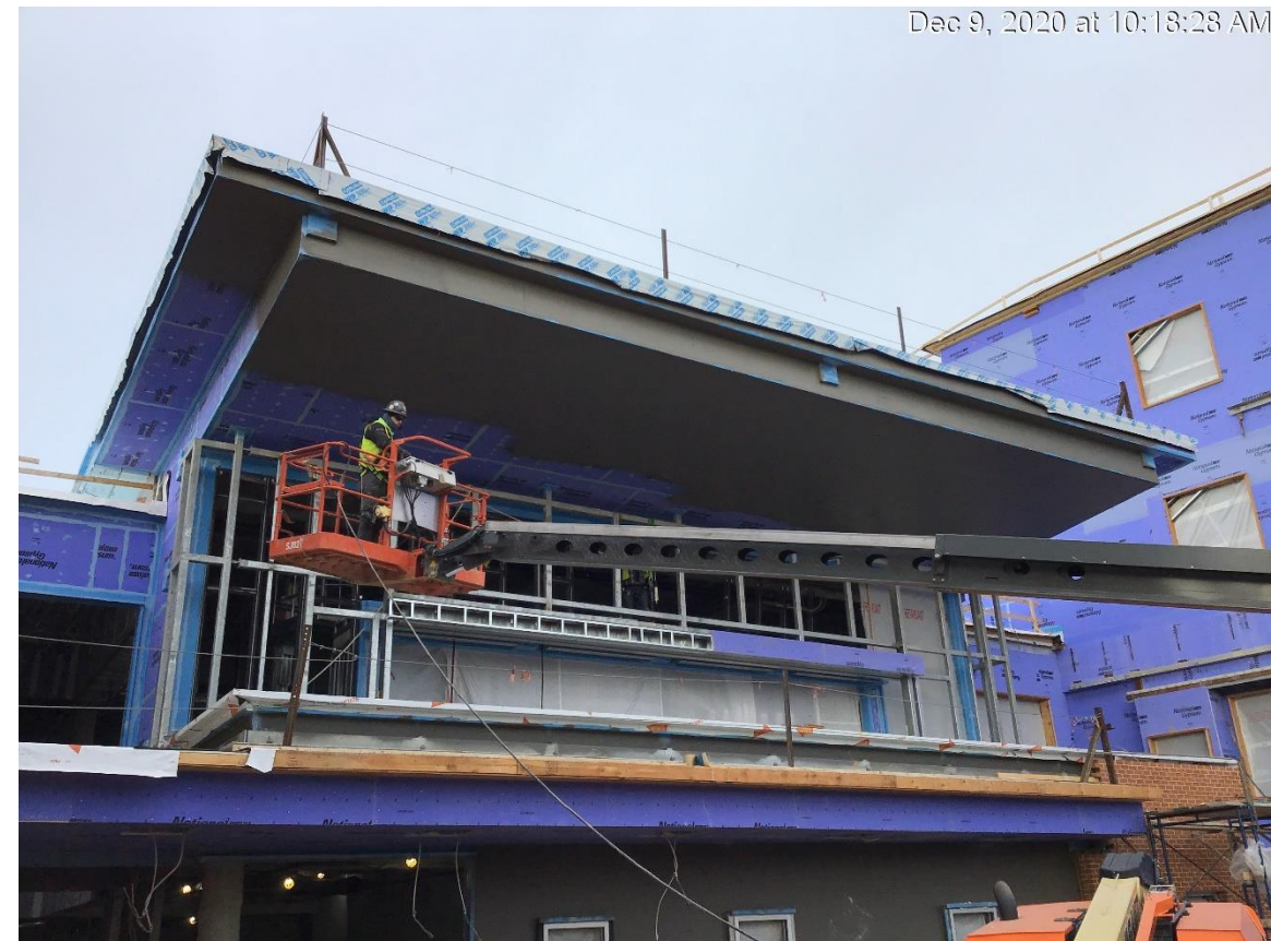
View of Cafeteria terrace