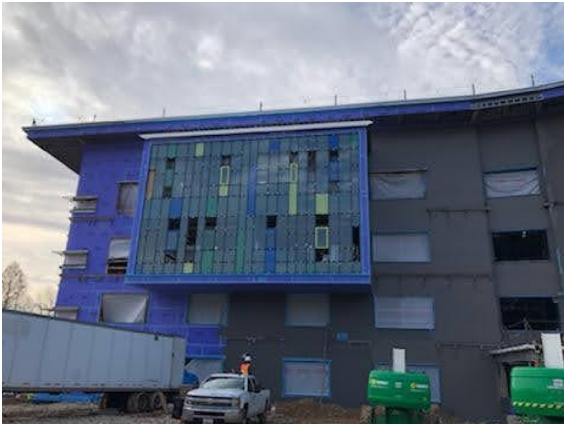
View from field