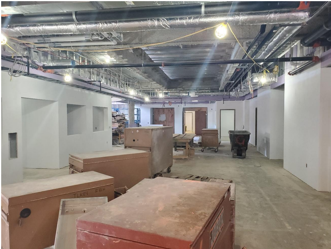
Main entrance lobby