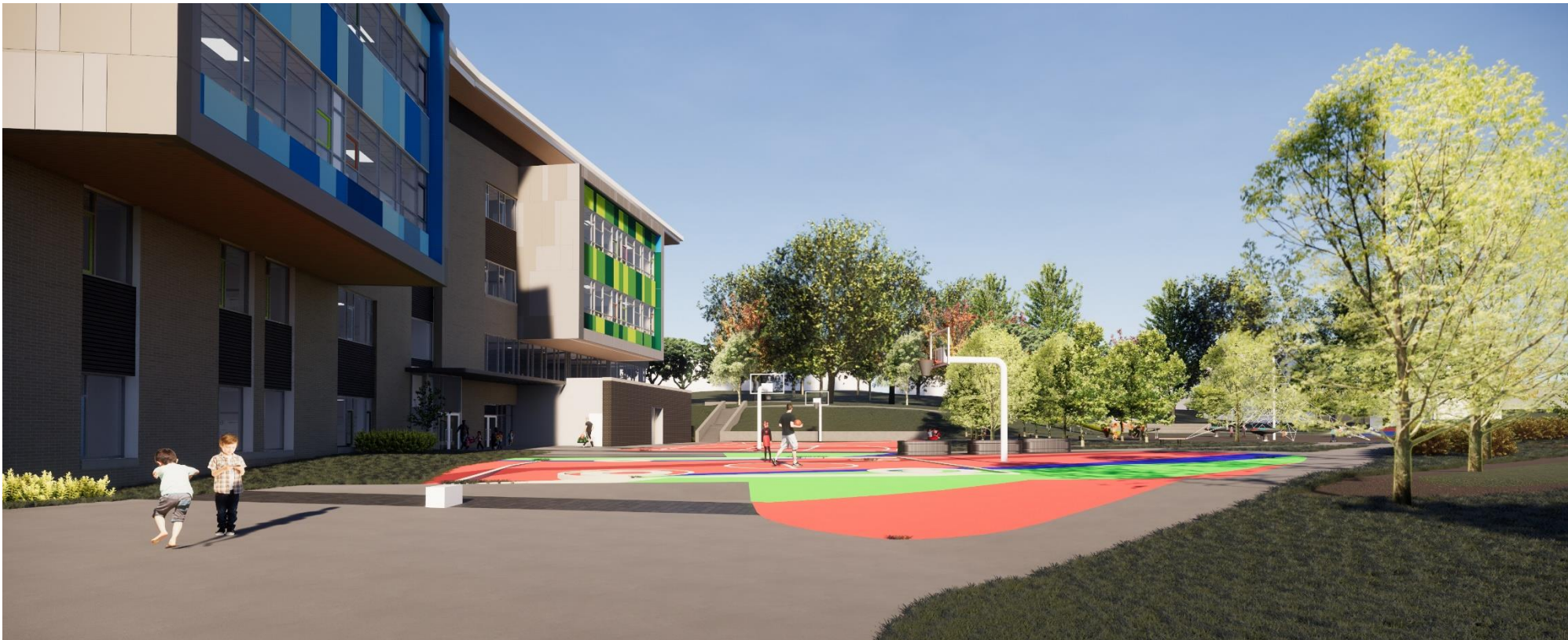
View of the outdoor playing areas which is also emergency vehicle access