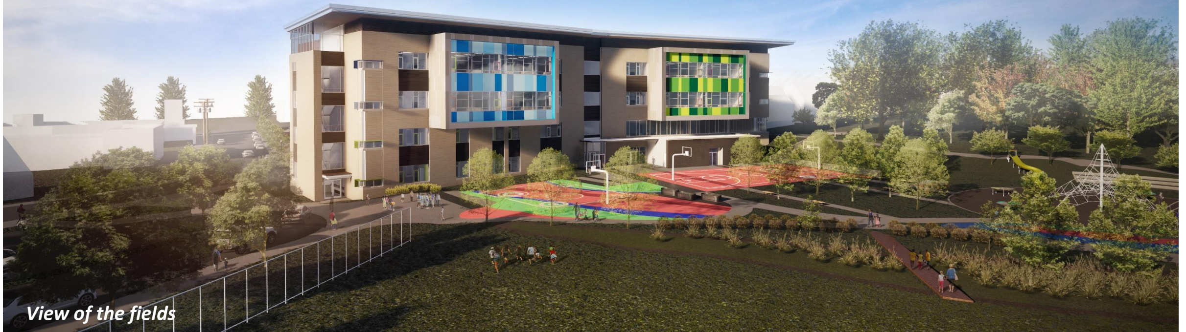
View of the fields

A view of the fields in the foreground. This is mainly the area that will be unavailable due to the Phase 2 Stormwater Construction