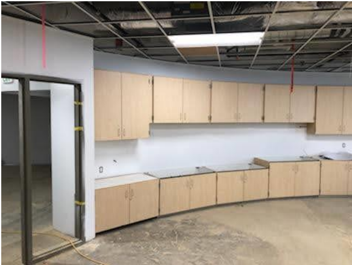
First floor art classroom