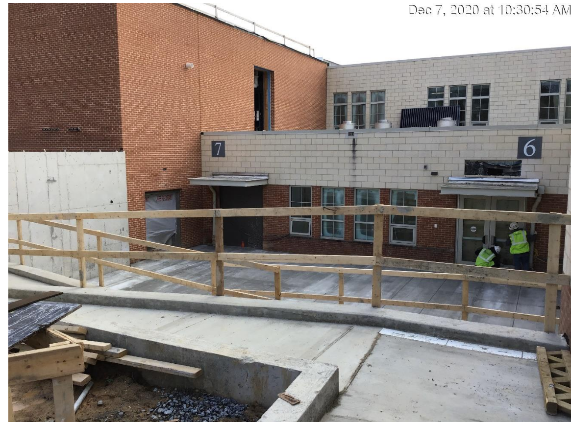
First floor art terrace with new ramps