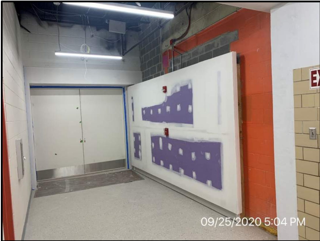
View of new connection between new and existing parts of the school