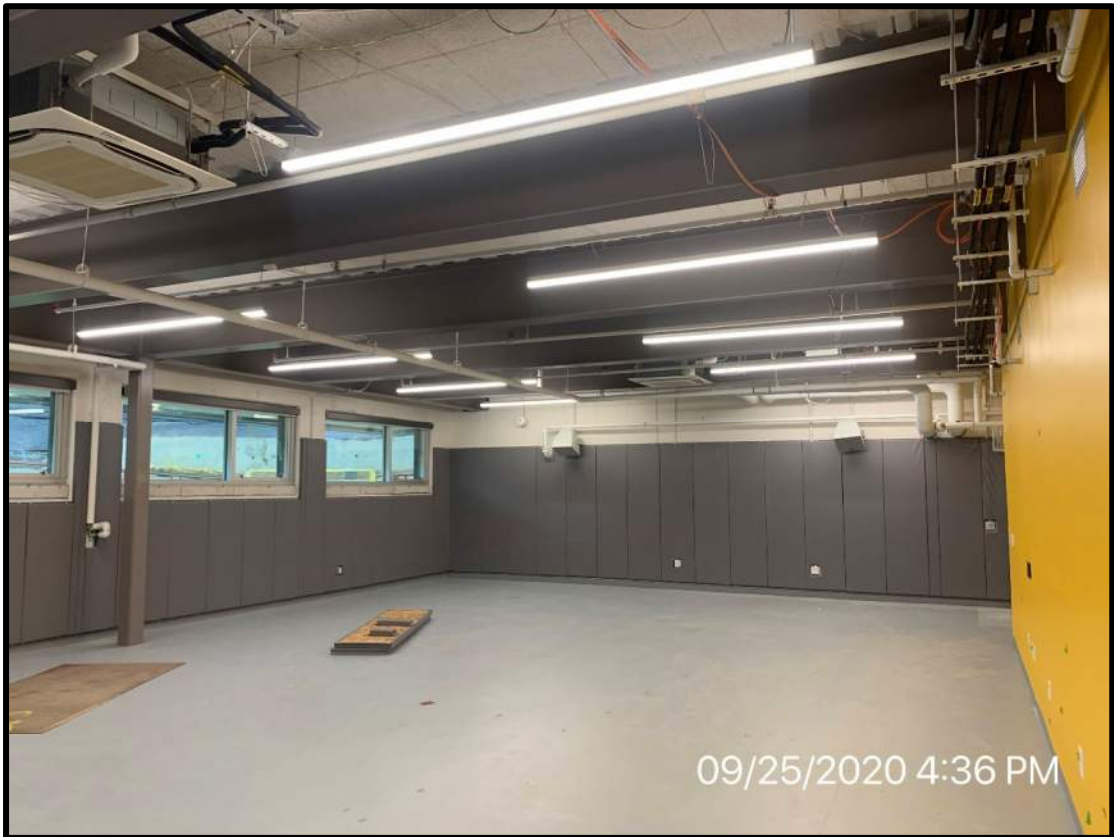
View of new health room on first floor