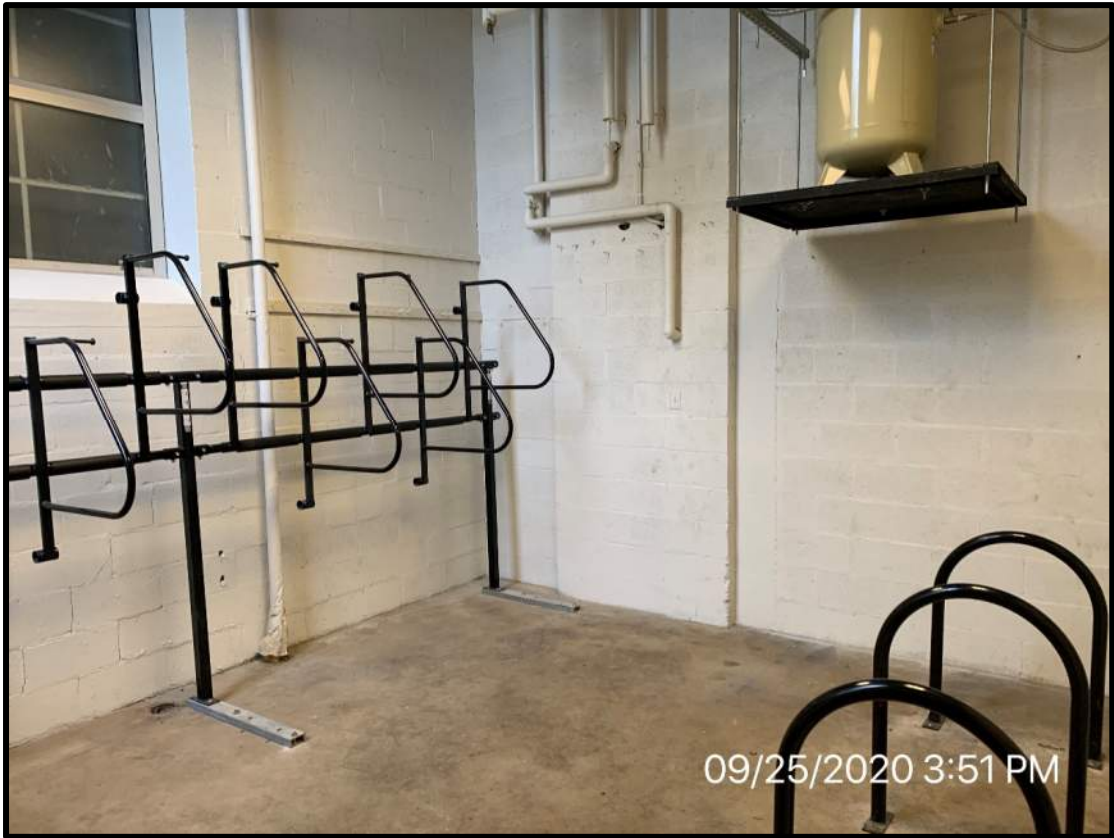
View of new bicycle storage room for teachers