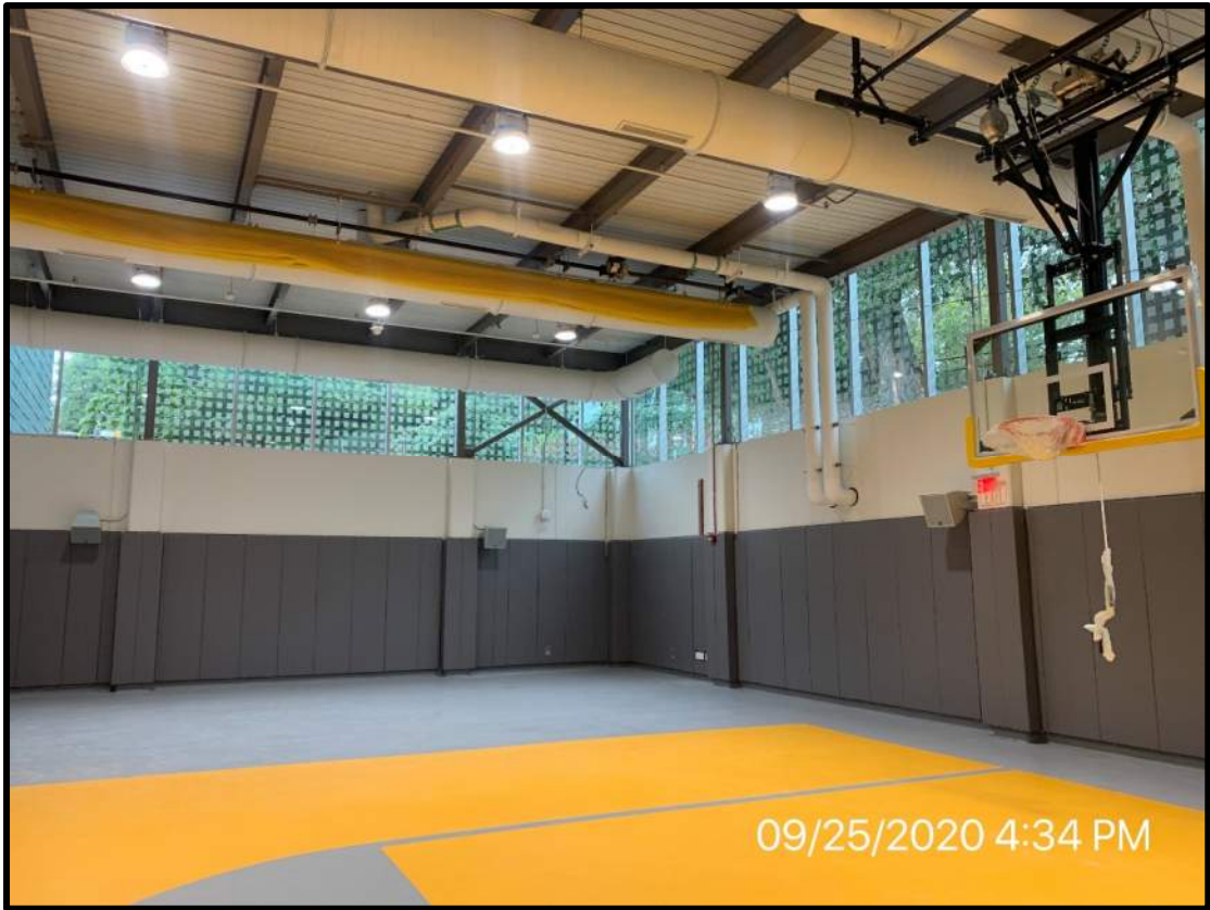
View of new auxiliary gym area