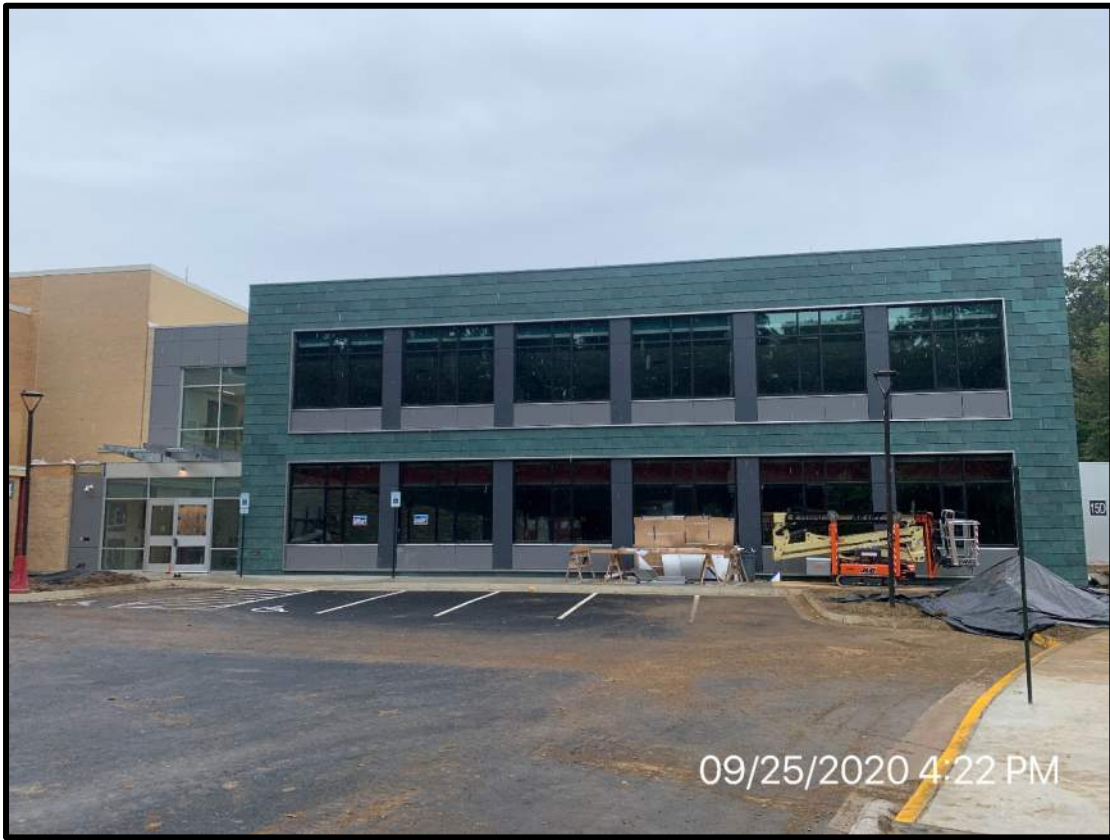
View of the front of the school addition