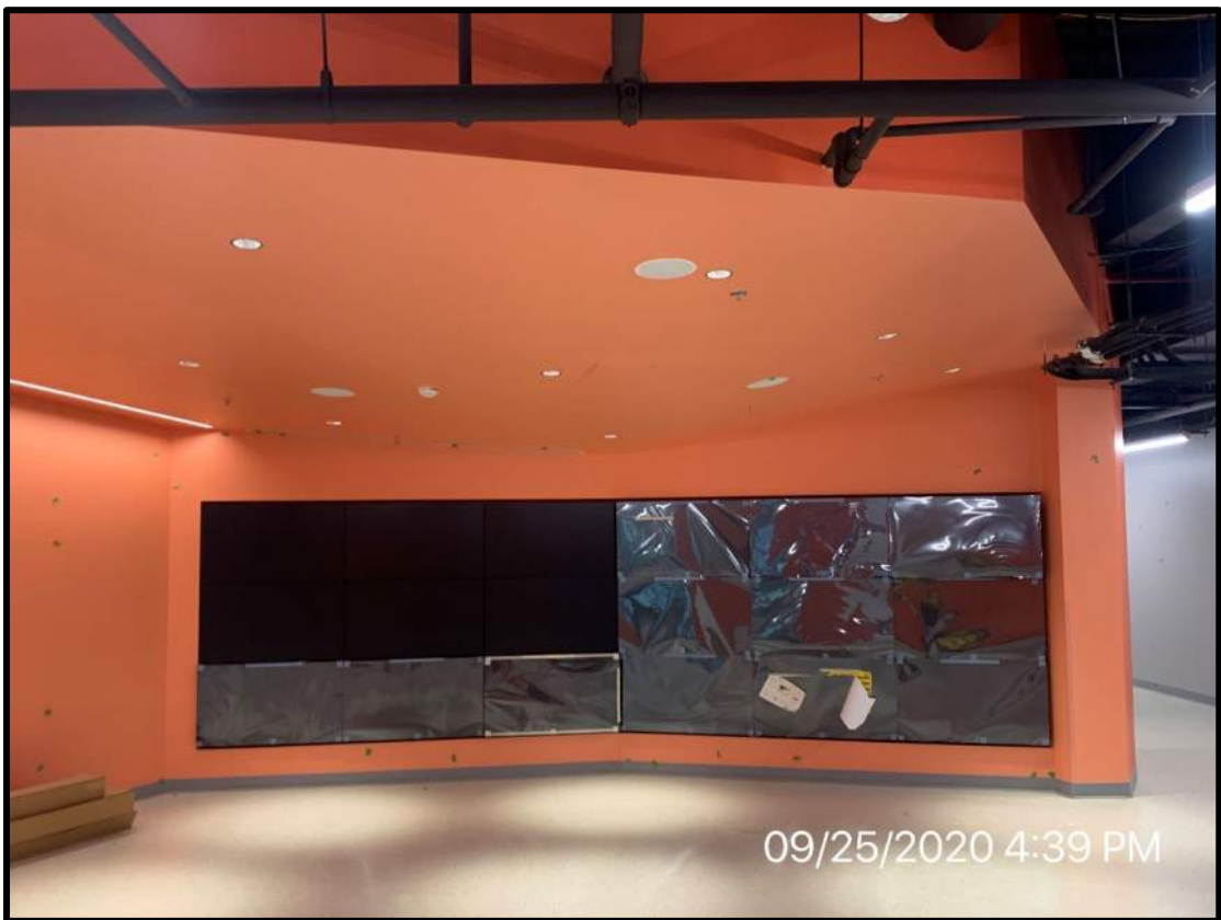
View of new student commons area