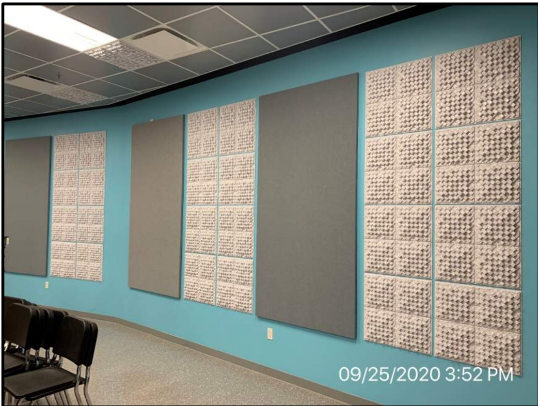
Installation of new acoustic panels in the orchestra/vocal room