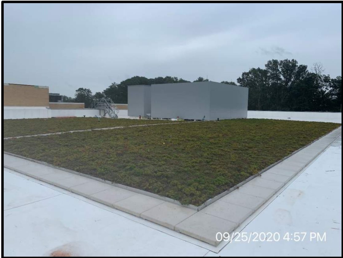
View of new roof and rainscreen installation