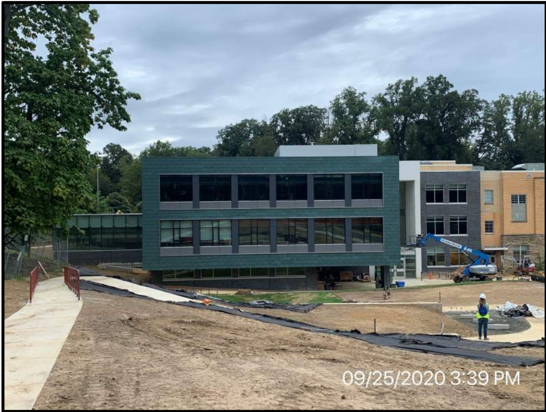
View of the south elevation of the addition