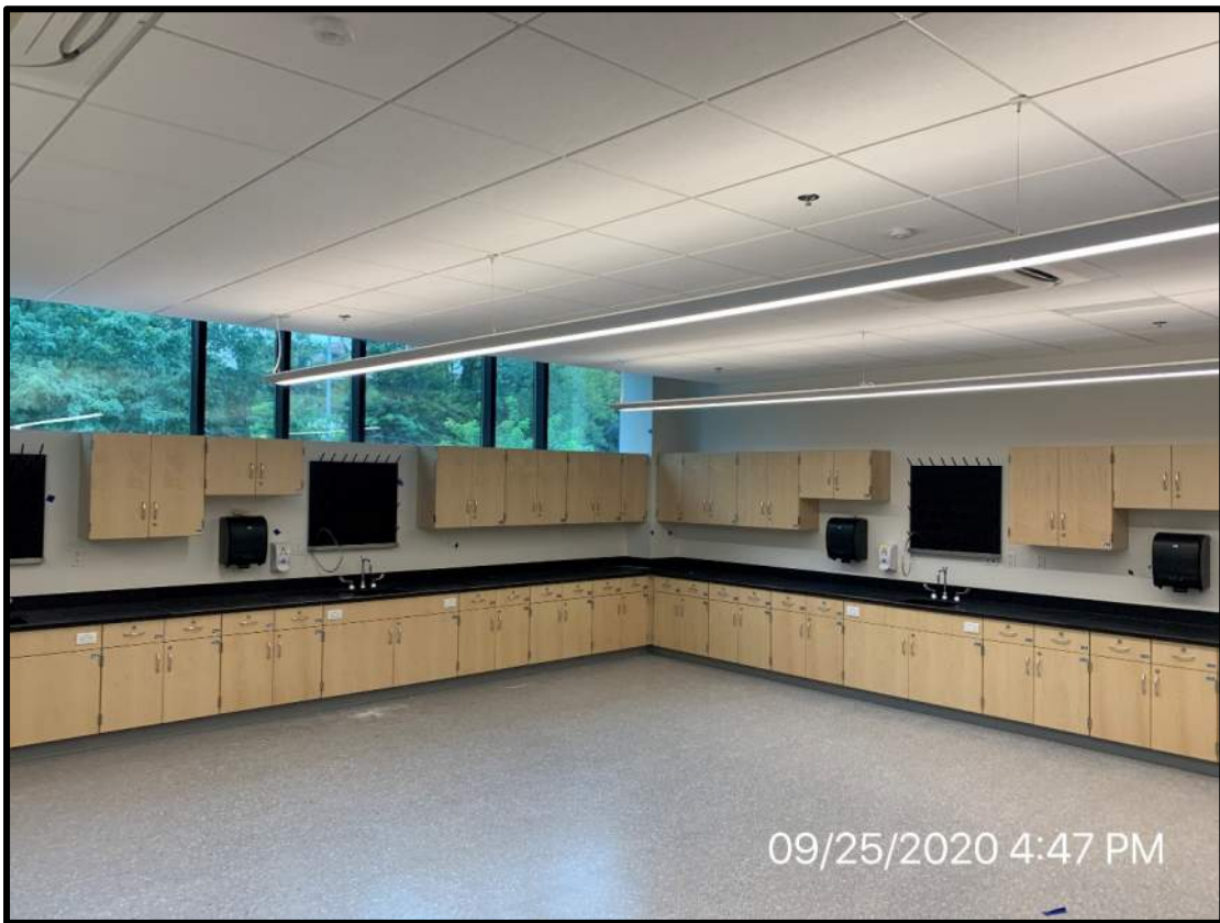
View of science classroom