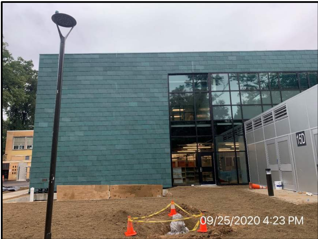
View of the west elevation of the addition