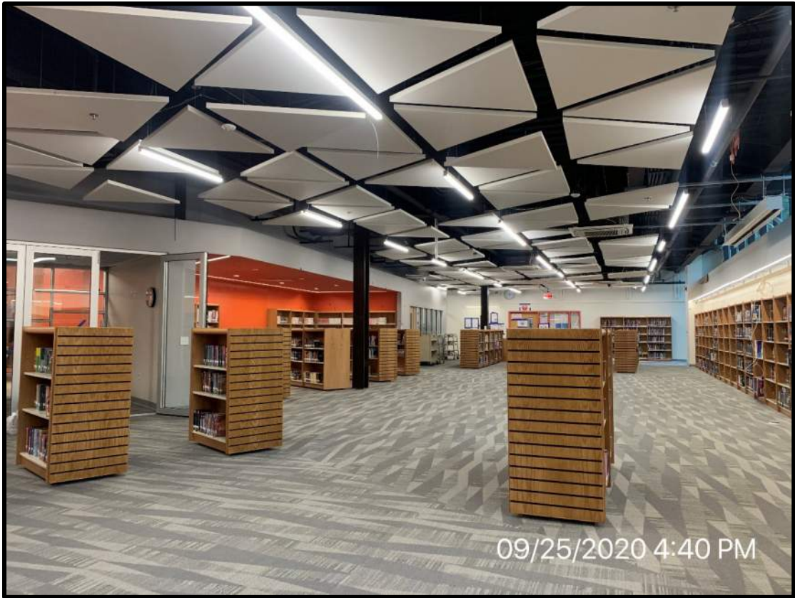
View of new library space