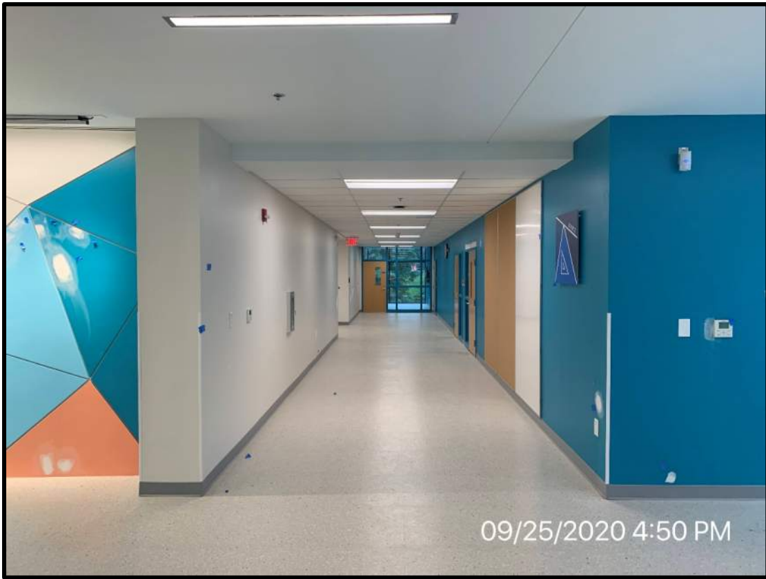
View of third floor corridor