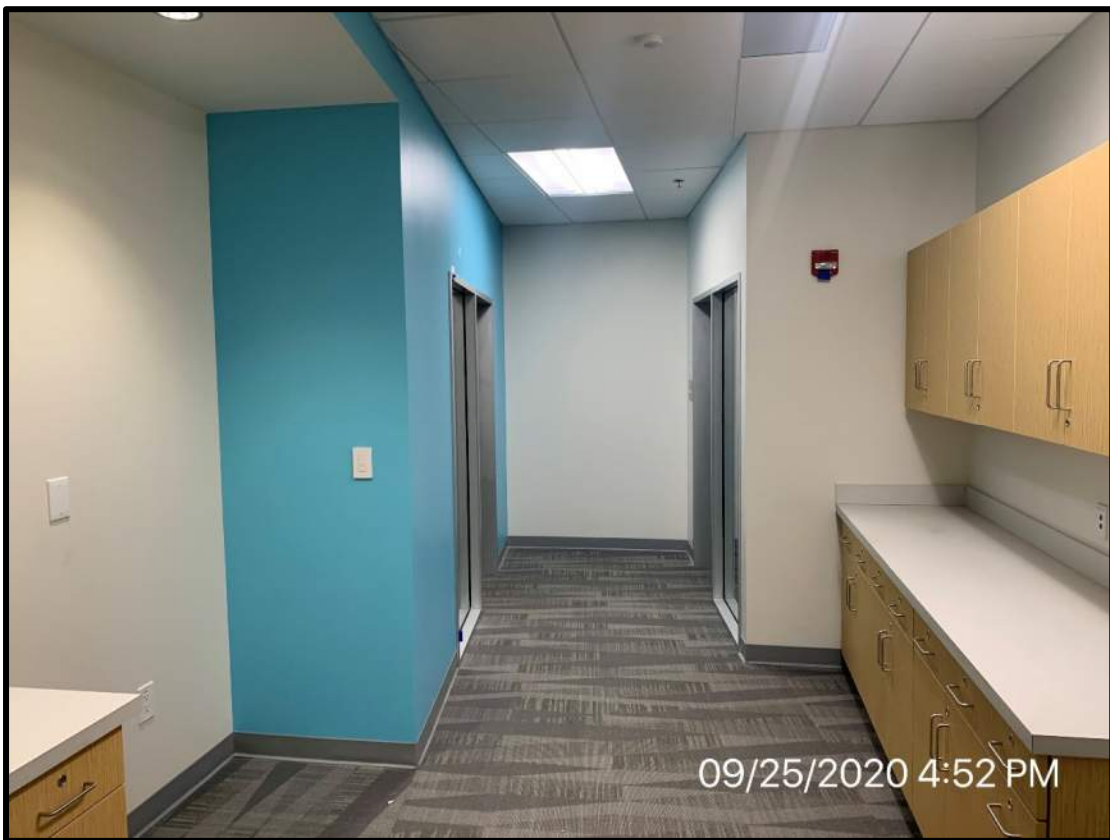
View of teacher preparation room