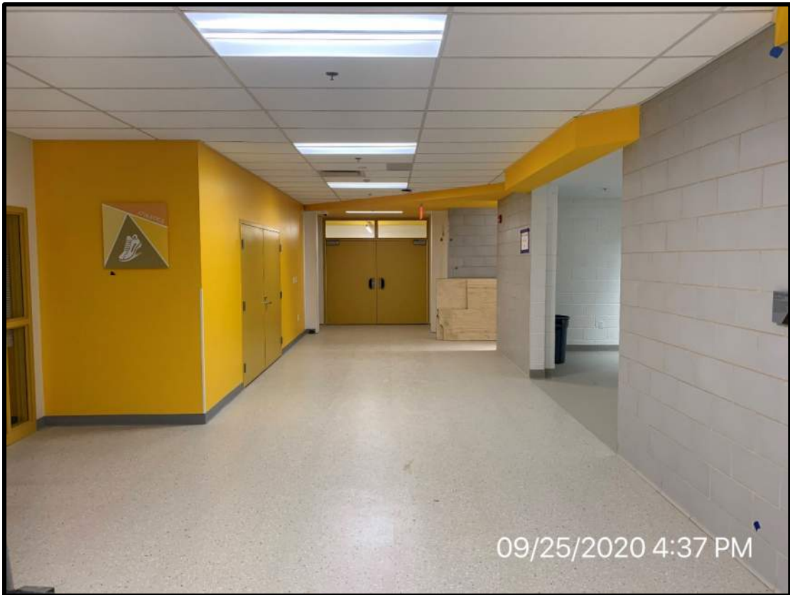
View of first floor main corridor