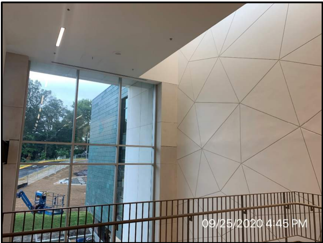
View of third floor corridor at monumental stair top