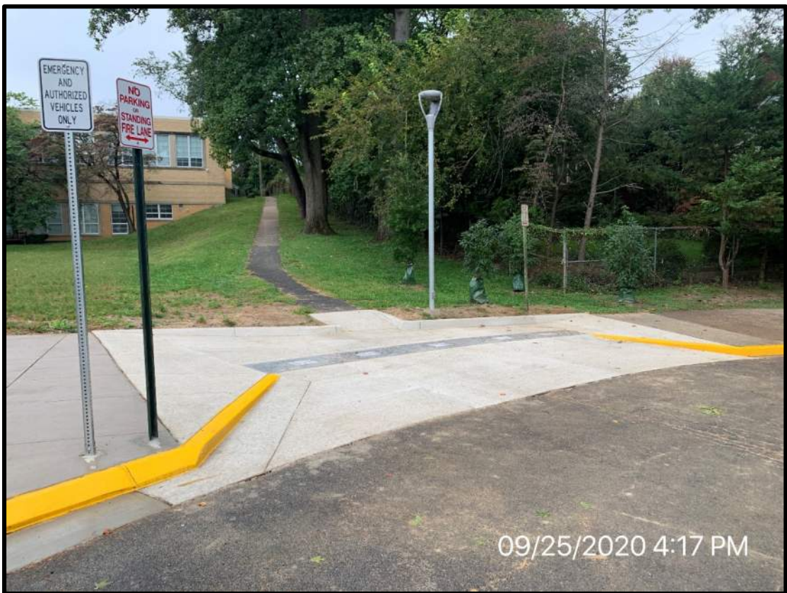
View of new ADA ramp at main entrance to school