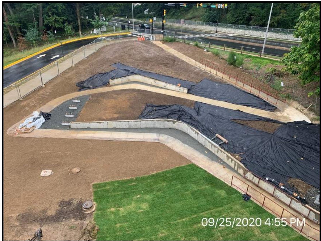
View of historical trail sidewalk installation