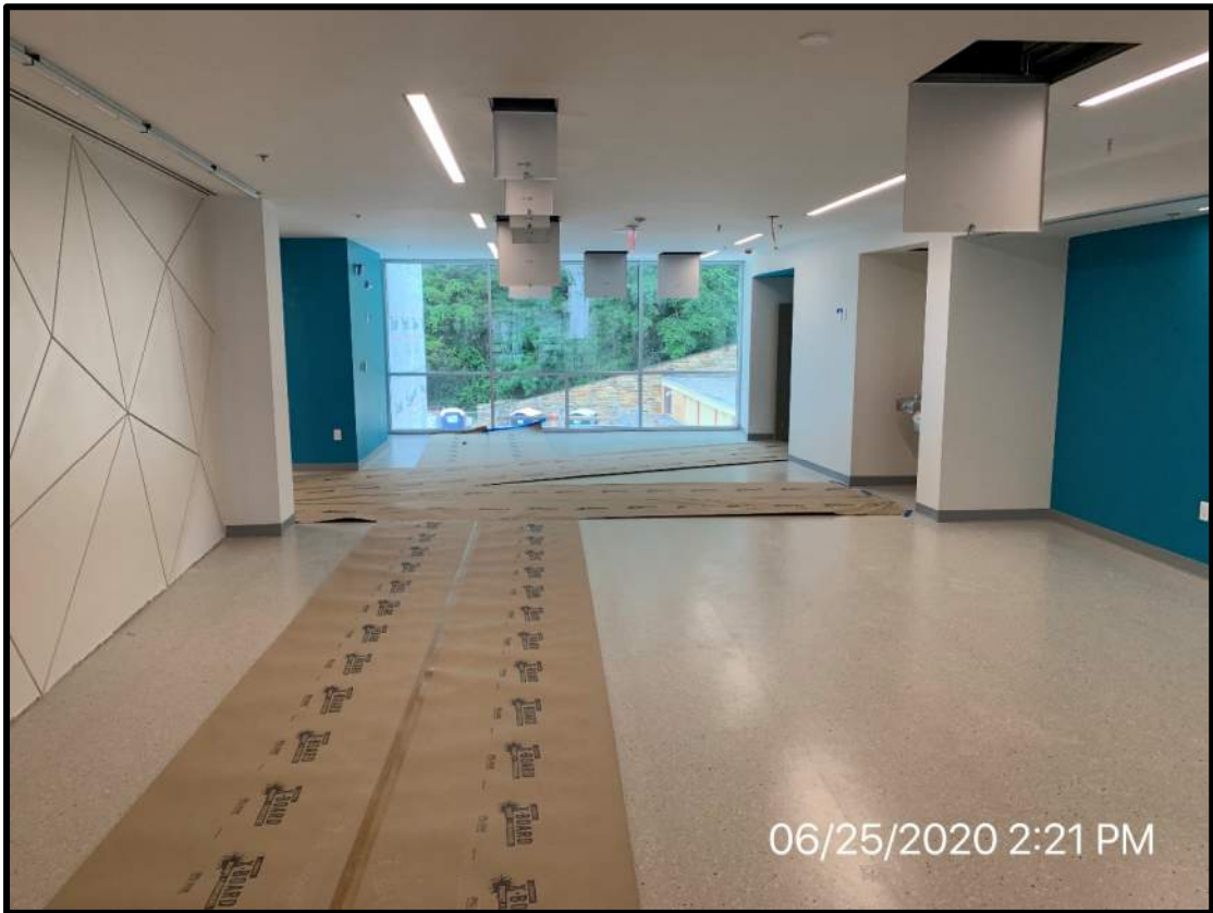
View of third floor corridor at monumental stair top and connection to existing school