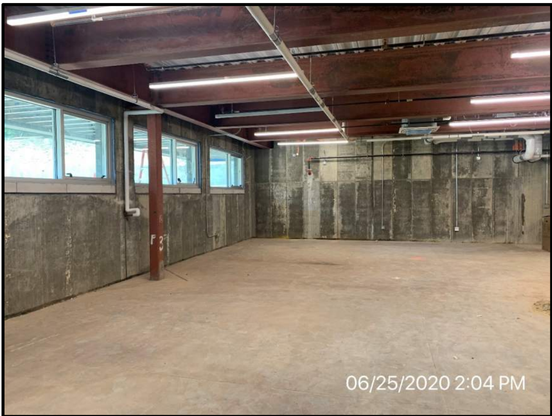
View of new health room on first floor