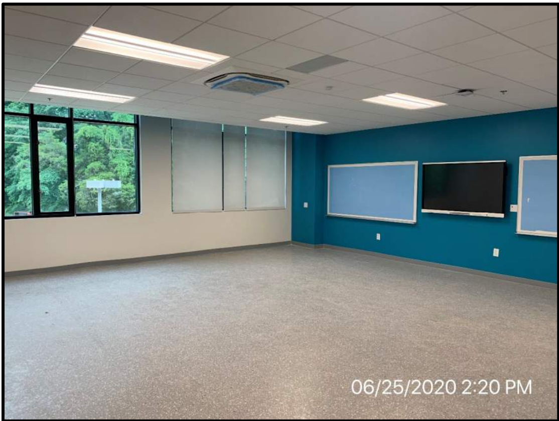
View of mockup classroom