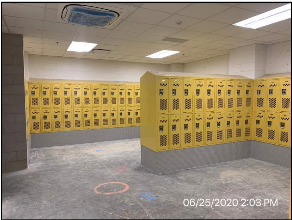
View of new locker rooms (typical)