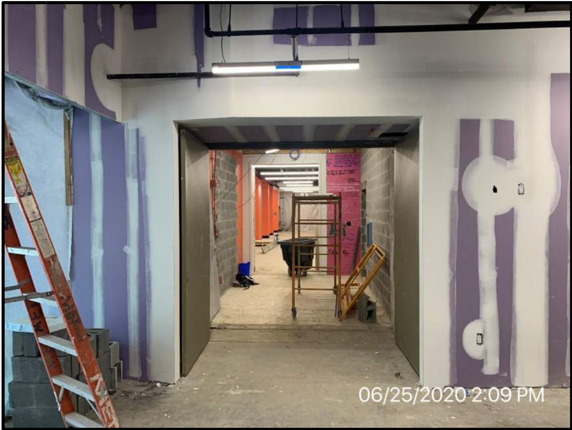
View of new connection between new and existing parts of the school