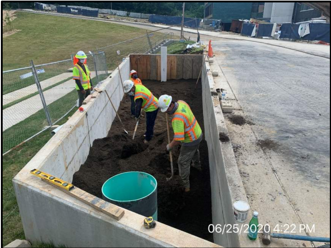
Bio pond installation ongoing