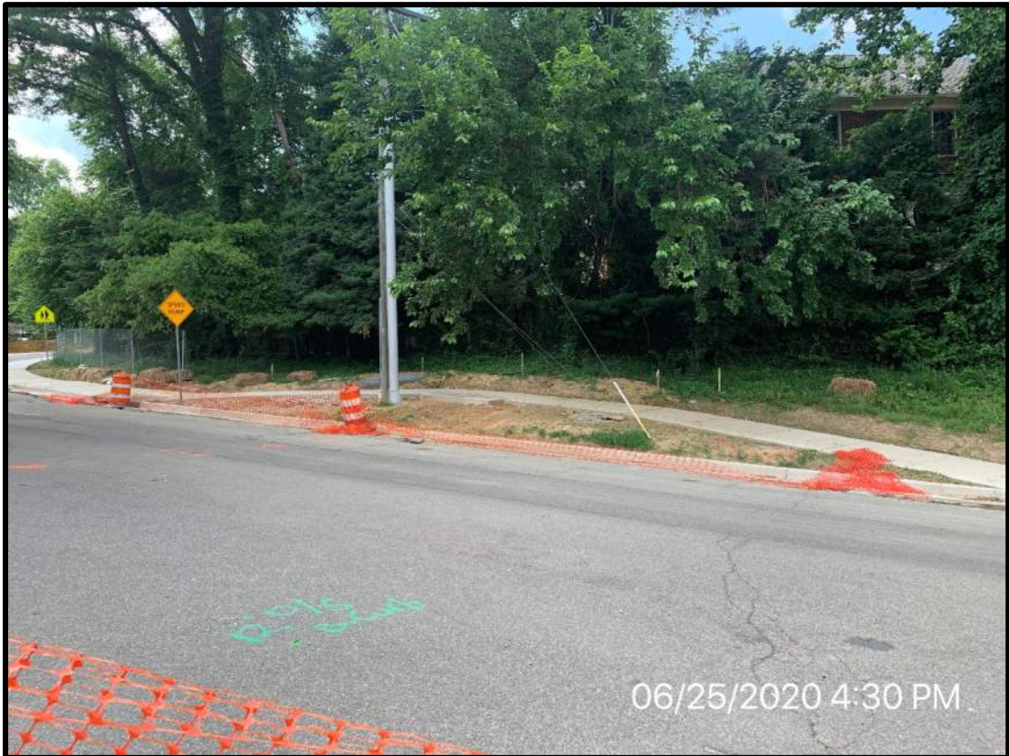
Exterior work along vacation lane ongoing