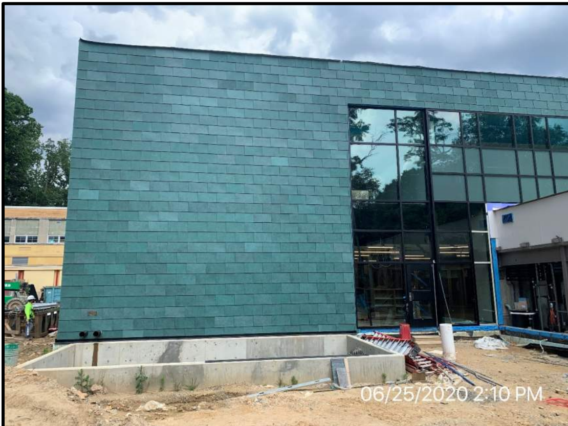
View of the west elevation of the addition