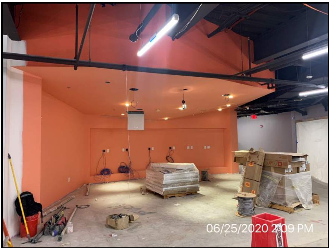
View of new student commons area