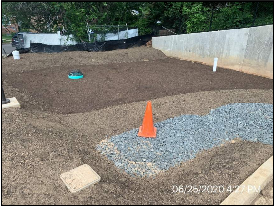
Bio pond installation ongoing