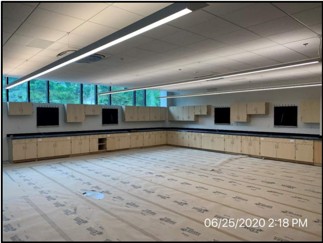
View of new science classroom