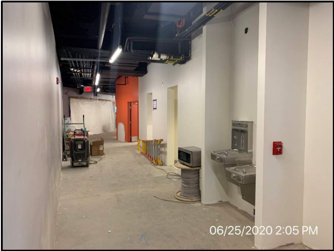
View of second floor corridor looking North