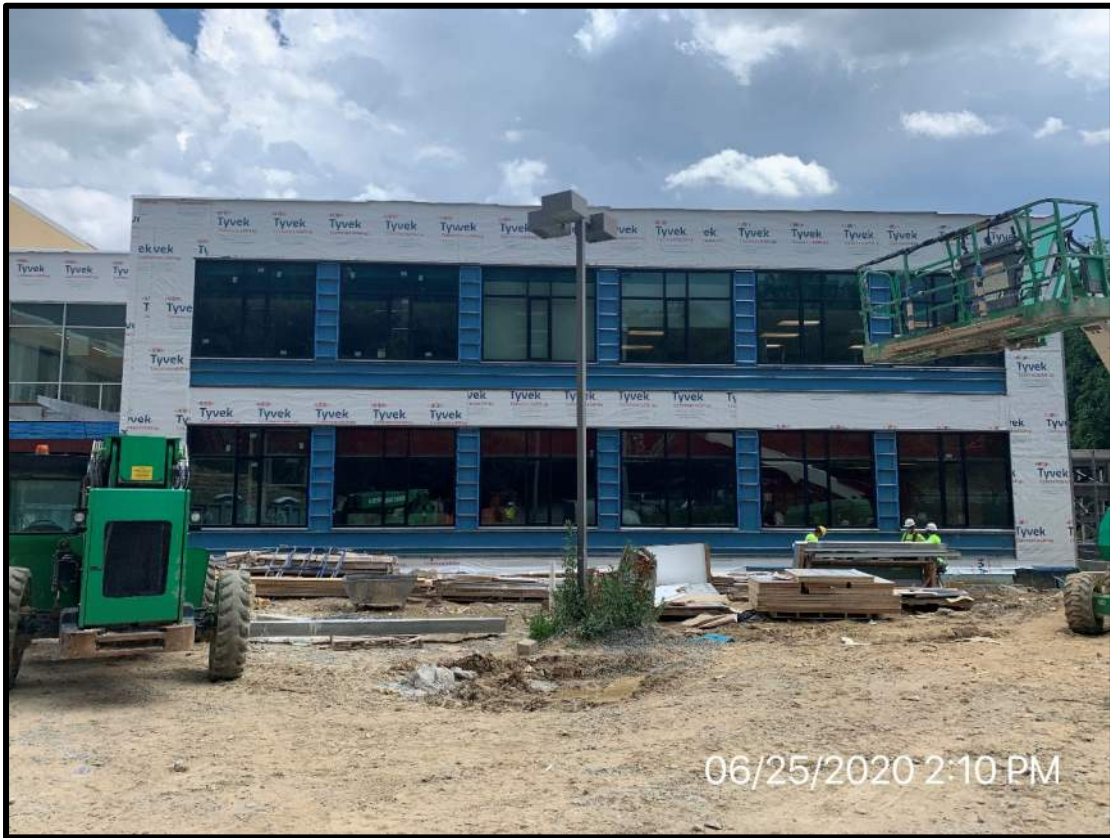
View of the front of the school addition