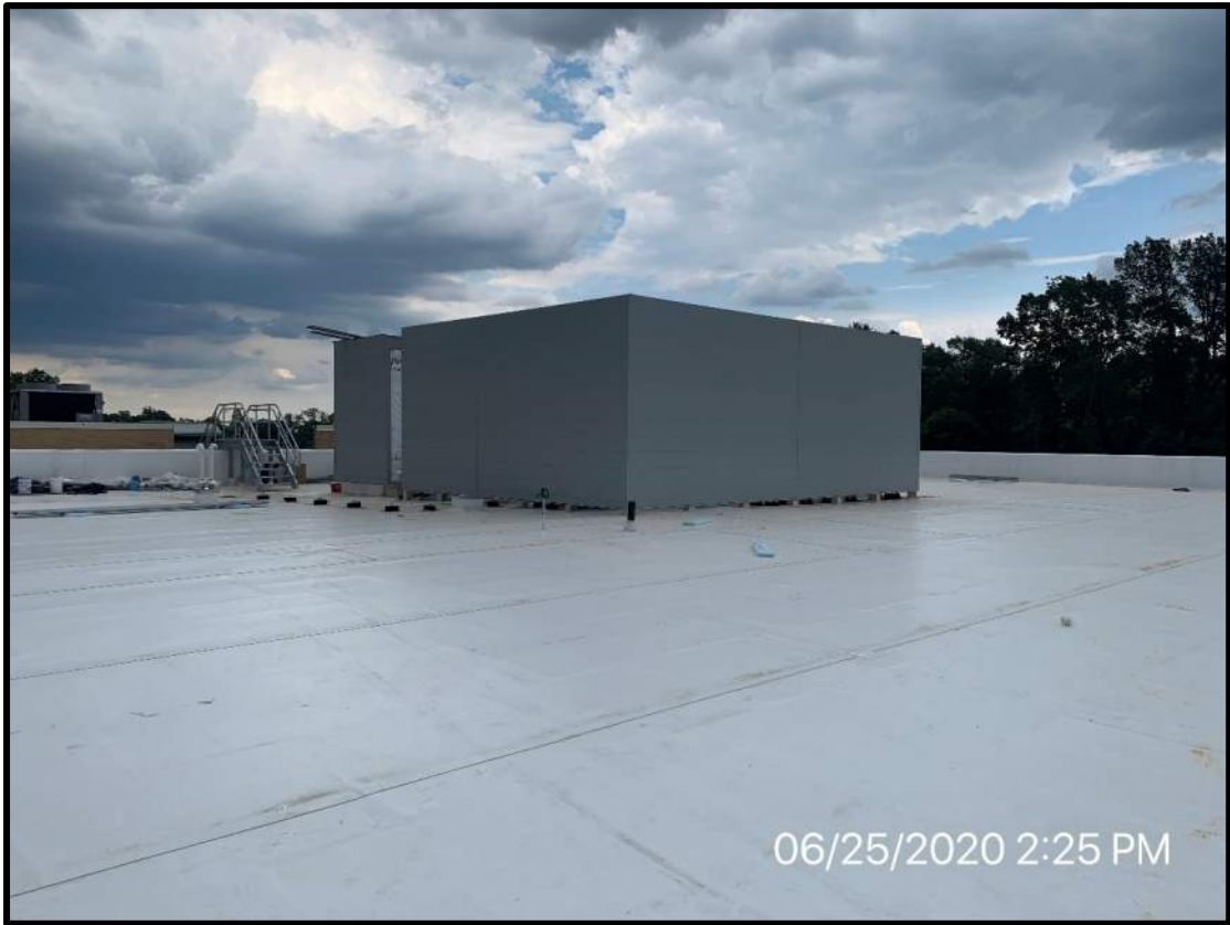
View of new roof and rainscreen installation