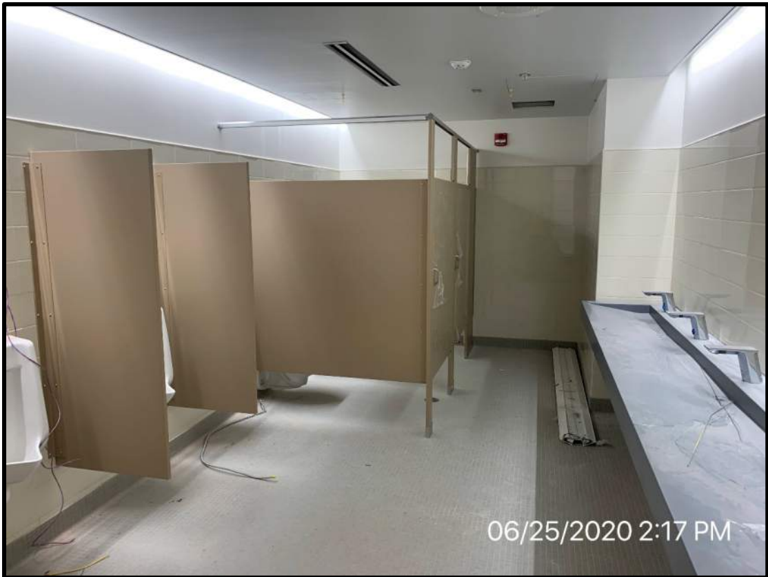
View of new bathrooms