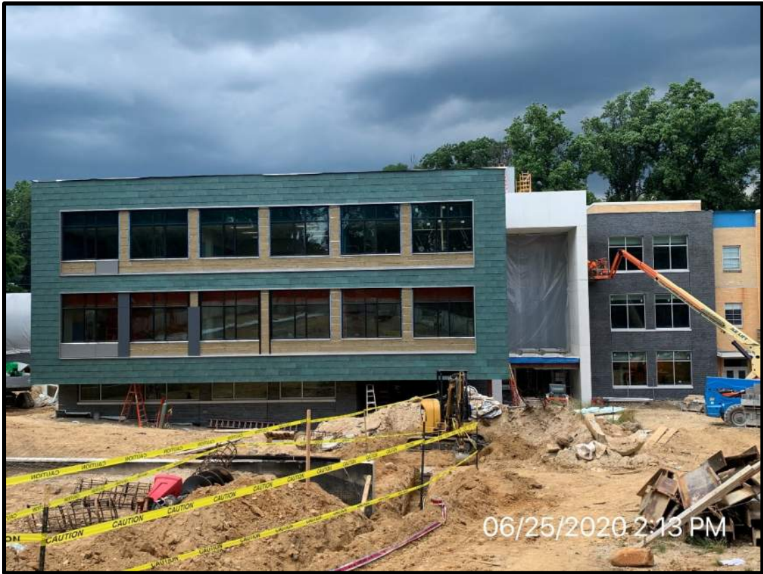
View of the south elevation of the addition