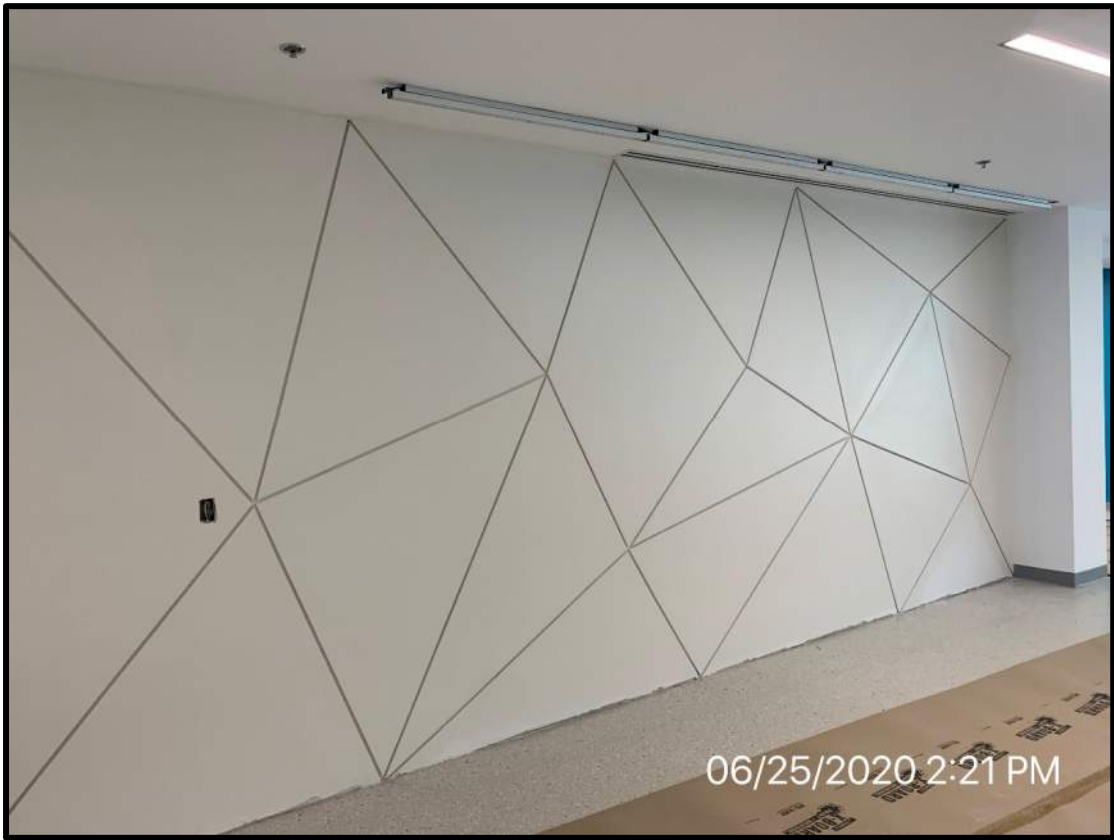
View of monumental staircase feature wall