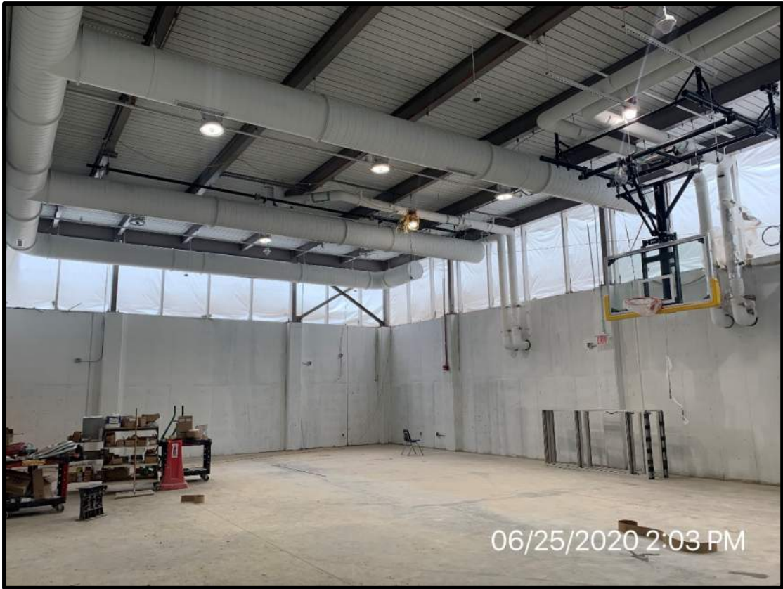
View of new auxiliary gym area