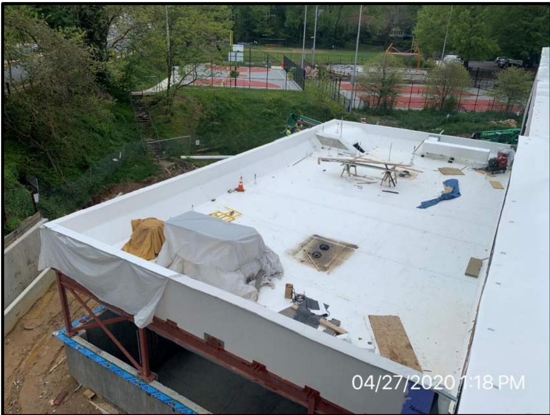
Current status of the auxiliary gym roof