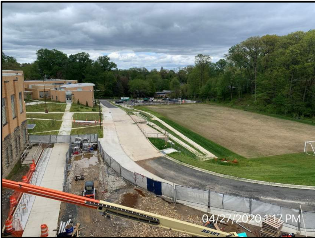
Current state of landscaping and athletic field at the rear of the school