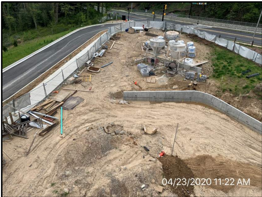
Current status of site work around new historic trail