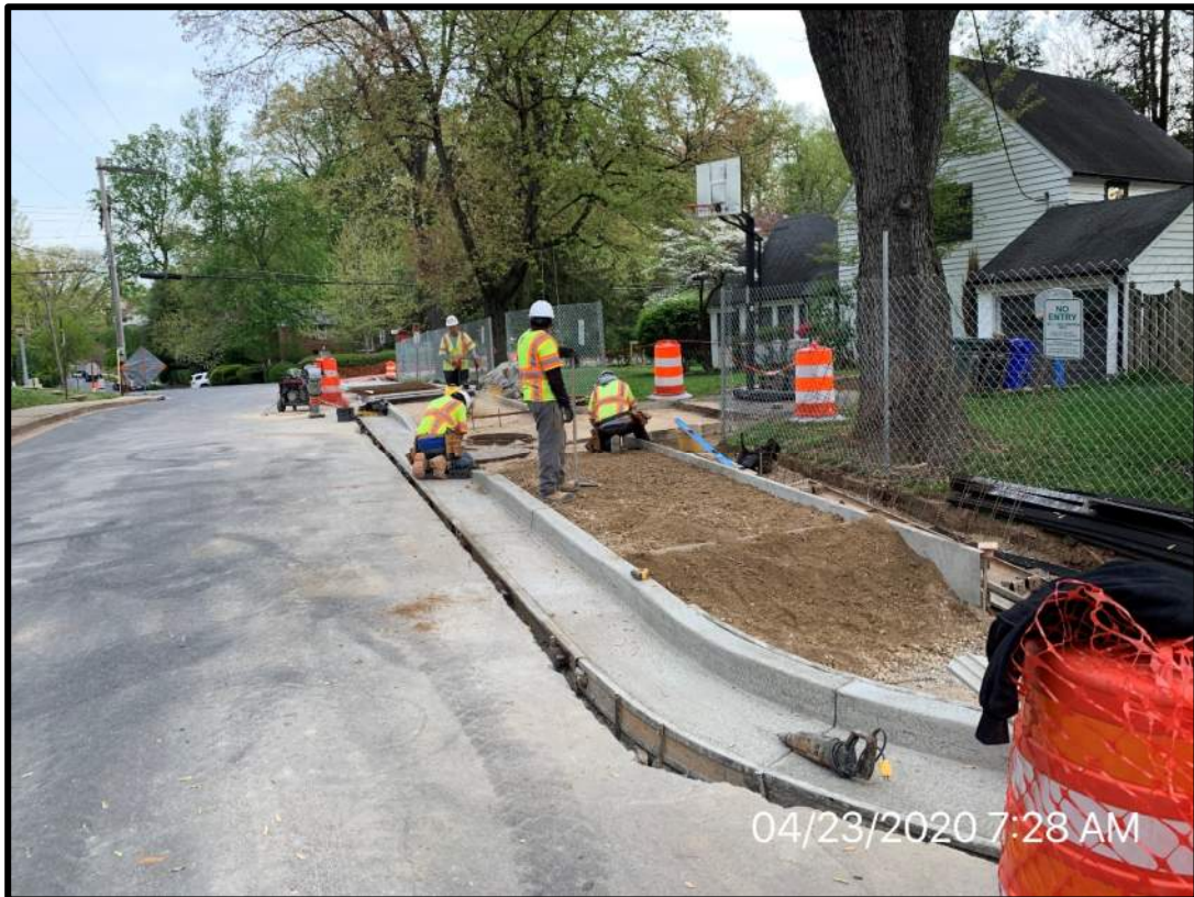
Exterior work along vacation lane ongoing