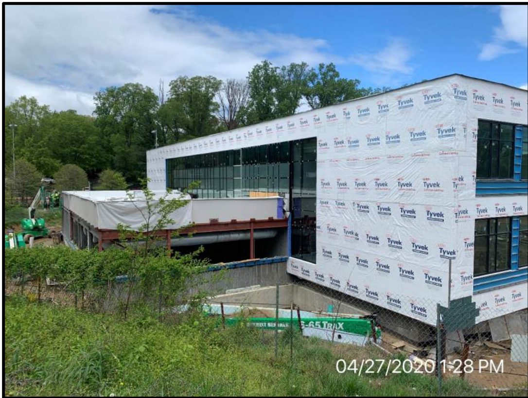
West elevation of building with curtain wall, auxiliary gym, and site works