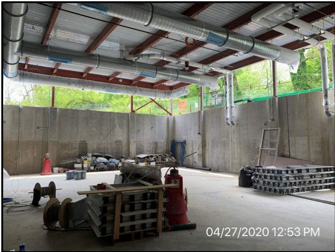
Auxiliary gym current status