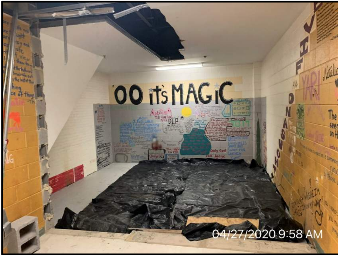
Status of new structural slab in renovation