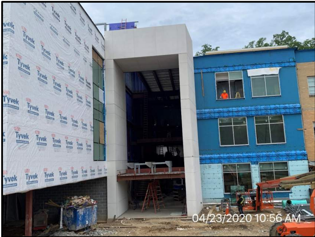
Precast concrete vestibule entrance status