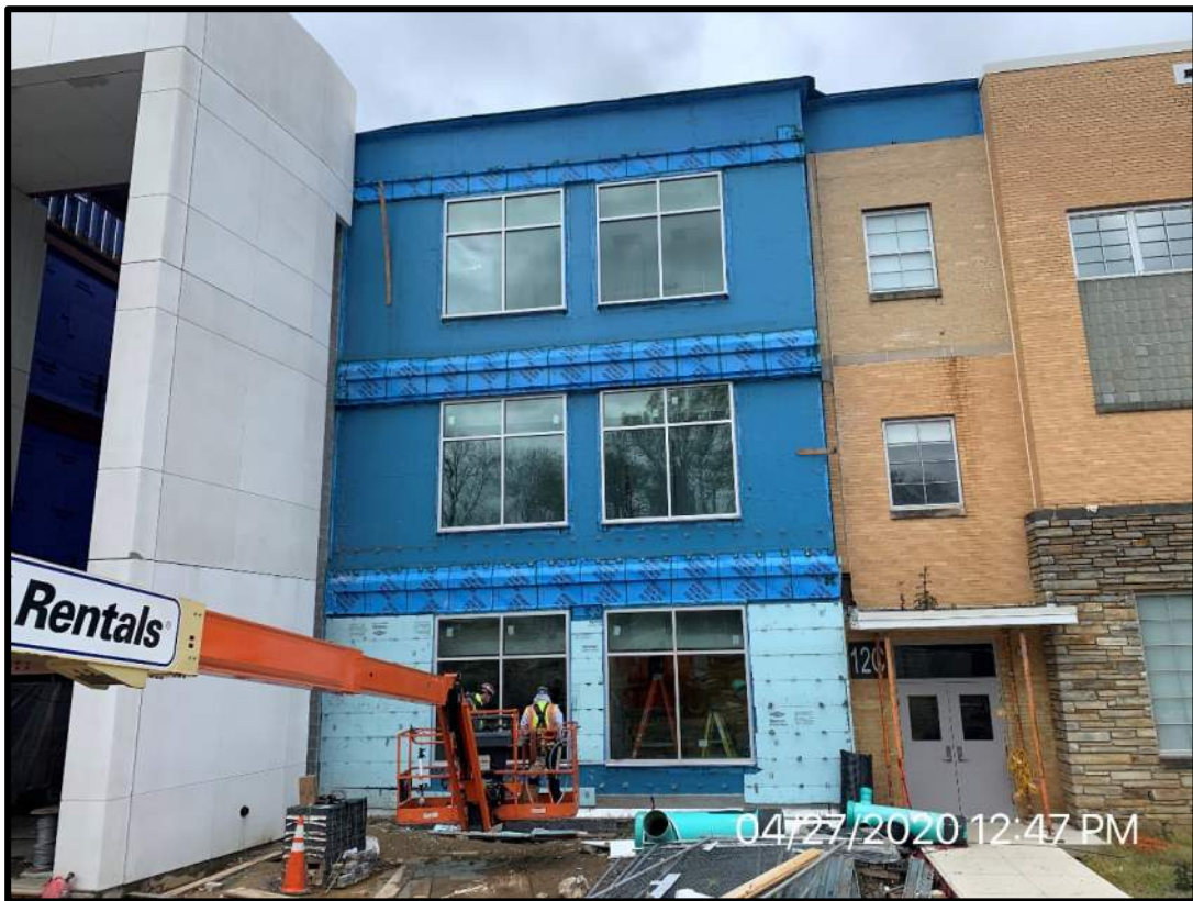
South elevation of renovation façade where new gray brick façade is to be installed