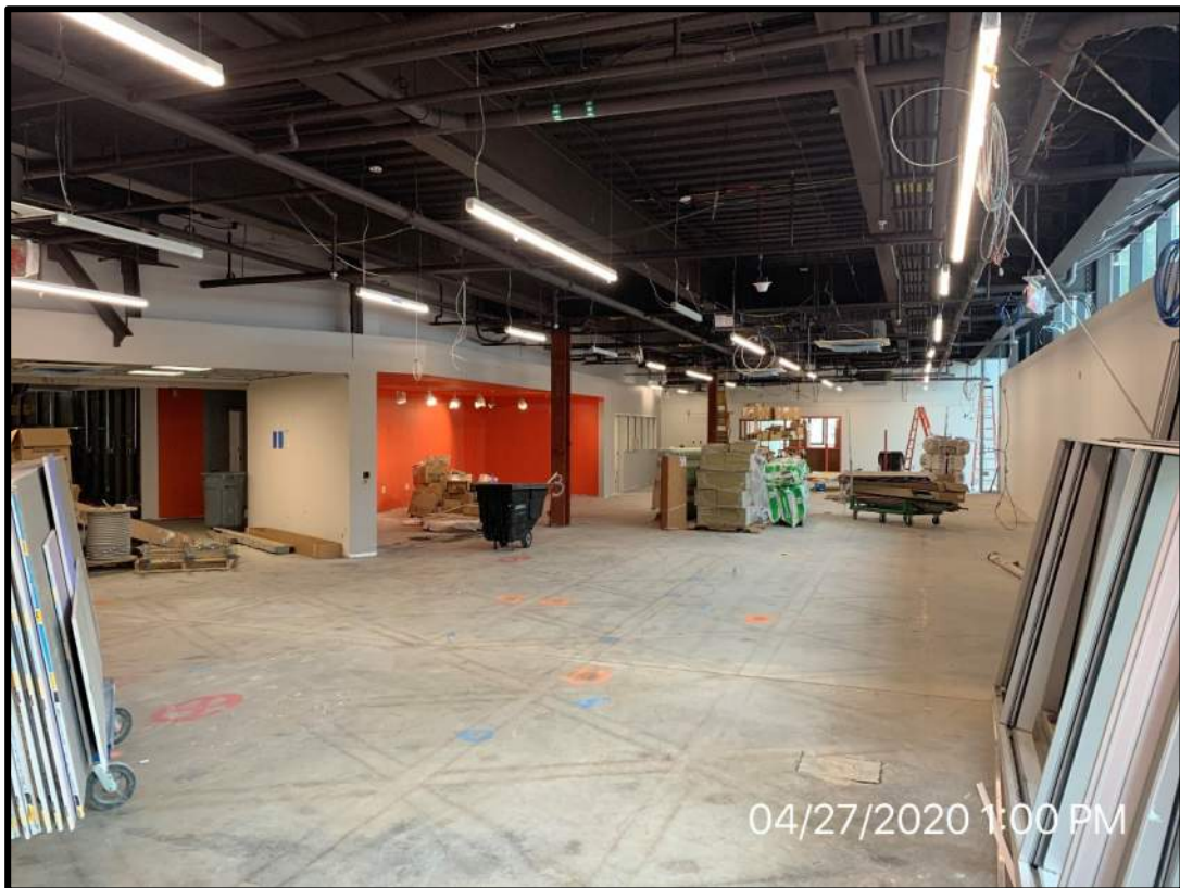
Library and library office current status