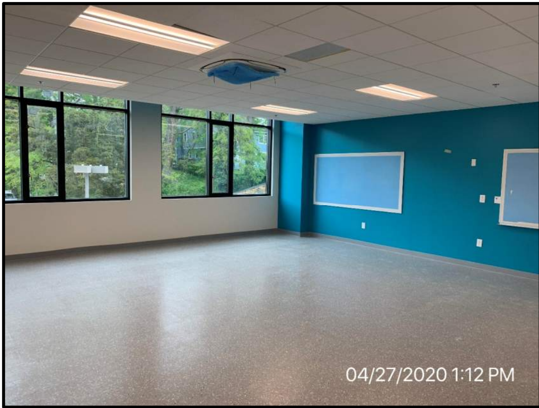
Current status of mock-up classroom