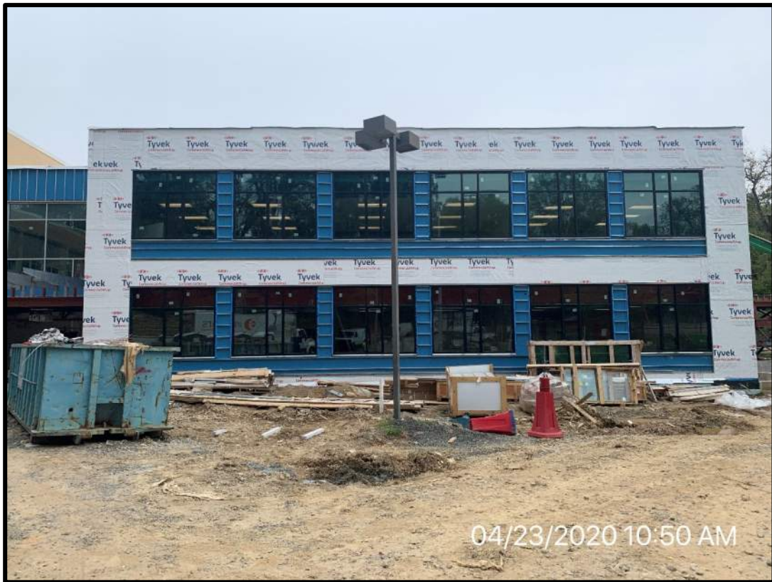
North face of the building current status