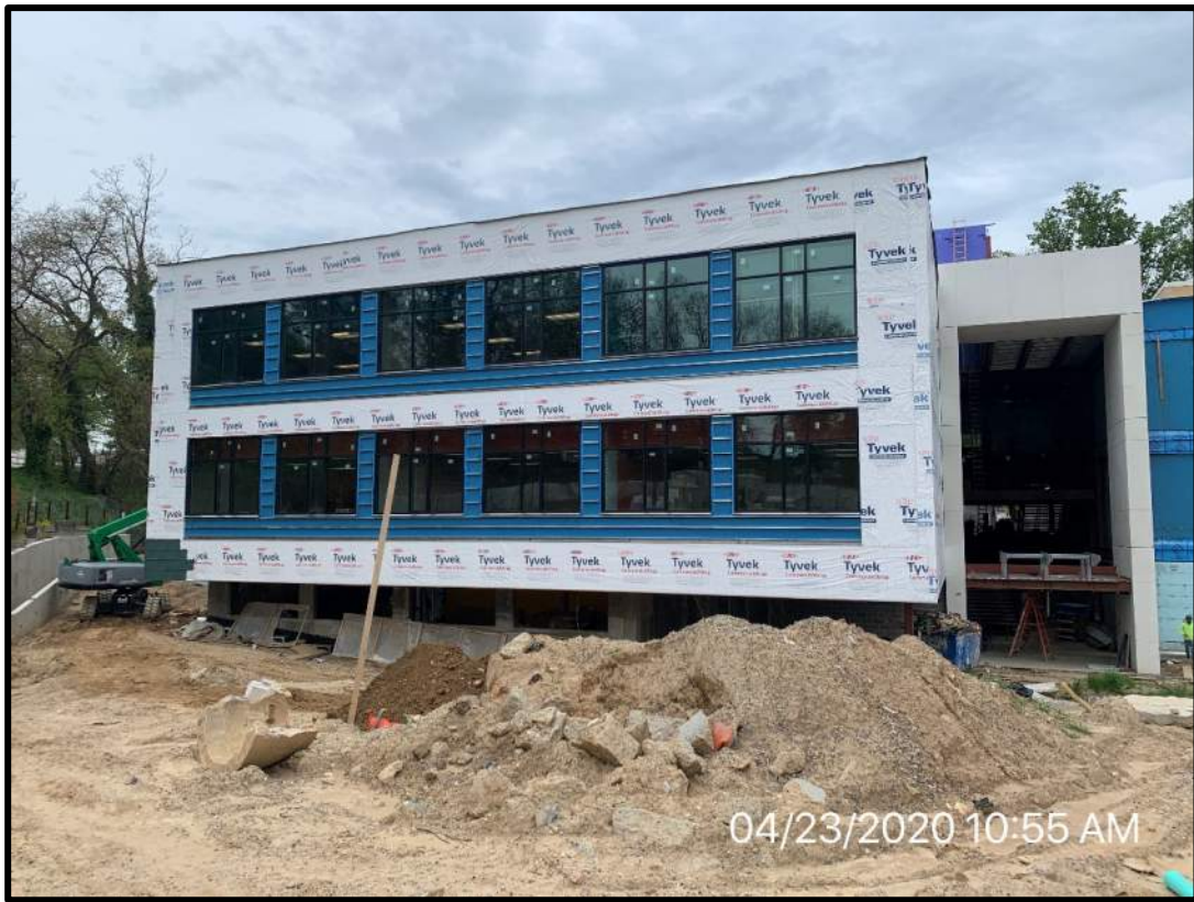
South elevation of building