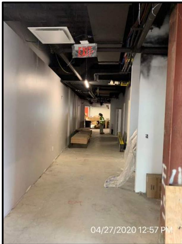
View of second floor main corridor current status (looking North)