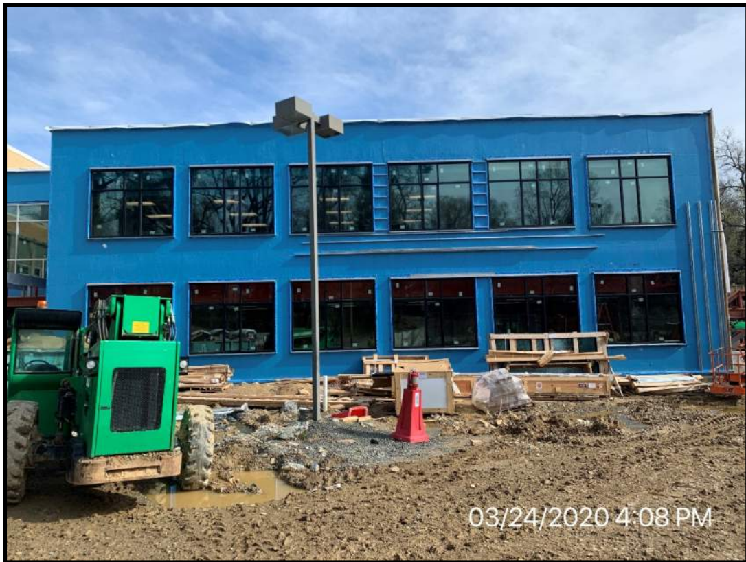
North face of the building current status