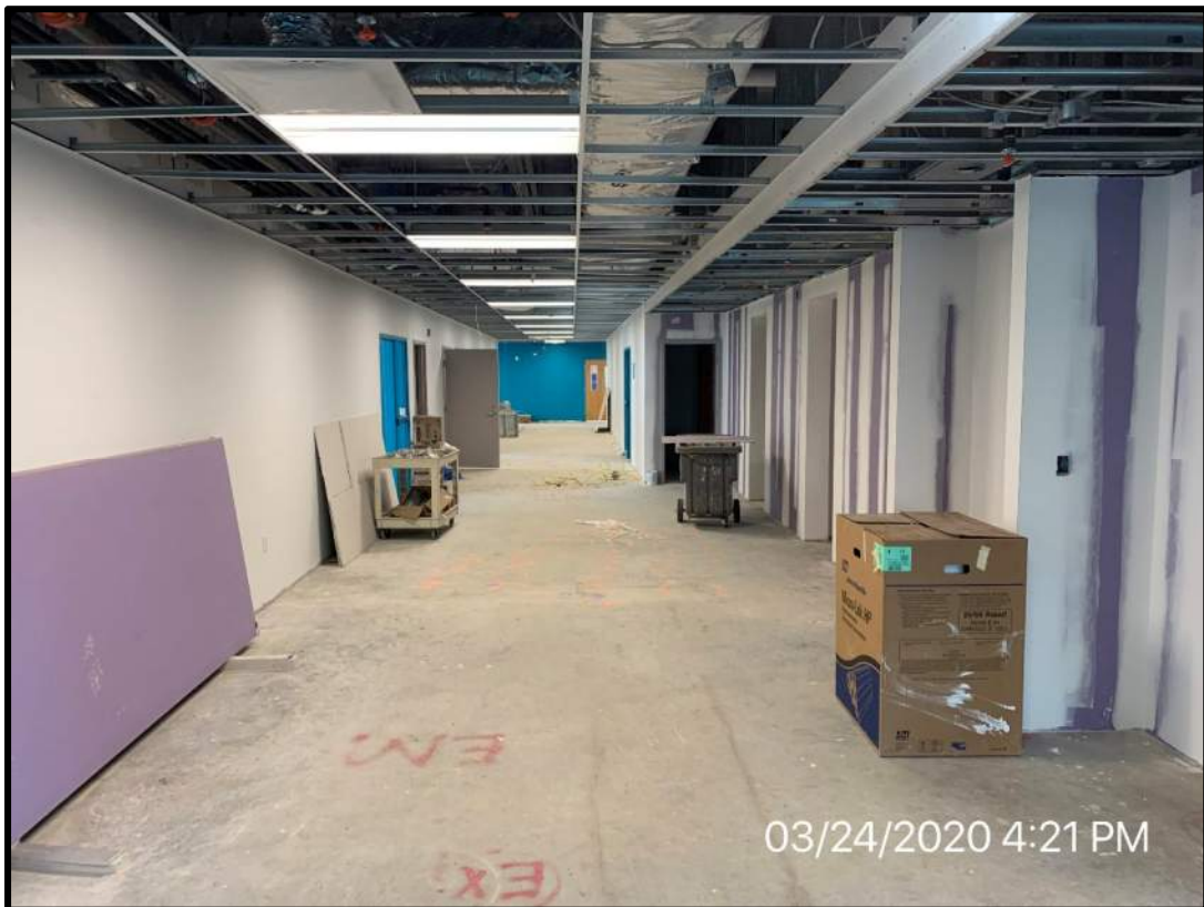
Third floor main corridor status (looking North)