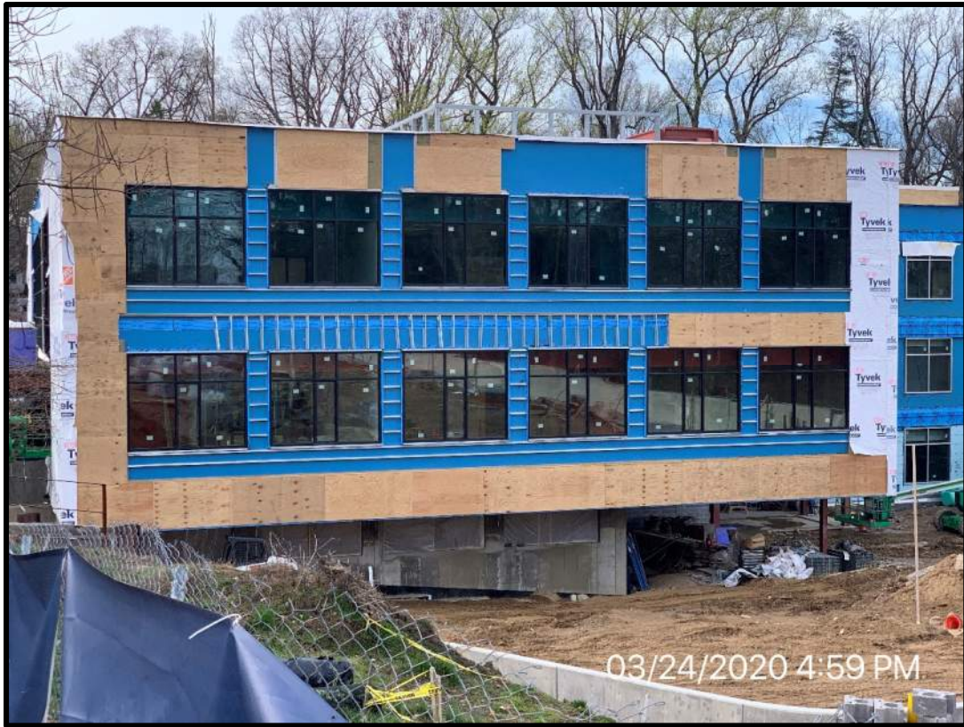
South elevation of building