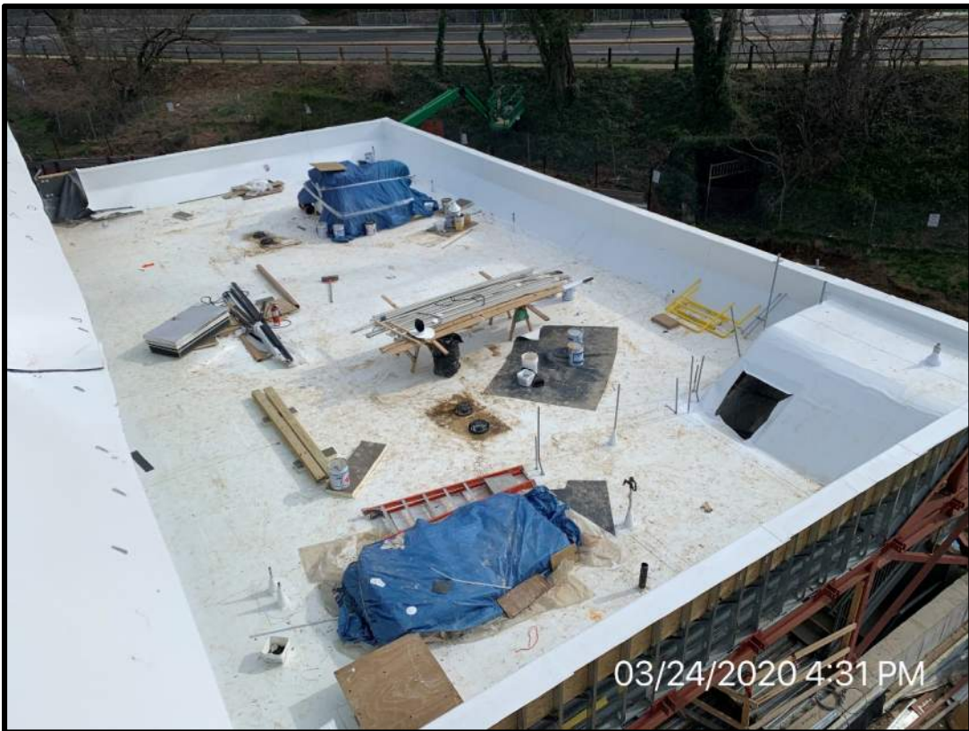
Current status of the auxiliary gym parapet wall