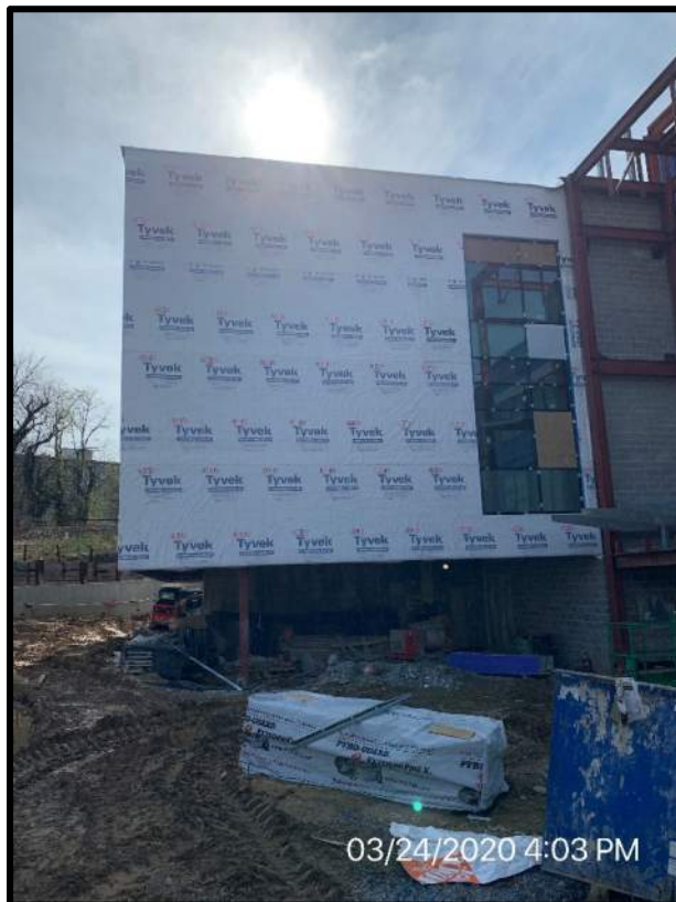
East elevation including new curtain wall