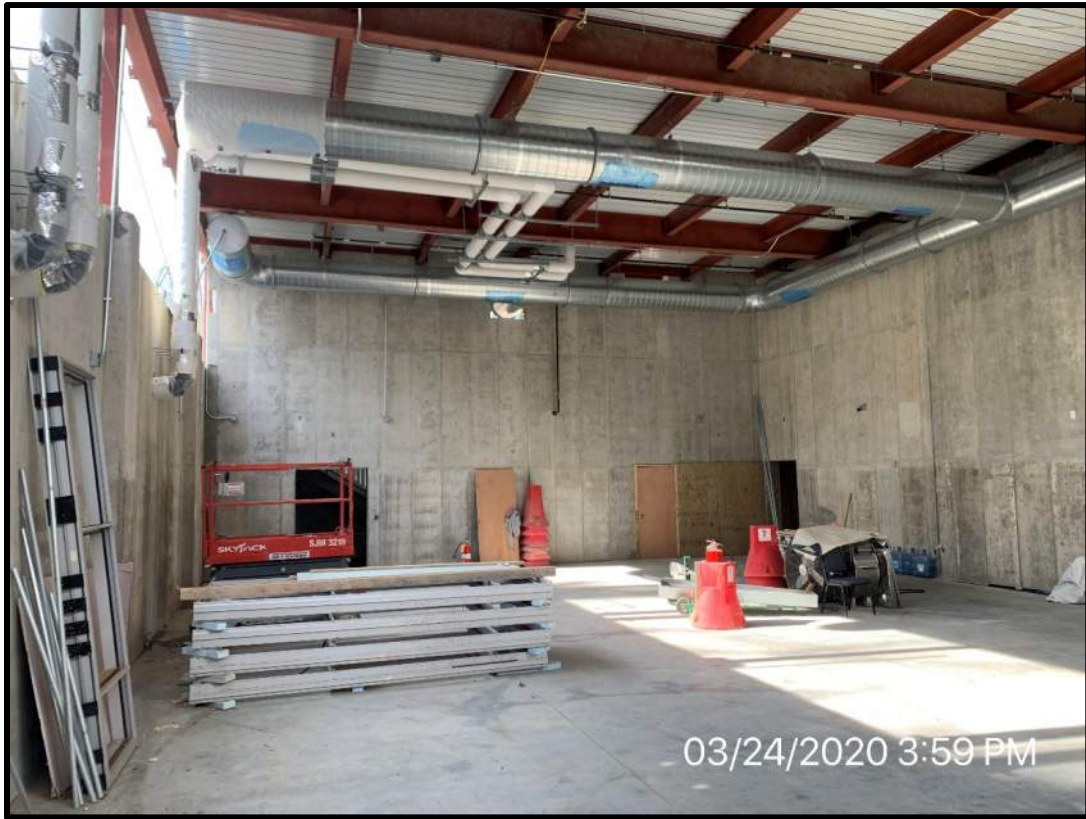
Auxiliary gym current status