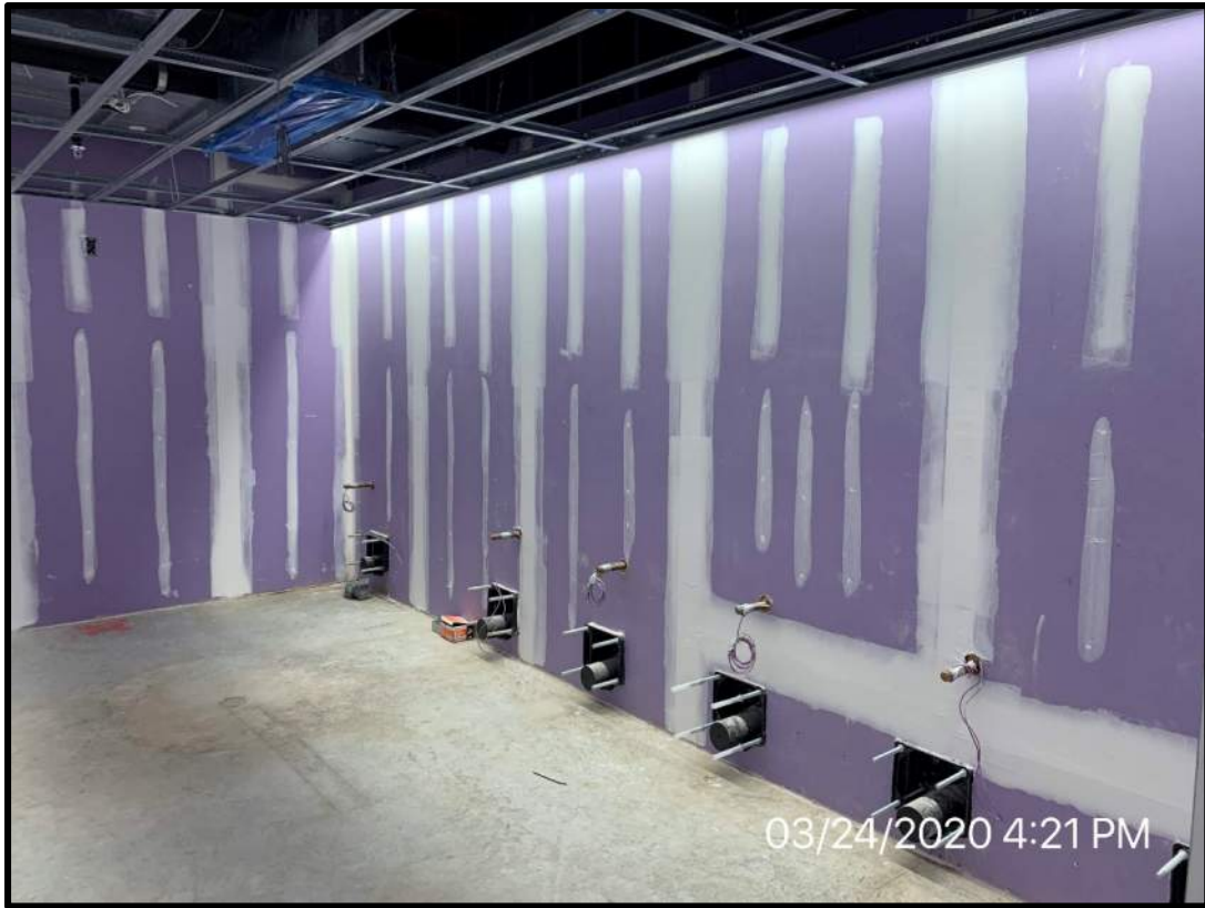
Current Status of bathrooms on the second and third floors