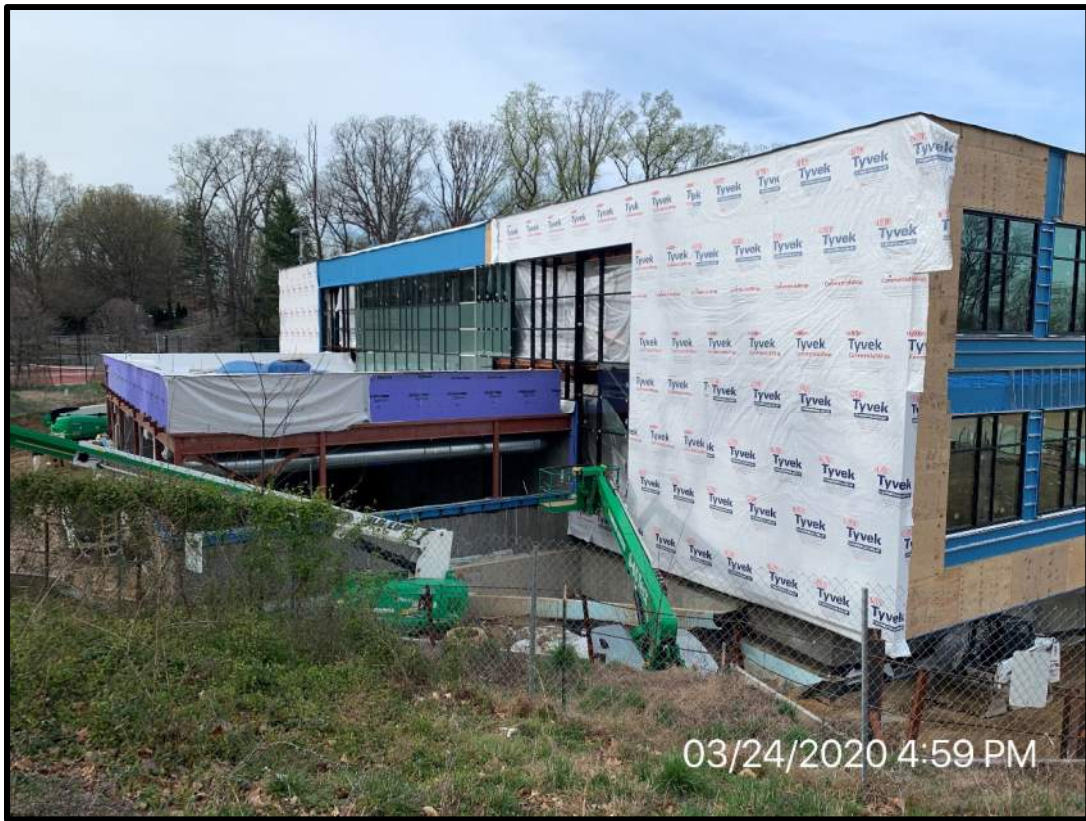
West elevation of building with curtain wall, auxiliary gym, and site works