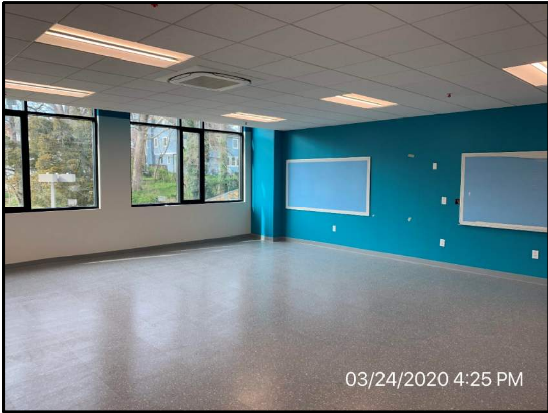
Current status of mock-up classroom