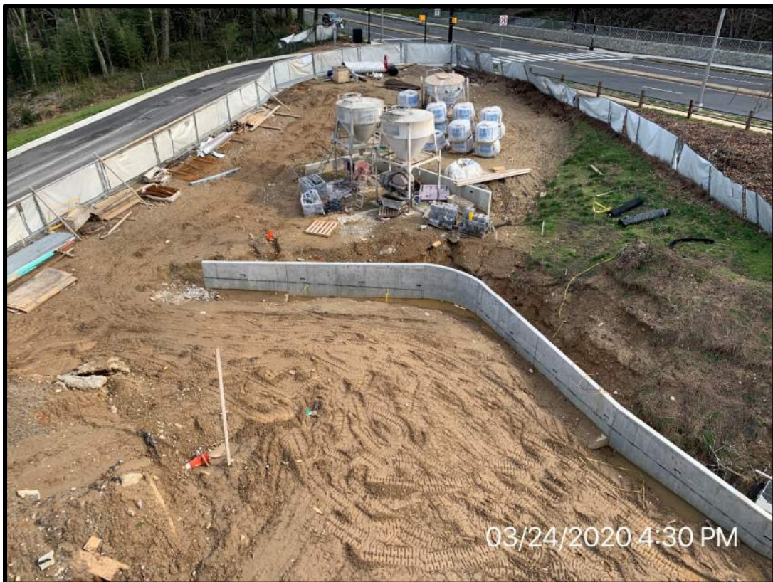
Current status of site work around new historic trail