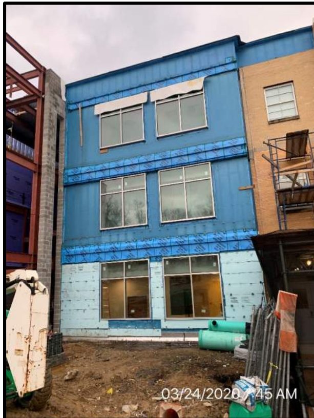
South elevation of renovation façade where new gray brick façade is to be installed