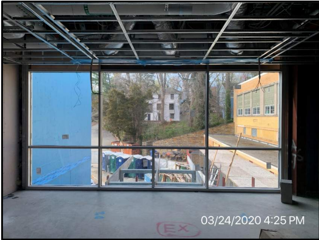
Window above North Entrance Vestibule