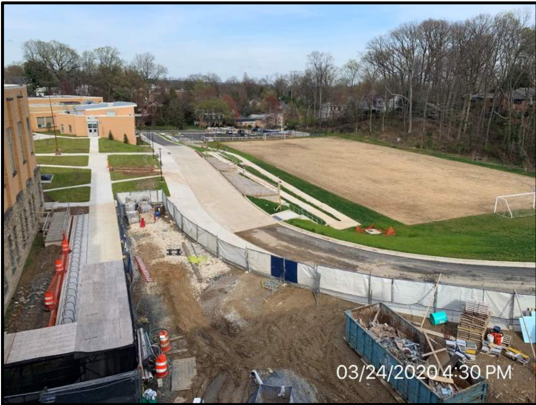
Current state of landscaping and athletic field at the rear of the school