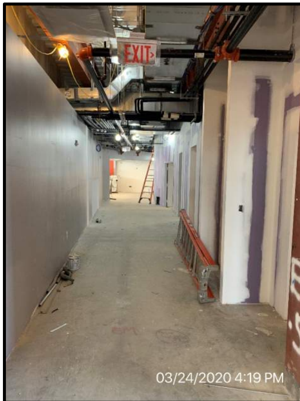
View of second floor main cooridor current status (looking North)