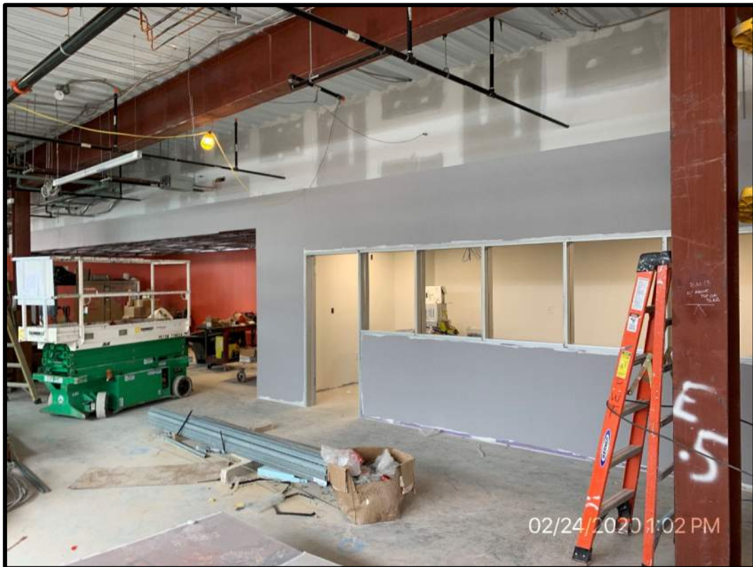
Library and library office current status