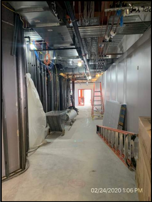
View of second floor main cooridor current status (looking South)