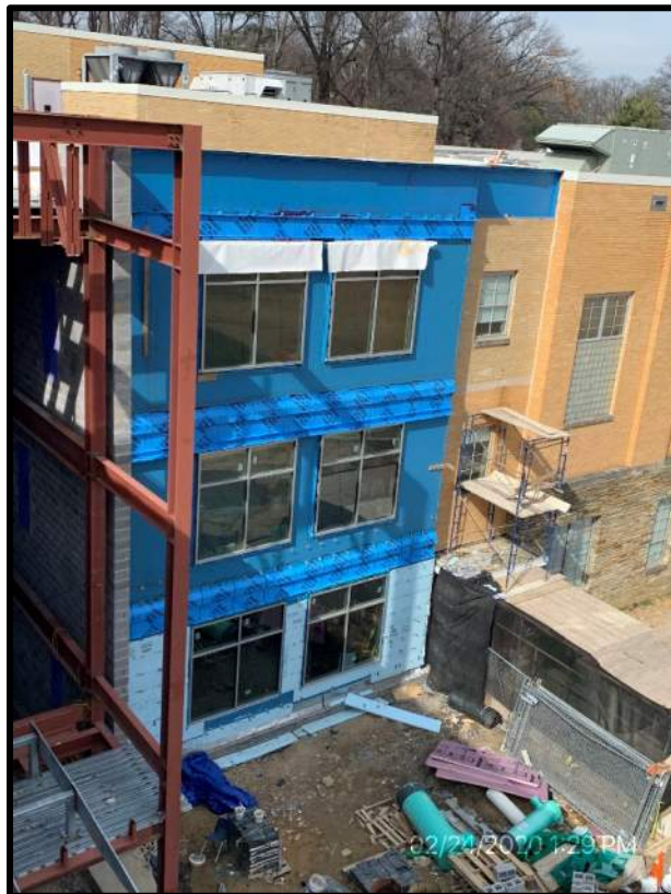
South elevation of renovation façade where new gray brick façade is to be installed