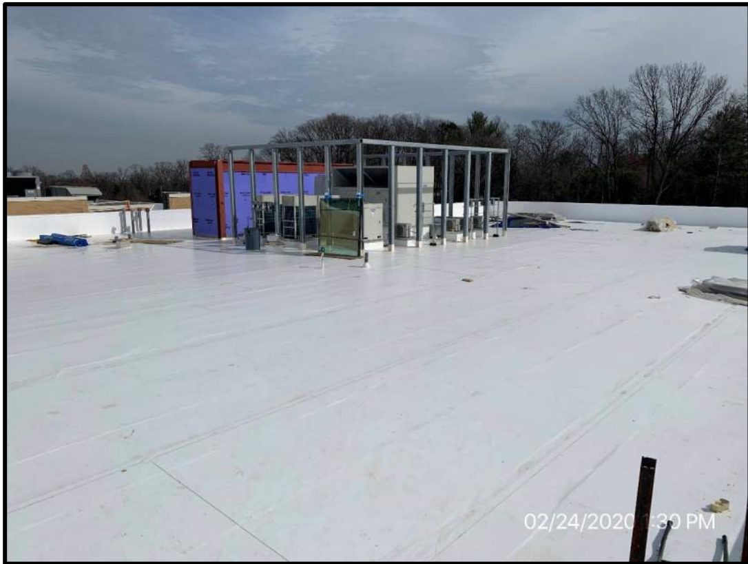
PVC roof installation current status (Main Roof)