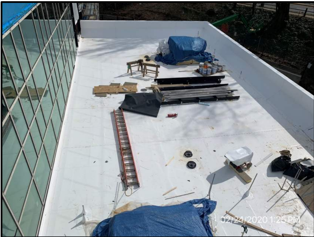
Current status of the auxiliary gym parapet wall