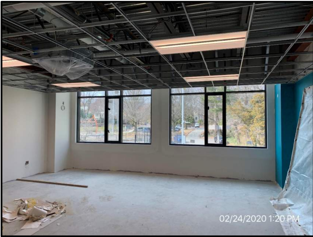
Current status of mock-up classroom