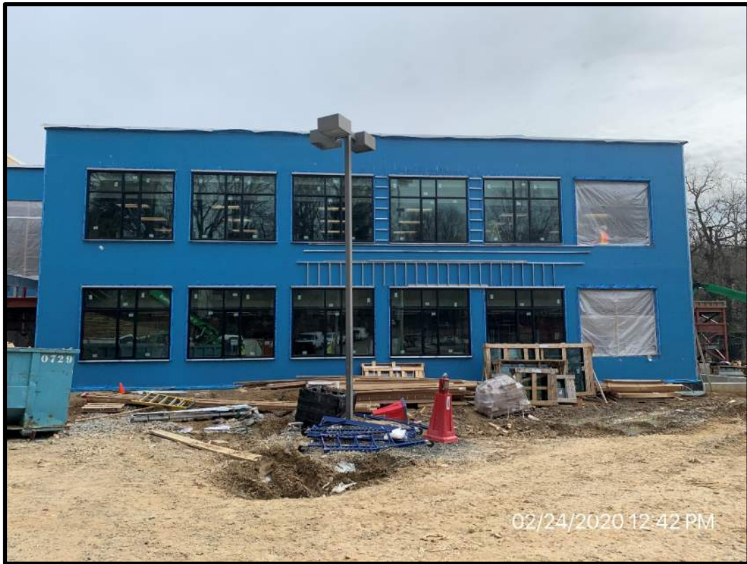
North face of the building current status with mock-up windows installed