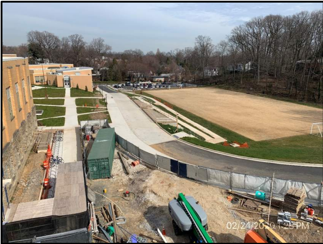
Current state of landscaping and athletic field at the rear of the school