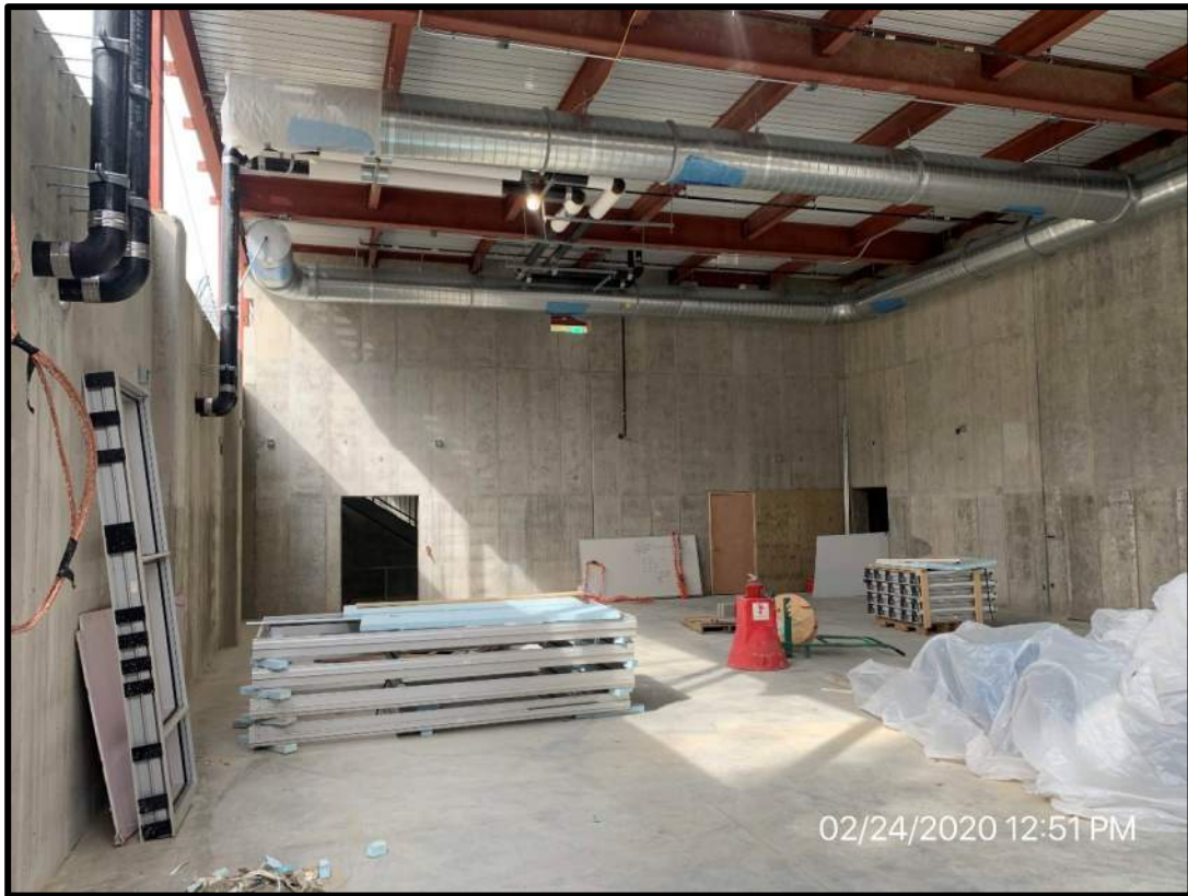
Auxiliary gym current status