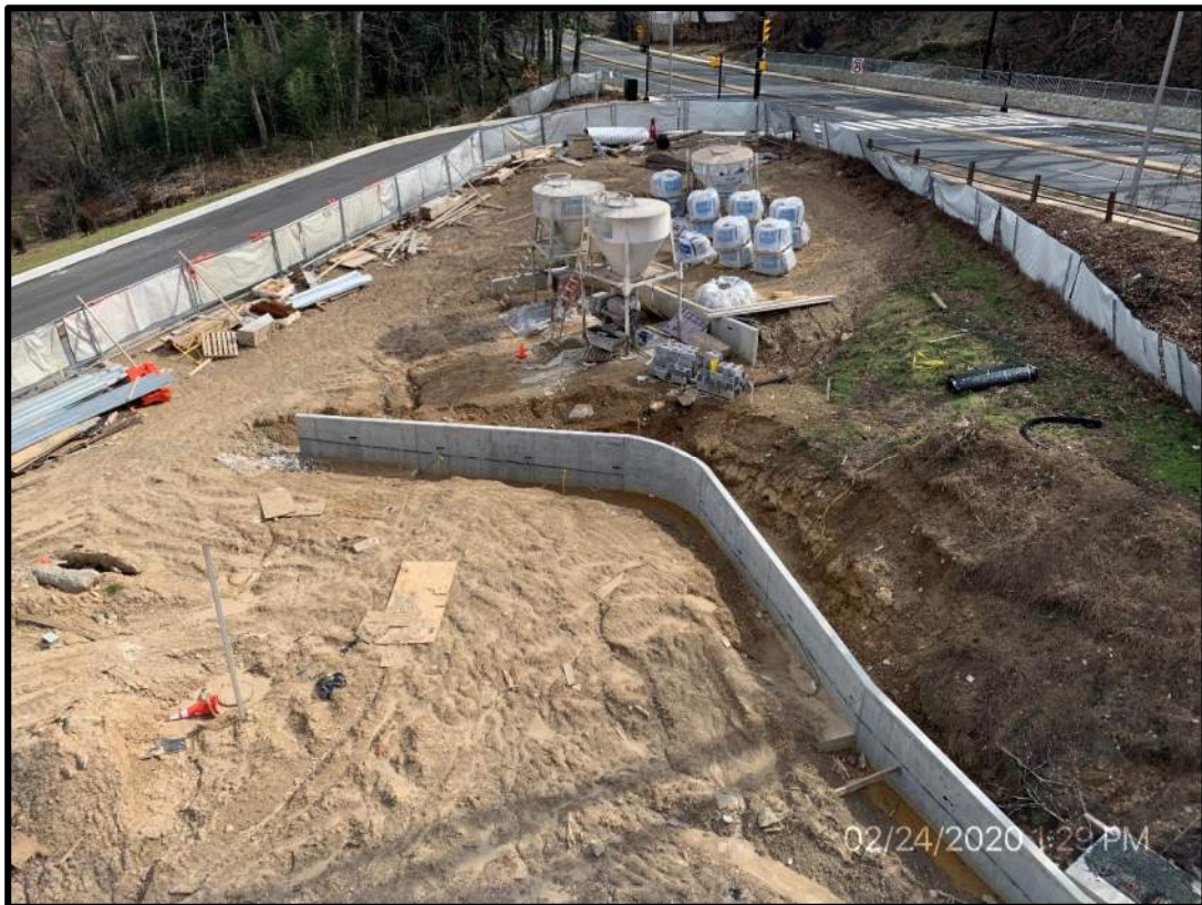
Current status of site work around new historic trail