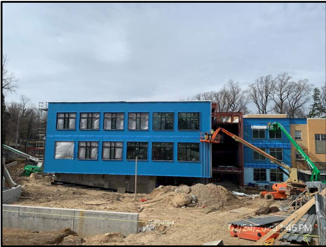
South elevation of building with mock-up windows installed