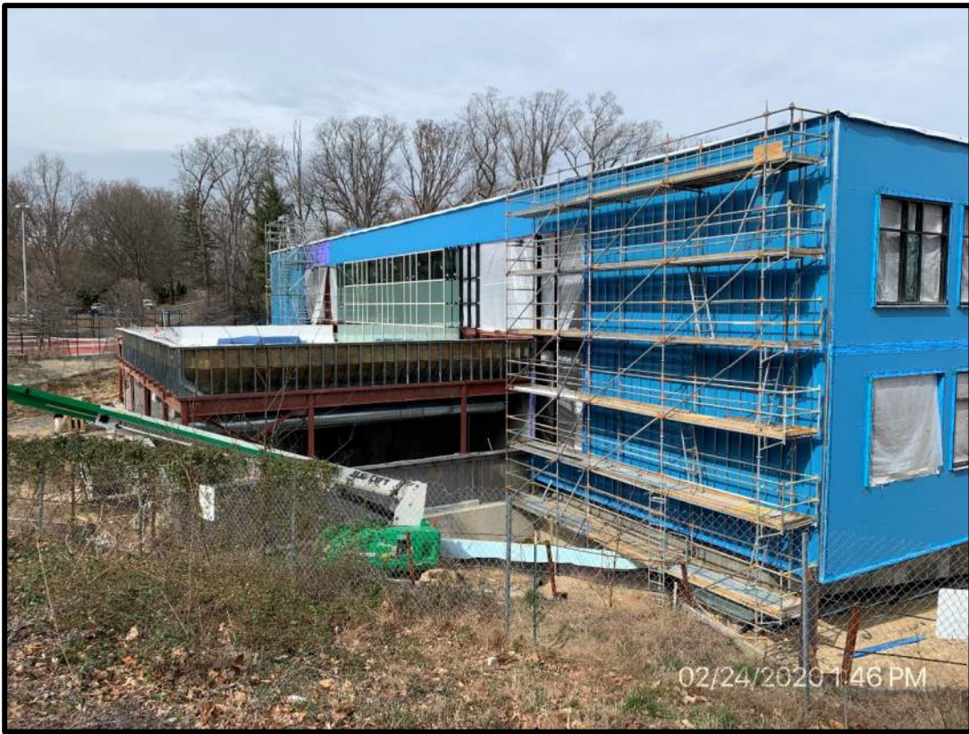
West elevation of building with curtain wall, auxiliary gym, and site works