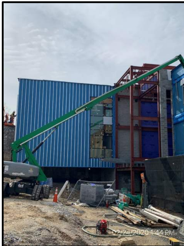
East elevation including new curtain wall