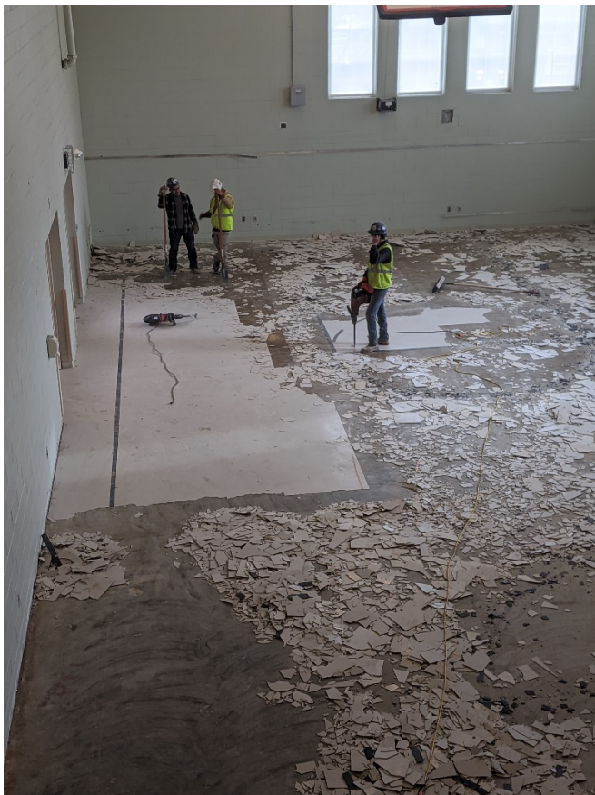
Interior Building Demolition