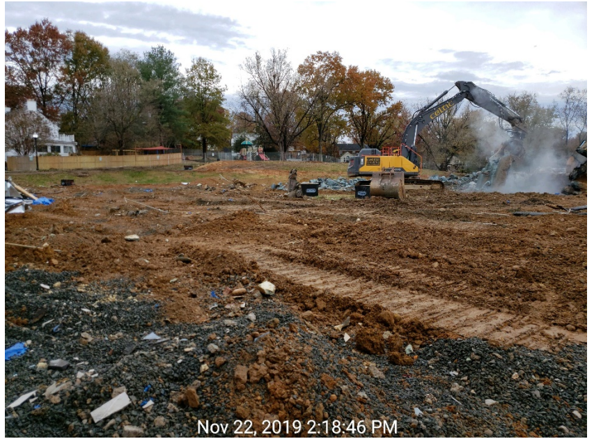
Building and Site Demolition