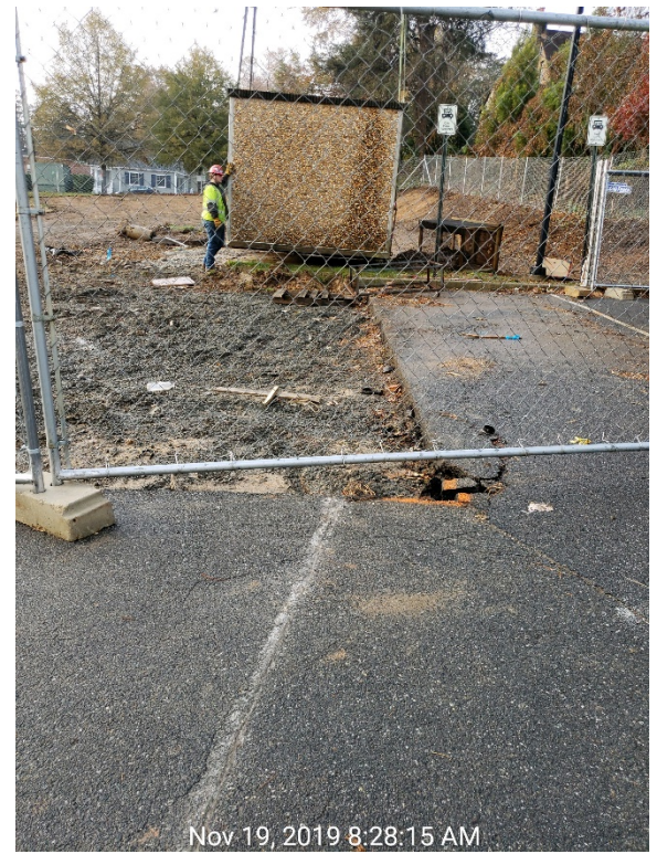
Nov 19, 2019 8:28:15 AM