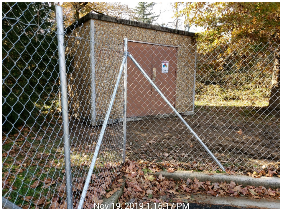
Nov 19, 2019 1:16:17 PM