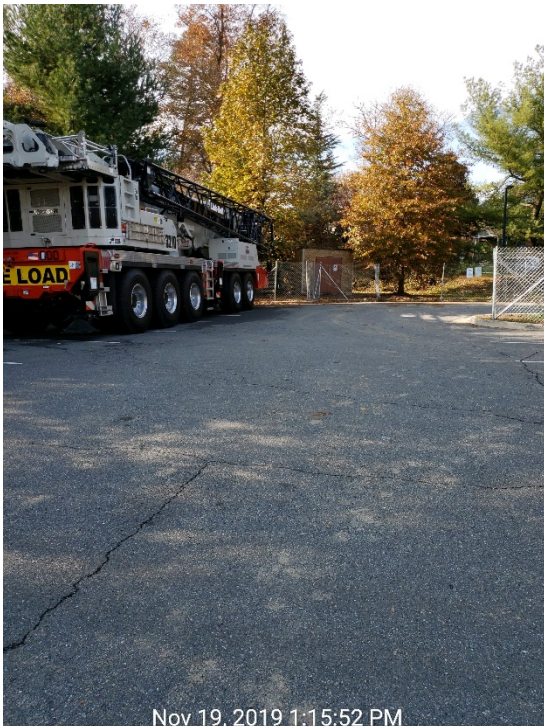
Nov 19, 2019 1:15:52 PM

Relocation of the existing pebble storage shed on site