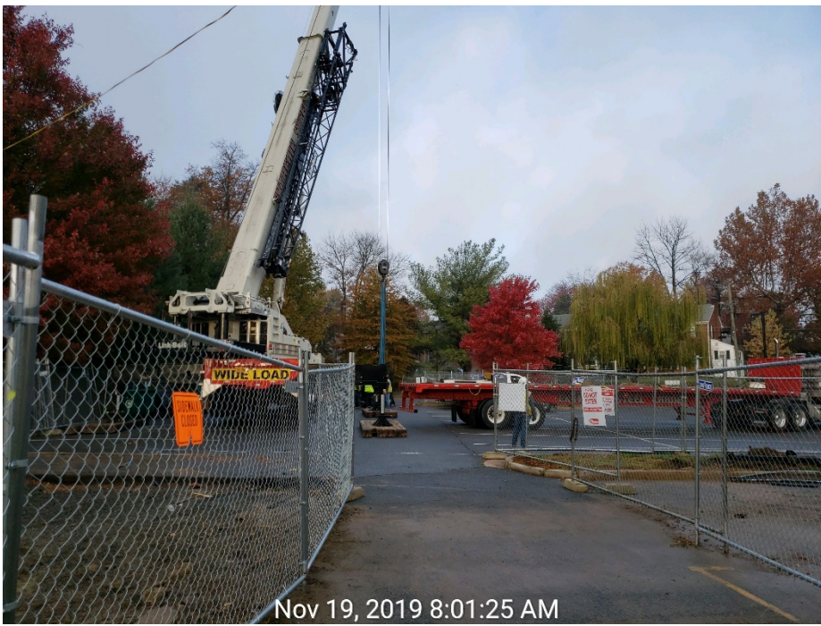
Nov 19, 2019 8:01:25 AM