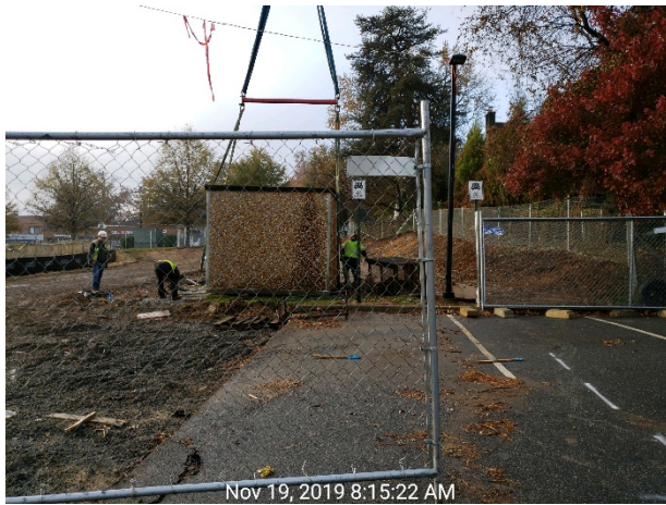
Nov 19, 2019 8:15:22 AM

Relocation of the existing pebble storage shed on site