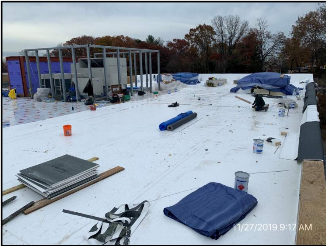
PVC roof installation current status