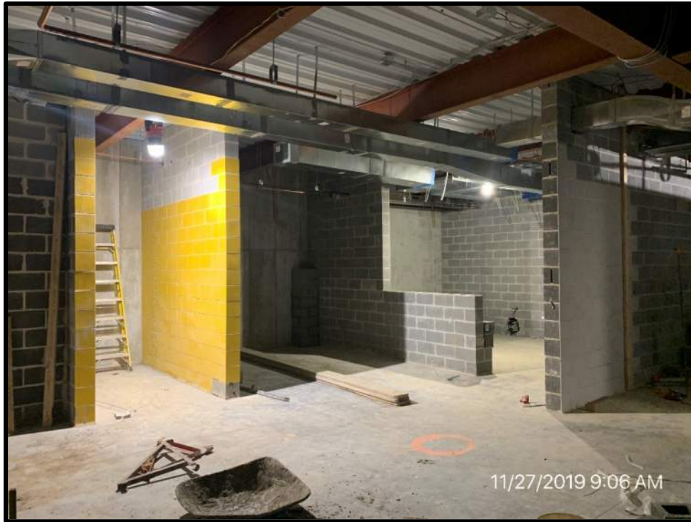
First floor locker room block walls