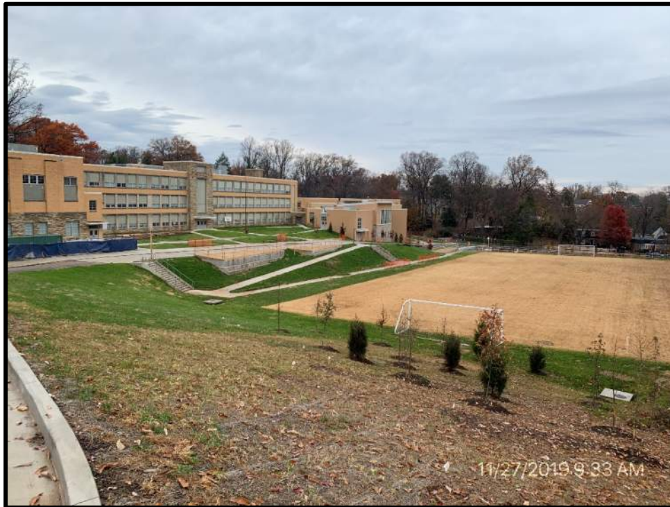
Current state of landscaping and athletic field at the rear of the school