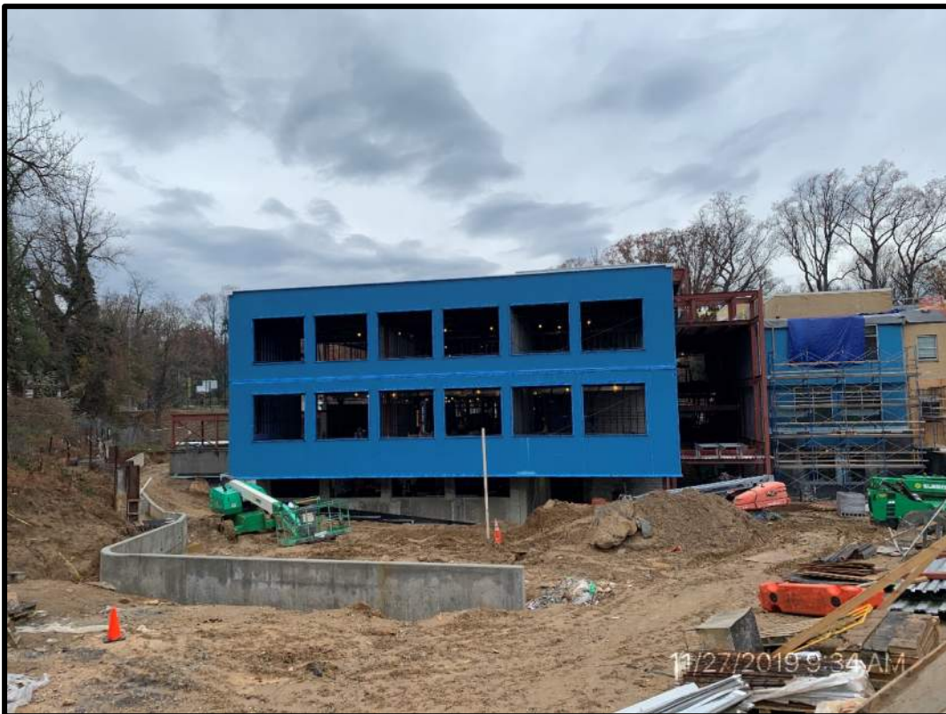
South face of the building current status including retaining walls.