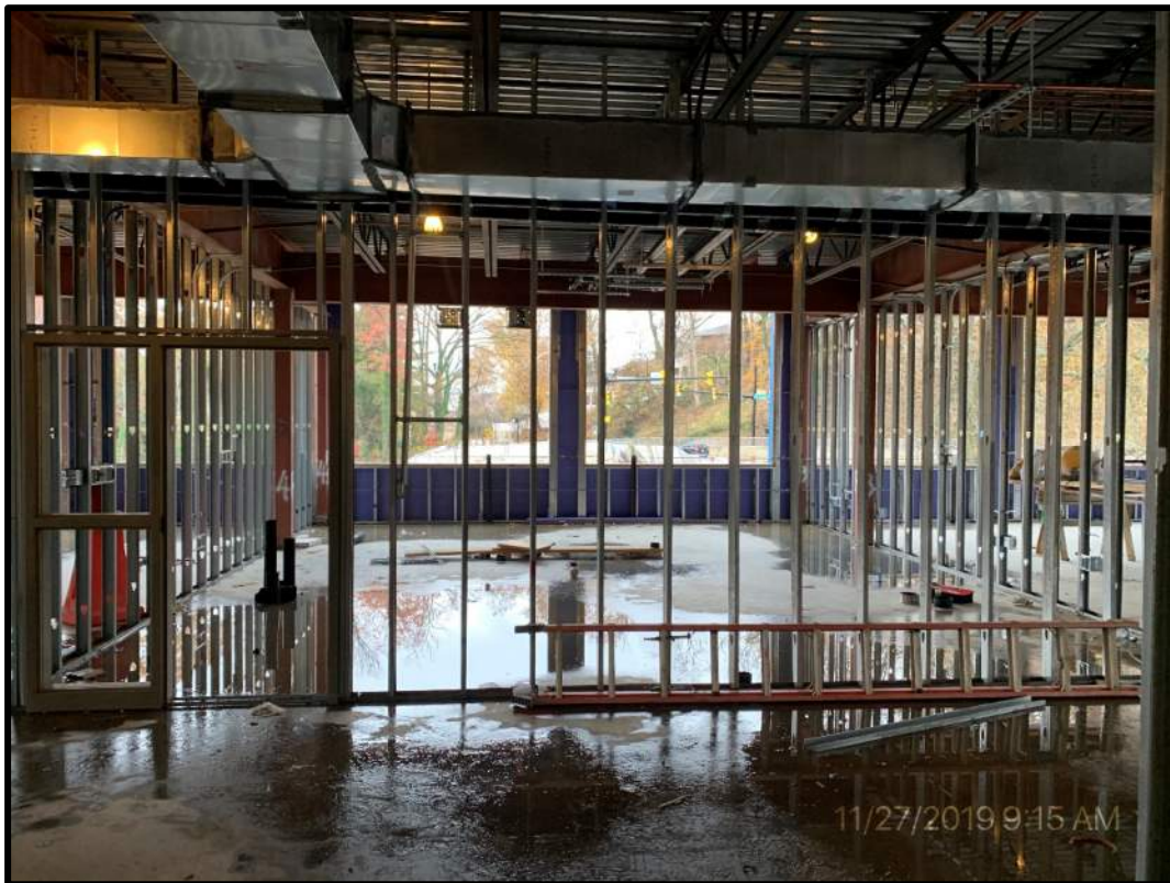
New classroom stud walls and mechanical ductwork status