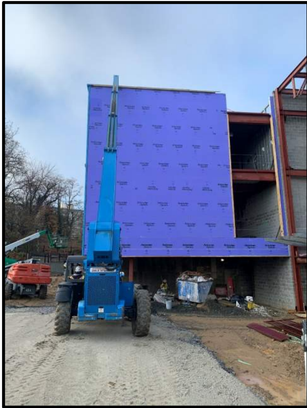
East face of exterior framing and sheathing installation