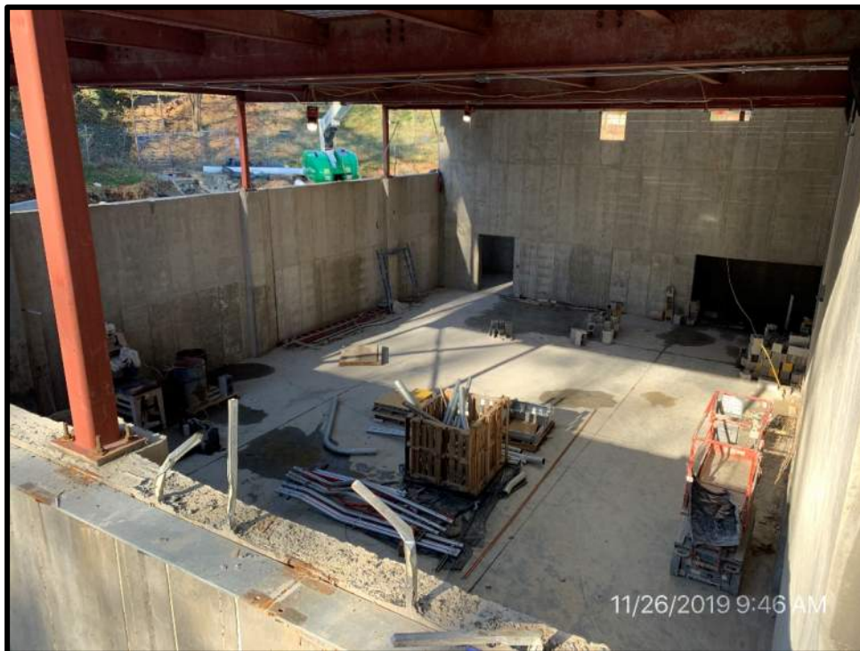
Current status of the auxiliary gym