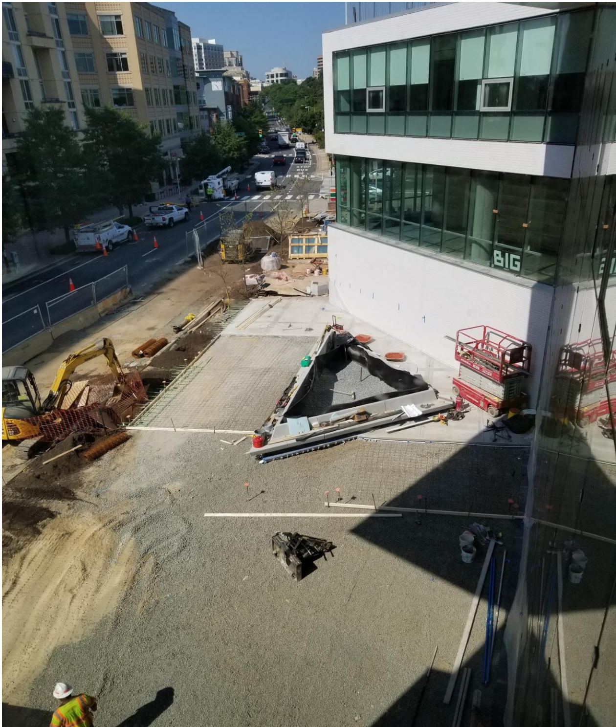
View from above plaza on Wilson Blvd. Installation of planter and hardscape.