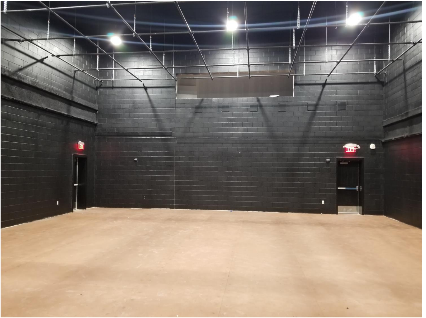
Black box theater.