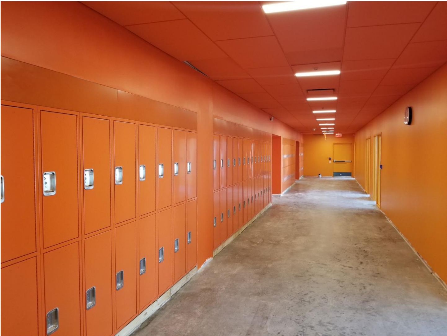
Installation of lockers at corridor.