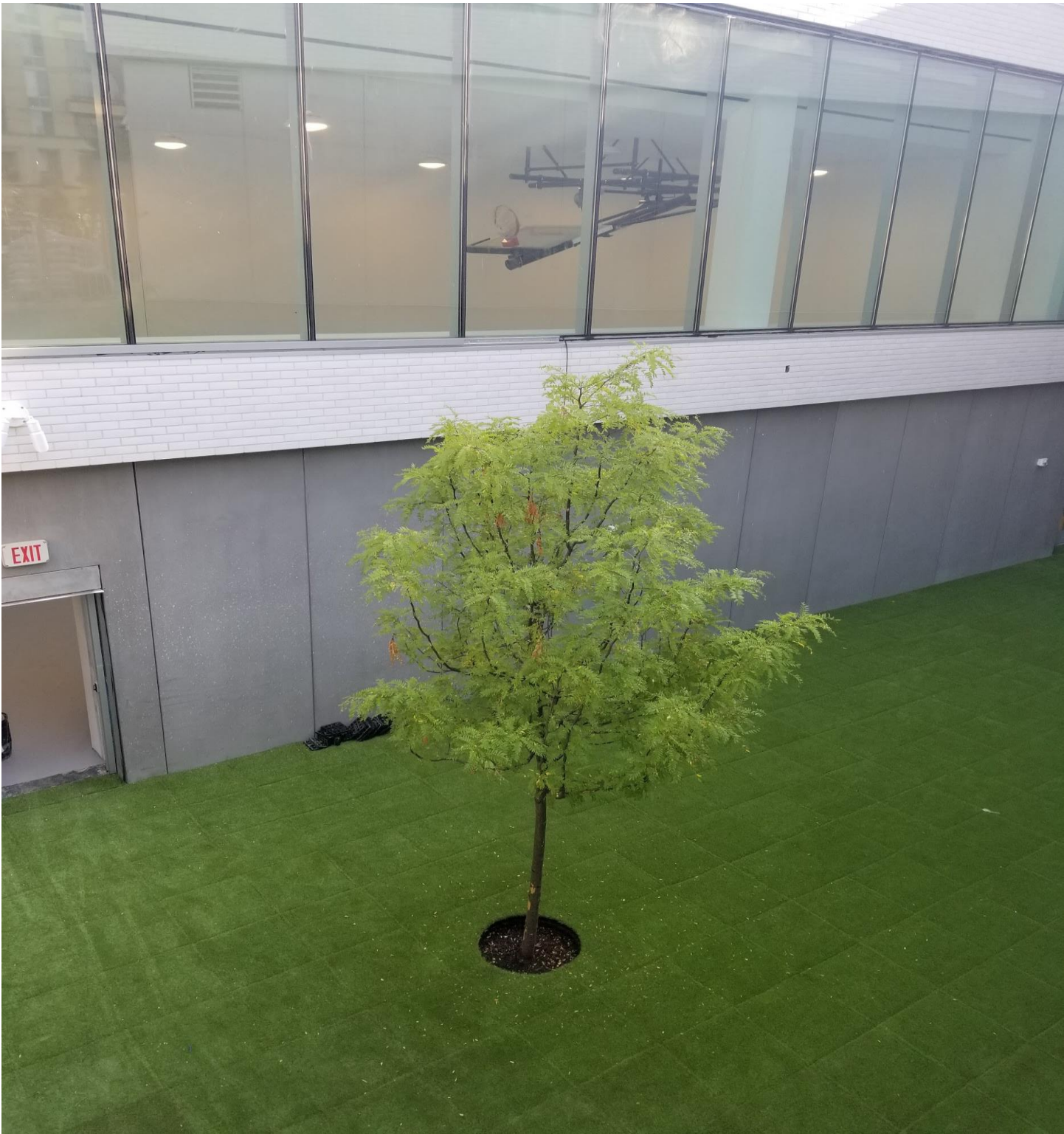
Tree planting and turf installation at courtyard.