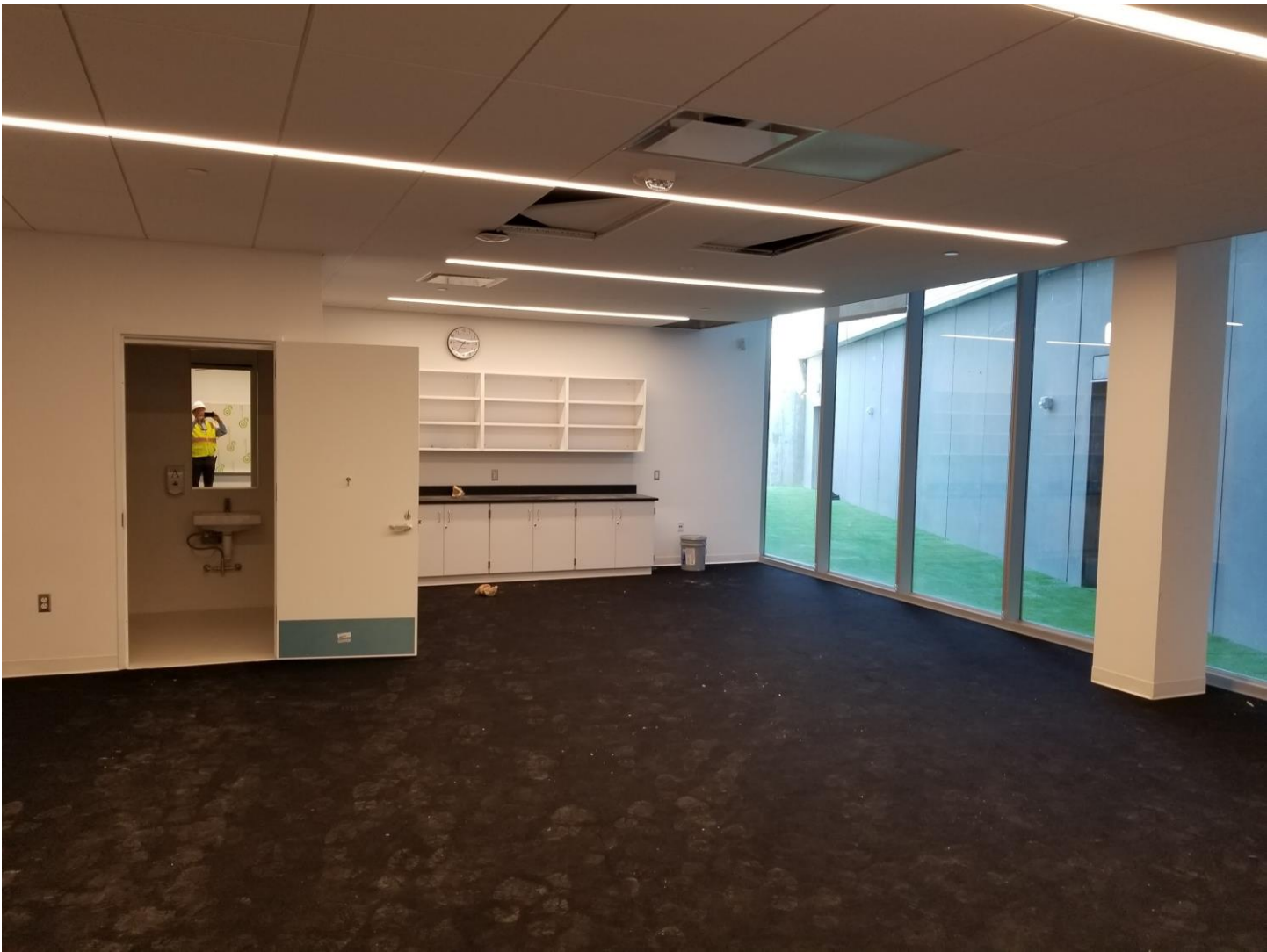
View from classroom to courtyard.