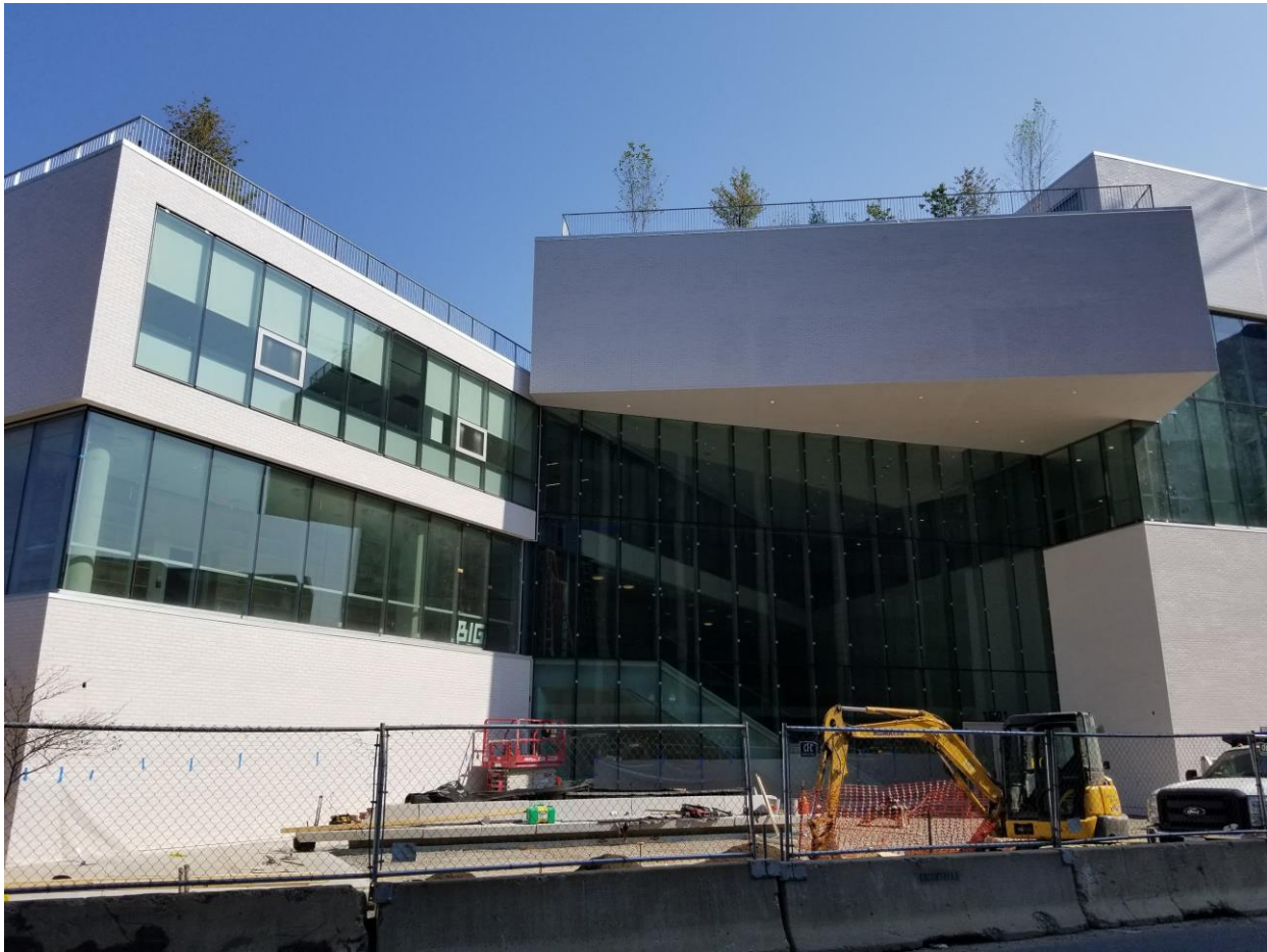
Entrance at Wilson Blvd. Installation of planter and hardscape. Landscape visible at terraces.