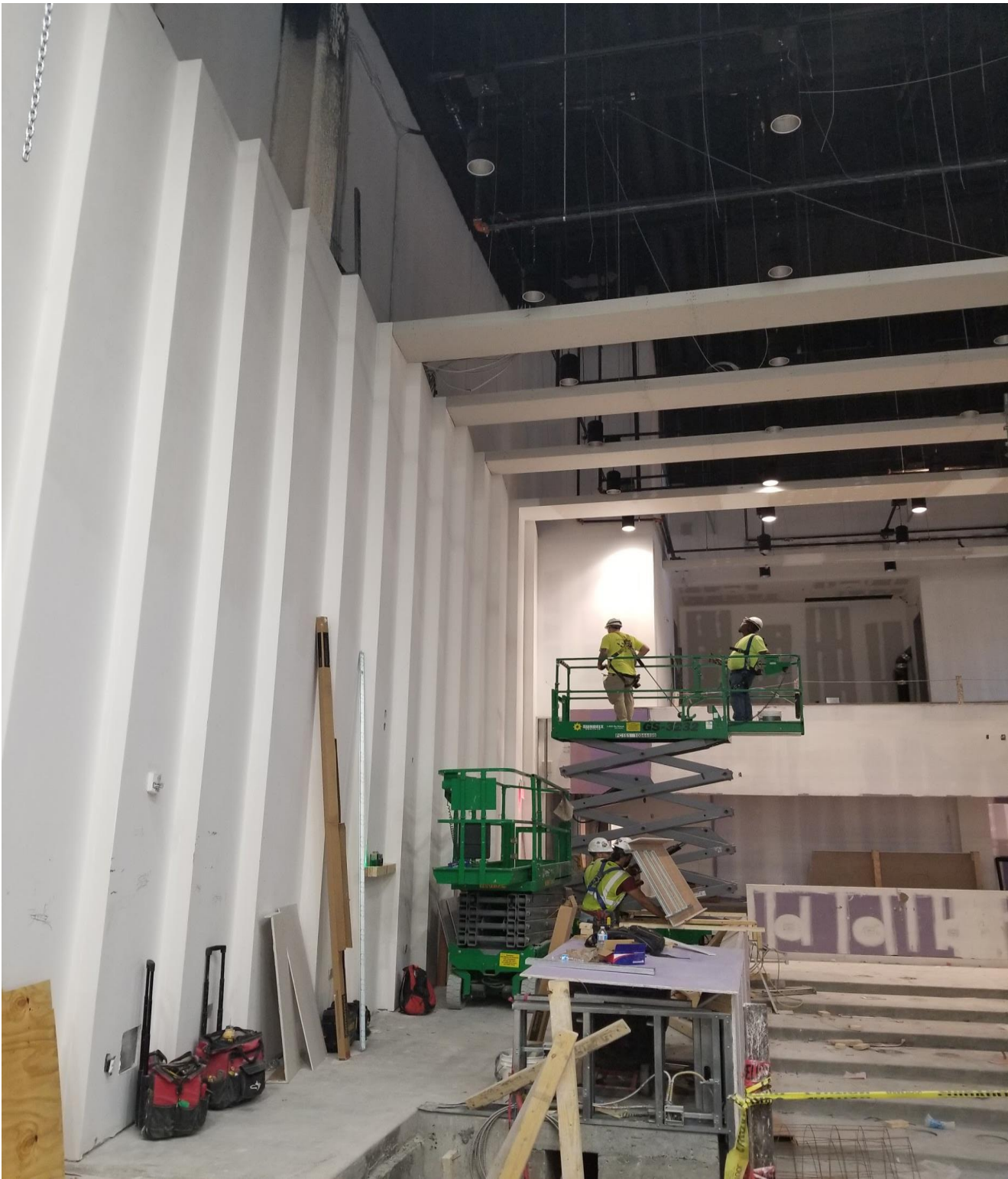
Installation of wall and ceiling elements at the theater.