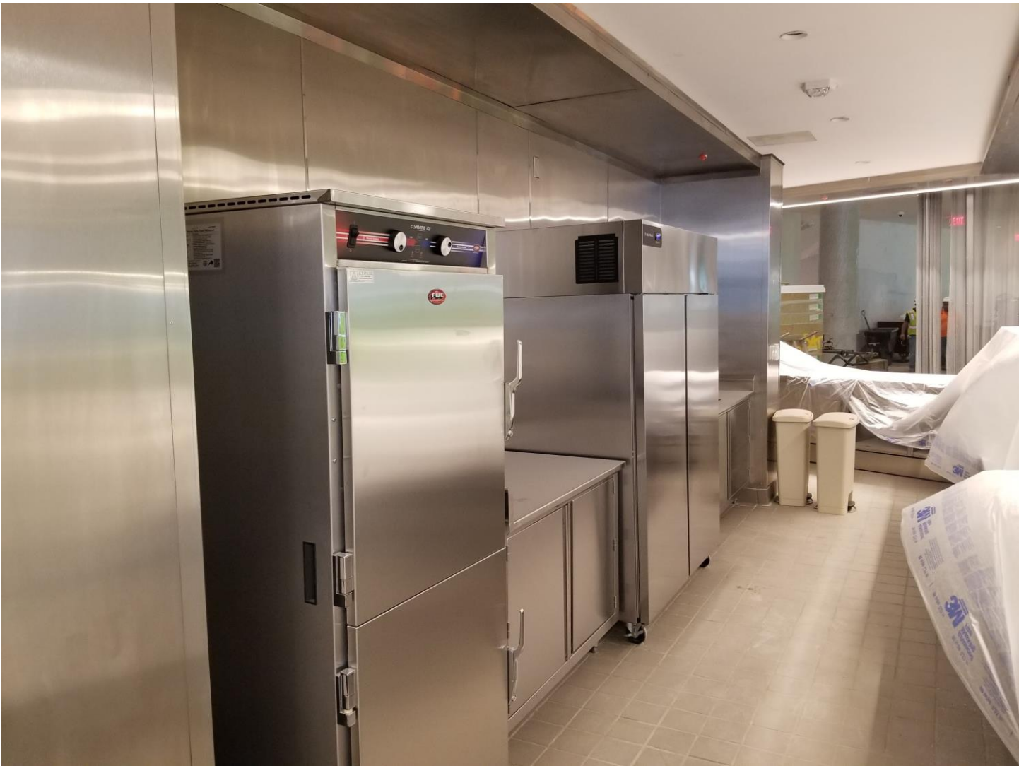
Serving line at the cafeteria.