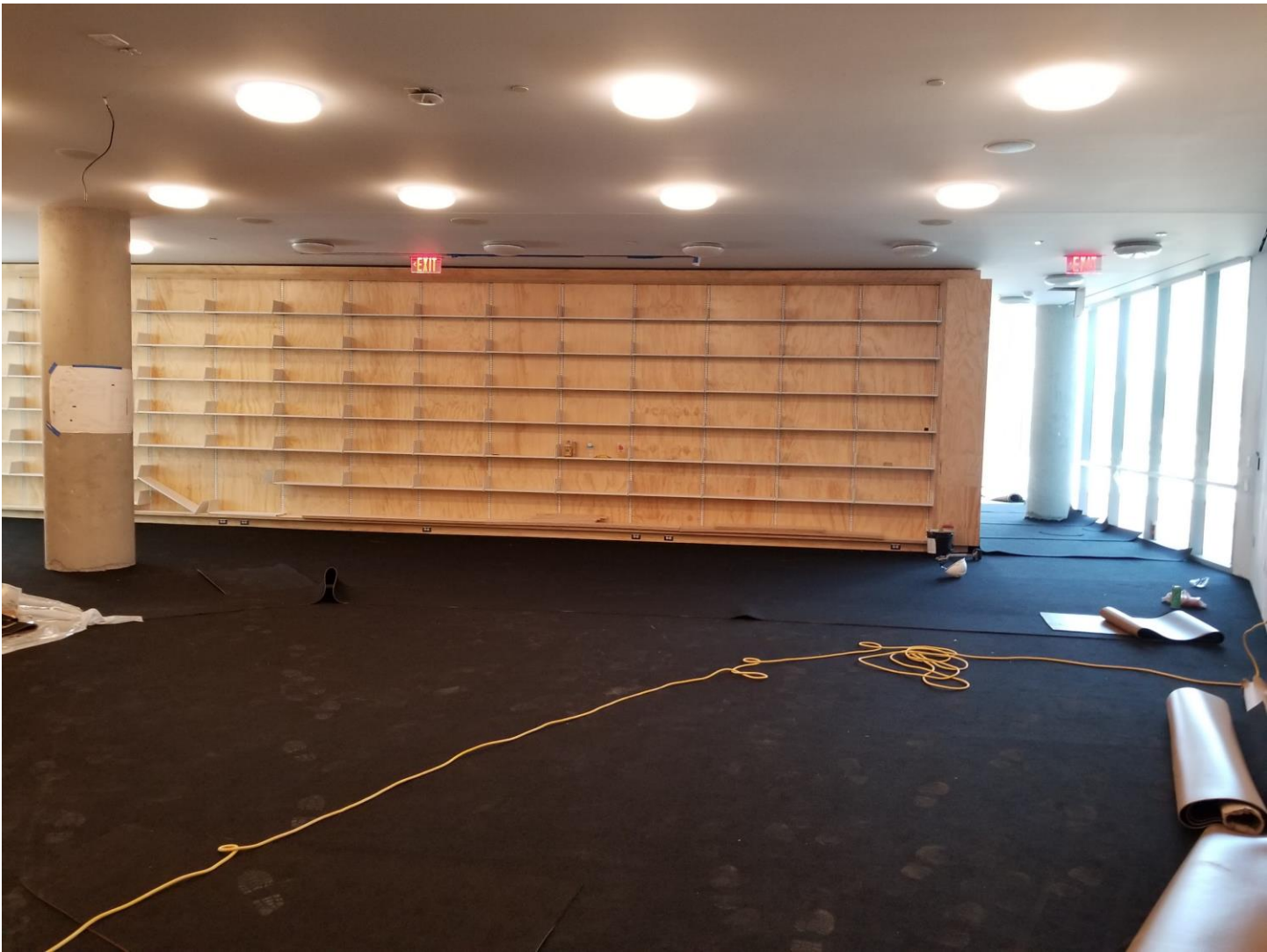
Installation of shelving at the library.