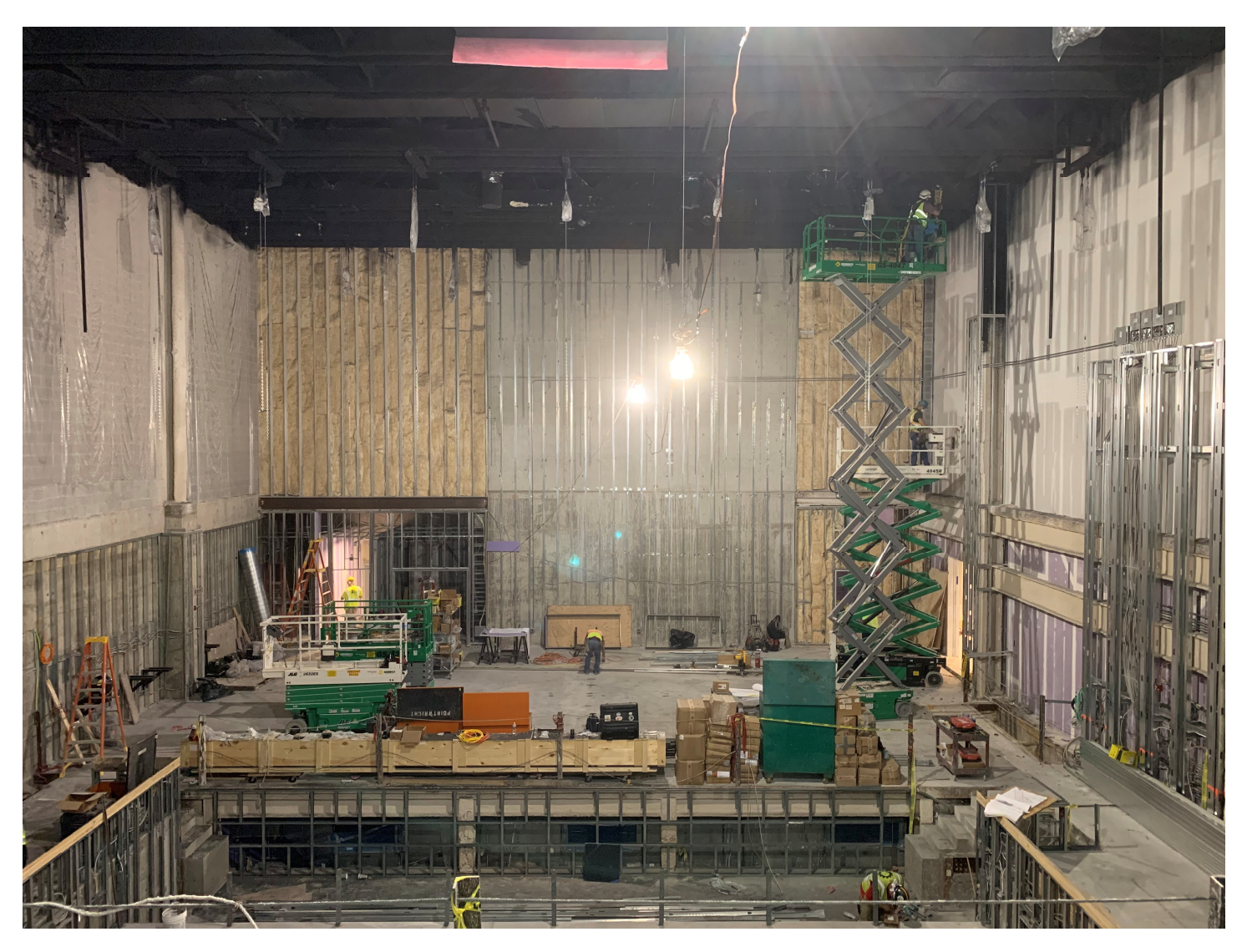
Framing installation at auditorium started