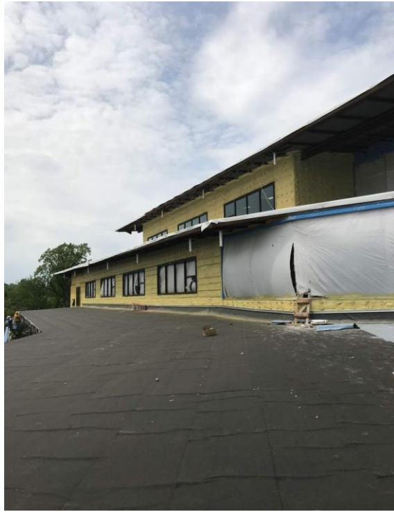
SPRAY FOAM AIR BARRIER ABOVE ROOF AT NORTH FACADE