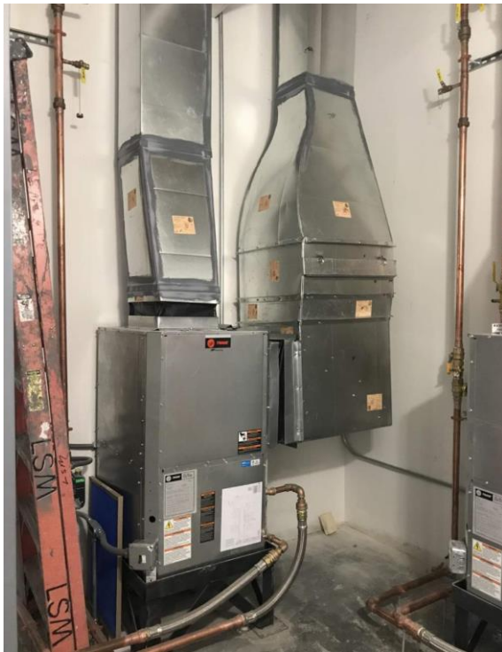
INSTALL OF CLASSROOM HEAT PUMPS ON 3 RD FLOOR