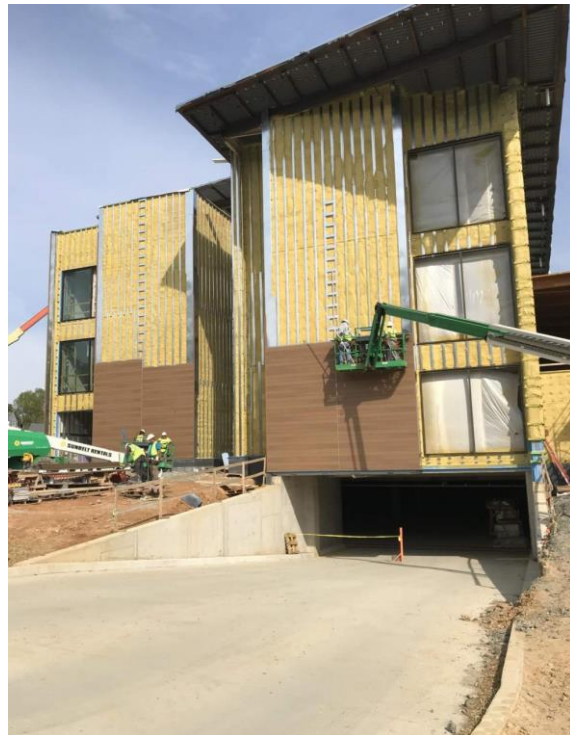
FIBER CEMENT SIDING INSTALL AT NORTH FAÇADE ABOVE GARAGE ENTRY