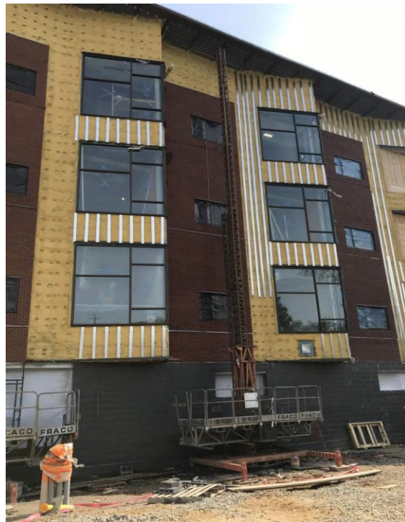
PROGRESS OF GLAZING AND MASONRY VENEER AT NORTH FACADE