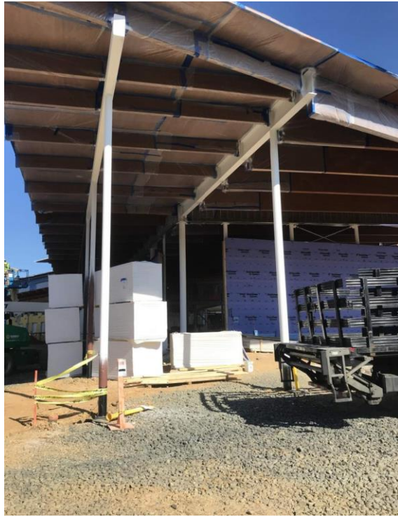
PAINING OF EXPOSED COLUMNS AND BEAMS AT GYM EXTERIOR CANOPY