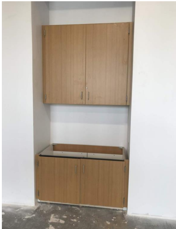
INSTALL OF CASEWORK IN HALLWAYS ON 4 TH FLOOR