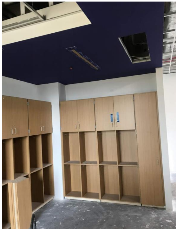
FINISH PAINTING AND INSTALL OF CASEWORK IN CLASSROOMS ON 4 TH FLOOR