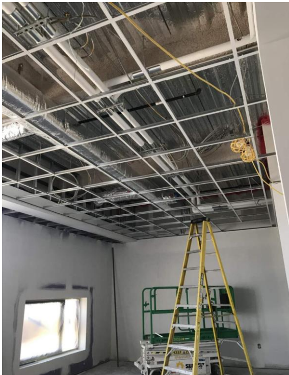
CEILING FRAMING ON 3 RD FLOOR