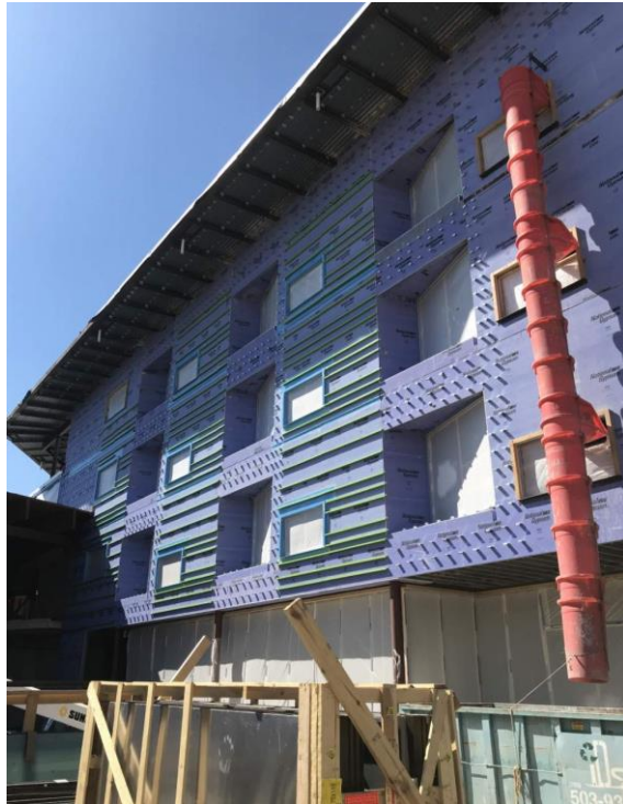
INSTALL OF FAÇADE CLADDING ATTACHMENT CLIPS AT SOUTH FACADE