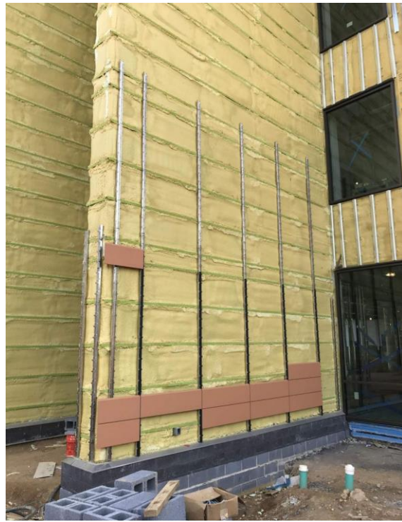
STARTING INSTALLATION OF TERRACOTTA PANELS AT EAST FACADE