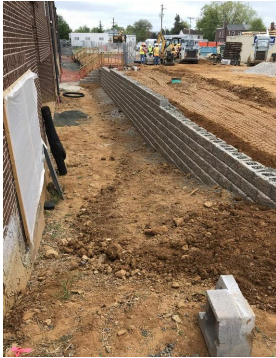
START OF SITE RETAINING WALLS ADJACENT TO TJ MIDDLE SCHOOL