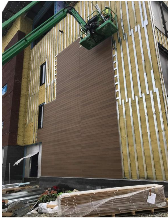
START OF FIBER CEMENT SIDING INSTALL AT NORTH FAÇADE