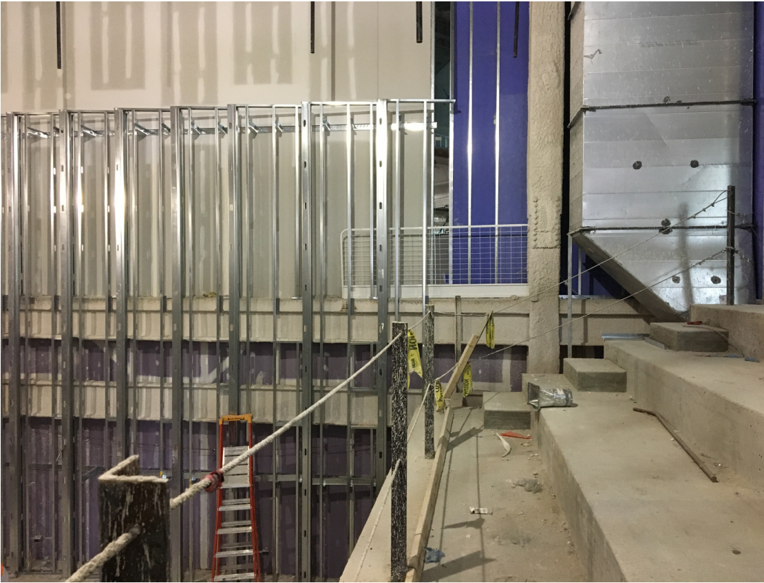
Furring wall installed at theater