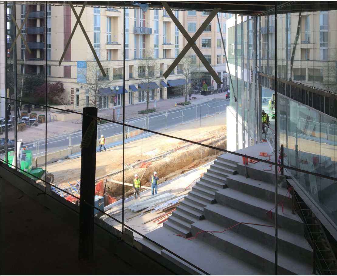
Prep work for three story curtainwall along Wilson Blvd