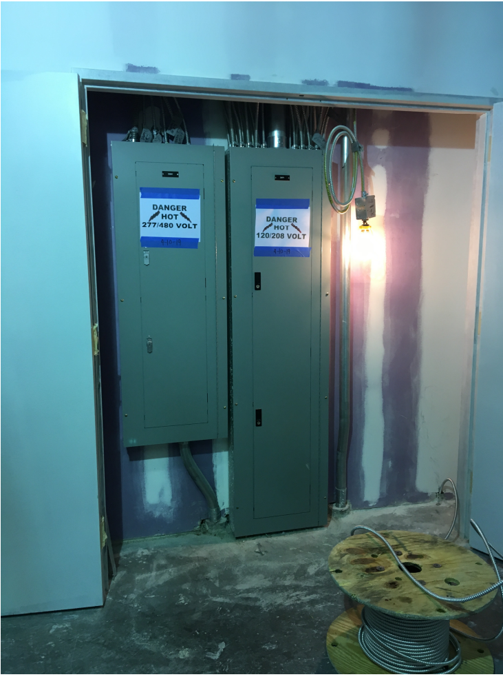
Electrical panels installed from B2 to L4