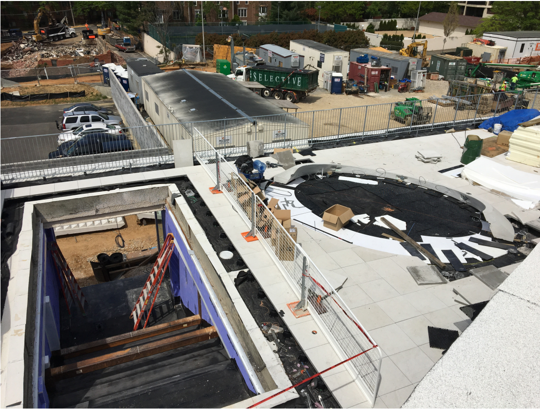
Terrace pavers started at level 2 terrace