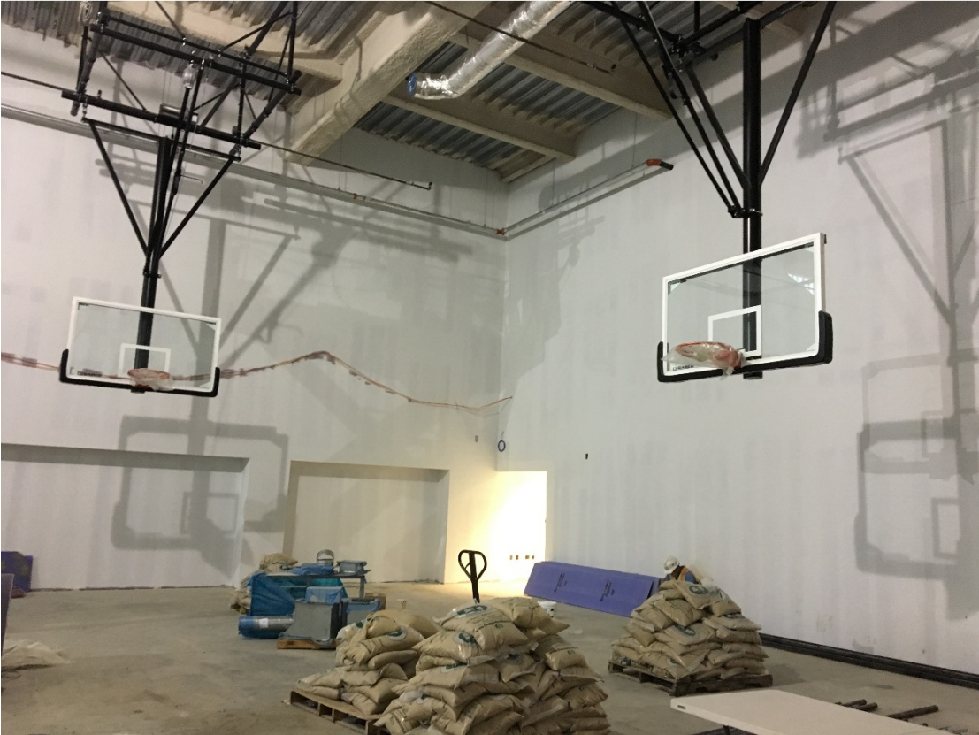
Basket ball hoops installed at main gym