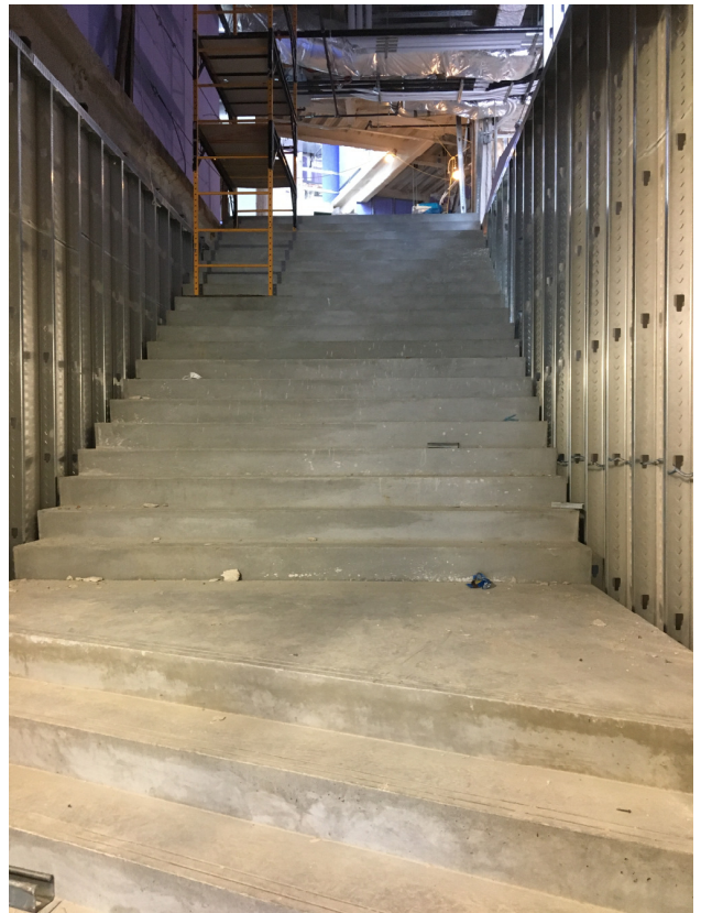
Interior cascading stairs installed