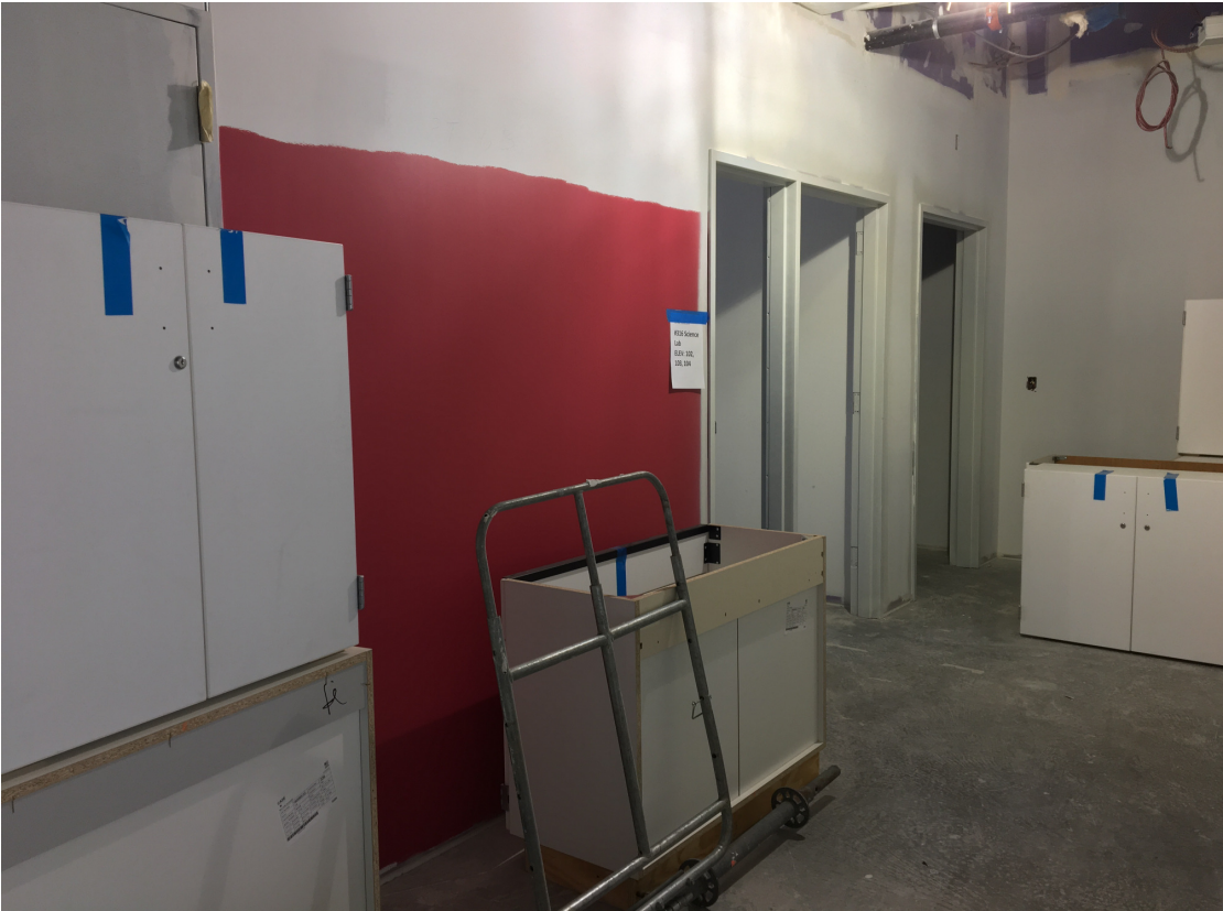
Color paint started at G1