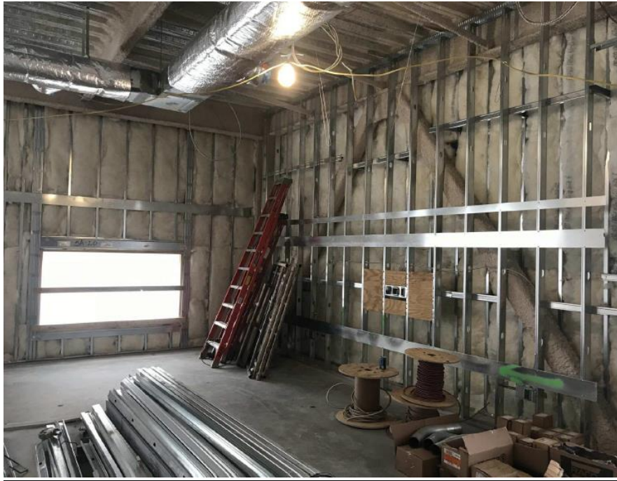
EXTERIOR WALL THERMAL INSULATION