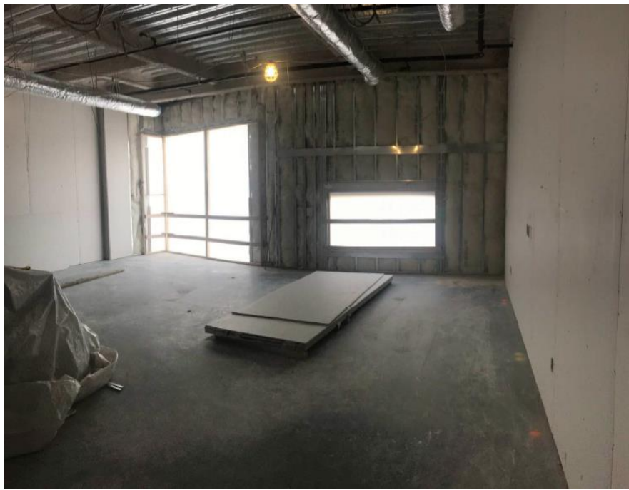
EXTERIOR WALL THERMAL INSULATION