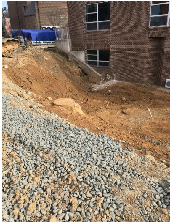
DEMOLITION OF RETAINING WALL ADJACENT TO TJMS