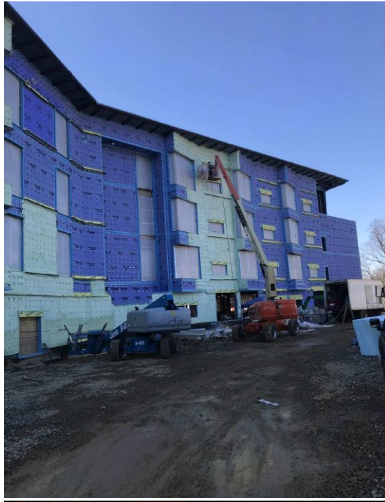
INSTALL OF SPRAY FOAM INSULATION/AIR BARRIER MATERIAL AT NORTH FACADE