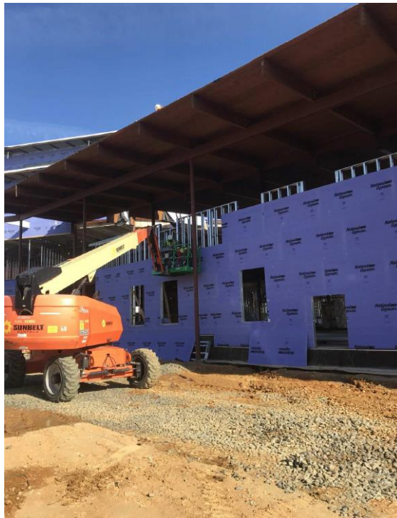
FRAMING AND SHEATHING OF GYM WALL ADJACENT TO S OLD GLEBE RD