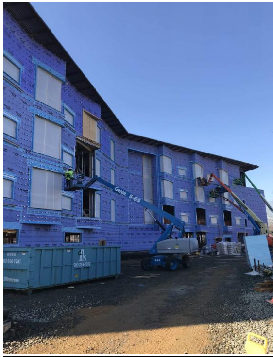
INSTALLATION OF FAÇADE CLADDING CLIPS AT NORTH FACADE