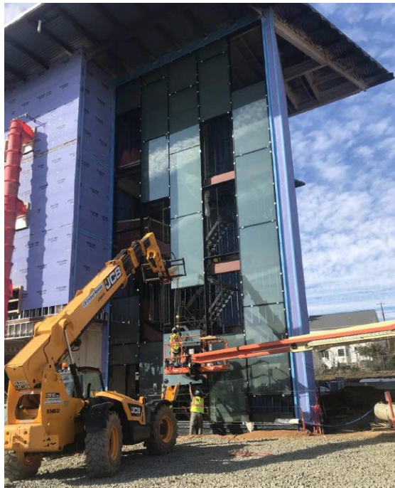
STAIR #3 CURTAINWALL GLAZING INSTALLATION