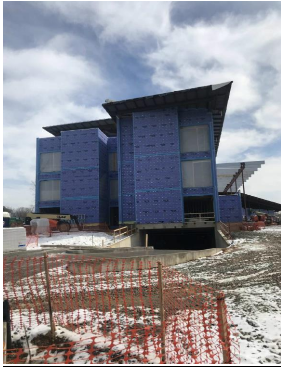
EXTERIOR WALL FRAMING AND SHEATHING COMPLETE AT FAÇADE ABOVE GARAGE ENTRY