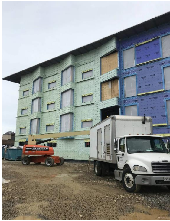
SPRAY FOAM INSULATION/AIR BARRIER MATERIAL AT NORTH FACADE