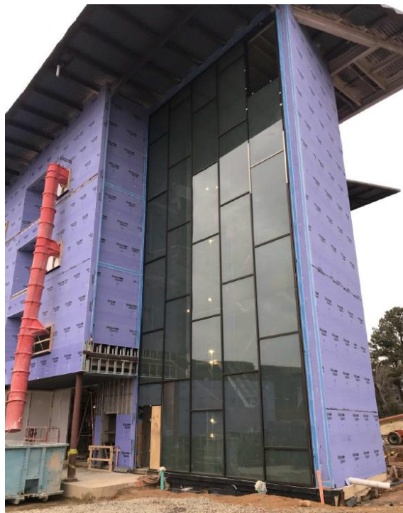
STAIR #3 CURTAINWALL GLAZING COMPLETE