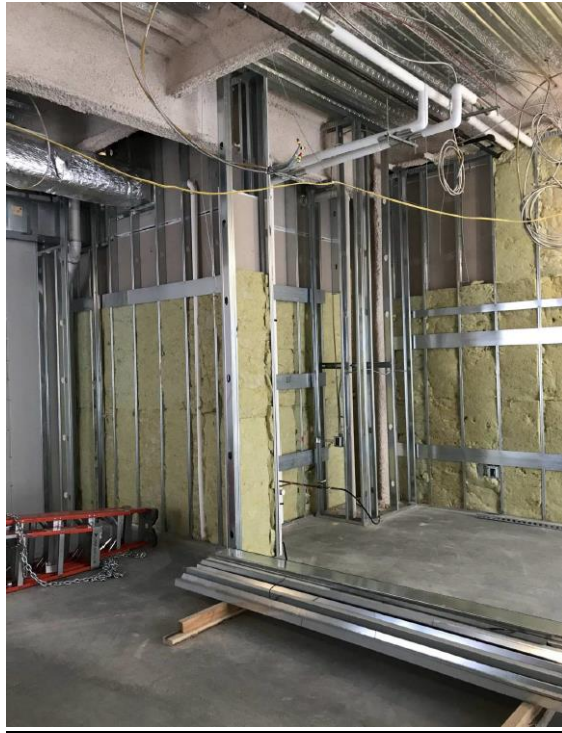
INTERIOR PARTITION WALL SOUND INSULATION