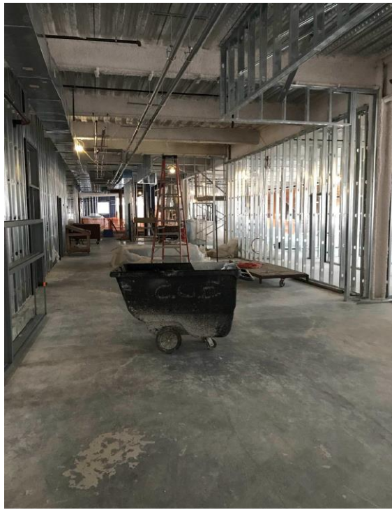
PROGRESS OF 1 ST FLOOR WALL FRAMING