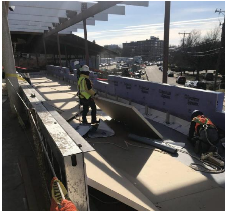
INSTALLATION OF ROOF SUBSTRATE AT ART ROOM EXTERIOR PORCH