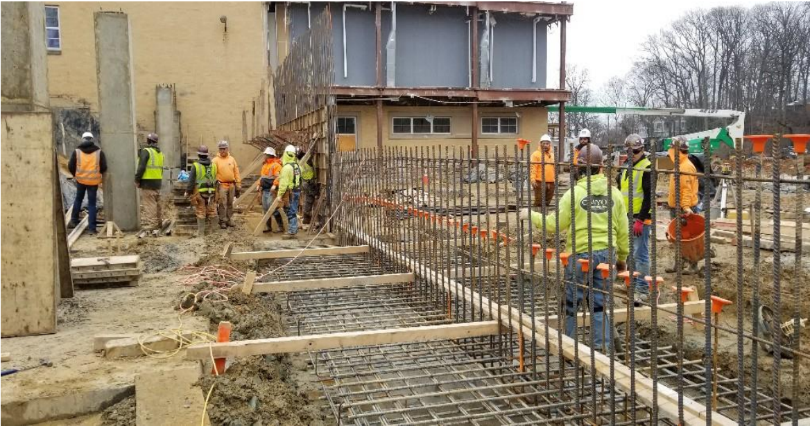
Level 1 / Level 2 Retaining Wall