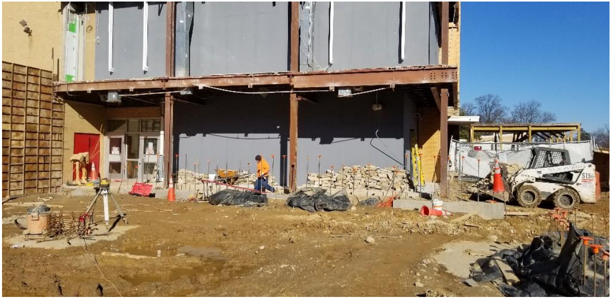
New 12-inch Firewall between existing and addition