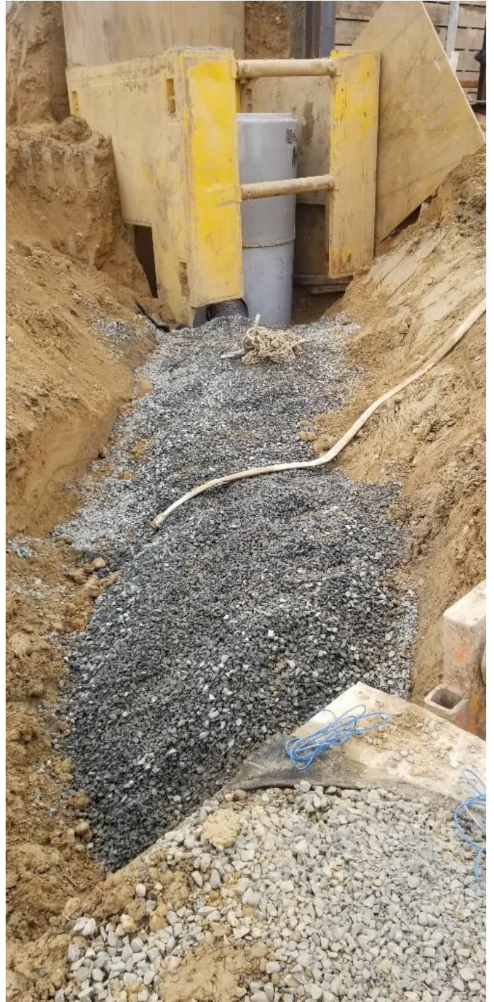
Water / Sewer line installation