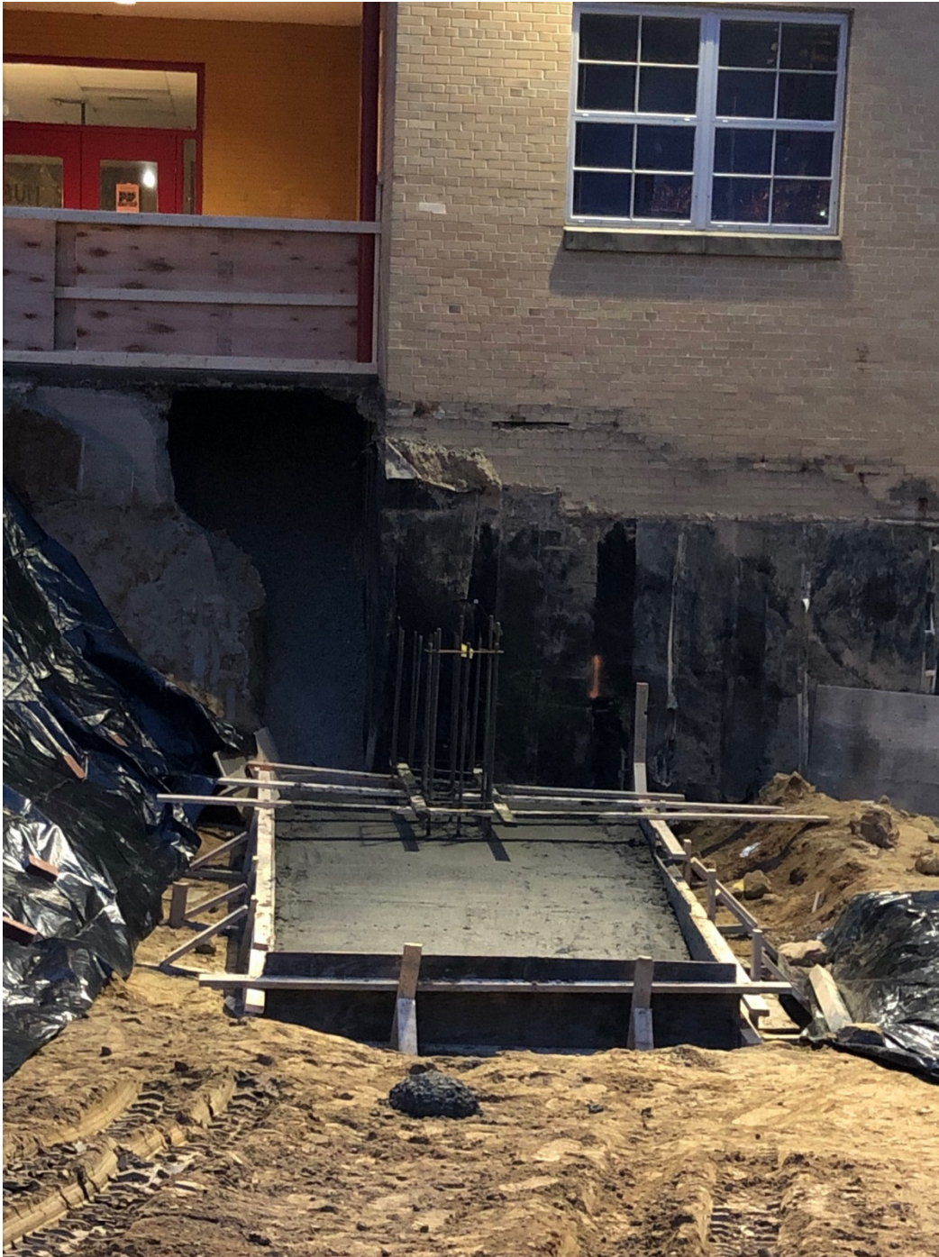
Unforeseen Cavity under Cafeteria walkway