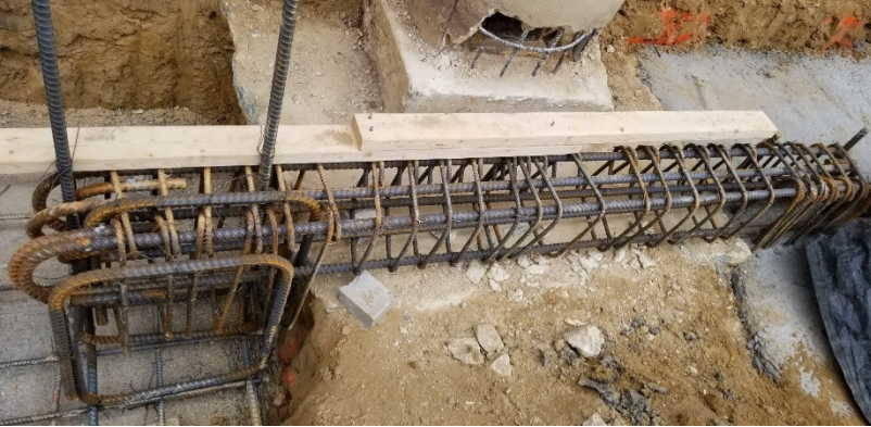
Foundations – 1 st floor