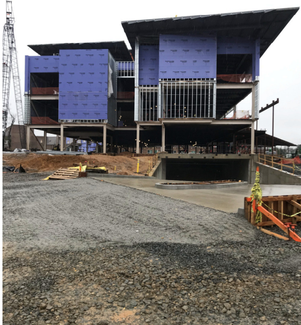
NORTH SIDE ELEVATION FRAMING AND SHEATHING PROGRESS AND VIEW OF POURED GARAGE RAMP CONNECTING TO BUS LOOP COMPACTED STONE BASE