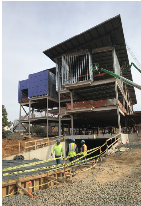
EXTERIOR WALL FRAMING AT NORTH FACADE