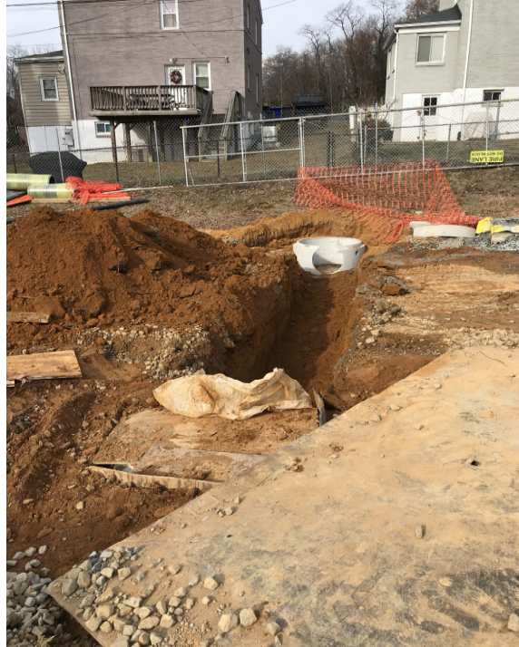
SITE STORMWATER PIPING AND STRUCTURE EXCAVATION