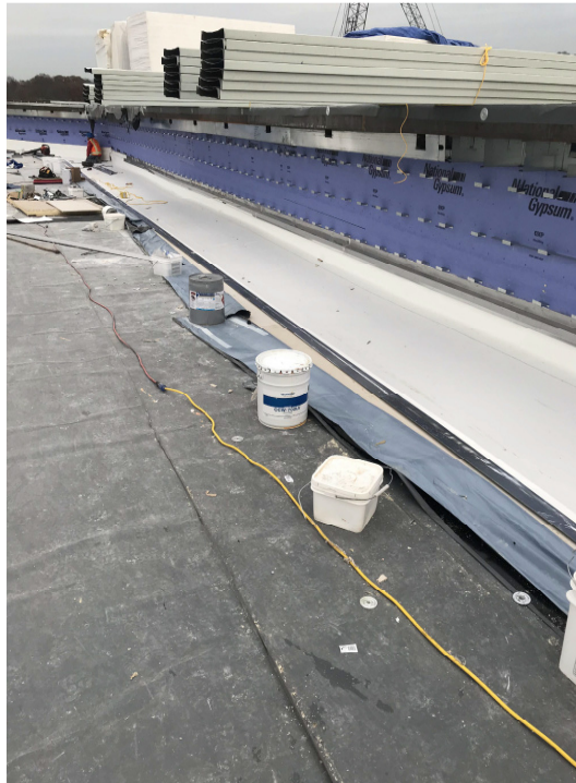
ROOFING UNDERLAYMENT INSTALLATION