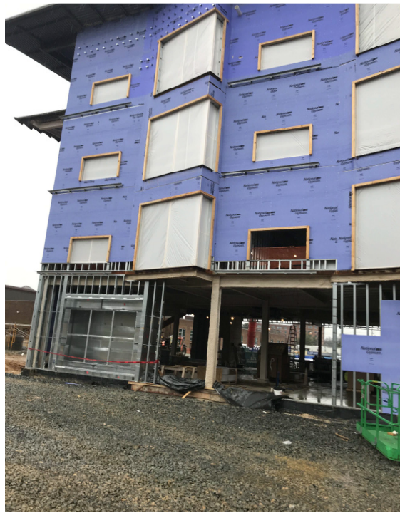
TEMPORARY WINDOW CLOSURES TO ALLOW FOR INTERIOR WORK