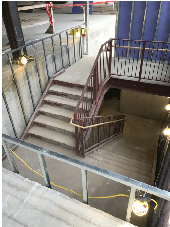
GARAGE STAIRS AND RAILING COMPLETE