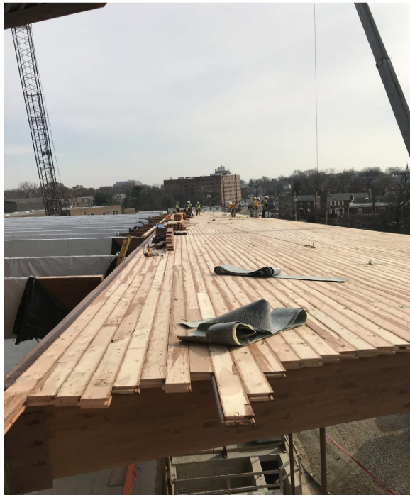
INSTALLATION OF STRUCTURAL WOOD DECKING OVER GYM