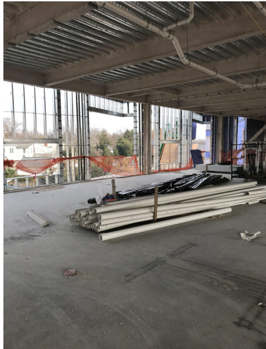
INTERIOR PLUMBING ROUGH-INS