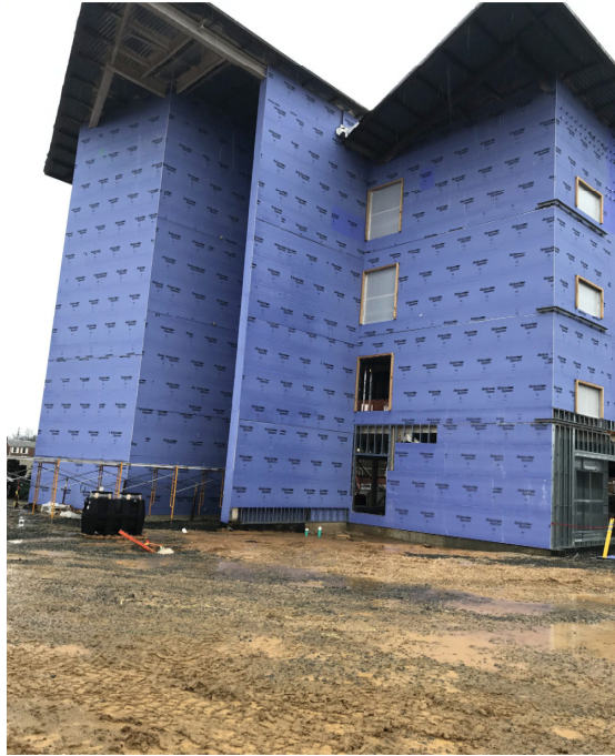
COMPLETION OF EXTERIOR WALL SHEATHING AT THE EAST FAÇADE