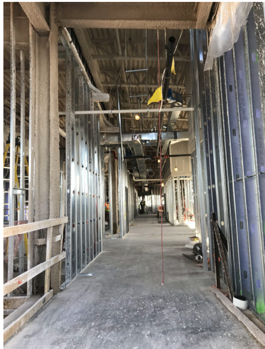
INTERIOR WALL FRAMING