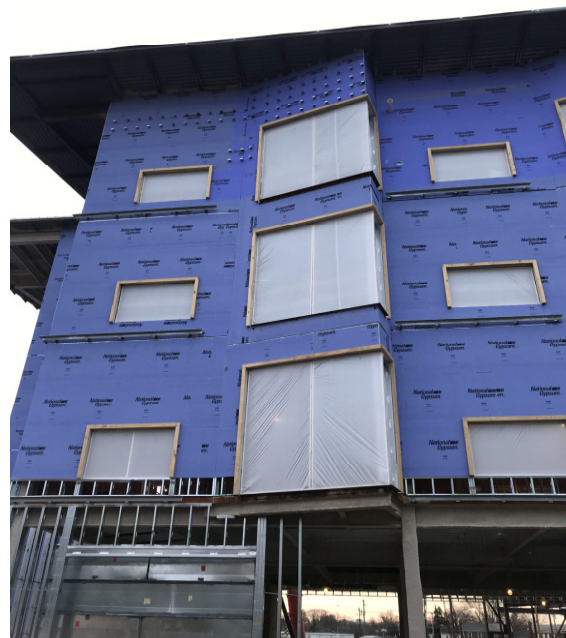
INSTALLATION OF CLIPS ON EXTERIOR SHEATHING FOR ATTACHMENT OF EXTERIOR FAÇADE CLADDING