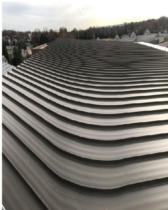
STANDING SEAM METAL ROOF INSTALLATION ON UPPER ROOF