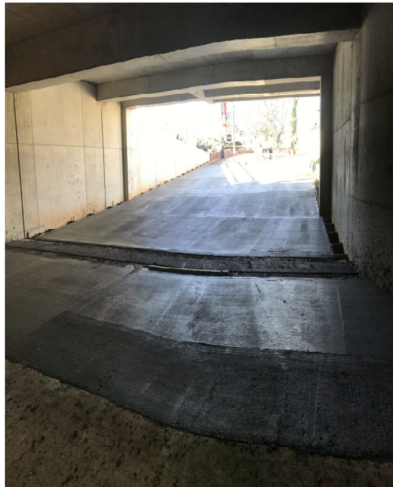
GARAGE CONCRETE RAMP POURED (VIEW FROM INSIDE GARAGE)