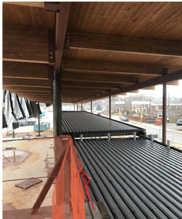
VIEW OF STRUCTURAL WOOD ROOF/CEILING OVER GYM AND LIBRARY