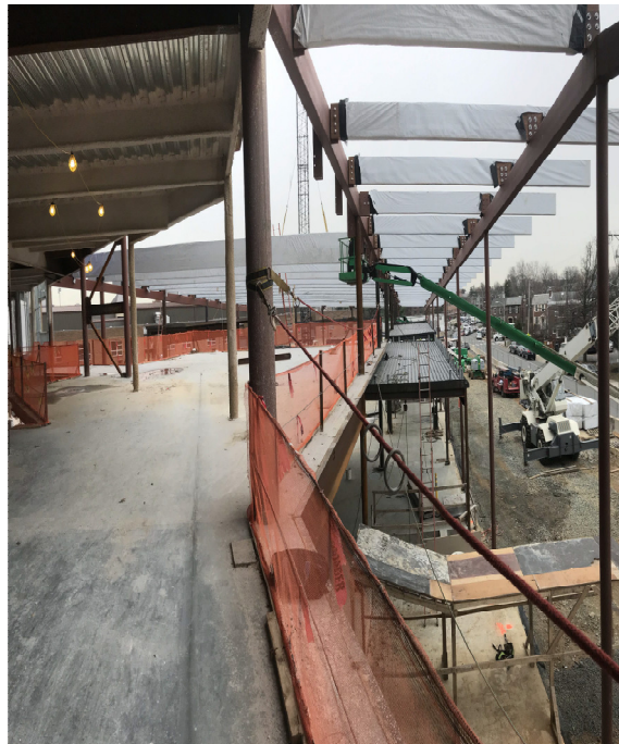
FRAMING OF STRUCTURAL WOOD CEILING/ROOF VIEW FROM 2 ND FLOOR