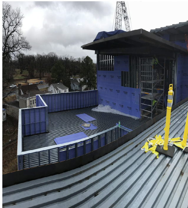
EXTERIOR WALL FRAMING AND SHEATHING AT 4 TH FLOOR OUTDOOR CLASSROOM