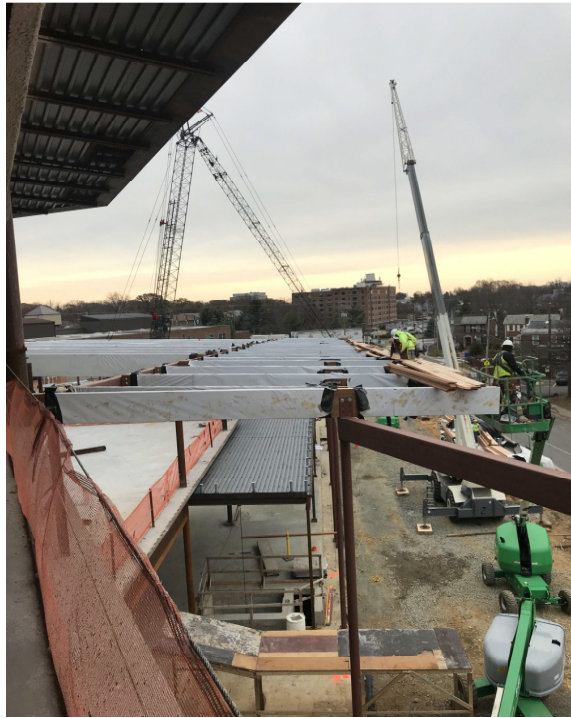
STRUCTURAL WOOD CEILING/ROOF FRAMING OVER GYM SPACE