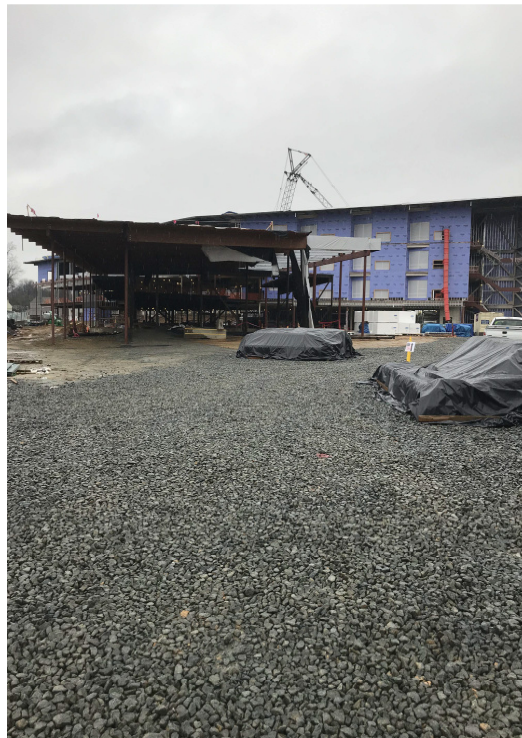
SOUTH FAÇADE PROGRESS, INCLUDING STRUCTURAL WOOD ROOF OVER GYM