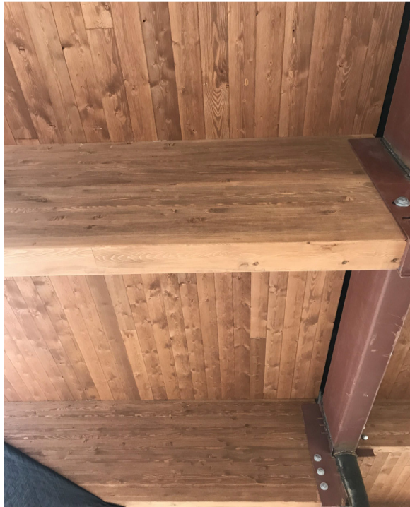
DETAIL OF STRUCTURAL WOOD CEILING OVER GYM AND LIBRARY