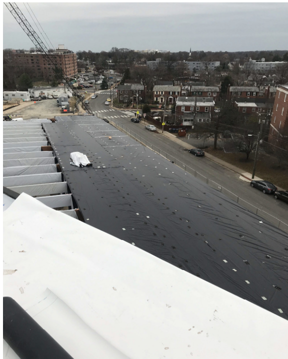
WATERPROOFING MEMBRANE IN PLACE OVER GYM STRUCTURAL WOOD DECK