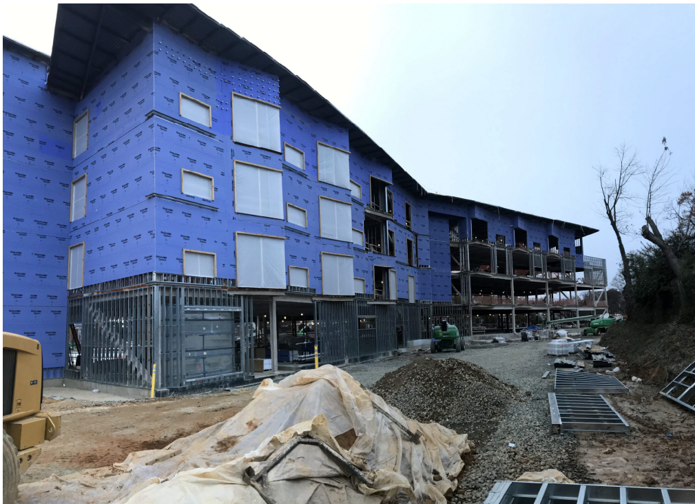
NORTH SIDE ELEVATION FRAMING AND SHEATHING PROGRESS