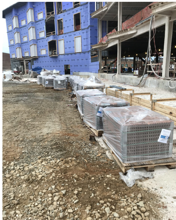
EXTERIOR CLADDING MATERIAL STOCKED ON SITE