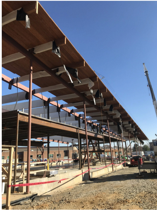
FRAMING OF STRUCTURAL WOOD CEILING/ROOF OVER GYM AND LIBRARY