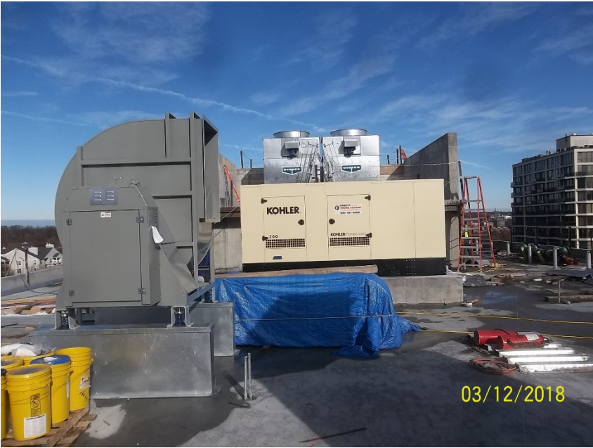
Cooling towers delivered and set