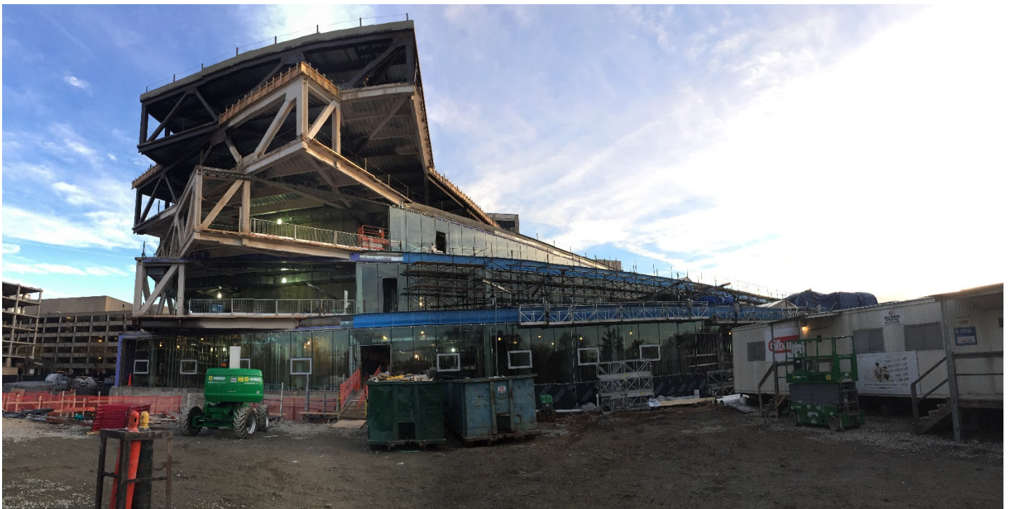
Curtainwall installation on north side