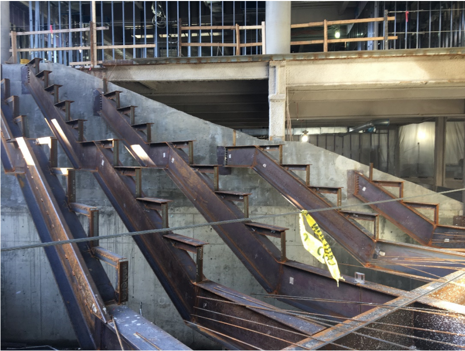
Steps up to library next to lobby