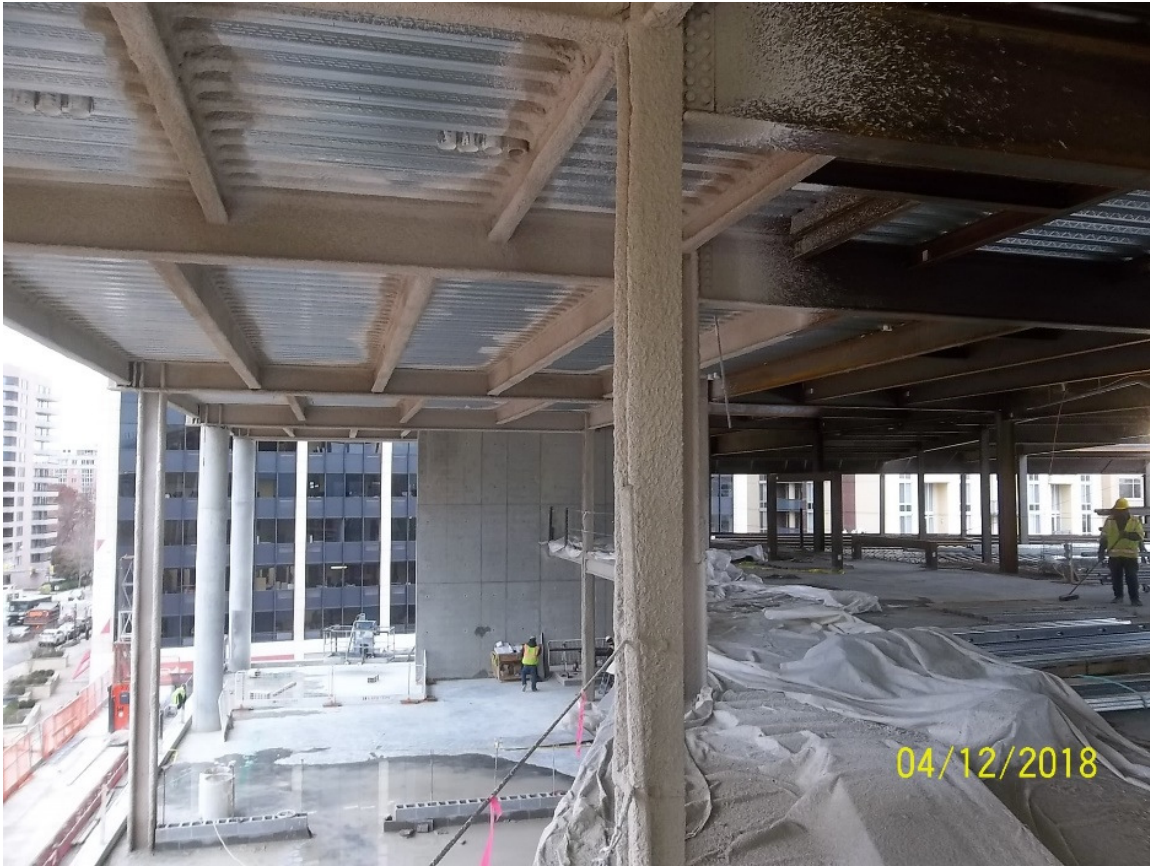
Level 3 music/choir rehearsal rooms fireproofing