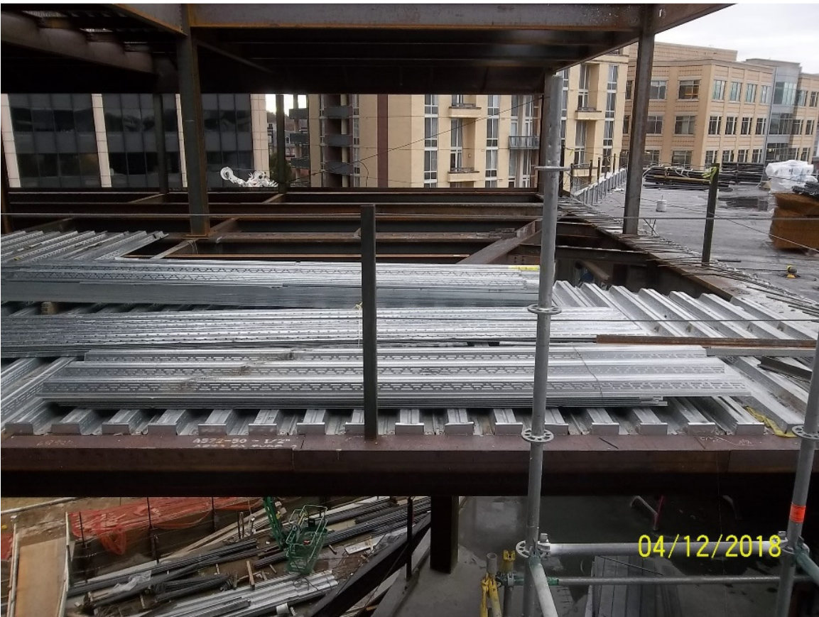
Level 4 steel framing/decking