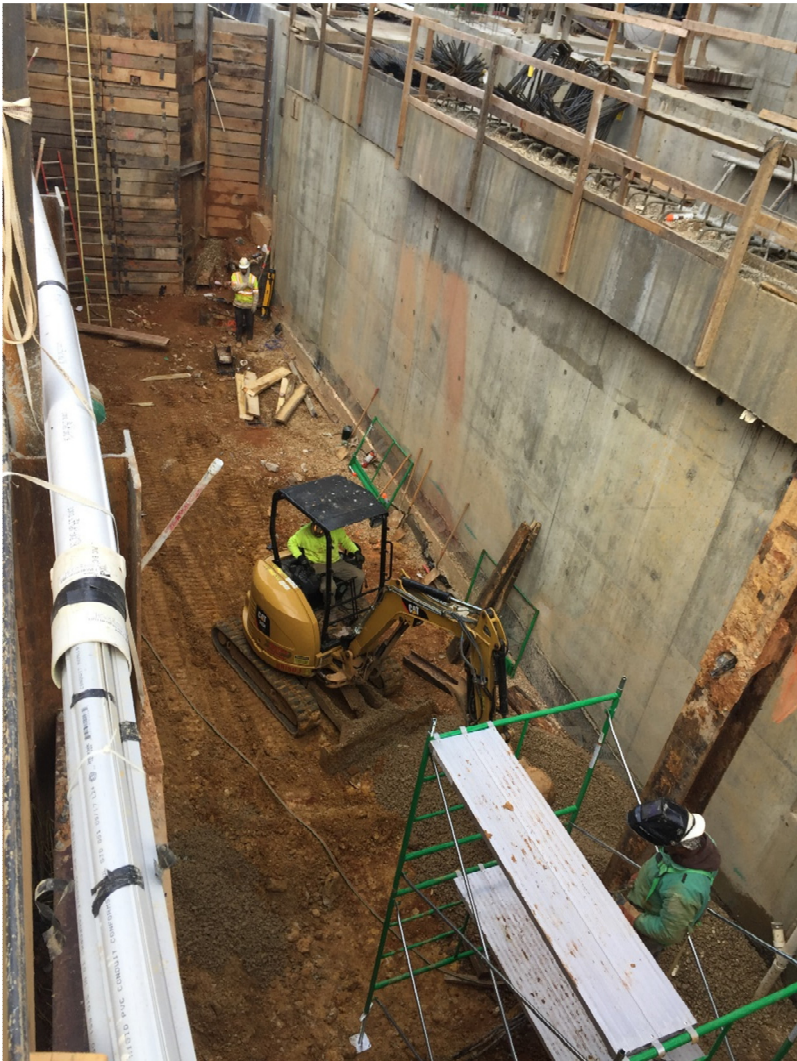
DVP vault excavation completed