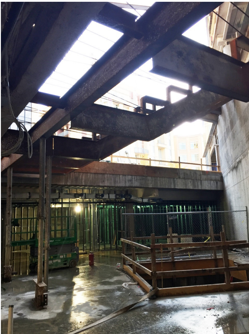
Art studio after tower crane removed