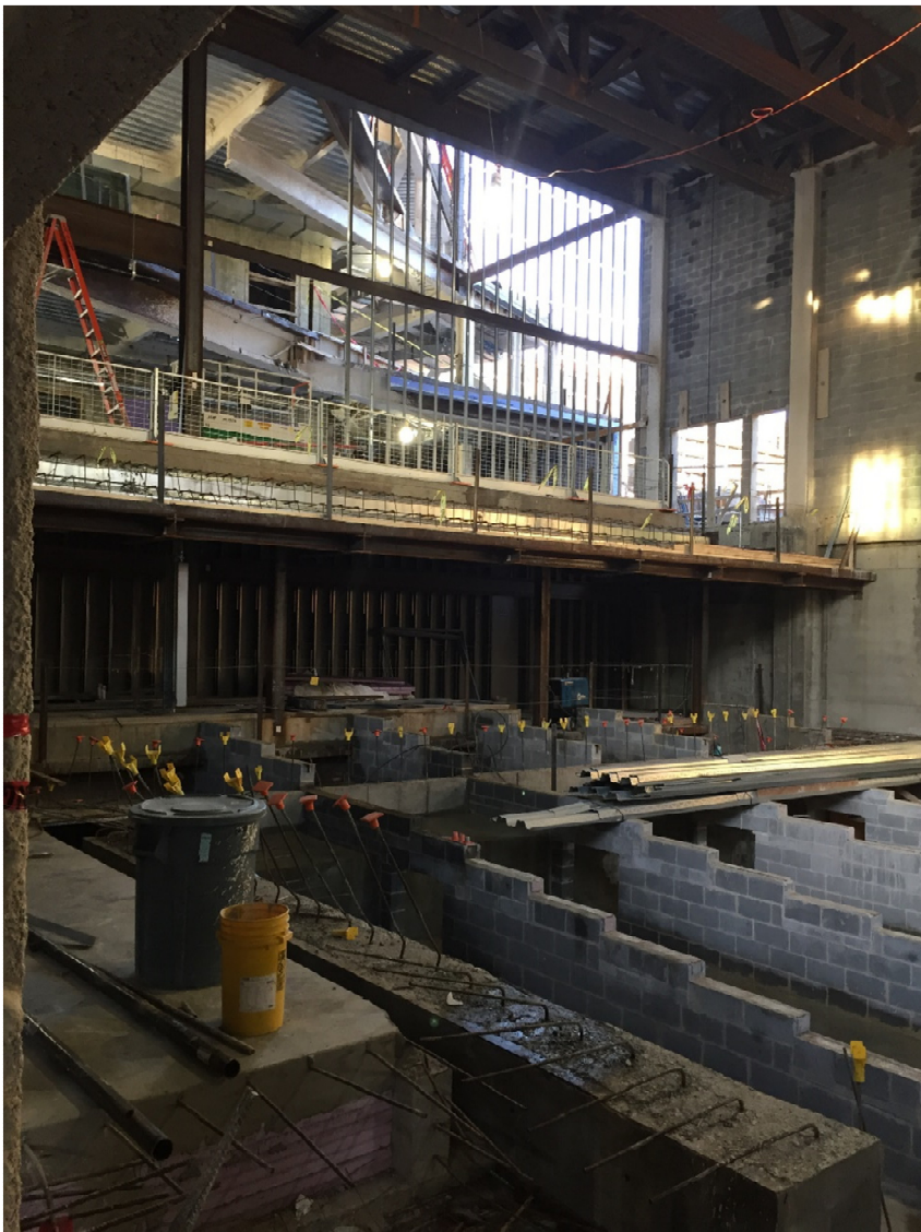
View towards auditorium balcony