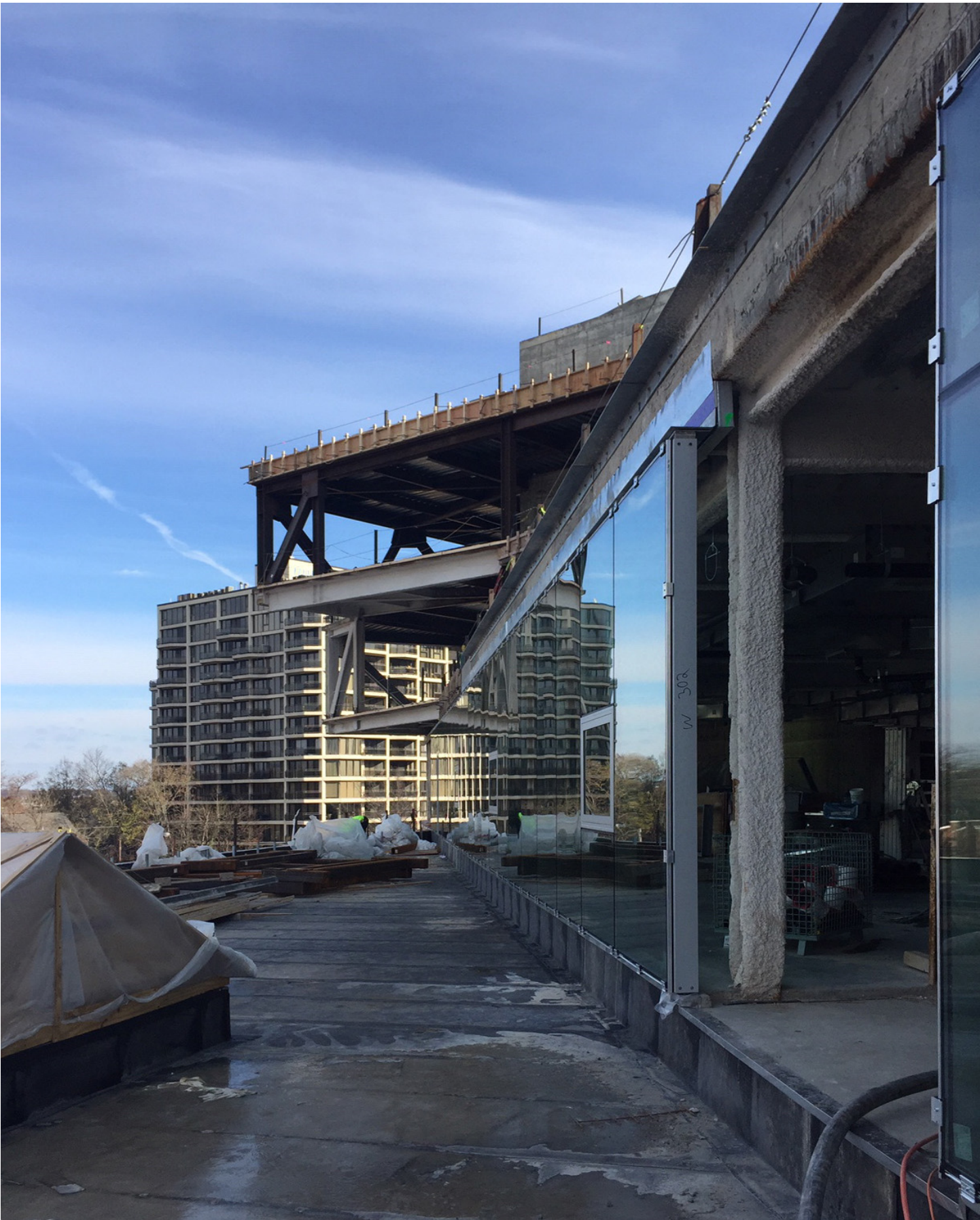
Level 3 curtain wall installation next to terrace