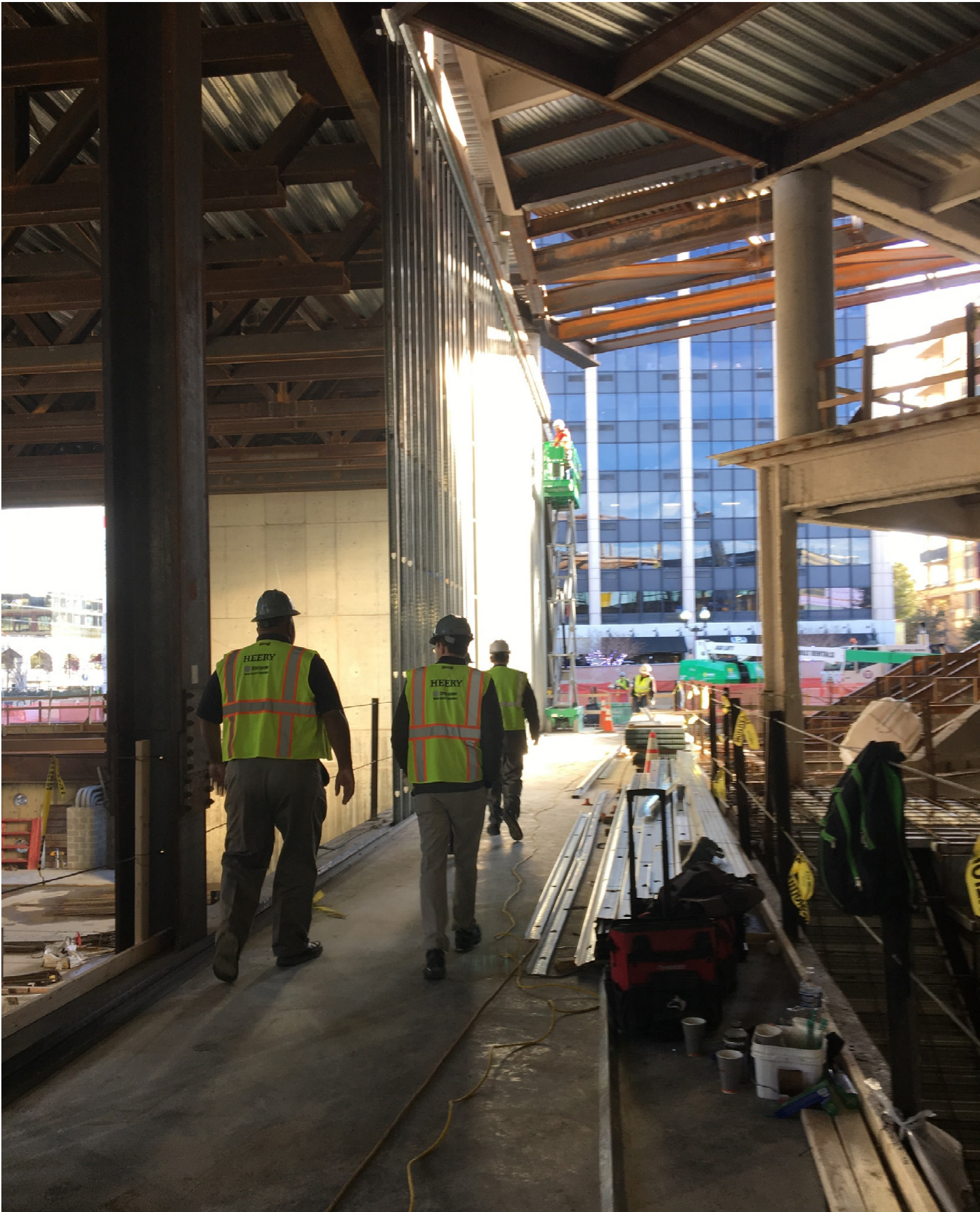
View towards Wilson entrance