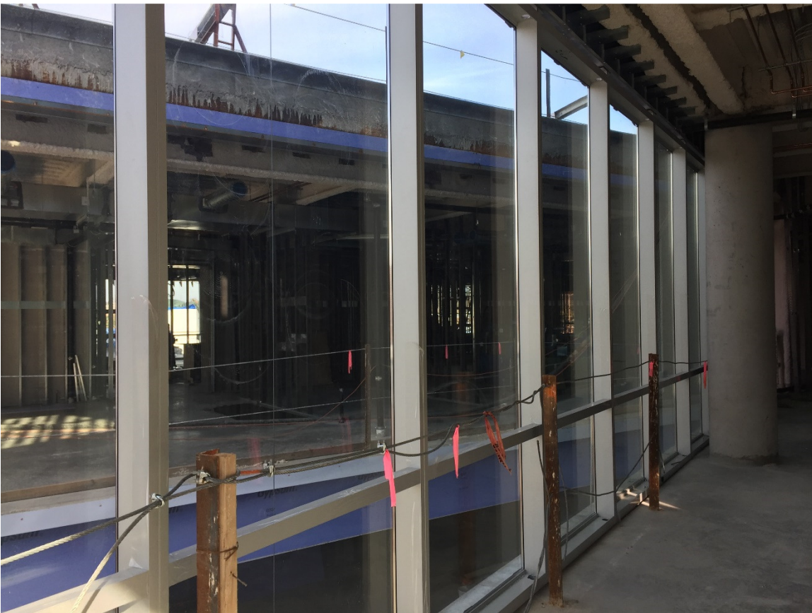
Level 2 curtain wall next to courtyard