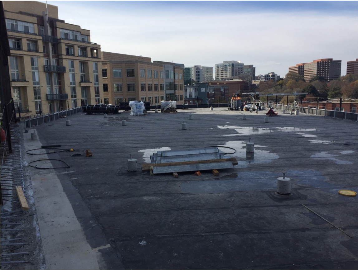
Level 3 terrace