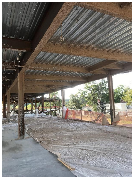
SPRAY FIREPROOFING OF STRUCTURAL STEEL