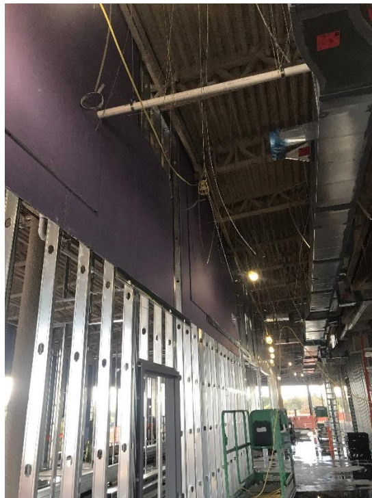
MECHANICAL, ELECTRICAL, PLUMBING ROUGH-IN INSTALLATION