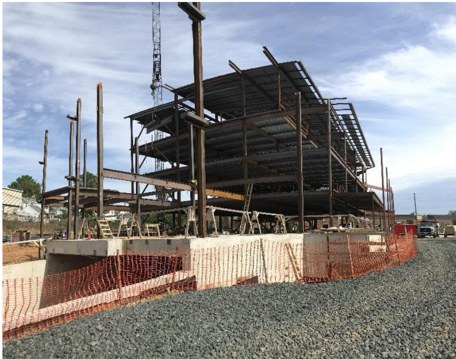
STRUCTURAL STEEL ERECTION