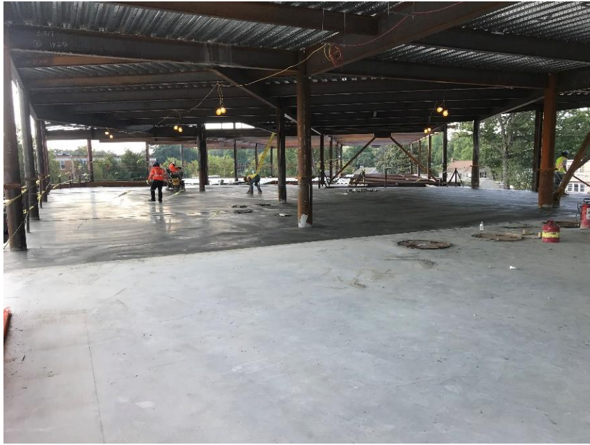
CONCRETE FINISHING AT ELEVATED DECK POUR