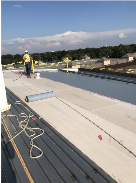
ROOFING UNDERLAYMENT INSTALLATION