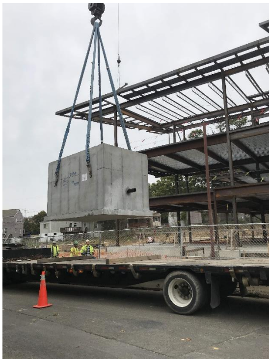
SETTING OF WATER METER VAULT