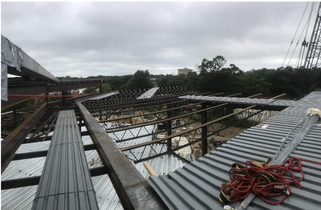
INSTALLATION OF METAL DECK ON ROOF JOISTS