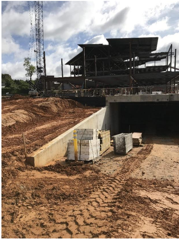
GARAGE RAMP WALL AND RAMP PREP