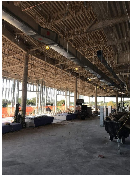
MECHANICAL, ELECTRICAL, PLUMBING ROUGH-IN INSTALLATION