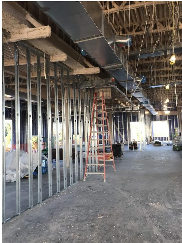
INTERIOR WALL FRAMING