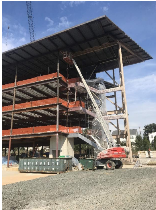
SPRAY FIREPROOFING OF STRUCTURAL STEEL