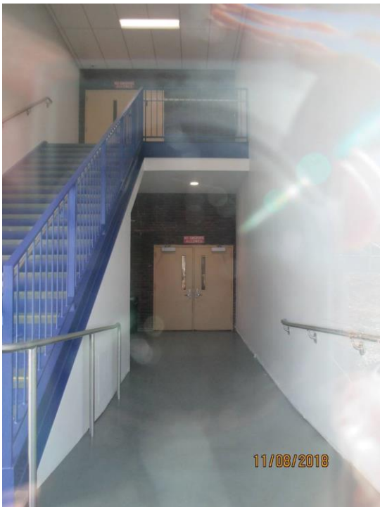
TJMS STAIRWELL INTERIOR