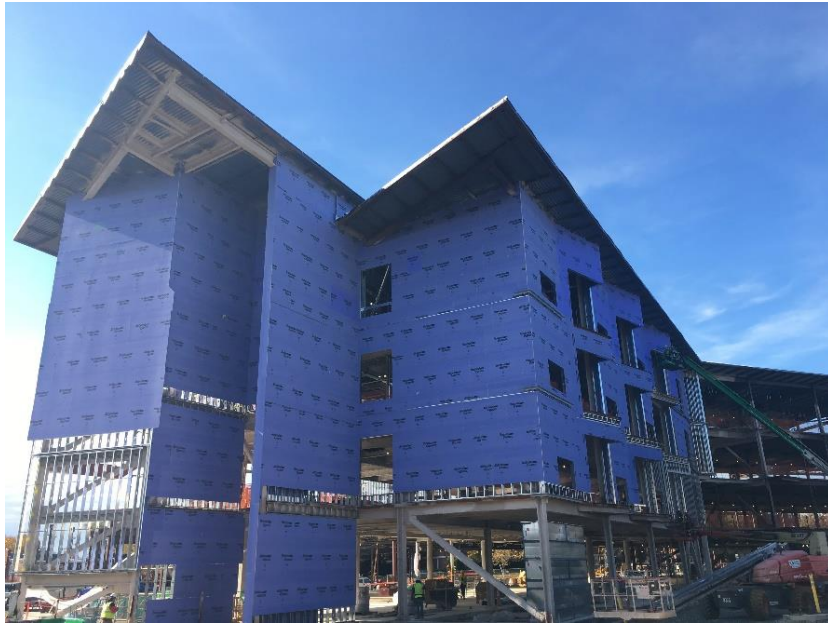
SHEATHING OF EXTERIOR WALLS