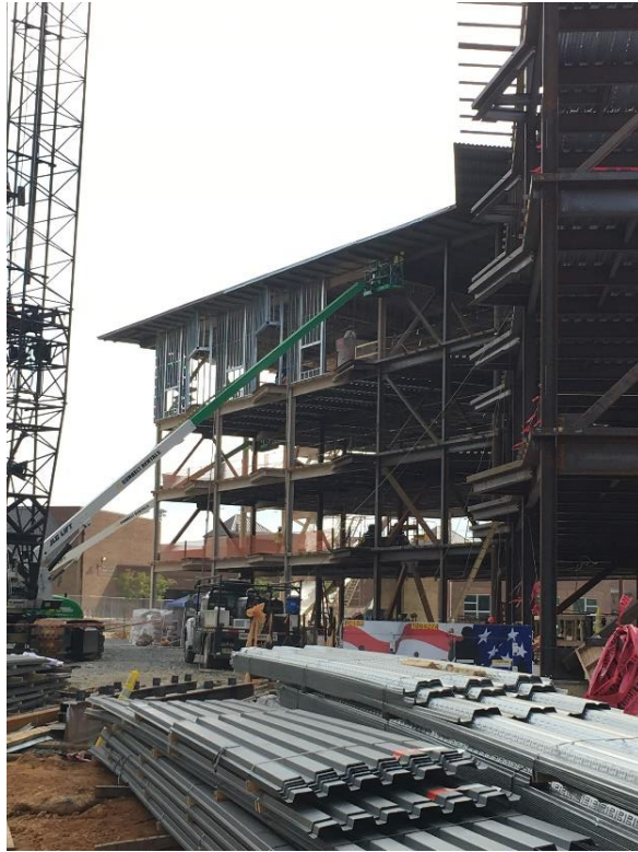
EXTERIOR WALL FRAMING