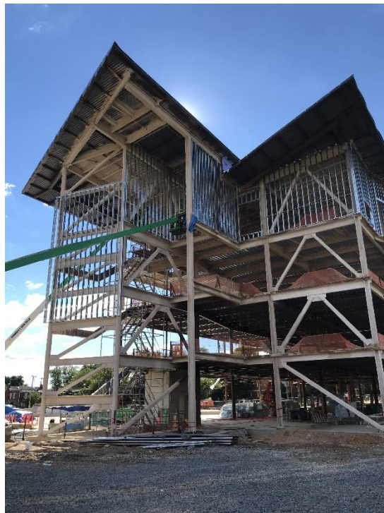
EXTERIOR WALL FRAMING