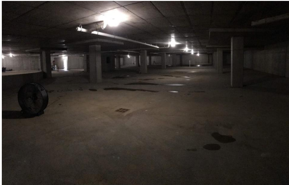
GARAGE MECHANICAL, ELECTRICAL, PLUMBING WORK