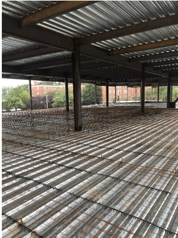
PREPARATION OF ELEVATED DECK FOR CONCRETE POUR