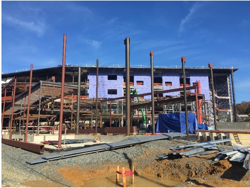
STRUCTURAL STEEL ERECTION AT THE GYM