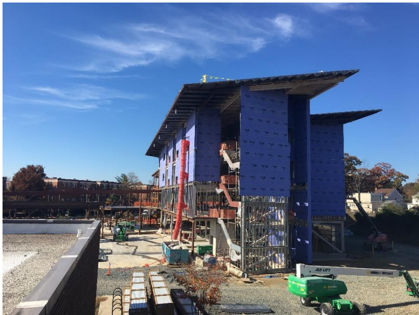
SHEATHING OF EXTERIOR WALLS