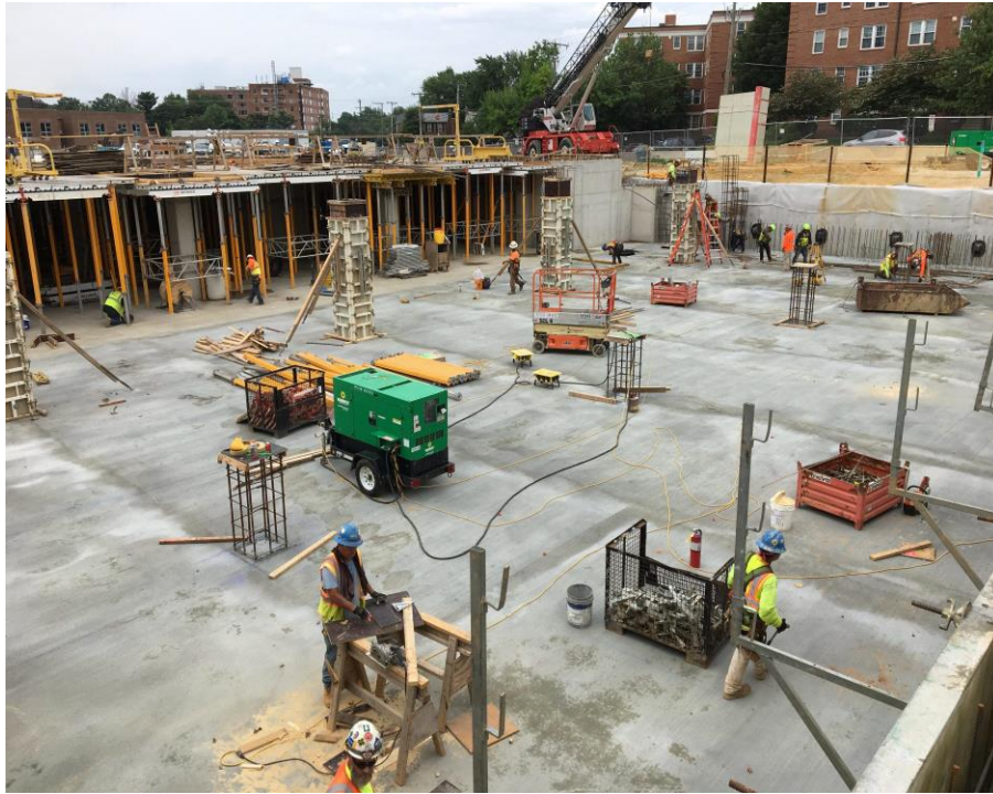
LAST SECTION OF GARAGE UPPER LEVEL DECK POURED AND SETTING OF FORMWORK FOR UPPER LEVEL COLUMNS