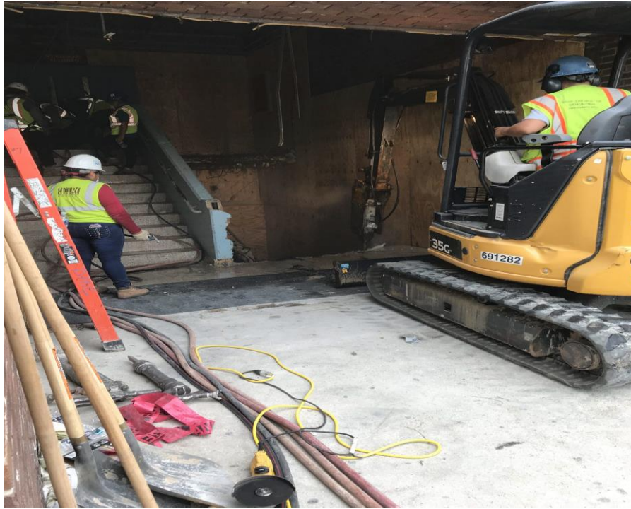
DEMOLITION OF JEFFERSON MIDDLE SCHOOL STAIRWELLS