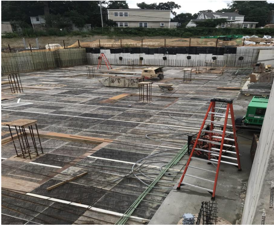
FORMWORK INSTALLATION FOR LAST GARAGE UPPER LEVEL DECK POUR