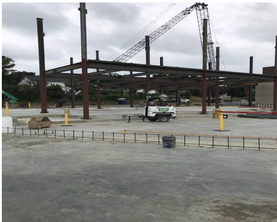
ONGOING STRUCTURAL STEEL ERECTION