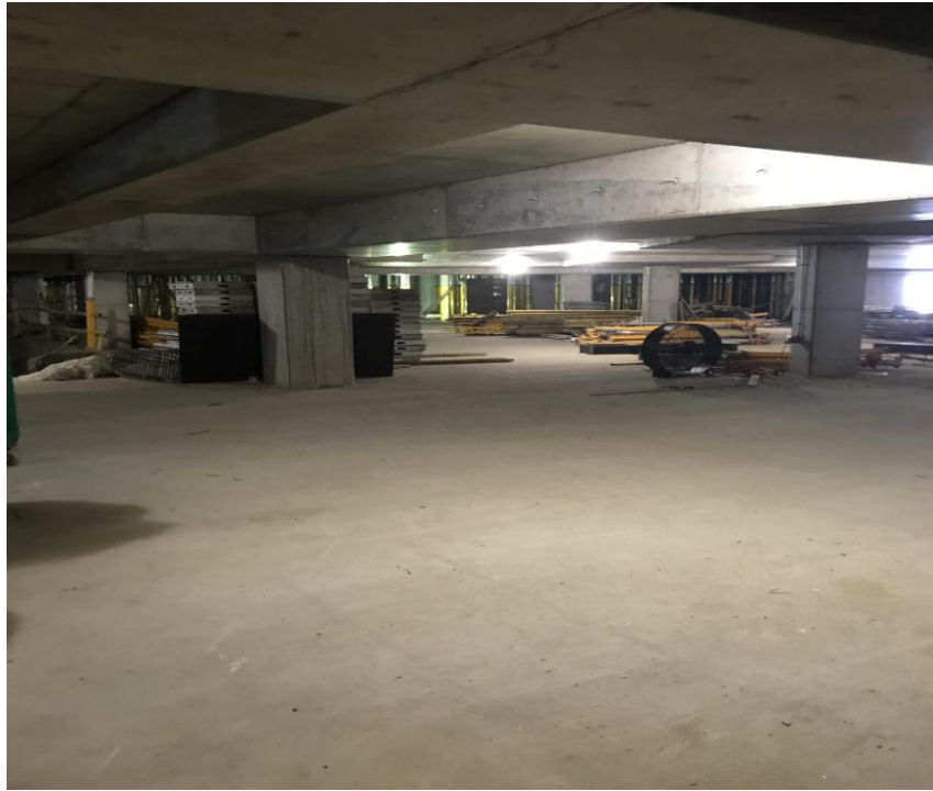
INTERIOR VIEW OF GARAGE LOWER LEVEL