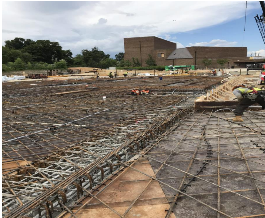
INSTALLATION OF REINFORCING STEEL AT GARAGE ROOF (1 ST FLOOR OF SCHOOL)