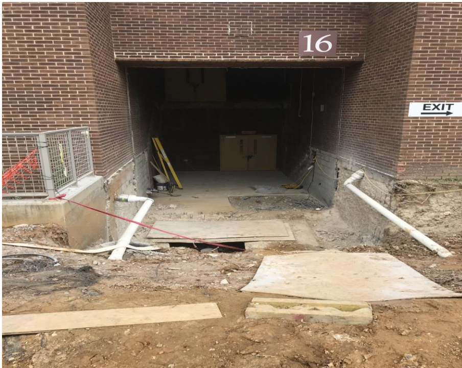
COMPLETED DEMOLITION OF STAIRWELLS