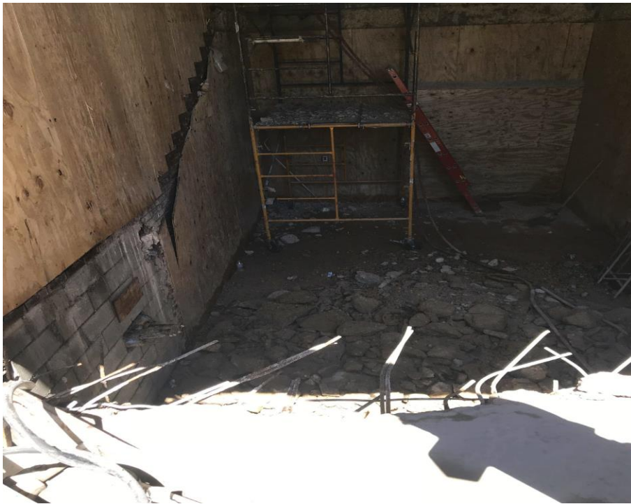
COMPLETED DEMOLITION OF STAIRWELLS