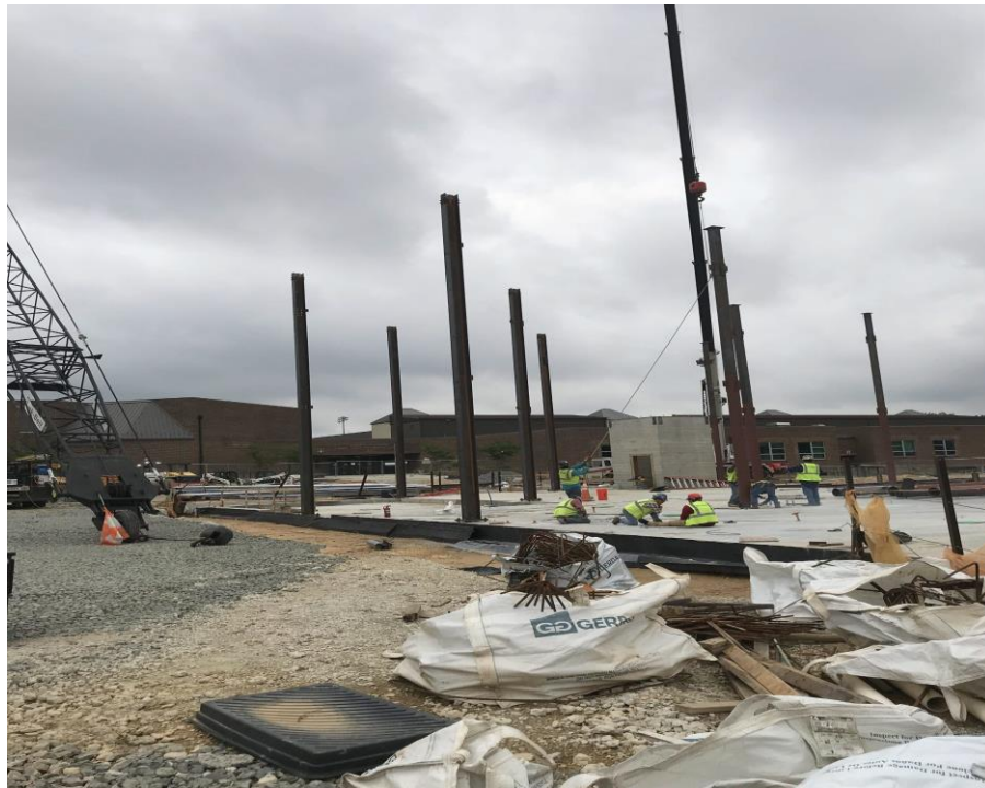
START OF STEEL ERECTION OF 4-STORY ABOVE GRADE BUILDING