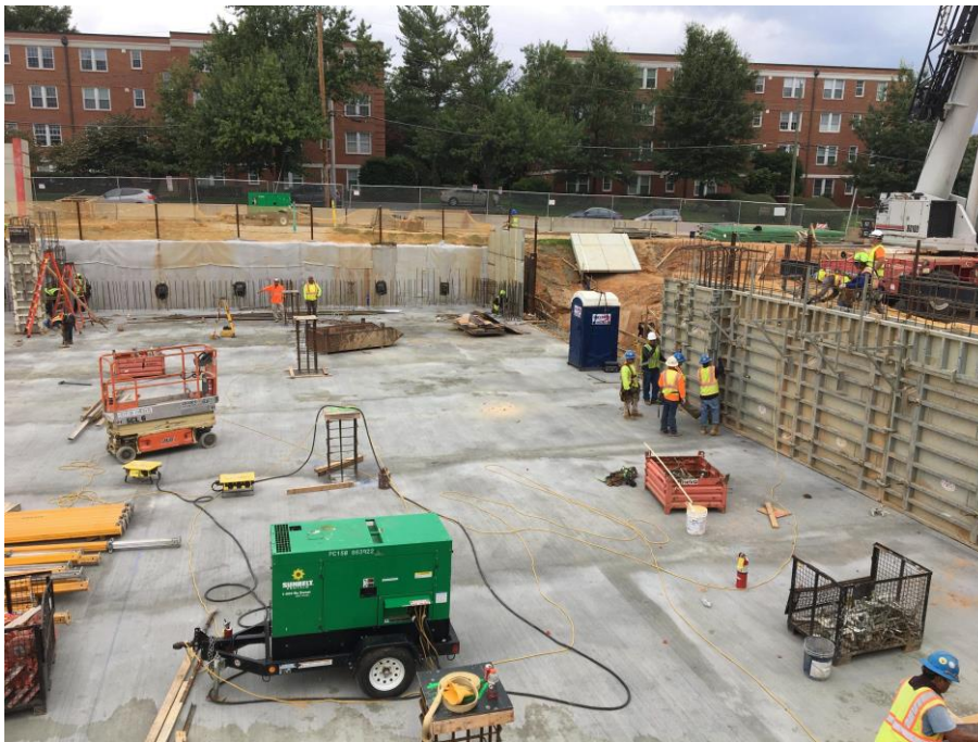
FORMING OF LAST SECTION OF GARAGE UPPER LEVEL WALLS