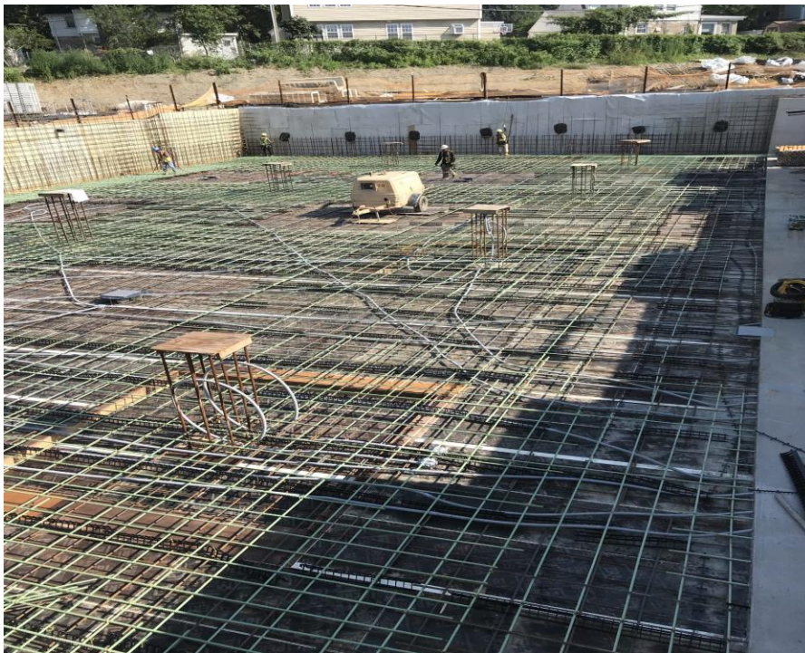
INSTALLATION OF REINFORCING STEEL FOR LAST GARAGE UPPER LEVEL DECK POUR