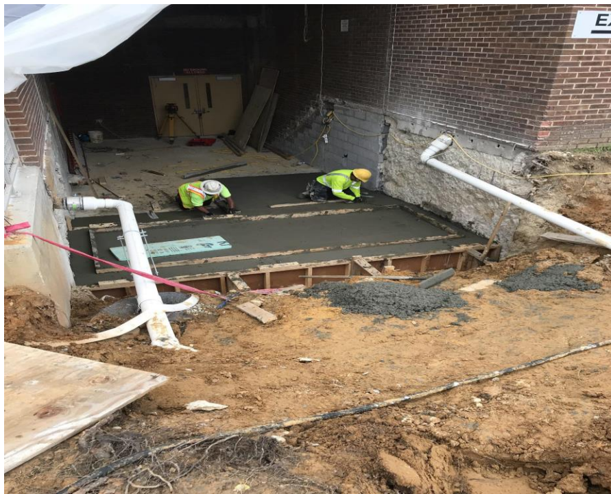
FINISHING STAIRWELL CONCRETE SLAB