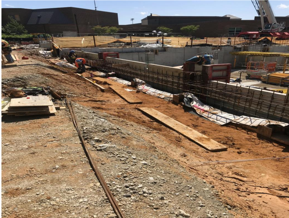
INSTALLATION OF REINFORCING STEEL AT LAST SECTION OF GARAGE WALLS