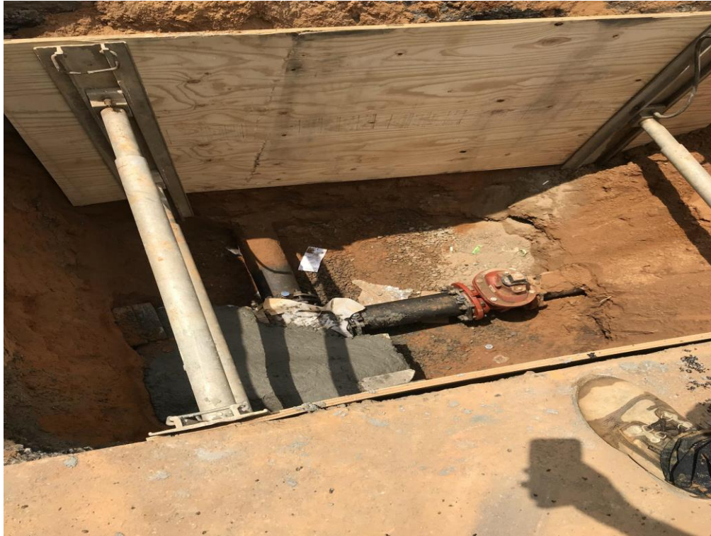
NEW WATER SERVICE INSTALLED