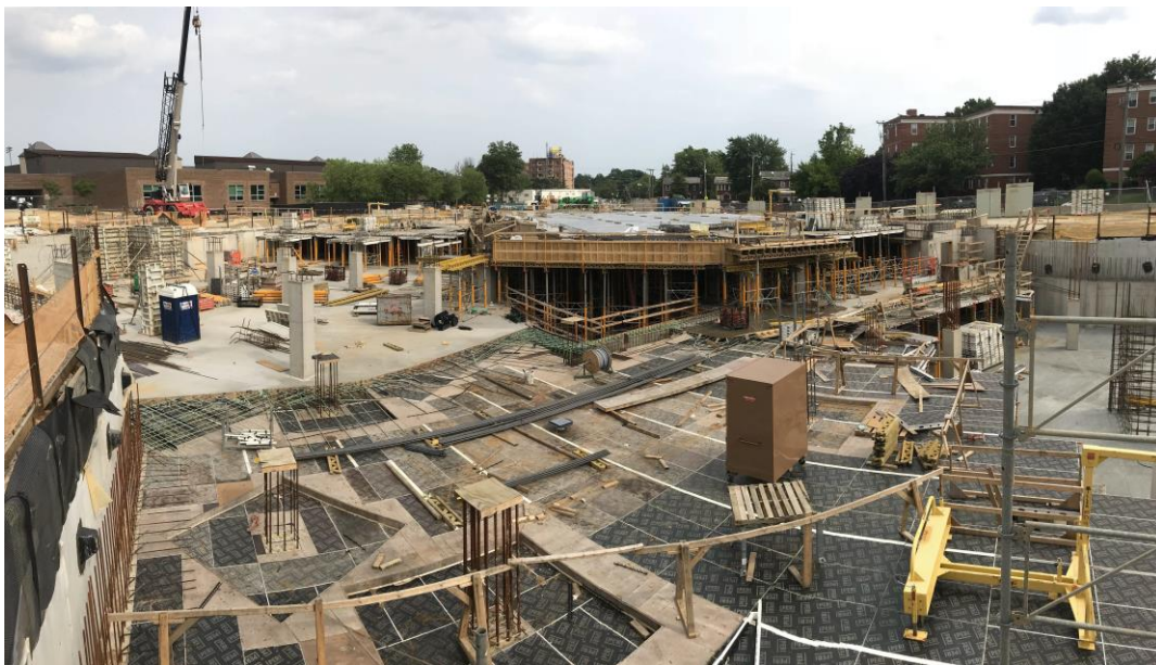
FORMWORK INSTALLATION AT BOTH GARAGE UPPER LEVEL AND GROUND FLOOR DECKS