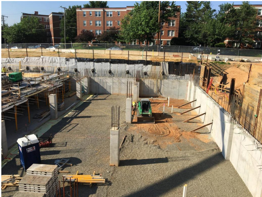
PREP OF STONE BASE AT LAST SECTION OF GARAGE LOWER LEVEL SLAB