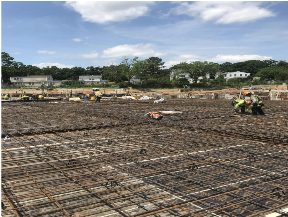
INSTALLATION OF REINFORCING STEEL AT GROUND FLOOR DECK