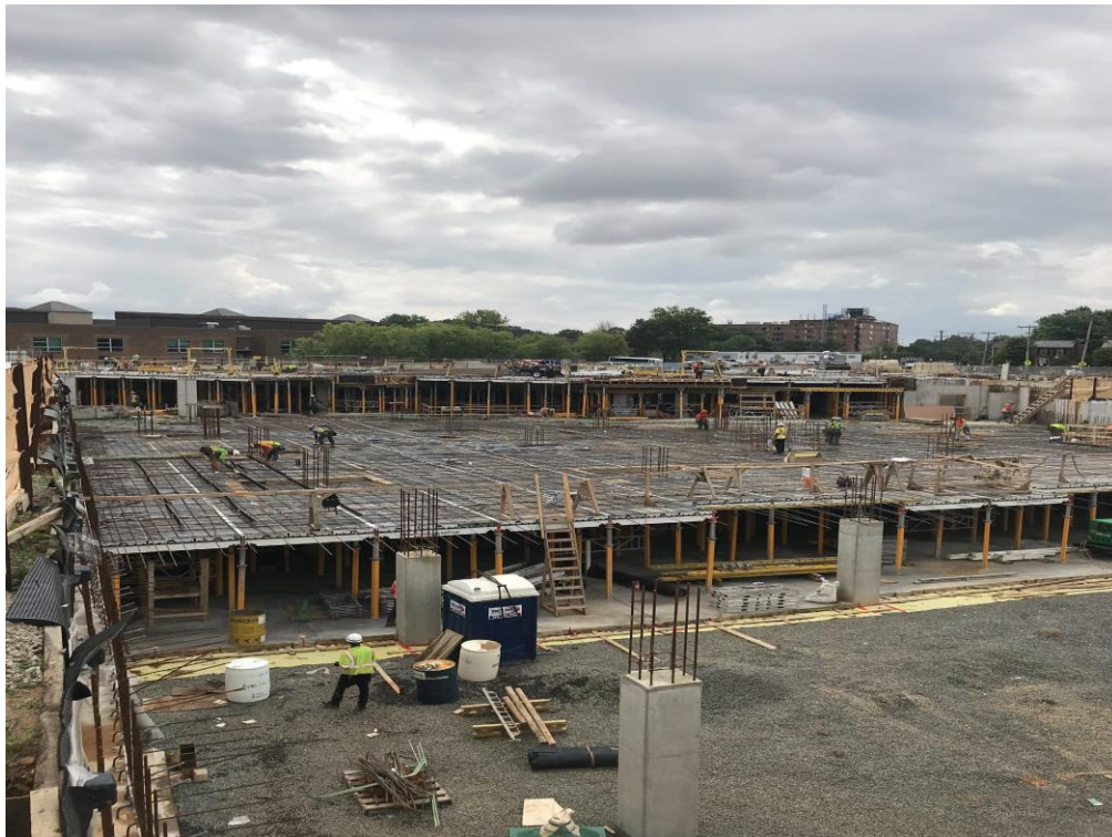
PROGRESSING ALL 3 LEVELS SIMULTANEOUSLY