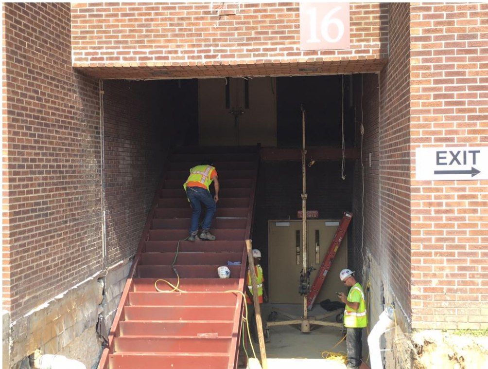
INSTALLATION OF NEW STAIR AT TJMS STAIRWELL RENOVATION