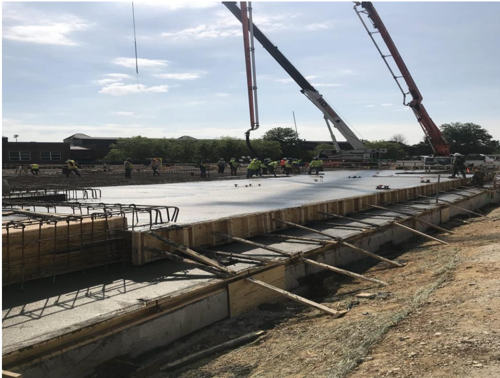
GROUND FLOOR (GYM) CONCRETE DECK POUR IN PROGRESS