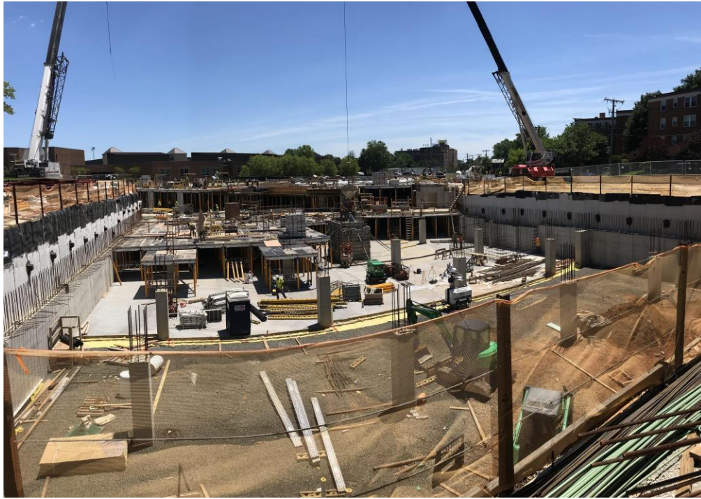
WORKING 2 GARAGE LEVELS AND GROUND FLOOR LEVEL SIMULTANEOUSLY