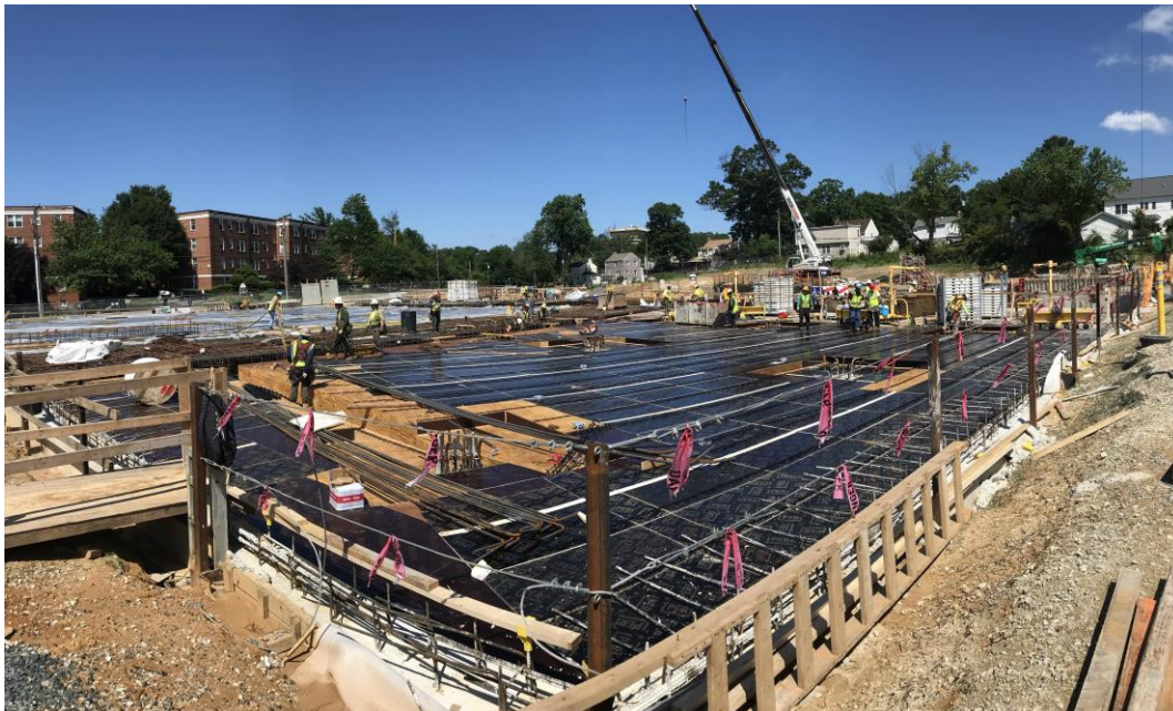
FORMWORK INSTALLATION FOR GROUND FLOOR (CAFETERIA) DECK