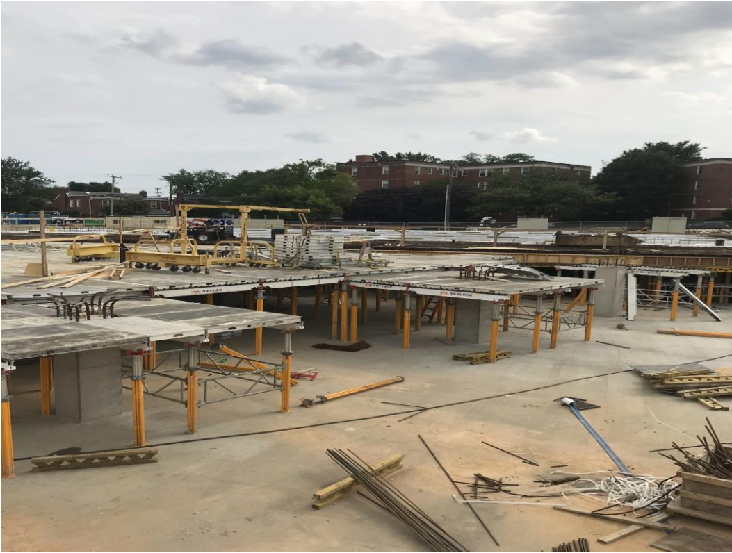
FORMWORK INSTALLATION FOR GROUND FLOOR DECK ABOVE GARAGE UPPER LEVEL DECK