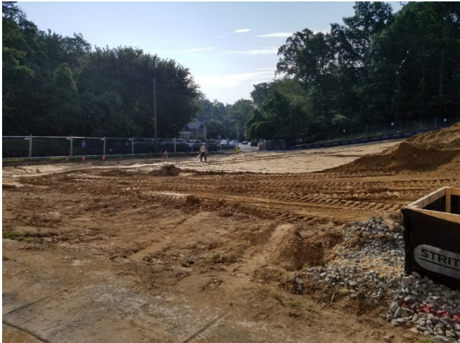
Rough grading for new Employee Parking lot