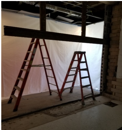
Door opening for new Elevator