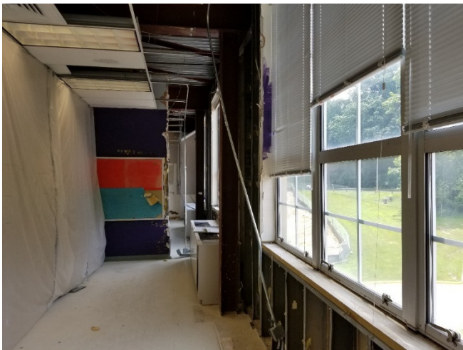
Partial demolition of classroom for new exterior finishes