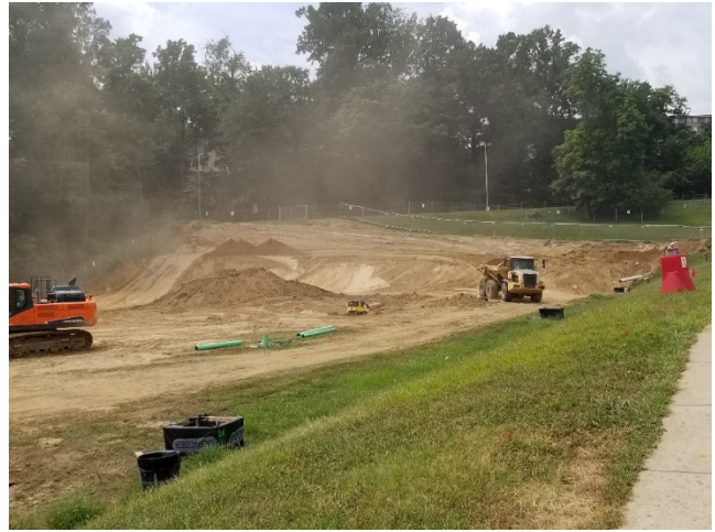
Rough grading for new Drop-Off Lane