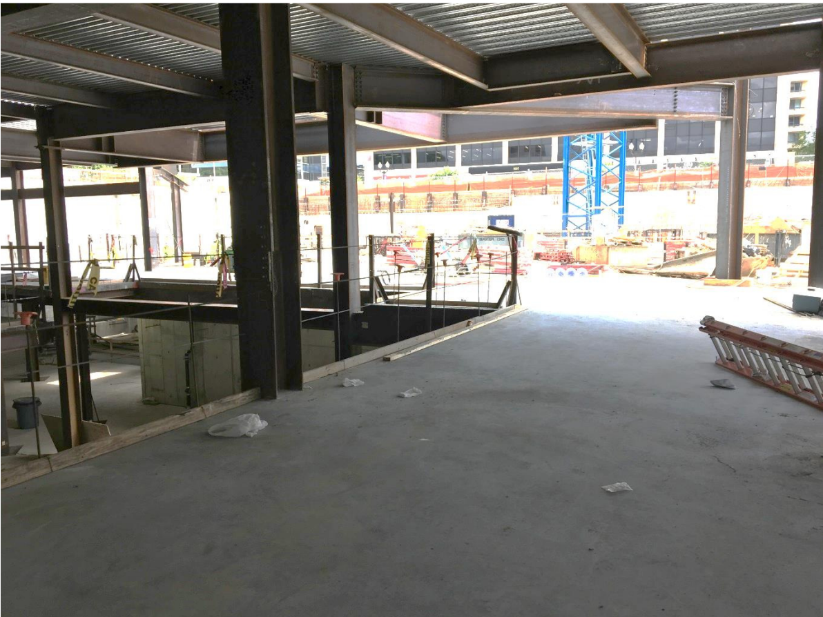
Slab on deck connects to slab on grade @G1 level