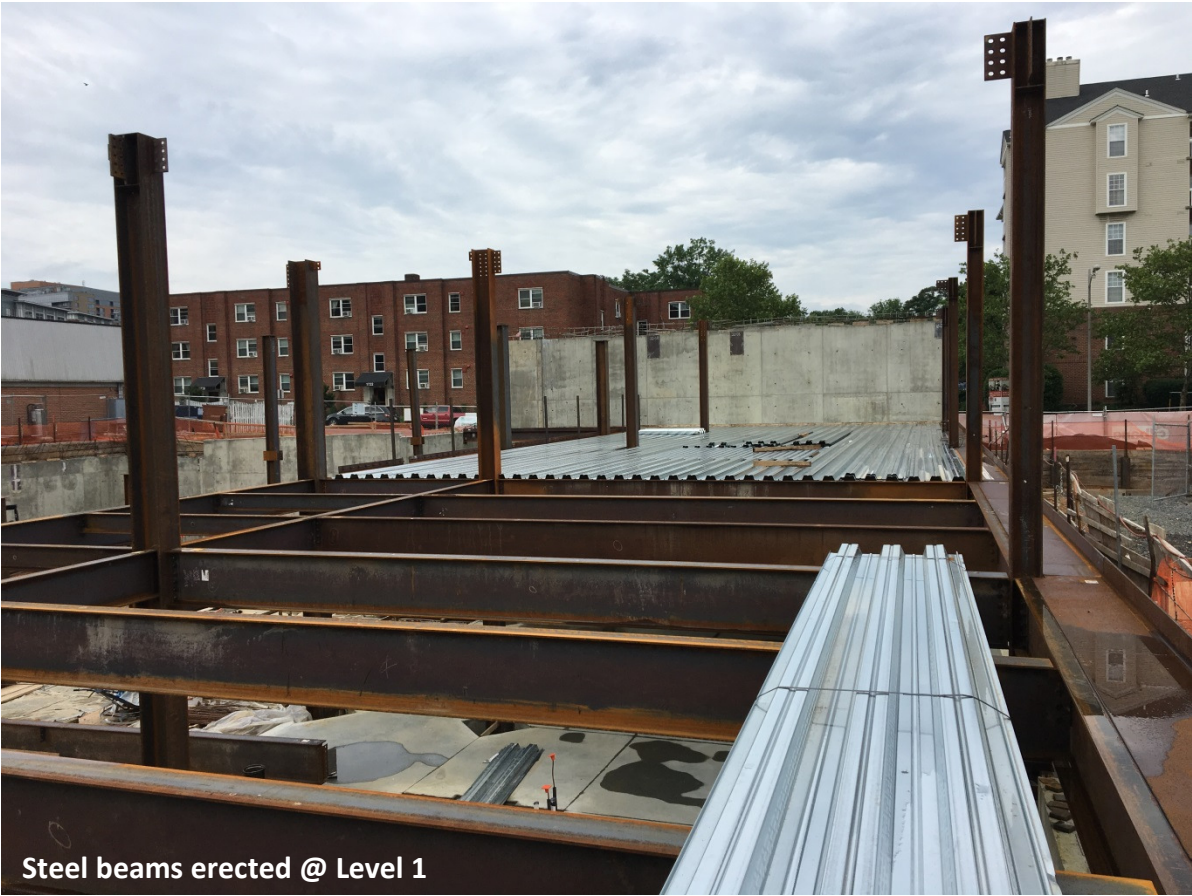
Steel beams erected @ Level 1