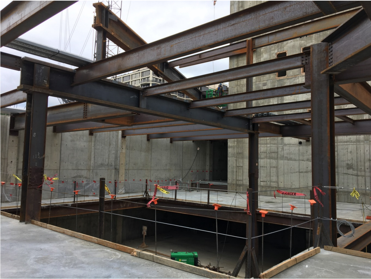
Slab on deck next to blackbox