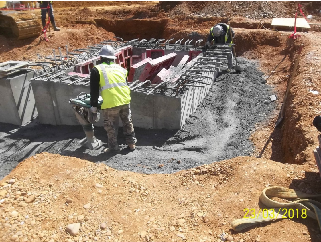
2 level elevator core