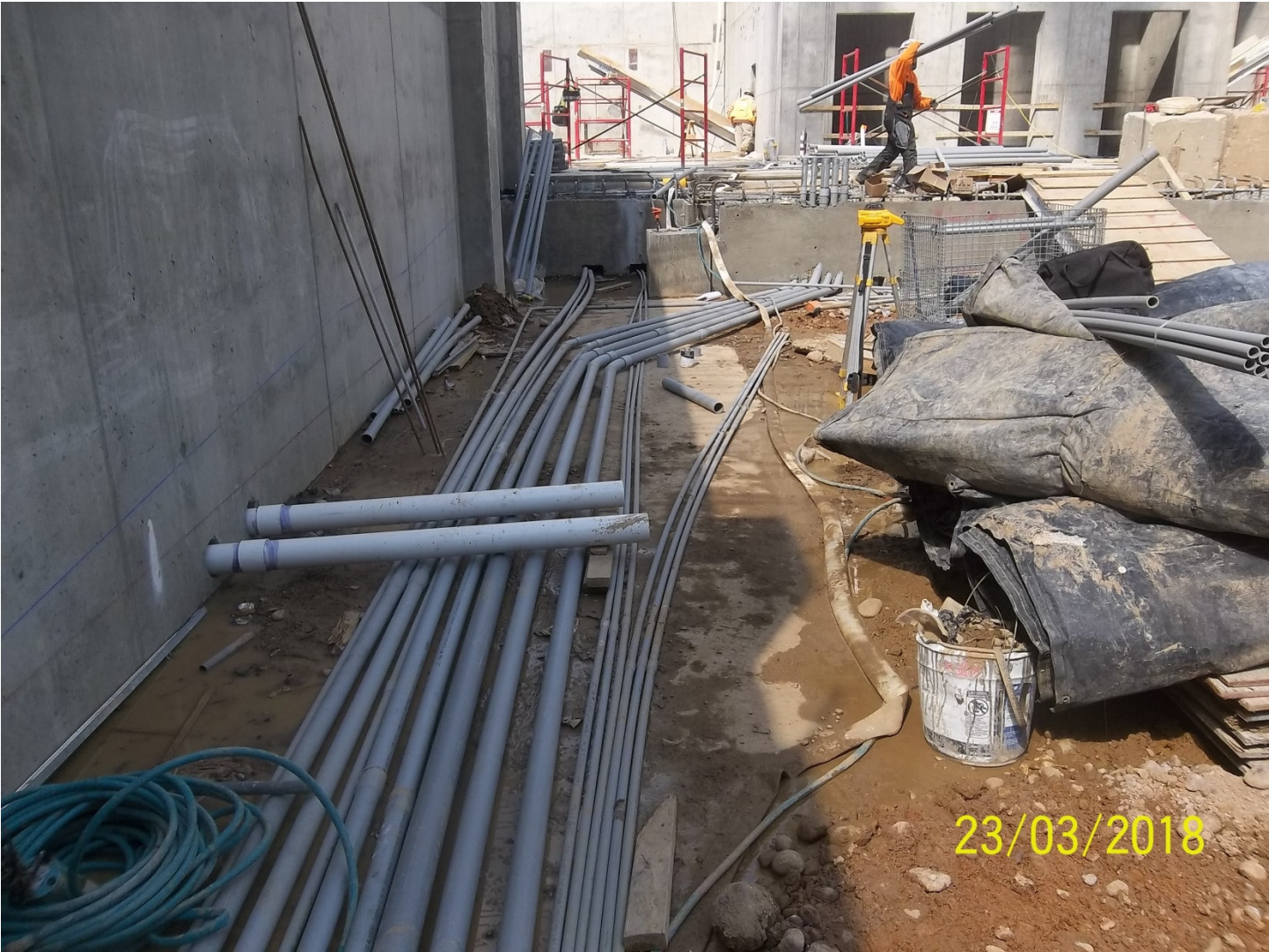
Installation of below grade utilities