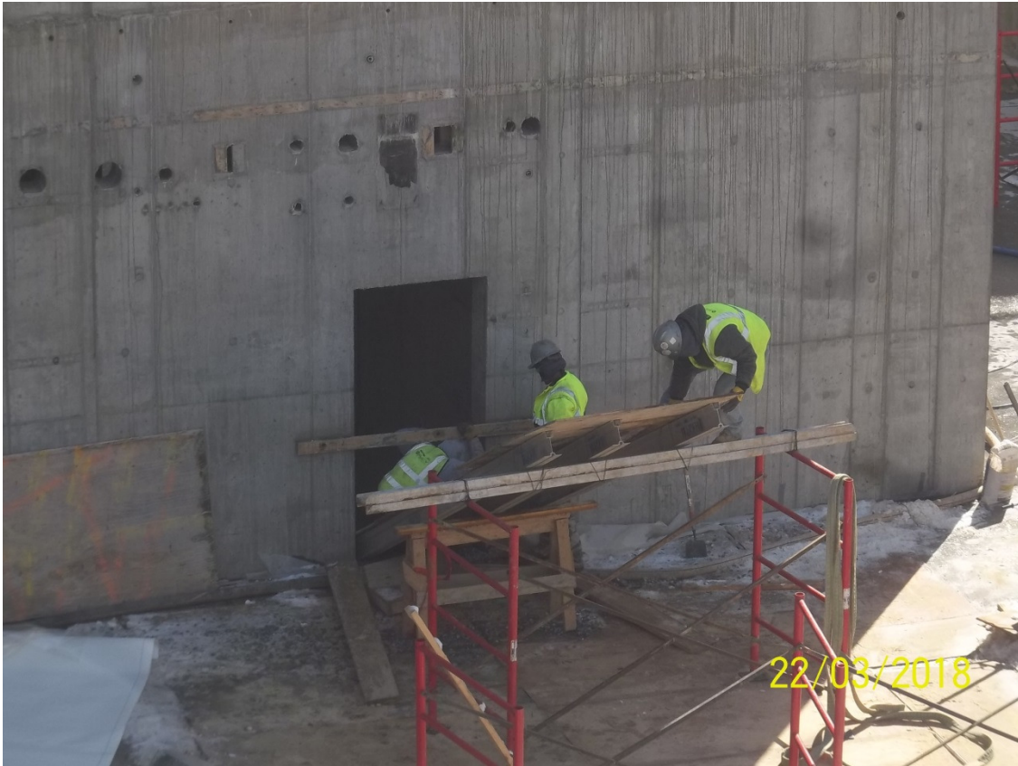
Backfill elevator pit