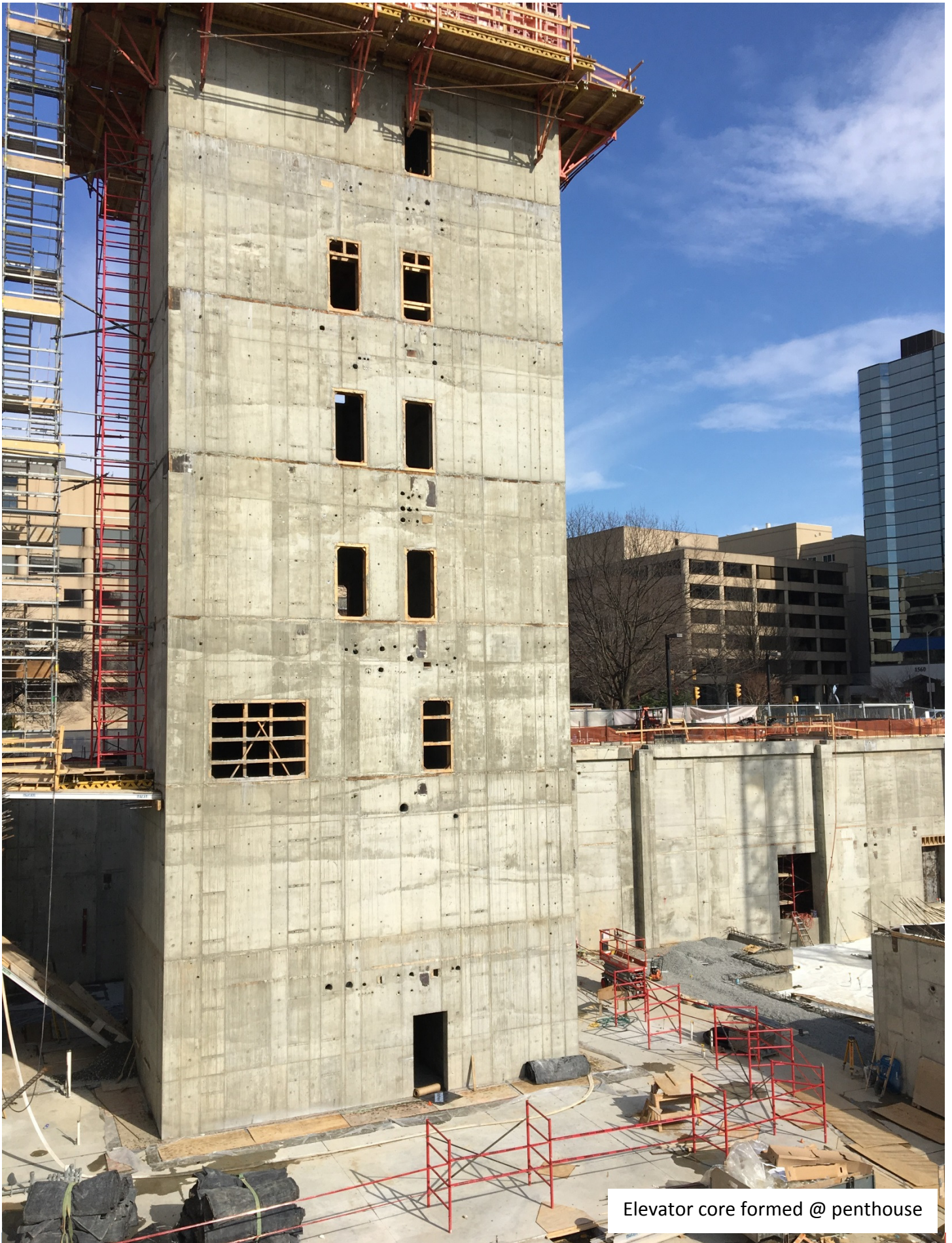
Elevator core formed @ penthouse