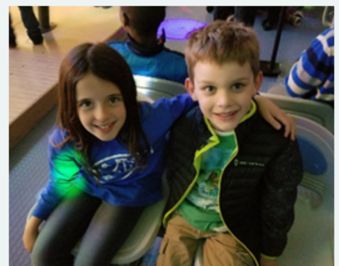
Henry students at a Shining Star's outing.