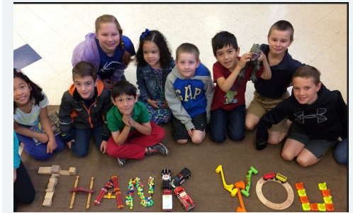
Arlington Science Focus students are always thankful for their volunteers.

Teen Trendsetters is a program that matches teen mentors with elementary students to help boost reading skills, reading scores and confidence in learning. This program allows our students to improve their reading skills while developing a lifelong love of reading. The students are allowed to take home 12 books during the school year to build a home library. Students in the program typically achieve a full grade level of progress.