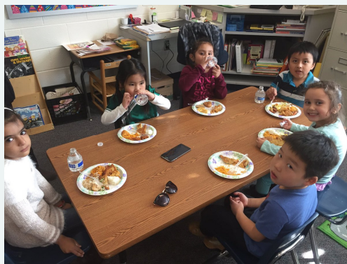
Hoffman-Boston VPI feast of foods