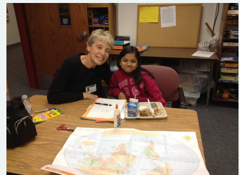
Randolph students thankful for their volunteers and mentors.