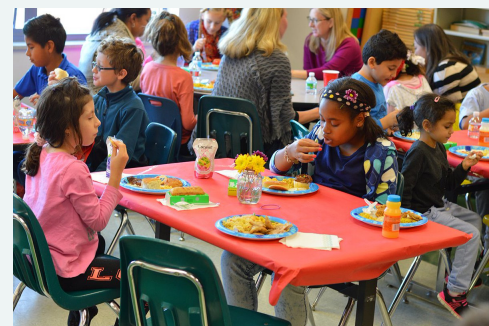
Drew students thankful for the Thanksgiving celebration.