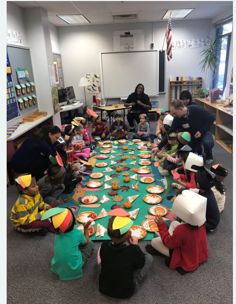
Pilgrims at Drew