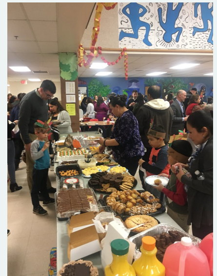
Key Kindergarteners celebrating