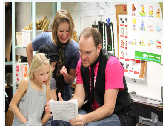
Educational Theatre Company staff working with McKinley students.