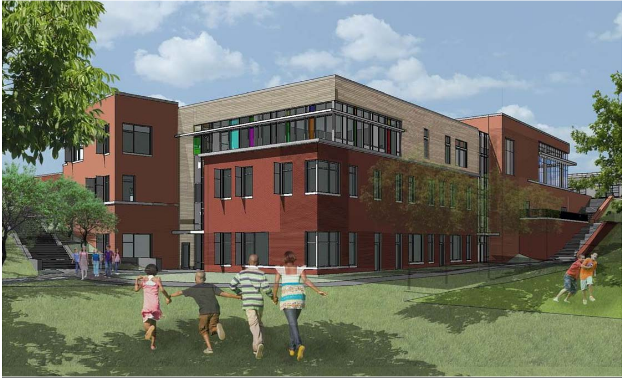
Rendering of the Expanded McKinley Elementary School