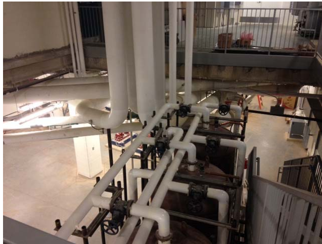
Completed Mechanical Room at Wakefield High School

The FAC shares the concerns of the Superintendent's Sustainability Advisory Committee about energy efficiency and building maintenance. With an increased student population, there is an added demand on the buildings and their systems, and increased wear and tear on everything from bathroom fixtures to floor tiles. Increased energy efficiency to heat and cool the buildings, including for evening community programs, becomes more important. This is a particular issue with the number of older buildings serving APS students, not all of which have been upgraded to more energy-efficient systems. We noted with interest that APS has developed a formal preventive maintenance process for Wakefield High School that should increase the useful life of the building, while saving money in operations.