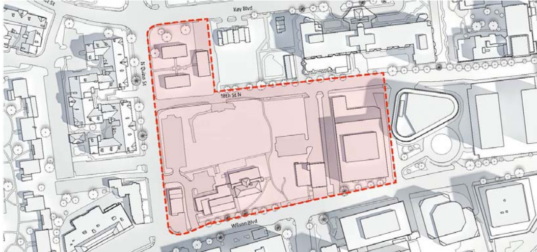
Wilson School Site Plan Diagram Illustrating WRAPS Boundary

2.f. Stratford Site : The Stratford building, which once housed the first racially integrated public school in Virginia, will be expanded and renovated to house a 1,000-seat neighborhood middle school that will alleviate serious overcrowding in the Williamsburg and Swanson Middle Schools. FAC members will provide input through the design and construction phases and will also serve on the BLPC for this project.