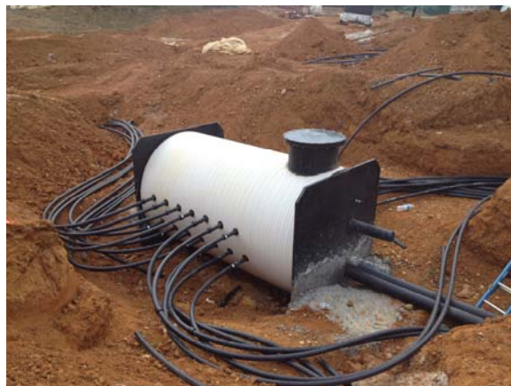
Geothermal Element Being Installed at Wakefield High School Well Field

APS remains firmly committed to building and operating environmentally friendly schools that are assets to the surrounding community. All new major construction is designed to be at least at the LEED Silver level. Of particular note this year was the building of a geothermal heating and cooling field as the final element of construction at the new Wakefield High School, and construction of the new Discovery Elementary School, which was designed to be “net zero” energy in terms of energy consumption. When Discovery Elementary School comes on line, staff will need to understand how the systems interact. Window shades, lights, HVAC units and solar panels will all be a part of creating “net zero” building energy.