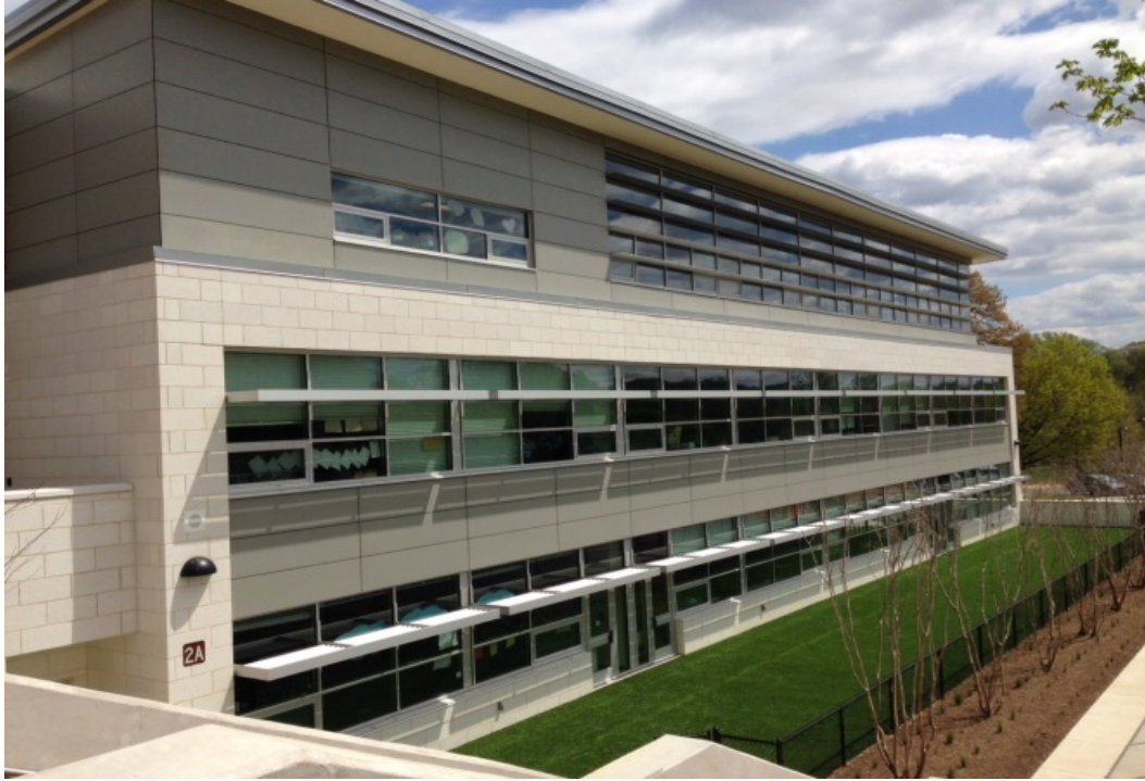
New Wing of the Expanded Ashlawn Elementary School

2.b. Discovery Elementary School : Construction work on New Elementary School 1—now officially named “Discovery Elementary School” by the School Board in honor of former Arlington resident John Glenn and the Discovery Space Shuttle in which he flew as a senior astronaut—is progressing on schedule despite a particularly cold and wet winter, according to APS. The exterior walls are up and work is moving ahead on the interior. APS plans to open the school at the start of September 2015, providing seating for up to 630 students, in a 98,000 square foot building. The school is designed to be at least at the LEED Gold level (possibly at the Platinum level) and “Net Zero Energy” so that, over the course of a year, it will produce as much energy as it consumes. With active encouragement by APS, a Discovery PTA has been formed, and cars can already be seen in the neighborhood with Discovery Elementary School bumper stickers. The work of the FAC Ambassadors was one of the factors leading to public acceptance of the need to build a new school on this site.