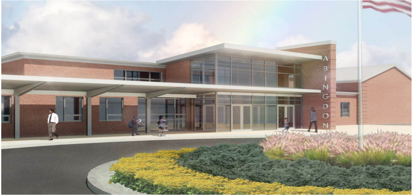
Schematic Design Rendering of Abingdon Elementary School Expansion