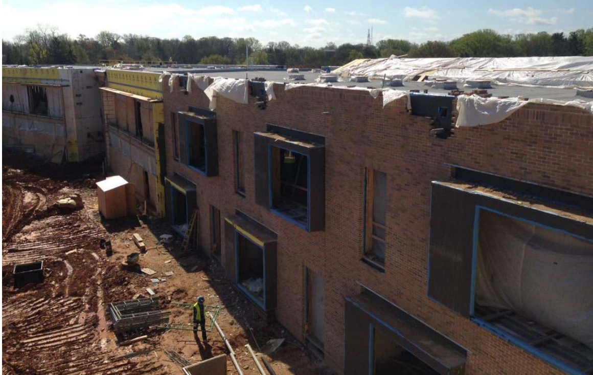
Discovery Elementary School Building Façade Installation

2.c. McKinley Elementary School : APS projects that work will begin this summer to expand McKinley Elementary School to house an additional 241 students and make other needed improvements to the site and existing building. The construction contract was awarded on 30 April. In preparation for this project, tree removal began in late winter as requested by the County to cause the least disruption to wildlife and habitats. Construction at McKinley will take place between June 2015 and September 2016 with a planned opening of the renovated space and addition for the start of the 2016-2017 school year, according to APS. An artist's rendering of the expanded school is on the cover of this report.