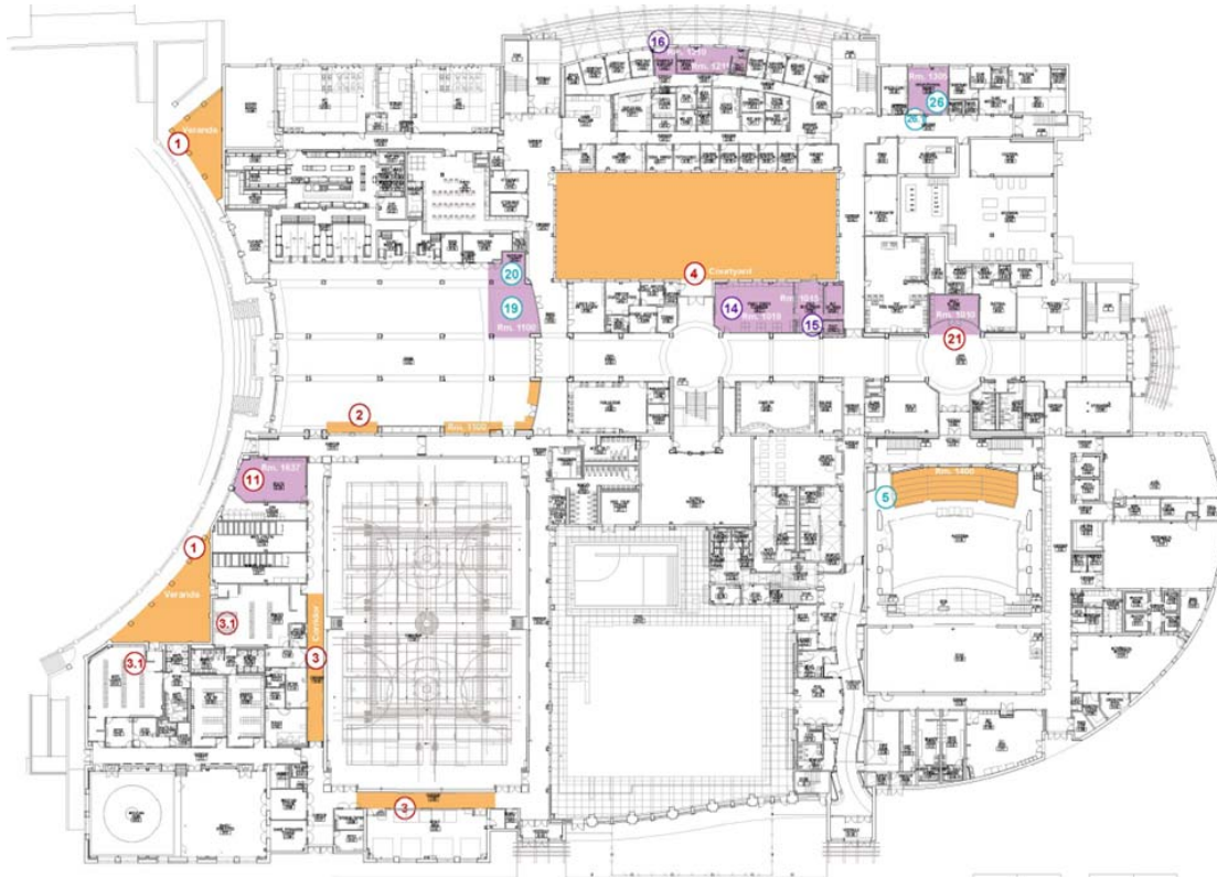
Washington-Lee High School Plan to Increase Capacity

2.g. Washington-Lee High School Renovation : APS has also been studying how to better utilize its secondary schools. In April the School Board approved a design and construction schedule to renovate portions of Washington-Lee High School to house an additional 300 students. Work should be completed by November 2015, according to APS.