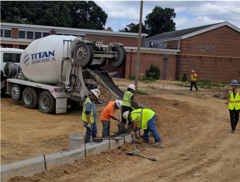
Installation of Bus loop curb and gutter