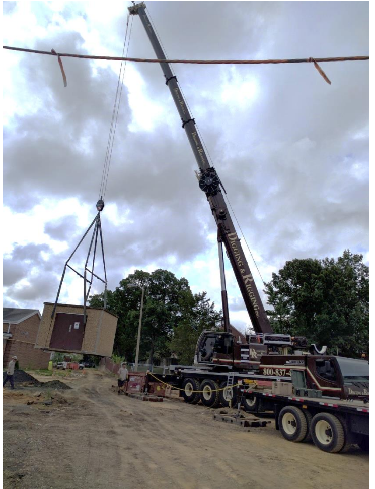
Pebble Sheds on the move!