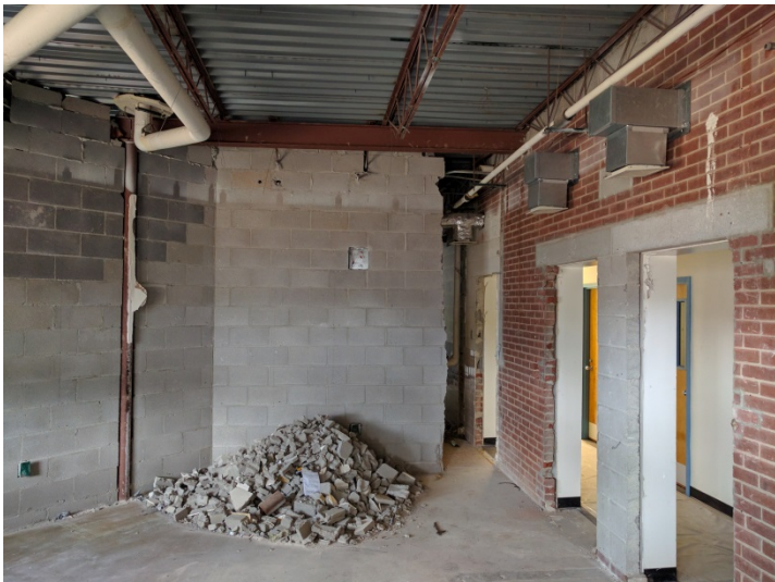
Ongoing interior demolition (used to be Principal's office)