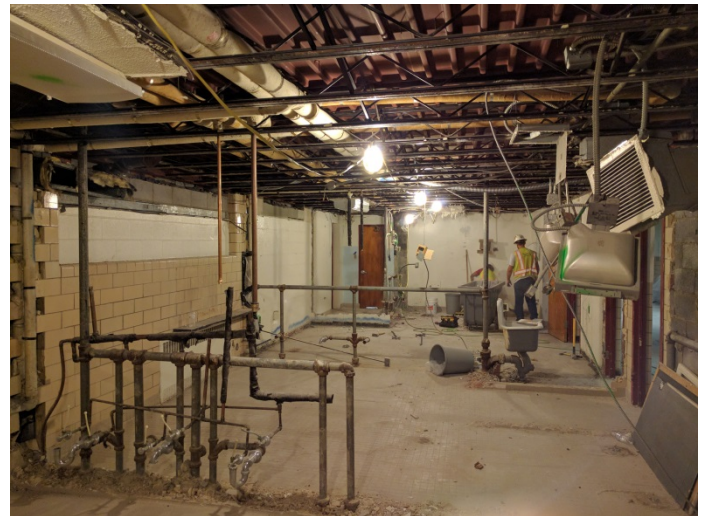
Demolition at restrooms