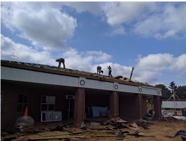
Old entry building demolition