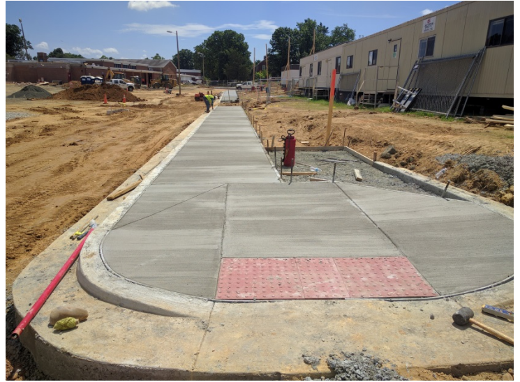
Curb and Gutter of new bus loop sidewalk