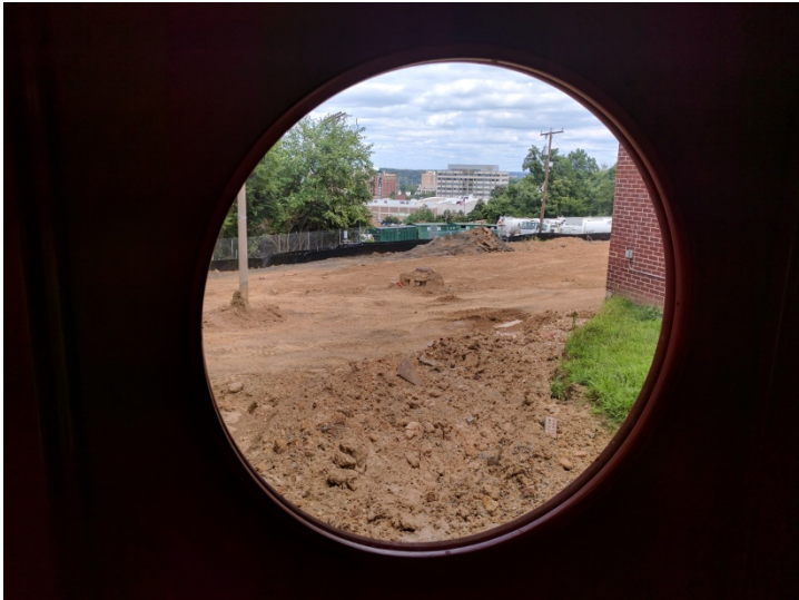
Excavation work for 3 story addition