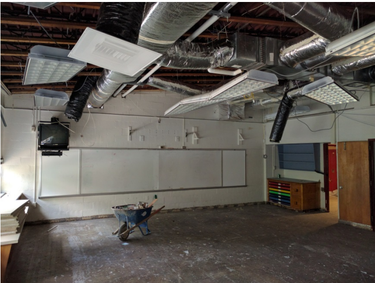
Ongoing interior demolition