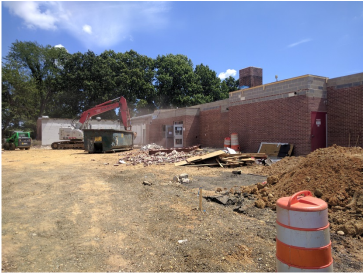
Demolition of old school entrance