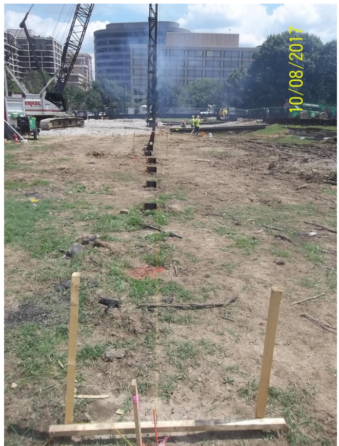
Line of piles