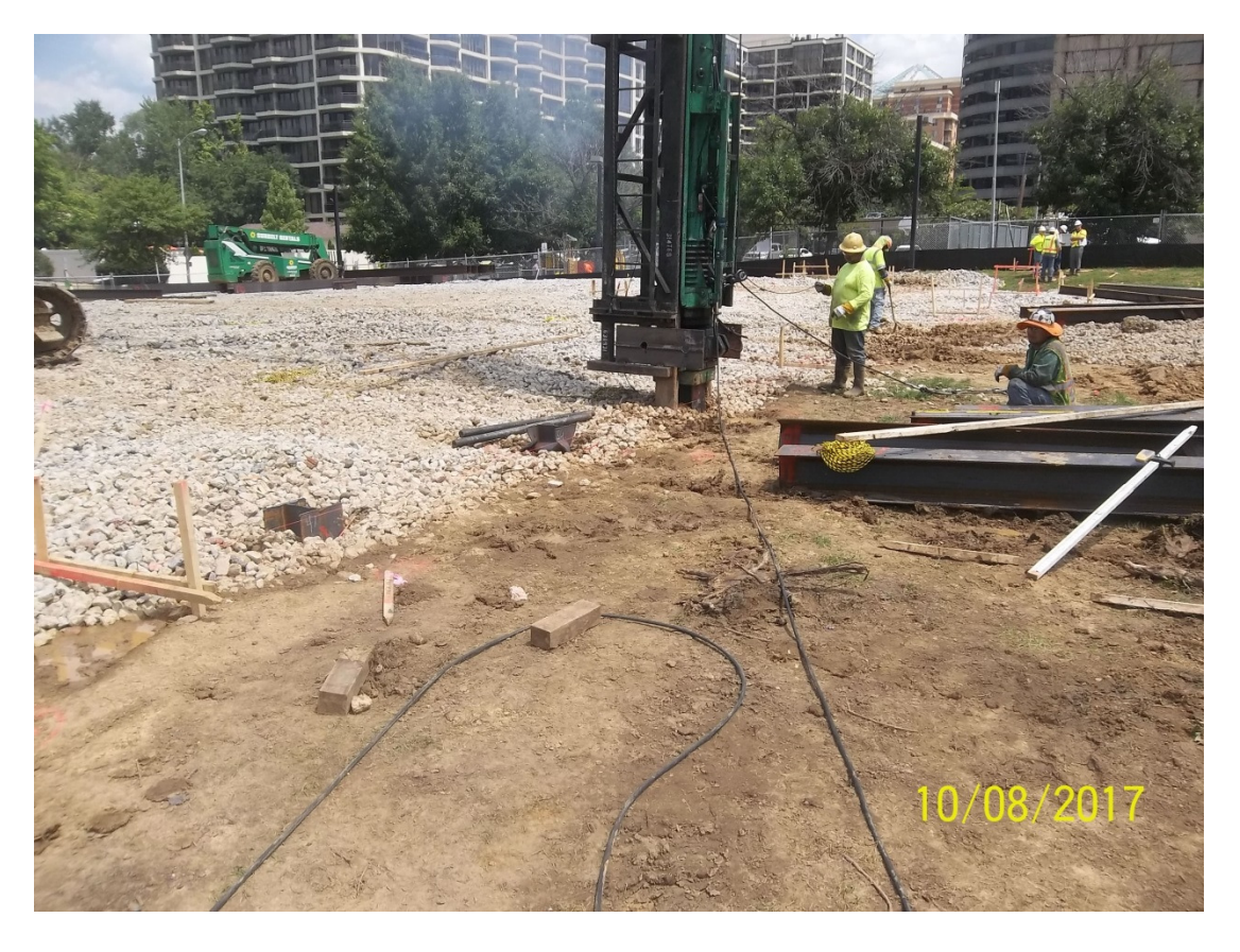
Sheeting and shoring piles to support excavation