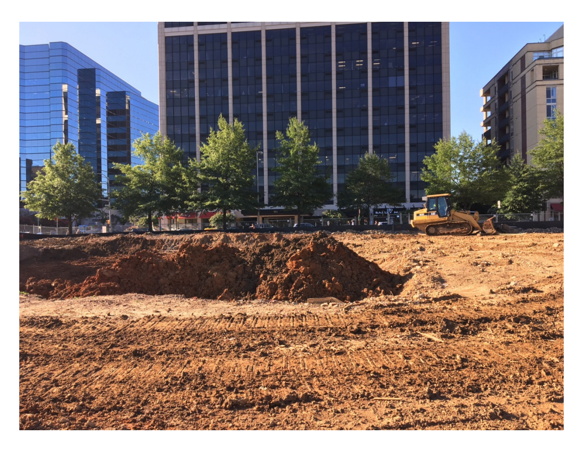
Ongoing site clearing