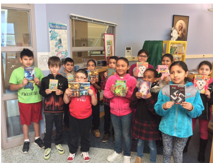
Carlin Springs students ready to read!