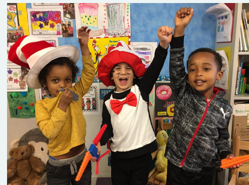
APS students dress up to celebrate Dr. Seuss's birthday.

Students also participated in Read Across America Day, celebrating Dr. Seuss's birthday. Read Across America is an annual reading awareness program that calls for children in every community to celebrate reading on March 2, with the works of the beloved children's author, Dr. Seuss.