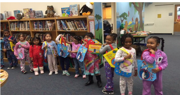
Long Branch PreK (VPI) students came to school in their pajamas and chose their own Dr. Seuss books to read.