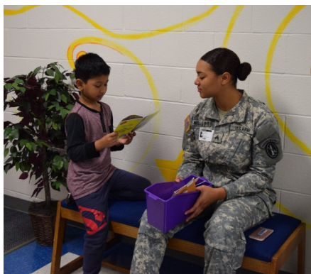
BOSS soldiers come weekly and read with first graders at Randolph E.S.