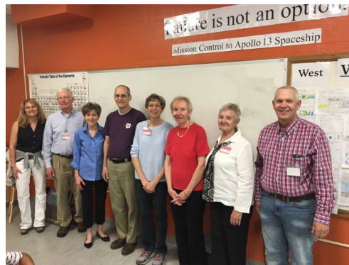
Dedicated Abingdon Book Buddies.