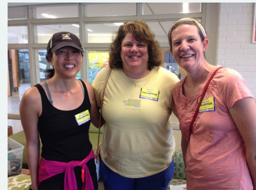
A few of Ashlawn's Reading Eagle Volunteers.