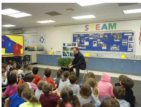
Parent volunteer at Taylor E.S. teaches students about hydroponic gardens.