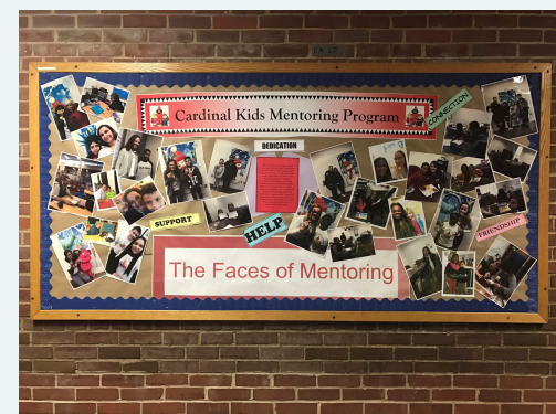
Cardinal Kids Mentoring Program Bulletin Board