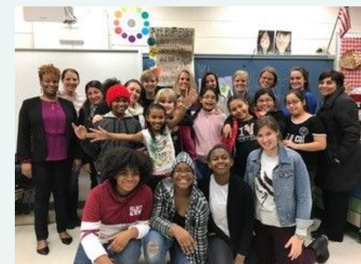
Space of Her Own mentors with mentees