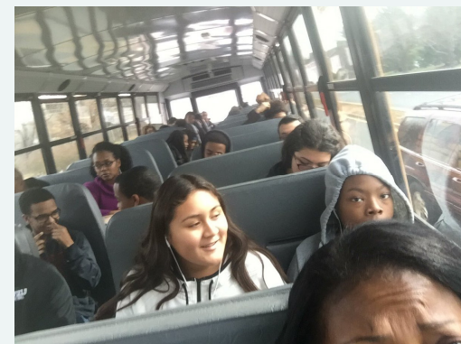
LENS students on the way to see ‘Hidden Figures’