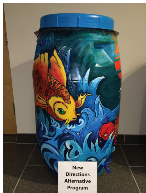
Last year's Operation Rain Barrel entry from the New Directions Program.

Get ready to Go Gaga! "Go Gaga for Green," that is, on Sat, April 30, 5-8 p.m. at George Mason University's Arlington Campus. This family-friendly, community-wide gathering celebrates Earth Day and environmental sustainability in Arlington with food, fun activities and live entertainment including the now-famous Lip Sync Battle. Best of all: it's FREE for APS students, families and staff with advance registration. (Food passes can be purchased separately at event.)